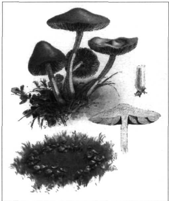
Figure 6. Fruitbodies and fairy ring: Marasmius oreades from Our Edible Toadstool and Mushrooms by Hamilton W. Gibson, 1895.

Helminthosporium , Pythium , Rhizoctonia ; figures 3 and 4); take-all or Ophiobolus patch ( Gaeumannomyces , figure 5); and brown patch ( Rhizoctonia ) commonly infect creeping bentgrass, Kentucky bluegrass, and Bermudagrass, among other turfgrasses (Couch 1995; Agrios 1997; Provey and Robinson, 2001; Nieves-Rivera, 2001, in press). Photos of diseased turfgrasses presented by Couch (1995, plates 1 to 29), Evans (2000), Provey and Robinson (2001), and photos of alleged UFO rings (Robiou-Lamarche 1979; Fuller 1997; Howe 1999) are practically identical. Many of these fungal diseases form rings, spots, or circular formations similar to UFO rings. Curiously, the powdery mildew caused by the fungus Erysiphe and the damping-off of seedlings by Pythium (see figure 4) produce a white powder or filaments that cover the entire blade of the grass, reminding me of "Angel Hair." 1