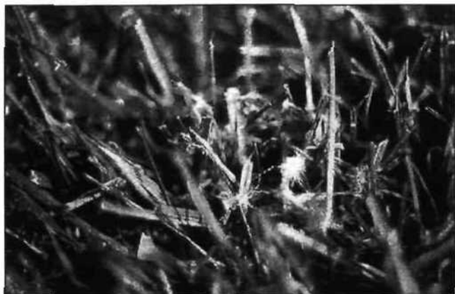
Figure 4. Pythium damping-off of turf grass, see enlarged filaments.