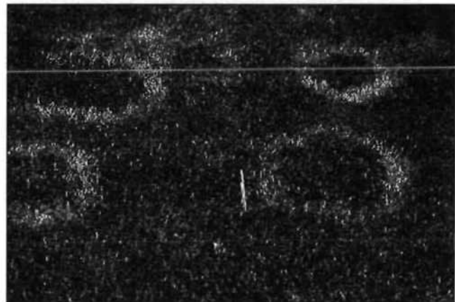
Figure 3. Damping-off of turf grass by Rhizoctonia .

1997). Fungal diseases such as snow mold ( Coprinus , Typhula ; figure 2); powdery mildew ( Erysiphe ); damping-off ( Fusarium ,