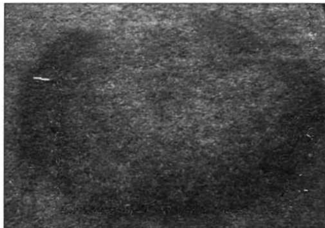
Figure 1. "Enigmatic UFO ring" found on a residence's lawn in Cupey, Puerto Rico.

Take turfgrasses for example. Many rings or patches in turfgrasses are caused naturally by fungal (and/or other microorganism) diseases, which are strikingly similar to "unexplainable" UFO rings or crop rings. Fungi, which naturally occur in topsoil, may become a plant disease under certain favorable conditions (favorable to the fungus) such as stress, wounds, immunodeficiency, etc. (Alexander 1991; Agrios