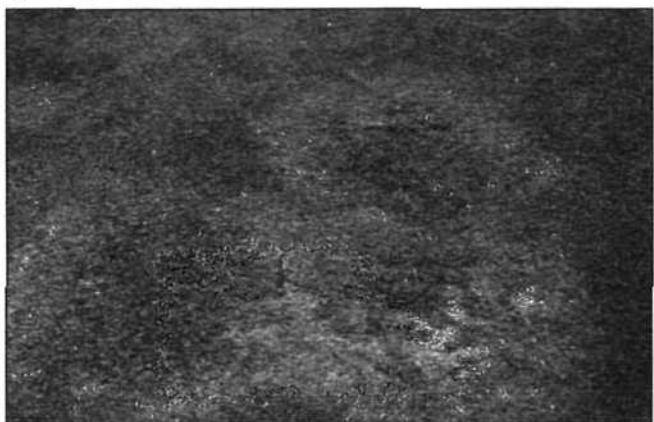
Figure 5. Ophiobolus patch caused by Gaeumannomyces .