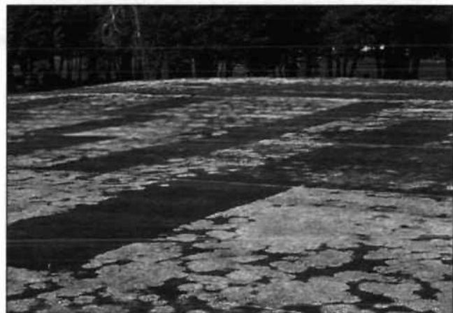
Figure 2. Snow mold of turf grass caused by Typhula .