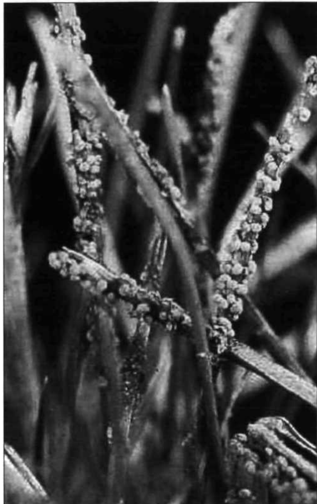
Figure 9. Slime mold Physarum cinerea .

example is the “fairy butter” or “star-jelly” ( Tremella lutescens ), a yellowish jelly-fungus often found after a heavy rain, a favorite folklore candidate associated with shooting stars or meteorites. Even the dye-maker’s false puffball ( Pisolithus tinctorius ), which forms a large irregular club with a narrow stem-like base submerged in the substrate, resembles a stony-iron meteorite lying on the ground. If sliced, the peridioles 2 are exposed, giving the false impression of a stony-iron meteorite as shown in Haag’s (1997) or NEMS (1998) catalogues.