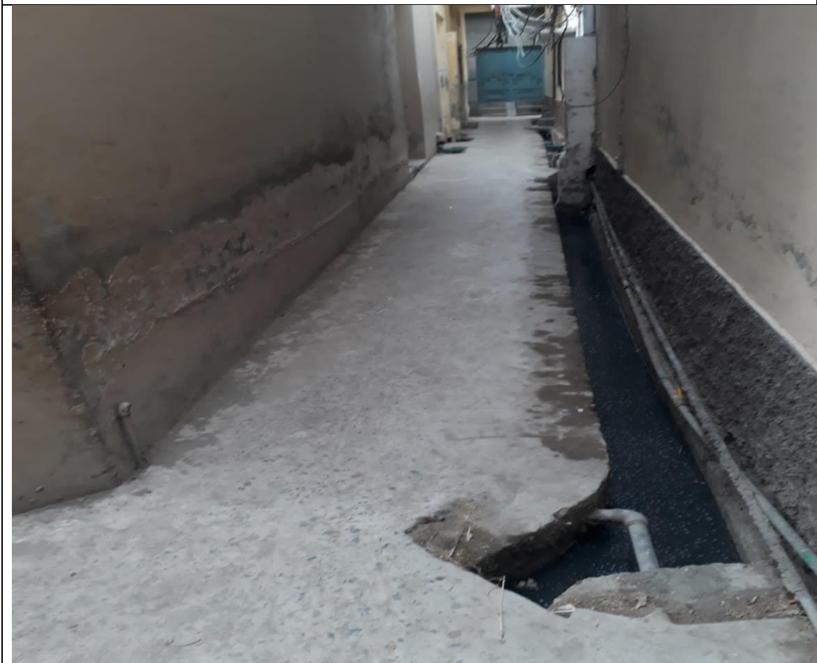
Figure 4: completed street with Nallah 1.5' x 1.5'