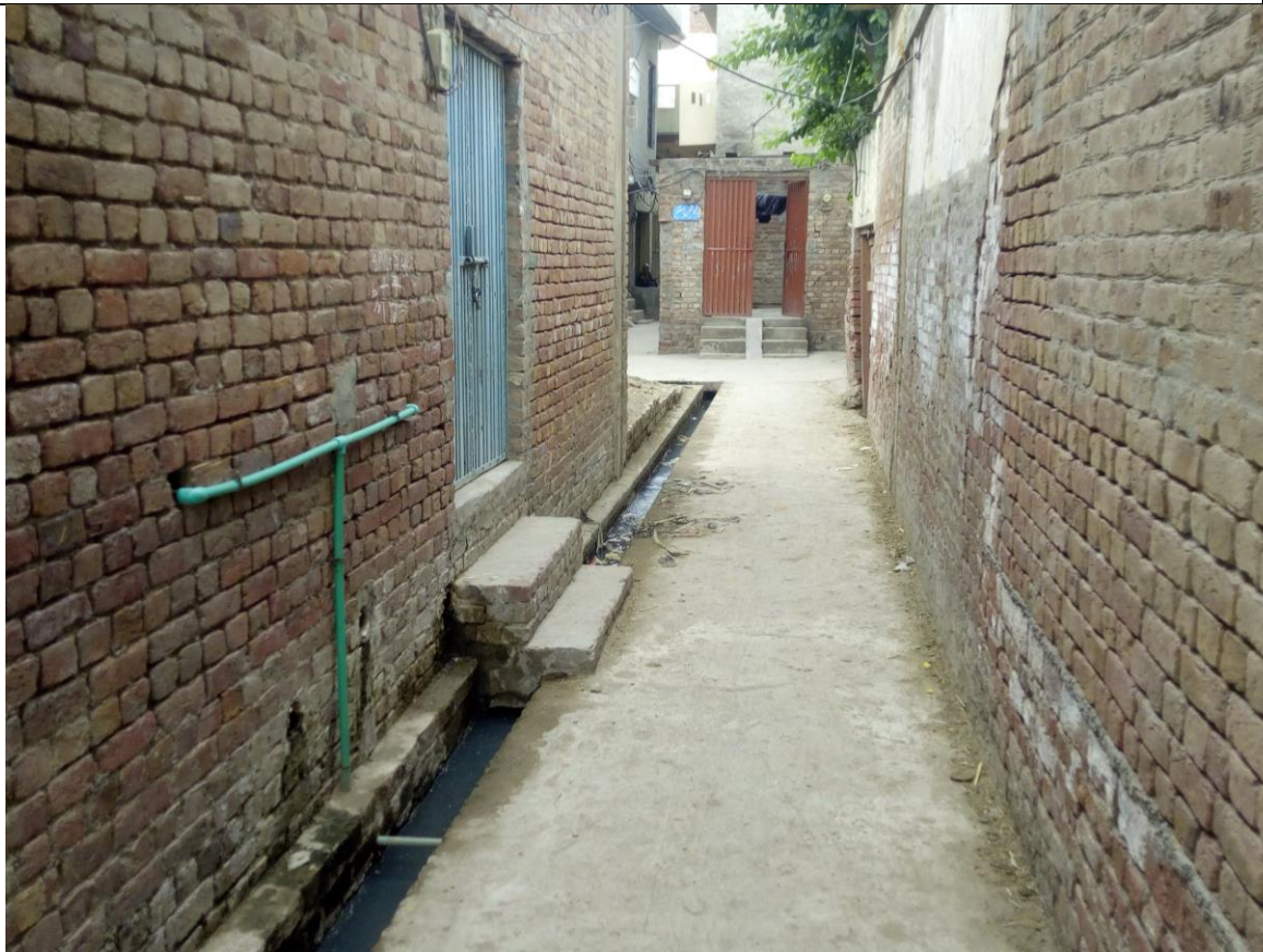
Figure 2: completed street