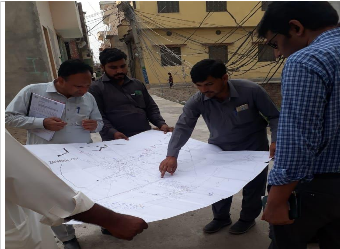
Figure 3: Briefing of the project