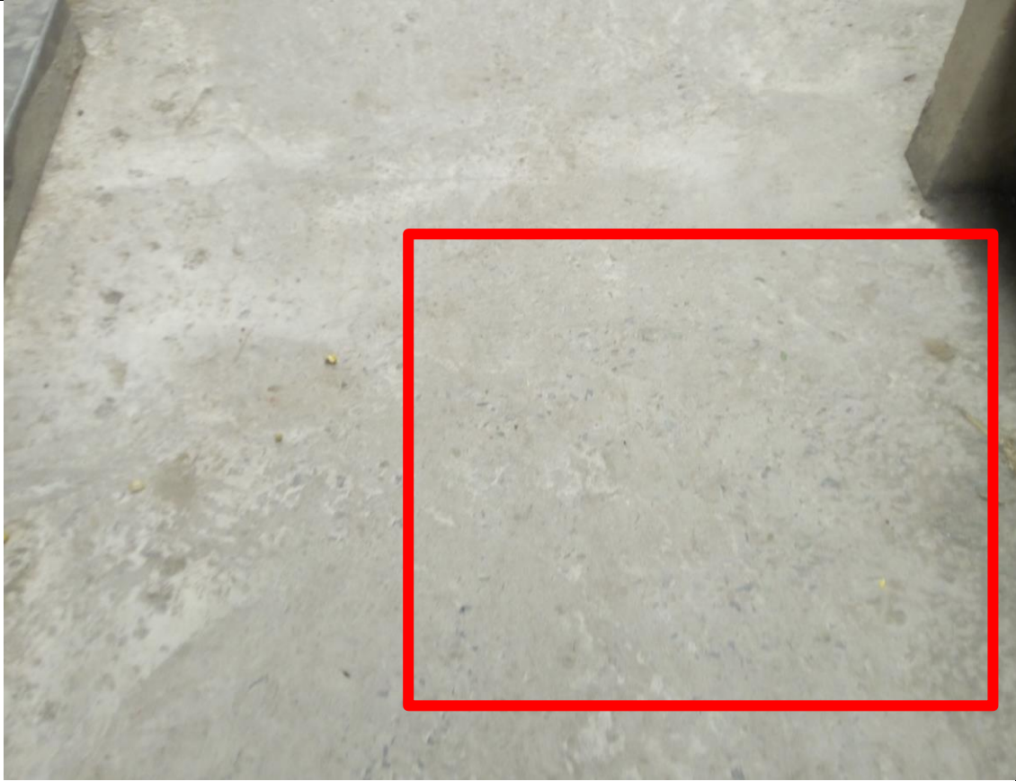
Figure 1: scaling of concrete surface