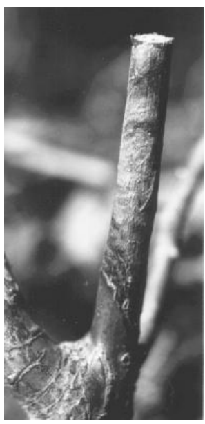
Figure 5. Stem or common canker that has started at the cut end of a stub left after pruning and progressed almost to the node.