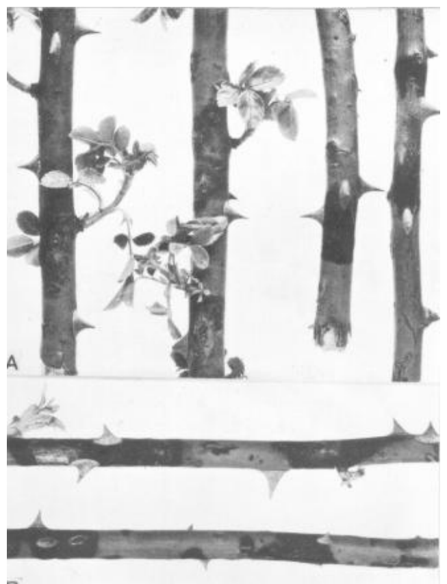
Figure 7. Brand canker of rose. A. Early stages in lesion development. B. Brand canker lesions around treehopper wounds. (Reproduced from Cornell University Agricultural Experiment Station Memoir 153).

a. Proper planting. Use well-prepared and Experiment Station Memoir 153 ). well-drained soil, high in organic matter, where roses will receive sunlight all day (or a minimum of 6 hours dail)