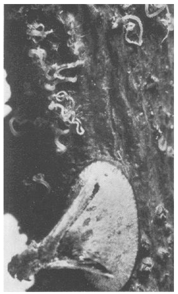
Figure 3. Fruiting bodies (pycnidia) of the brown canker fungus rupturing the epidermis (lower right corner) and spore tendrils extending from the mouths of others (above thorn). (Reproduced from 1927 American Rose Annual).

This disease occurs on both outdoor and greenhouse-grown roses. It is widespread in occurrence. Small, pale yellow to reddish spots appear in the bark around wounds, especially at the end of stubs left after pruning (Figure 5). These spots gradually increase in size, and the infected dead tissue (or canker) turns light brown with a dark brown margin. The epidermal tissue within the canker dries out, shrinks, and sometimes cracks (Figure 6) exposing sooty masses of spores (conidia). The stem may ultimately be