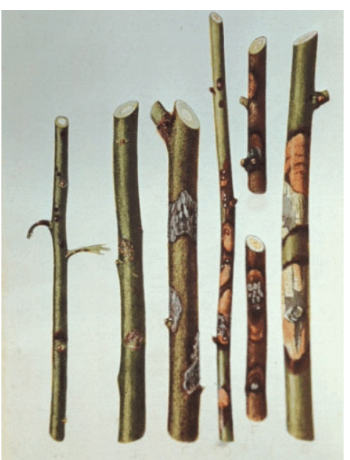
Figure 1. Initial infection lesions of brown

The first symptoms on the canes are small yellow, dark red, or purple spots that gradually enlarge and may girdle or partially girdle the cane. Complete girdling results in dieback or poor growth of the parts above the affected area. Minute black fruiting bodies of the canker-causing fungus or fungi are visible in the cankered areas.