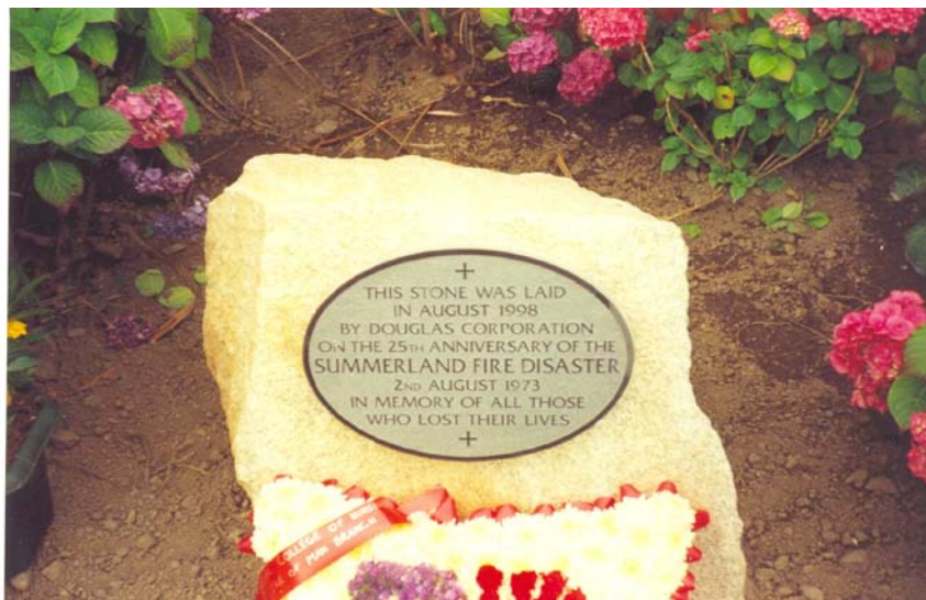
Figure 1.1: the memorial stone to the Summerland dead

There is simply no factual evidence (e.g. official documents) to support the contention that more than 50 people died in the Summerland fire. In the extremely unlikely event that bodies had been incinerated, one would expect clear evidence from family members or friends along the lines of: "I went to Summerland with Mr X on the evening of the fire, but now he is missing and we have not been able directly or indirectly to identify his body at the mortuary". This is not the case, with the number of persons reported missing to the police by August 6th tallying exactly with the number of bodies (section 1.1). The possibility of a person being incinerated in the fire and not being missed by at least one other person (with their death not being reported to the authorities) in the world is so unlikely that it must have odds of several million to one. The memorial stone to the Summerland dead ( figure 1.1 ) does not state the death toll, but instead uses the phraseology " In memory of all those who lost their lives ".