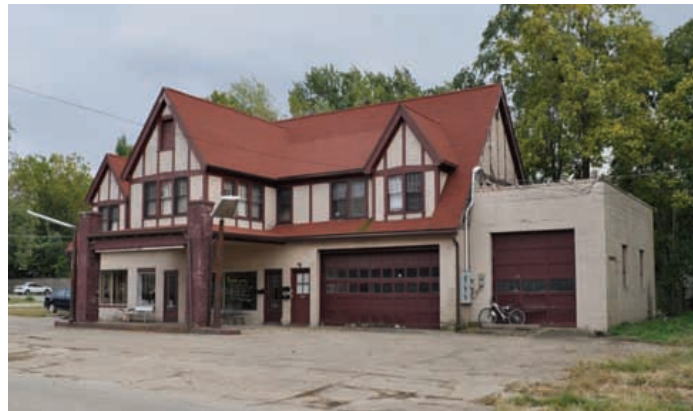
Sprague's Super Service Station, Normal, Illinois

Some 35 years later, Los Angeles Pop artist Edward Ruscha took the gas stations of Route 66 as the subject for his limited-edition book of photographs, Twentysix Gasoline Stations . Twentysix Gasoline Stations captured the roadside architecture in simple snapshots, documenting the highway as part of the image. Many critics have suggested a connection between Ruscha's treatment of the gas stations and the Stations of the Cross, which Ruscha did not wholly deny: "There is a connection between my work and my experience with religious