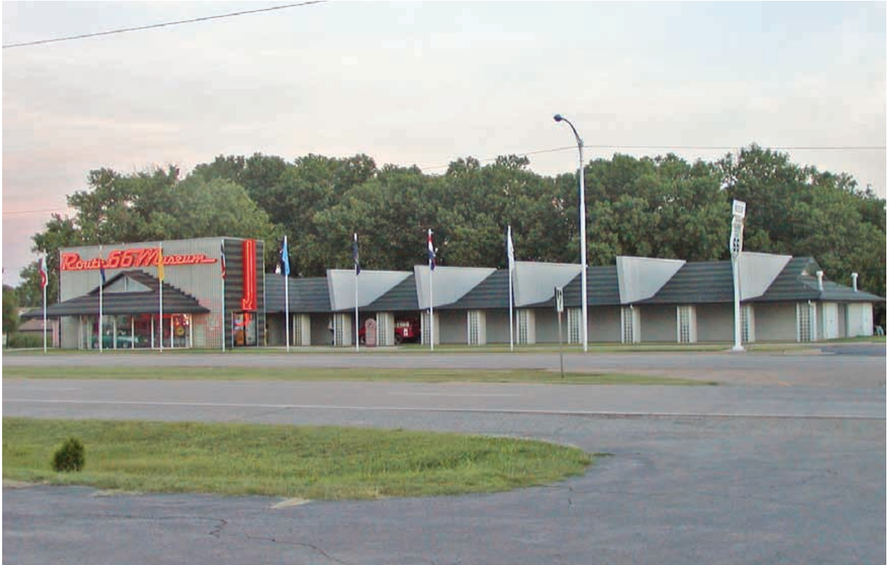
The Route 66 Museum