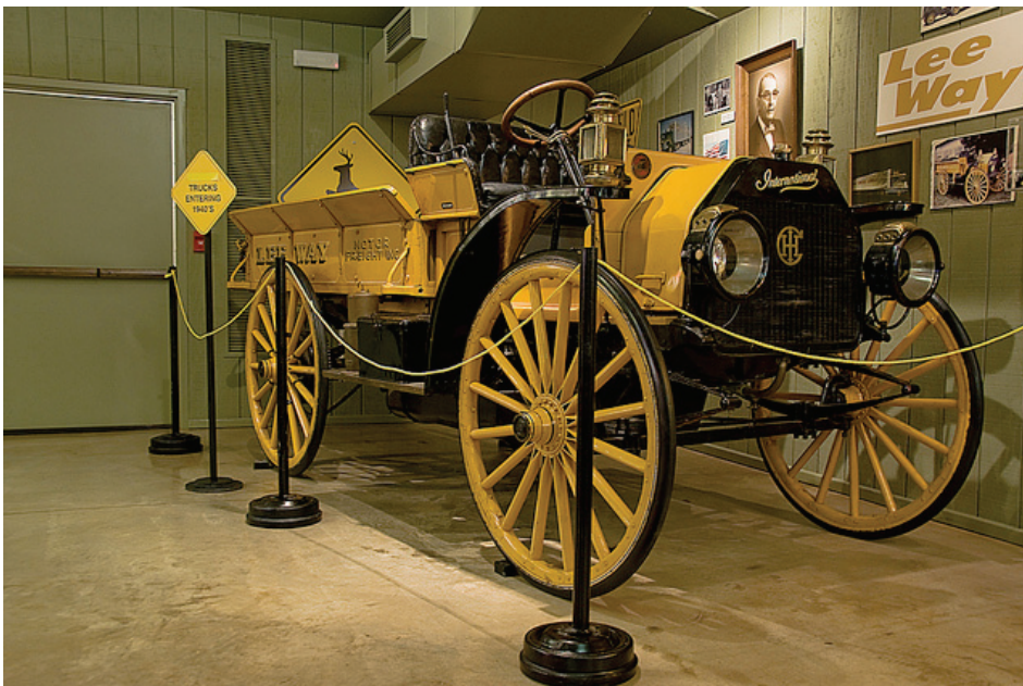
A 1912 International truck on display at the museum