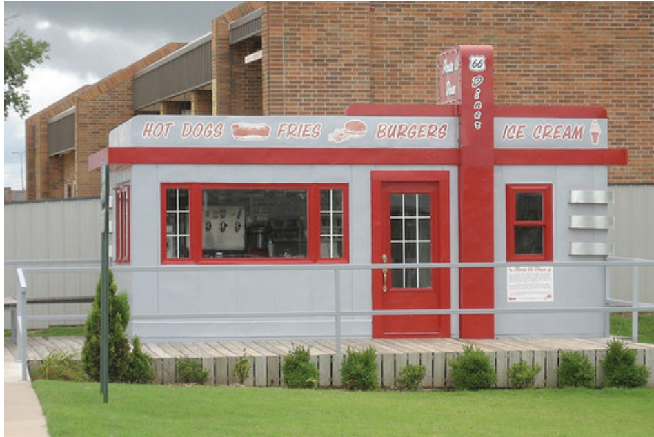
Restored Route 66 Valentine Diner”