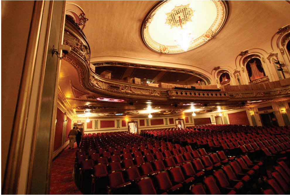
An interior view of the Coleman Theatre