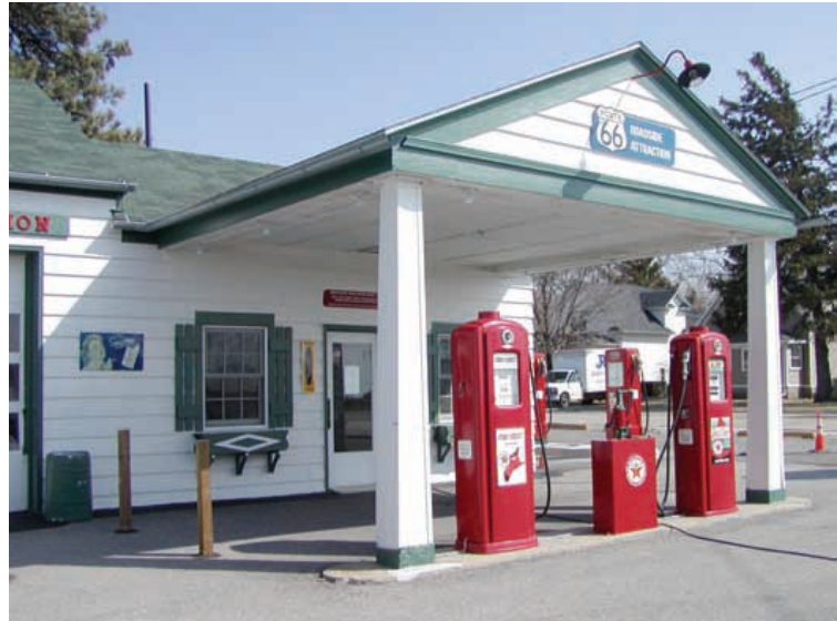
Ambler's filling station

One of Dwight's most famed preserved structures is Ambler's gas station, an early Texaco gas station that ranks high on the itinerary of many Route 66 tourists. This classic service station, after recent renovations, continues to operate as a Route 66 museum and visitors center. It was placed on the National Register of Historic Places in 2001.