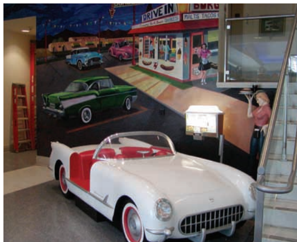
The Route 66 diner is another interactive element of the Route 66 Experience exhibit

Visitors can chart their course along the Main Street of America on an oversized, eight-state mural painted by Jerry McClanahan, noted Route 66 artist and historian. In another area of the exhibit hall, guests can re-live a trip to a Route 66 diner as they sit in a reproduction car and pretend to order food from a carhop mannequin. A mural depicts a circa-1955 drive-in restaurant, with the menu provided on an authentic lighted drive-in menu board on a post. Parked in front of the mural is a 1953 Chevy Corvette replica (80 percent scale), whose car radio has seven buttons marked with the decades during which Route 66 was in commission. When the visitor pushes a button, he or she hears a decade-specific one to four minute radio broadcast that includes a news report, a commercial, and a popular song.