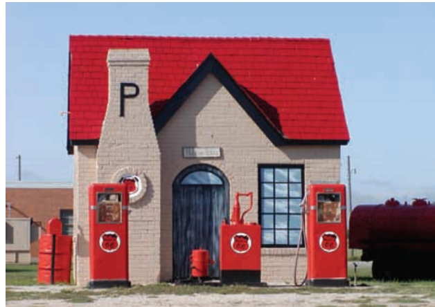
An early Phillips station in McLean, Texas.

To further distinguish the Phillips gas stations, the company adopted a Route 66 shield logo in a strategic move to associate the company with the famous highway. The intriguing story by which the logo came about suggests that fate may have had a hand in the company design. In 1927, the Philips Oil Company was working toward developing a trademark logo to brand its gasoline; although talk had been circulating among company executives to associate the logo with Route 66 because of their proximity to the road, it wasn’t until a last minute case of serendipity that the 66 was decided on. On the day before a meeting was scheduled to discuss the logo, a Phillips official testing a new high-octane fuel coincidentally topped out at a cruising speed of 66 miles per hour—while travelling along Route 66. Upon relating the story at the meeting the next day, the committee gave a unanimous vote for the name change to Phillips 66.