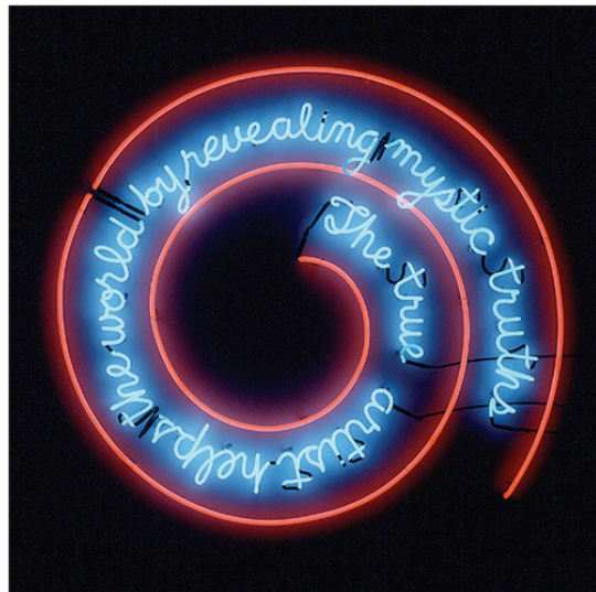
The True Artist Helps the World by Revealing Mystic Truths —Bruce Nauman, (1967).

Sign makers were, for the most part, vernacular designers—common people making common things—they incorporated well-known and well-worn patterns of form, material, shape and symbol to ensure that their signs had meaning and relevance to the people who used them. When neon technology arrived in the United States in 1923, sign-making acquired a powerful new technology to extend their meanings across greater distances. Neon signs are produced by glass benders, who bend glass tubes into various shapes. The glass tubes are then filled with neon gas and electric current is applied to create the "liquid fire," as its first observers called it. Merging folk craft (glass working) and new technology, neon signs represent a unique collaboration between "old" and "new."