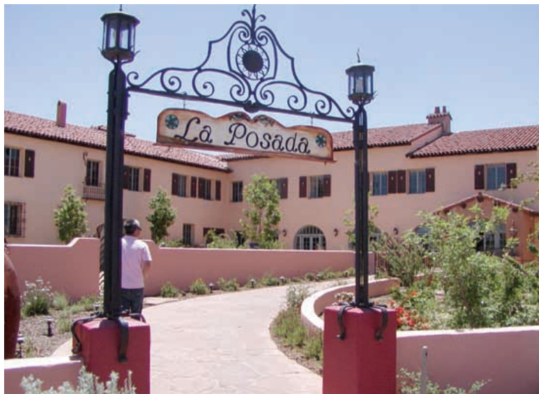
La Posada Hotel, Winslow, Arizona.