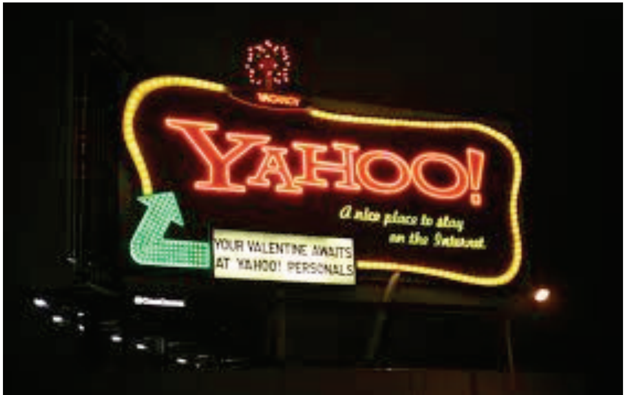
Yahoo! Neon Sign in Route 66 "style," San Francisco, California

In sum, the man-made landscape is a mirror; it reflects our values, identity, our past and our future. As Arthur Krim put it: “Route 66 was the American highway of the 20 th century, straddling it from Jazz Age to Computer Age, in gravel and concrete, in song and film, in television and Pop Art Projected as an idea in the euphoria of the Gold Rush, Route 66 endures as an idea in the euphoria of the Internet.” The Mother Road keeps on giving.