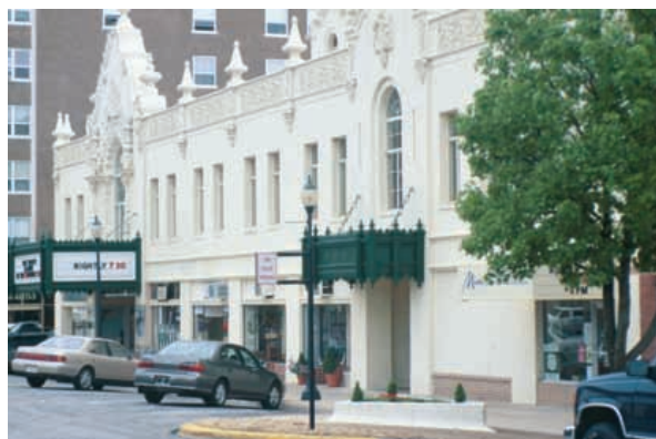
The Coleman Theater

Another local attraction is The Dobson Museum, which is part of the Dobson Memorial Center Campus and located just 1 block off historic Route 66. The Dobson Museum displays locally