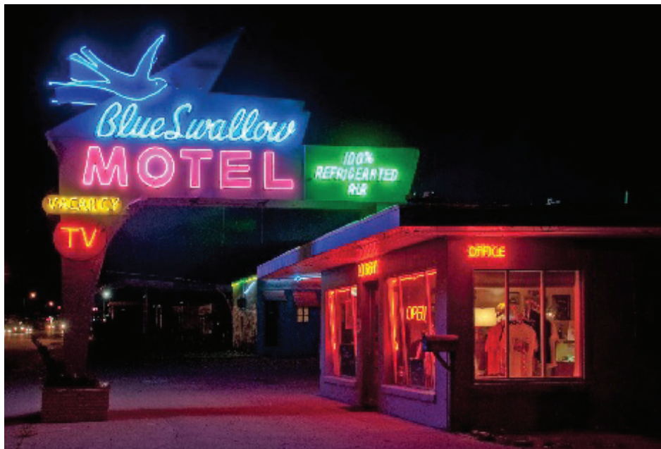
The Blue Swallow Motel in Tucumcari, New Mexico.)

In ancient times, there was a prayer for “The Stranger Within our Gates.” Because this motel is a human institution to serve people... we hope that God will grant you peace and rest... We are all travelers...may these days be pleasant for you, profitable for society, helpful for those you meet, and a joy to those you know and love you best. 10