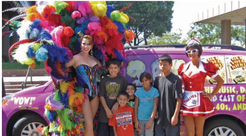
Posing with performers at the Route 66 Rendezvous

$70-$80, producing between $119,000 and $136,000 in registration revenues. 274 Registration ensures reservation for all the available parking spaces throughout the “cruise route”, which are assigned based on requests by participants. Even RV parking locations such as the one at Arrowhead Ave. & 2 nd St (offering 80 spaces) were sold out. In addition, the four day three night event, spanning 35 blocks of downtown San Bernardino, produces a weekend’s worth of local spending. According to a 2004 economic impact survey conducted by the SBCVB, the Rendezvous Car Show puts $43 million into San Bernardino’s local economy through spending on restaurants, hotels, gasoline purchases, and retail spending. 275