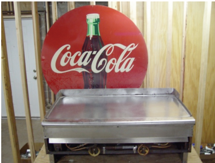
Get your taste buds ready cause the Wolf is ready to grill!!

[...] It certainly is a positive to have it restored. It tells a great story of its own! This grill has cooked burgers for men heading to and coming from WWII, family's like the Joad's running towards Cali and from the great depression, for the giant new era of the 50's when car travel became so popular carrying happy new family's to vacations, for the bands of the new found Rock N Roll movement who traveled the country on tour, and for the hippies of the 70's traveling like gypsies!! These and so much more have found there way to have a famed burger either; indeed this grill has a story to tell!!