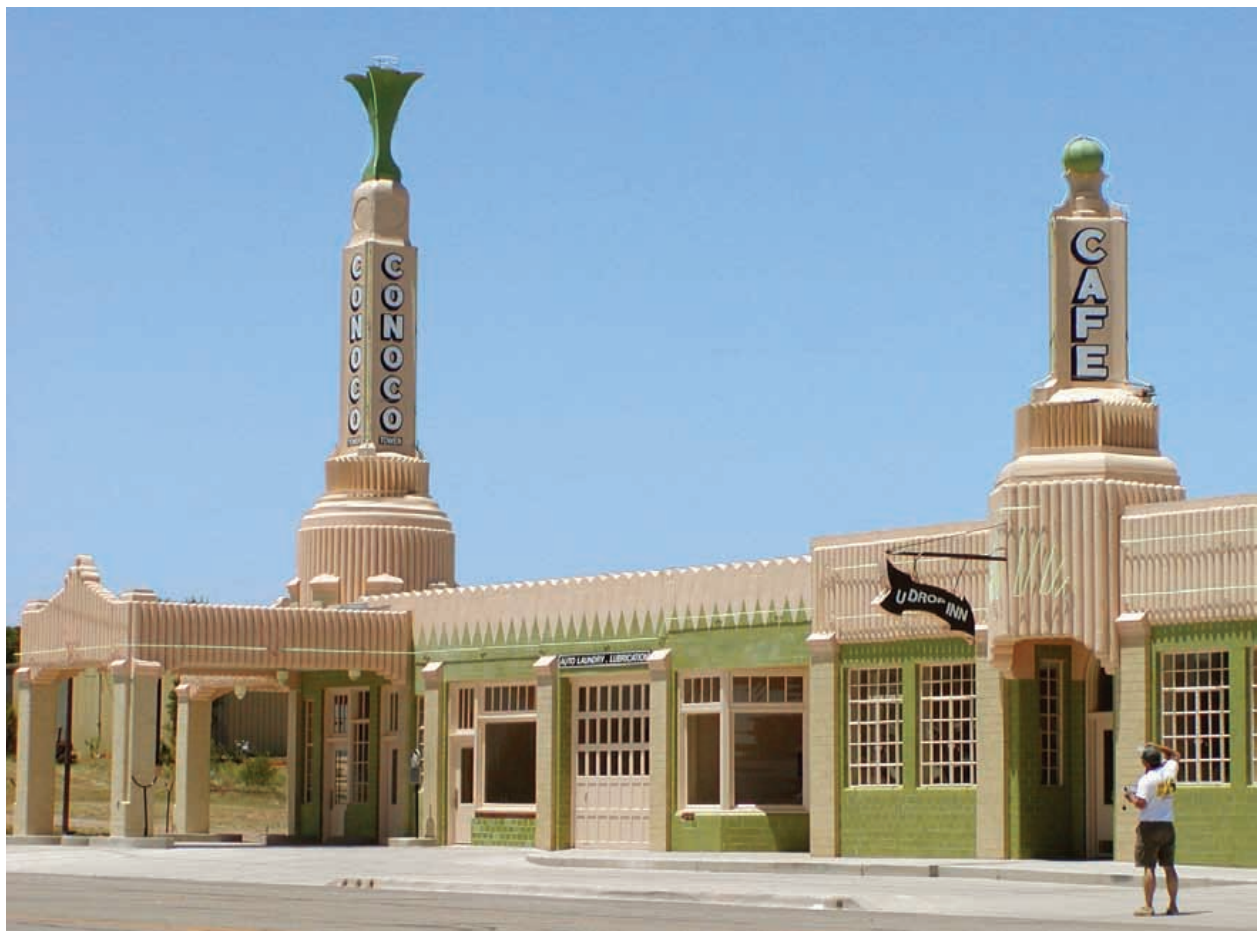
The Conoco Tower Station today.