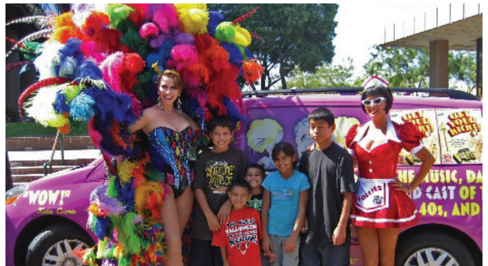
Family fun at the Mother Road Festival.