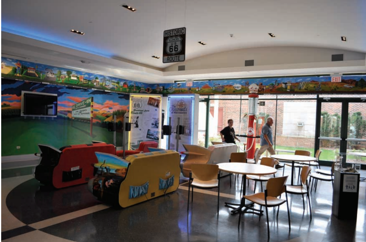
Inside the Joliet Area Historical Museum