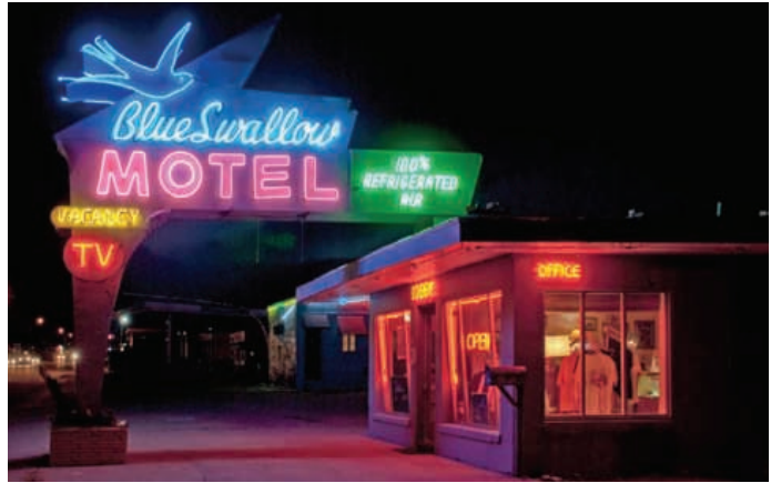
The Blue Swallow Motel

The vivid outline of a graceful blue bird marks the location of one of Tucumcari, New Mexico's most photographed structures; a picture of individuality and perseverance along Route 66. Though the restored vintage motel—the oldest still in operation on Route 66— may have a modest 11 rooms, on an average day it caters to 30-40 visitors; at the peak of the travel season, it is not unusual for there to be as many as 100 visitors each day. The secret to its long-standing success is not to be found in luxury furnishings or spacious rooms, but in its owners' unwavering commitment to personable service, and travelers' unwavering loyalty to independent establishments that maintain such integrity.