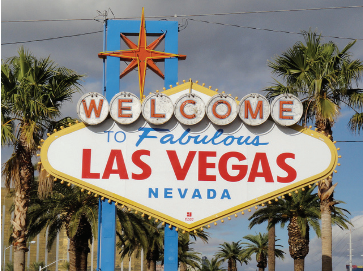
Legendary entrance to Las Vegas

issued a controversial call to explore "the messy vitality" of the existing built environment, including embracing the strange new landscape of cars, casinos, billboards, and motels. According to Venturi, "architects are out of the habit looking non-judgmentally at the environment, because orthodox Modernist architecture is progressive, if not revolutionary, utopian, and puristic; it is dissatisfied with existing conditions." As Venturi summed it up: "I. M. Pei will never be happy on Route 66." 303