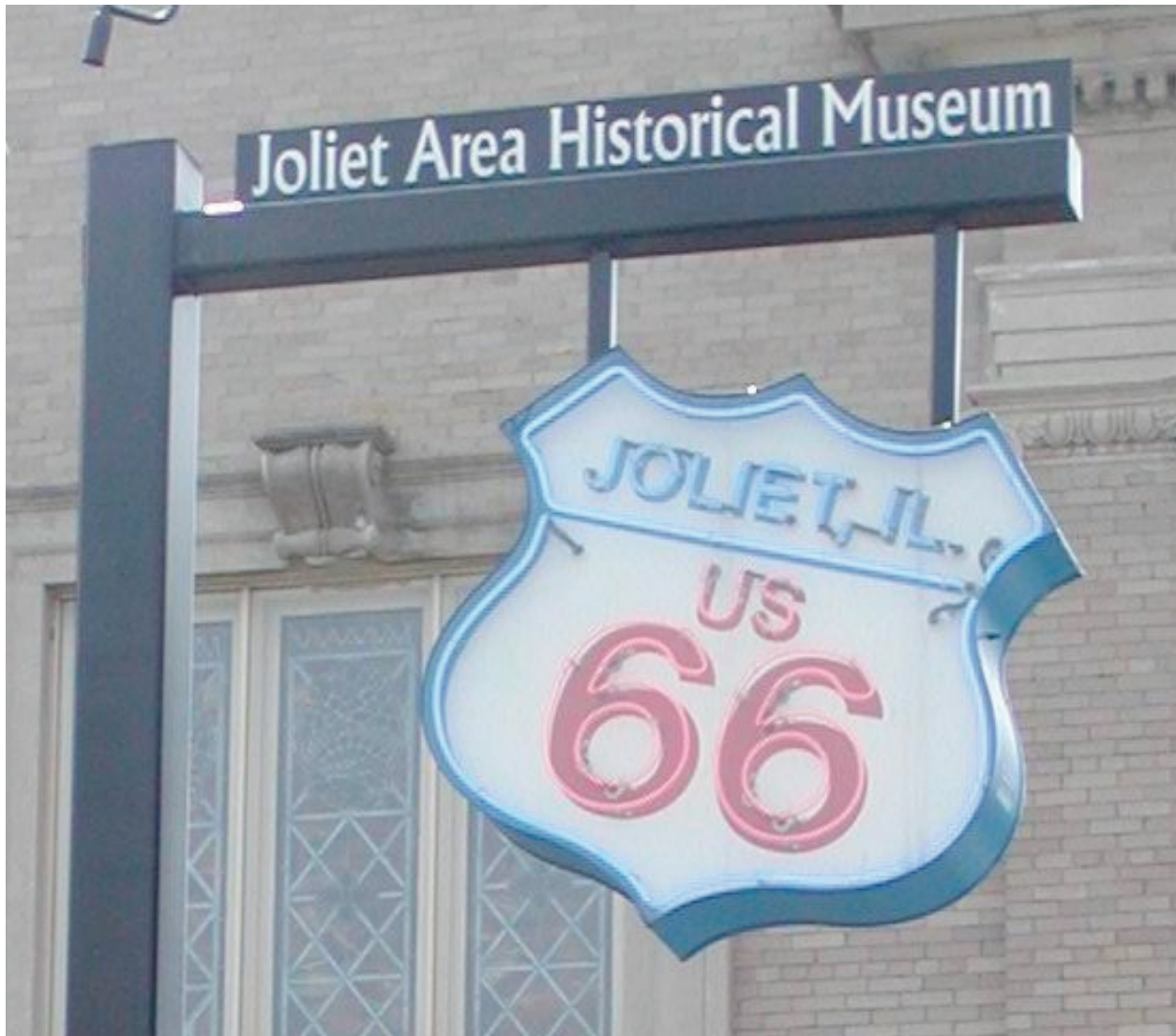
The museum sign located at the corner of Route 66 and the Lincoln Highway (Cass at Ottawa Streets, Joliet).

Exhibits depict varied facets of Joliet’s history, such as the lifestyle of a typical middle- class Joliet family from decades past. Other displays include an account of state prisons that have operated in Joliet since 1858, and an exhibit on the pivotal role transportation has had on the development of Joliet. The three-story building also houses a special events auditorium, educational spaces that include a resource area for families and school groups, a research room for scholars and community members, storage areas and a room for the Joliet Area Historical Society.