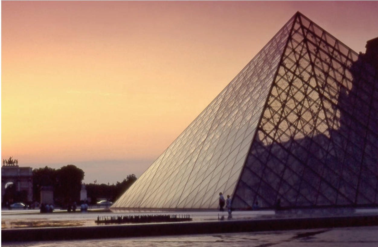
I. M. Pei, Glass Pyramid , the Louvre, Paris