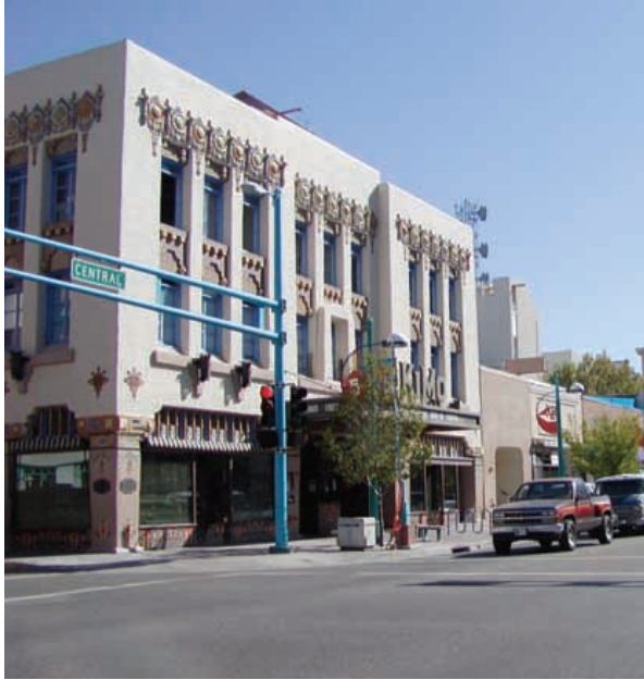
The Kimo Theatre