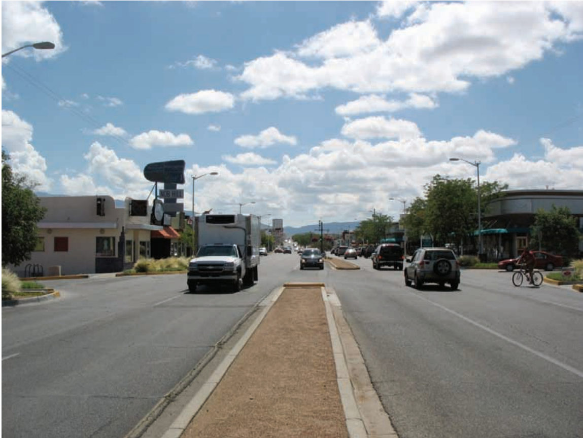
Central Avenue (Route 66) in Nob Hill

But the Historic Route 66 designation does remain, and the road has been named a Scenic Byway by both state and federal governments. Although many examples of Route 66-era roadside architecture have been lost, the Nob Hill-Highland stretch is considered the most intact in the state.