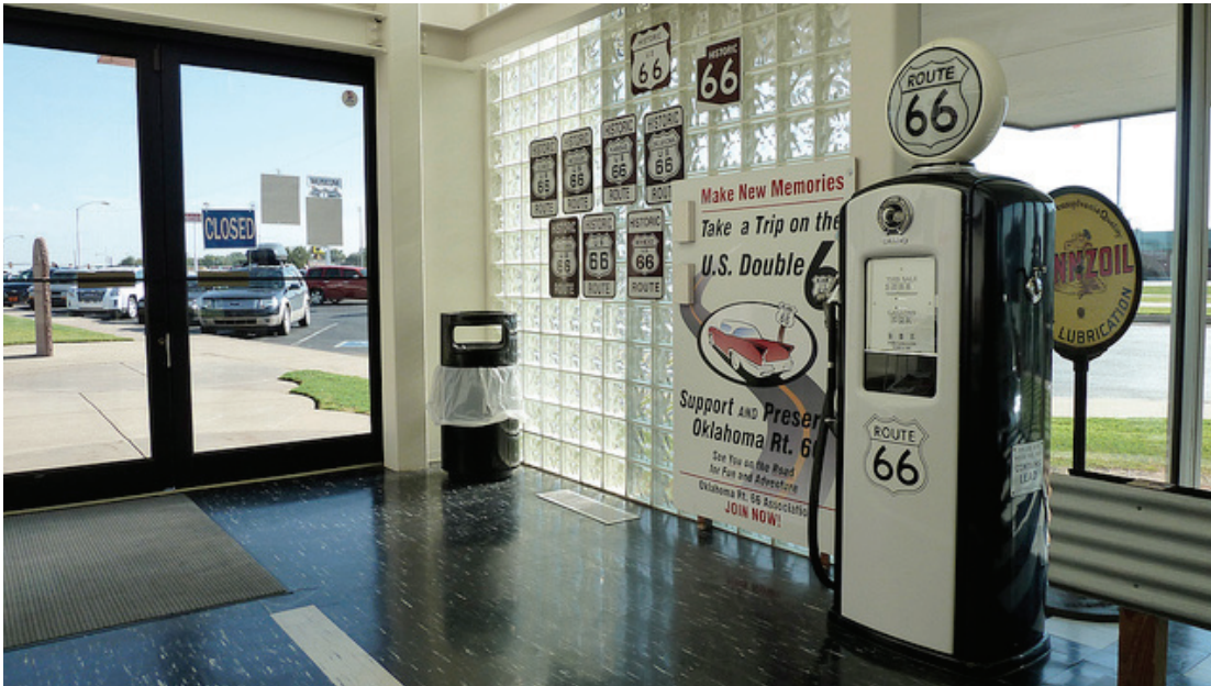
Entrance to the Oklahoma Route 66 Museum

Drive-In Theater: 20-Min Excerpt of Route 66: An American Odyssey”