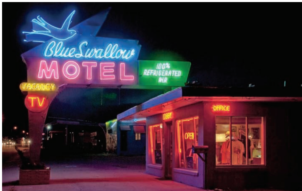
Blue Swallow Motel, Route 66, Tucumcari, New Mexico