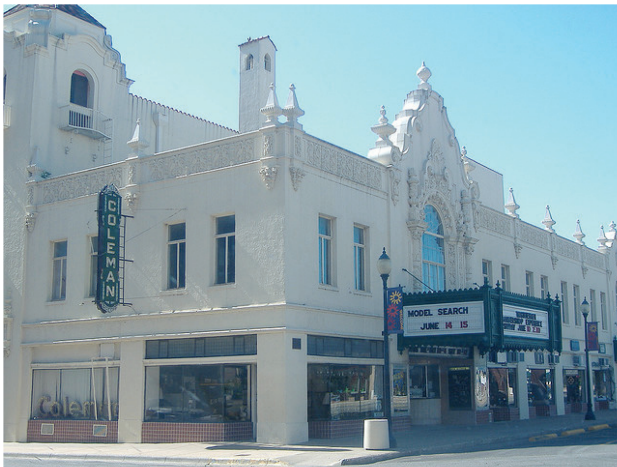
An exterior view of the Coleman Theatre

“Everything is just beautiful,” she said describing the theatre today. “It looks as astounding as it may have looked when it first opened and it will continue to get better.”