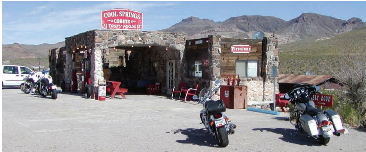
Cool Springs in 2008 after restoration.