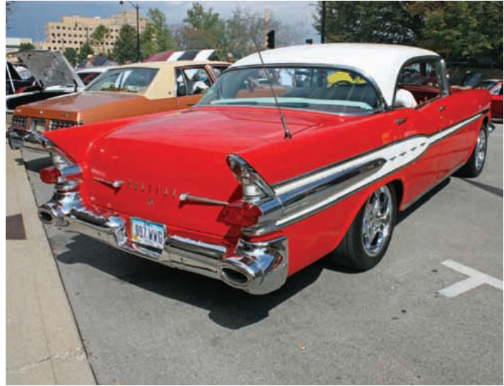
Classic cars at the Mother Road Festival.

Throughout the Mother Road’s storied history, a combination of shared and personal experiences have served to perpetuate the Route 66 image and draw. At the International Route 66 Mother Road Festival and Car Show (held annually in Springfield and Illinois), it is in the spirit of Route 66—of capturing an idealized American experience—that compels hundreds of classic car owners to breathe new life into cars over half a century old, and thousands more visitors from across the world to come and appreciate their work.