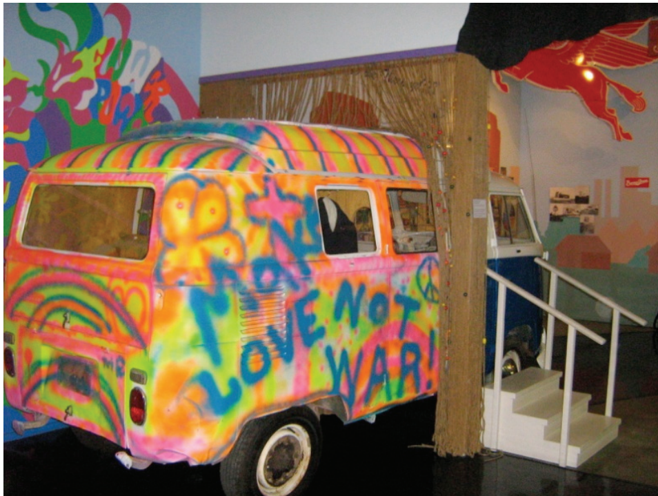
1960s Gallery Hippie Half of VW Bus