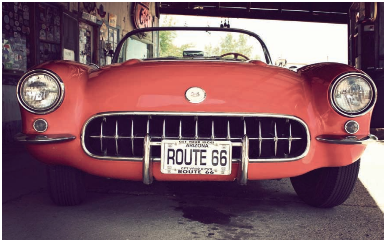
1957 Red Corvette at the Hackberry General Store on Route 66, Arizona.