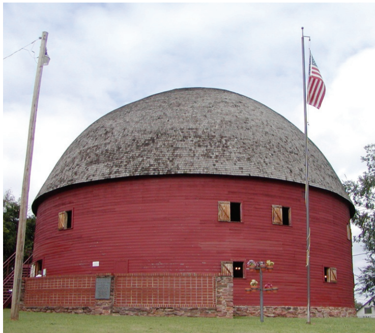
The Round Barn of Arcadia, Oklahoma, fully restored.