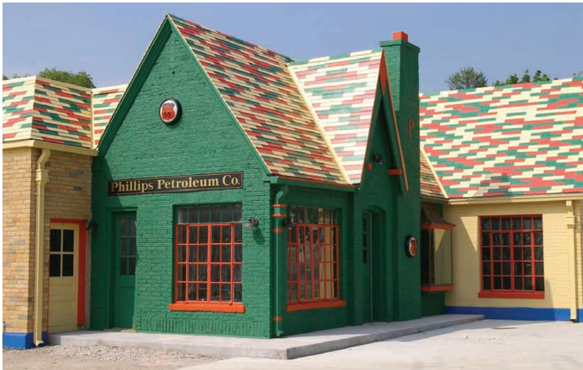
The Carr Service Station in Cuba has been fully restored to its original appearance, down to the original Phillips 66 trademark green and orange paint scheme.