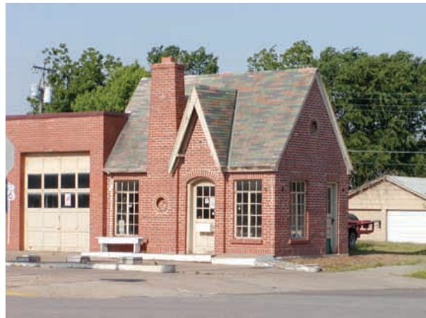
A Phillips station of similar design in Chandler, OK

The Phillips company has been around since the early years of gasoline sales. L.E. Phillips and Frank Phillips got into the industry when they began prospecting for oil in 1903. With a mix of skill and luck, they achieved 81 successive oil strikes and by 1915 had begun what was to be one of the forerunners of the burgeoning gasoline industry.