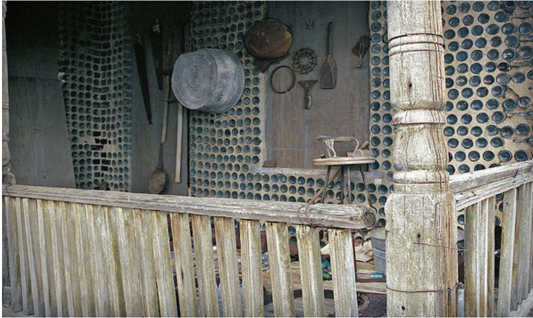
Bottle house in Rhyolite, NV