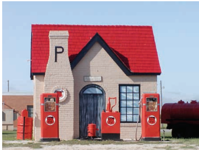
Phillips 66 on Route 66, McLean, Texas

In what follows, specific Route 66 icons and attractions the “high art” that they influenced are examined in greater detail. Pop Art’s recuperation of roadside American “folk art”—and other familiar items of everyday life—is arguably a factor in the increase in popular interest in “high art,” as indicated, for example, by the rise in the Blockbuster museum exhibit. Pop Art leveled the field of objects worthy of attention and people came. While a great deal of Route 66’s continuing ability to attract has been mediated by print and electronic media, it is the icons themselves and our ability to see them as both as history and as art – however one chooses to qualify the term – that has become essential to reinvigorating the fortunes of the towns and people of the Route 66 roadside today.