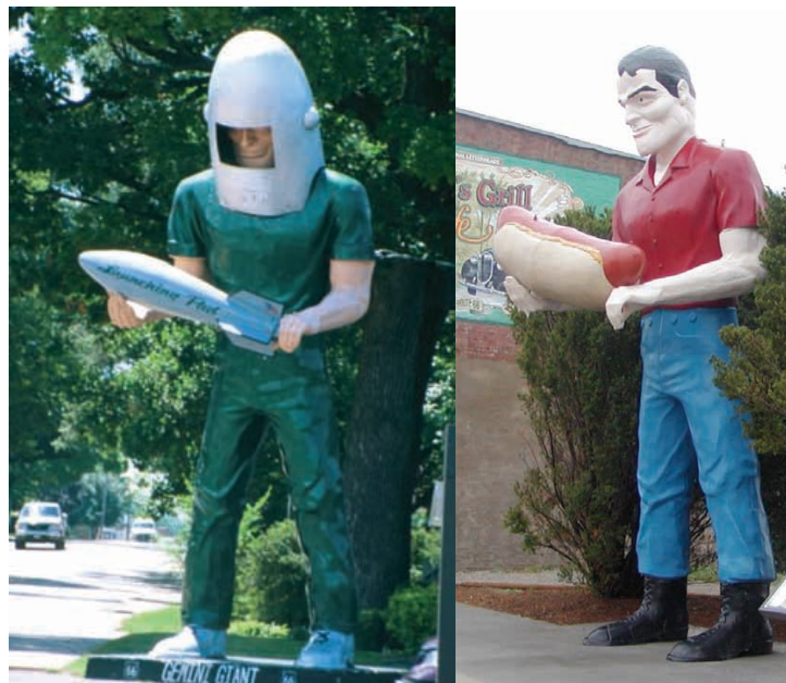
Two of the remaining Muffler Men along Route 66 in Illinois