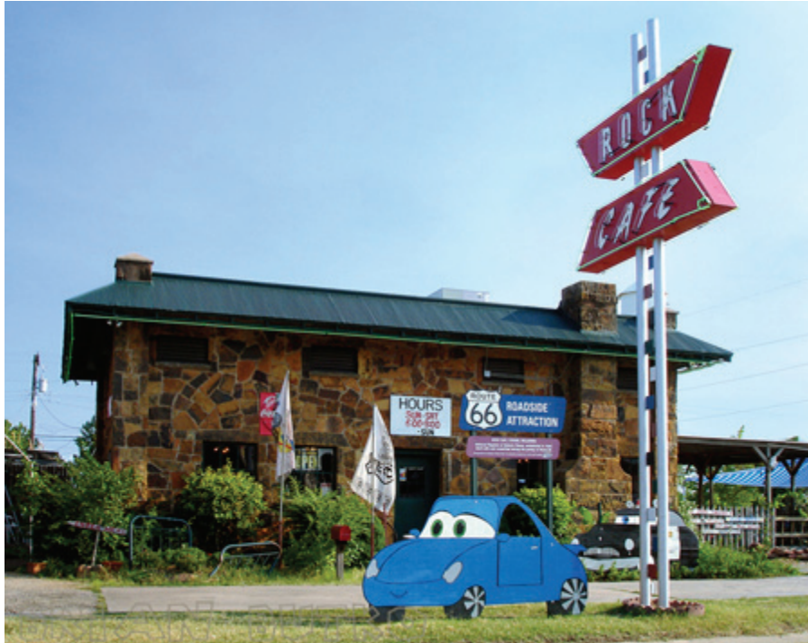
A cutout of Sally from the Disney/Pixar movie Cars in front of the Rock Café

the optimistic Sally character that championed Radiator Springs and introduced McQueen to the joys beyond the self-centered pursuit of glitz and glam.