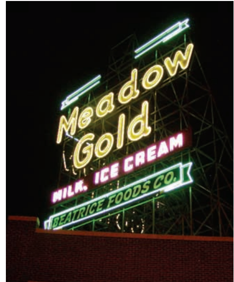
Restored Meadow Gold sign, Tulsa, Oklahoma

Given both the historical and aesthetic interest generated by neon signs, restoring vintage neon signs has become an important cultural task. The Meadow Gold neon sign on Route 66 in Tulsa, Oklahoma, is a case in point. A city icon since at least the 1940s, the Meadow Gold sign had been dark and neglected since the 1970s and was slated for demolition in 2004 by a local car dealership. Working with the Oklahoma historic preservation office and the National Park Service, the Tulsa Foundation for Architecture and the Oklahoma Route 66 Association saved and restored the sign, which was dedicated in May 2009. The project is part of a larger Tulsa plan to reanimate the city, and its extensive neon signage, thanks to its connection to Route 66.