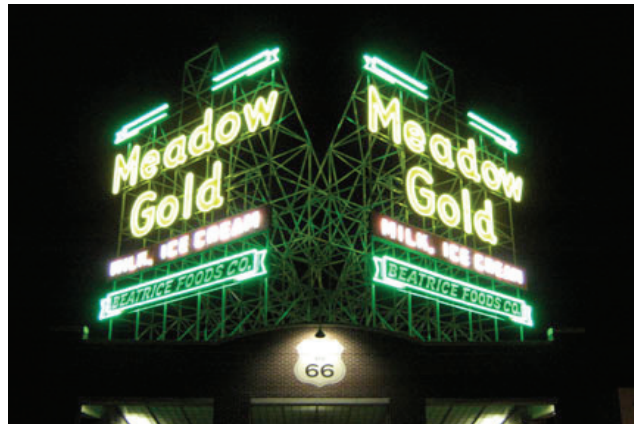
The Meadow Gold sign glows again.