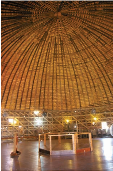
Round Barn interior.