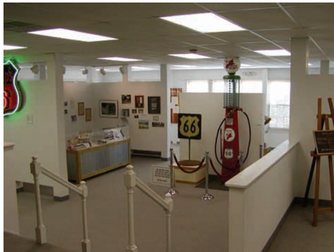
The Route 66 Exhibit in the park's visitor center