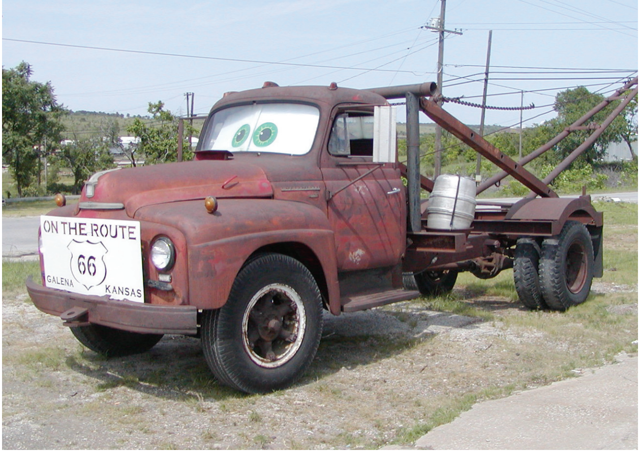
The inspiration for "Tow-Mater" from the Disney/Pixar movie, Cars .