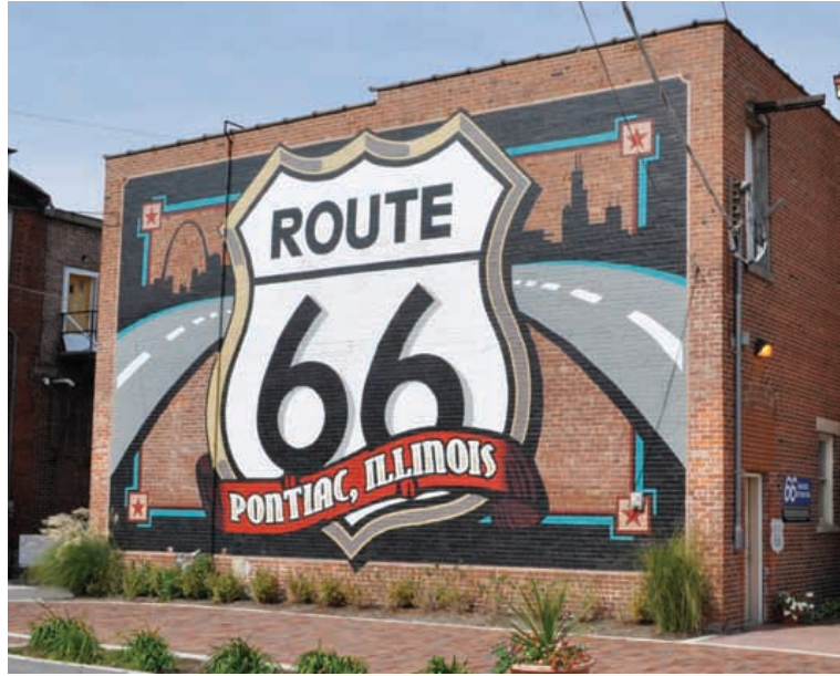
Route 66 Shield mural

P.R.O.U.D. has had a major role in attracting business to the downtown area. As one strolls through downtown Pontiac, they may browse over 40 shops offering a diverse array of products, from locally made crafts and novelties to more practical shoppers' goods like furniture and housewares. Shoppers also benefit from a relatively modest sales tax (6.25% versus 9.75% in Chicago).