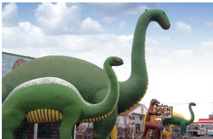
The sometimes quirky nature of some Route 66 attractions is integral to the highway’s cultural identity and mass appeal. Photos (clockwise from top left) The Blue Whale of Catoosa, Oklahoma; the Bunyan Giant (Hot Dog Man) of Atlanta, Illinois; and the dinosaurs in front of the Rock Shop in Holbrook, Arizona.