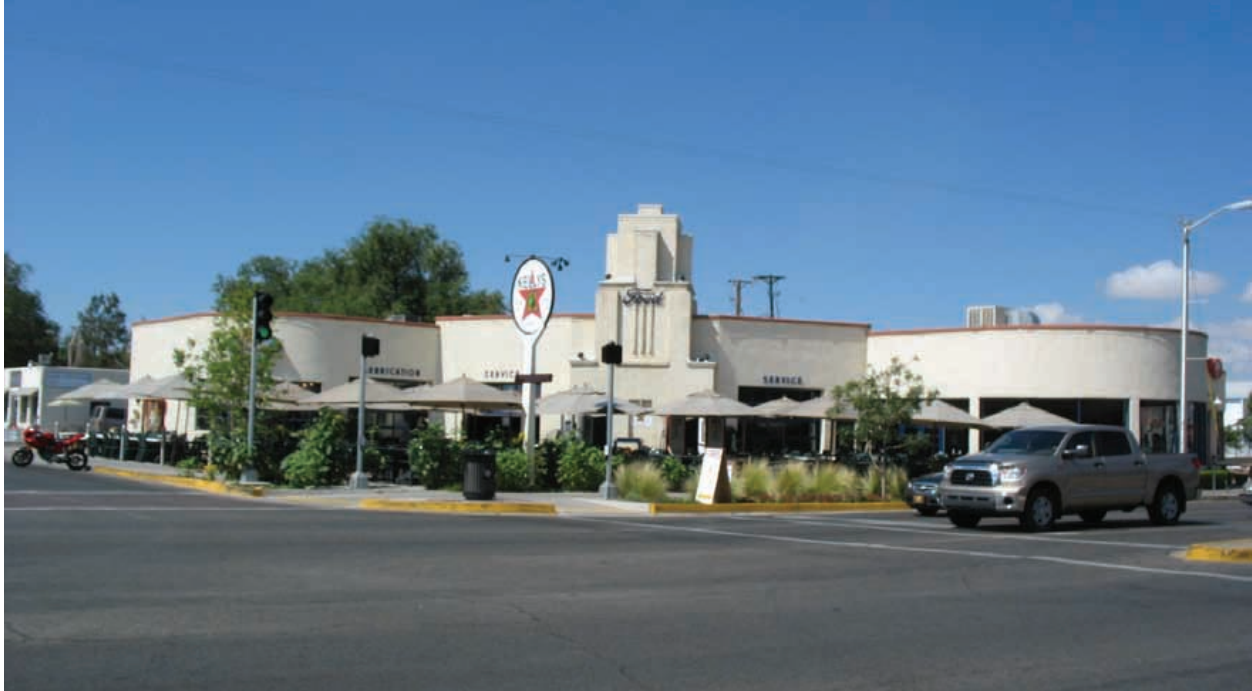
Kelly's Brew Pub exterior