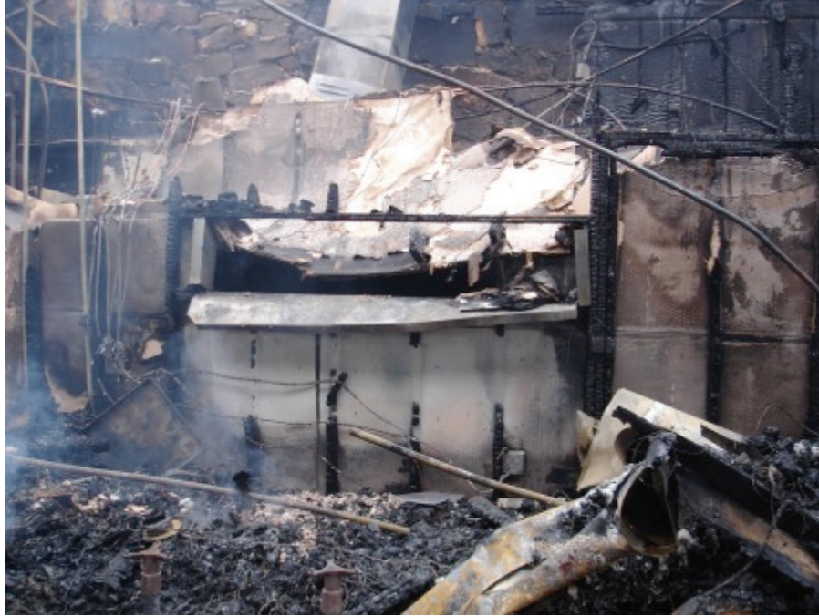
This is the pass thru window where the grill sat directly behind and where I headed entering the building.

Reaching the wall, I decided to be brave and stick my arm through the window and feel for the grill surface to check if it was smooth! Although, covered in ash and debris the surface was smooth and the butter wheel, something used to easily apply butter to bread and one of my favorite pieces, was intact.