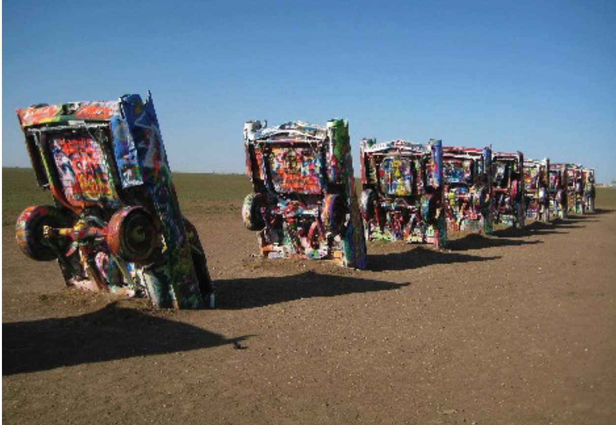
Cadillac Ranch, Amarillo, Texas.