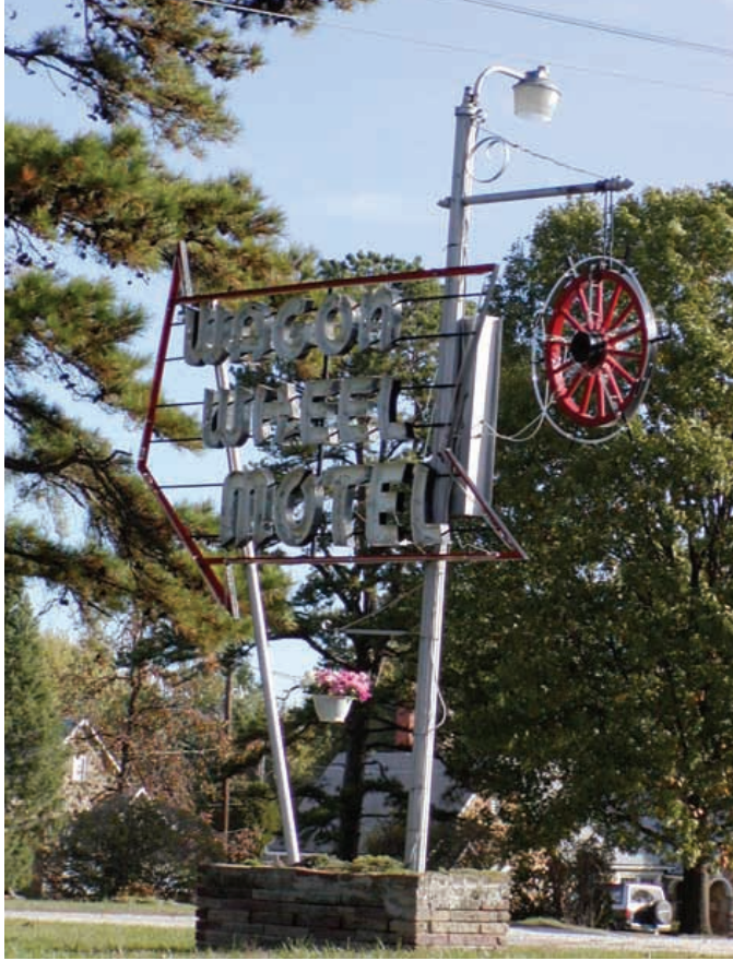
The Wagon Wheel located at 901 E. Washington in Cuba, has been serving Route 66 travelers since 1934.