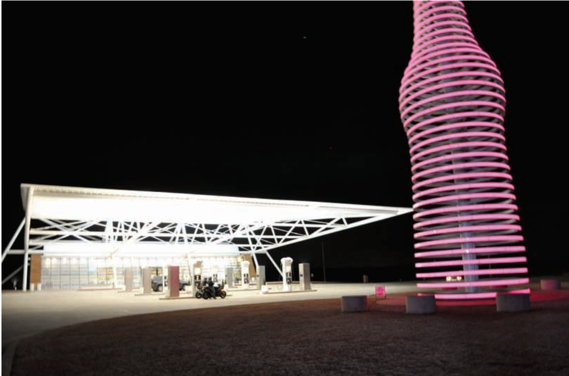
POPS under the canopy.