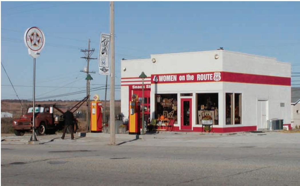
4 Women on the Route

Area businesses, towns, counties and states market their Route 66 attractions, but an important aspect of the marketing is word-of-mouth among roadies. 202