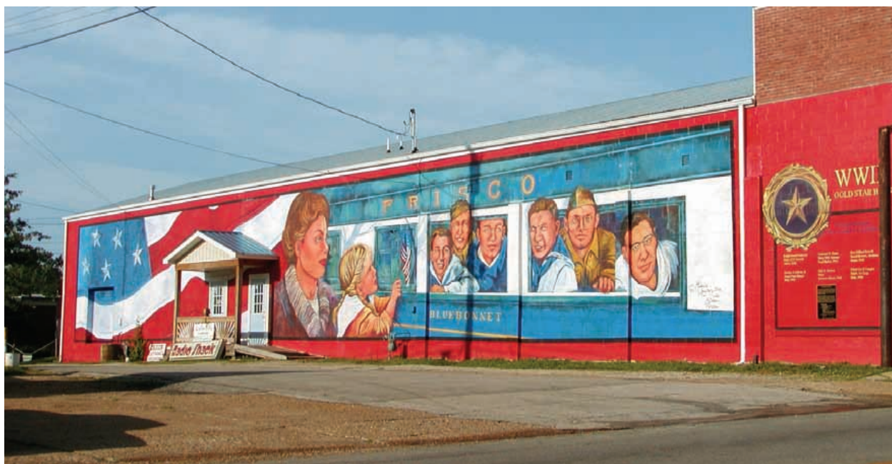
Cuba’s Gold Star Boys from World War II are shown aboard the Blue Bonnet Frisco Train, heading off to join the war. The train was the major form of transportation from 1927 until 1967.