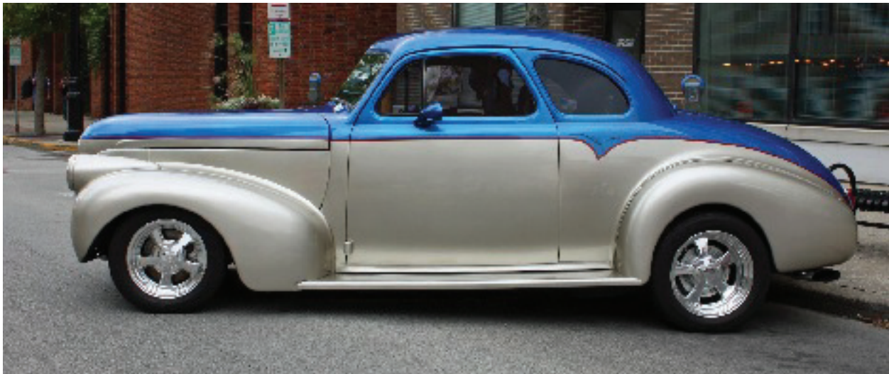
1940 Chevrolet Coupe Master Deluxe Street Rod at the International Route 66 Mother Road Festival and Car Fair.

Of course, exhibiting cars is the central focus of the show. Some come with individual restoration projects, others come as a club. Some come with their restored toy; others come with a cherished teenage possession or family antique. Many additional newcomers arrive with their cars each year, but still others have been returning loyally year after year. Each registrant comes with their own personal narratives that shine through in the varied ways they restore their cars. Event organizers have ensured that their participants’ efforts do not go unrewarded, and offer awards in over 40 categories with Championship Auto Shows Inc. (CASI) certified national judging.