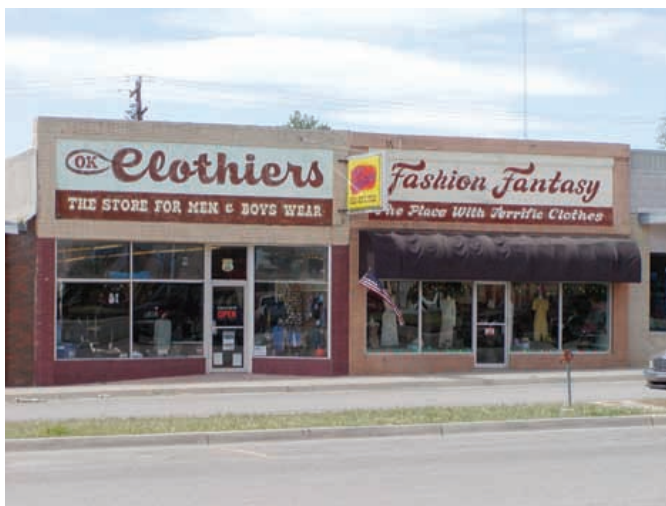
Downtown Santa Rosa

The downtown area is small but offers attractive stores and reflects the architecture of an old western town. As of 2007, the area had 18 businesses that created 75 jobs. 295 At one point, Route 66 provided the foundation for the local economy, bringing in travelers seeking food and shelter; today Route 66 still