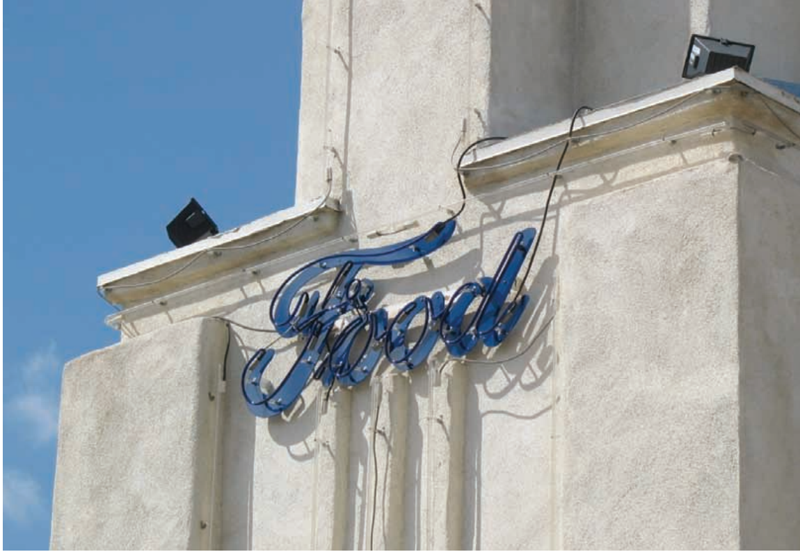
The Kelly's Brew Pub "Food" sign