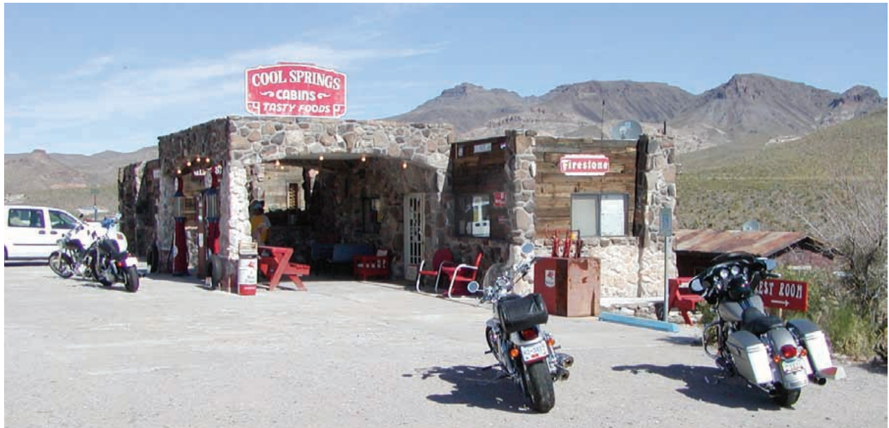
Cool Springs Cabins on Route 66 in Arizona.