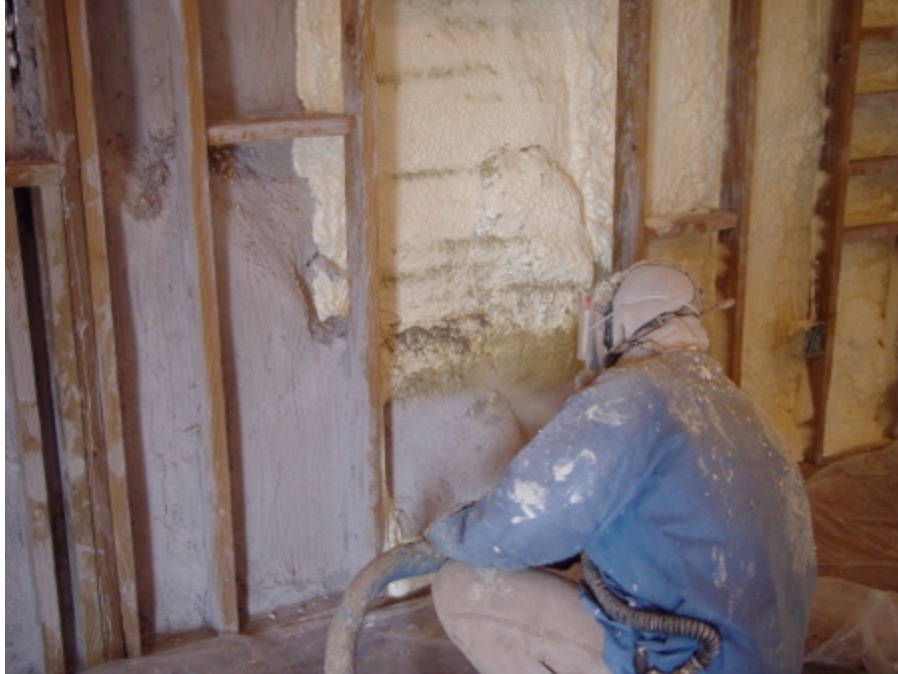
Foam Factor from Chandler!! Great job and weird at the same time!

So as you can see we are getting alot done! I will be posting again soon as I have a great story about the fire! But it deserves its own post!!! Stay tuned!”