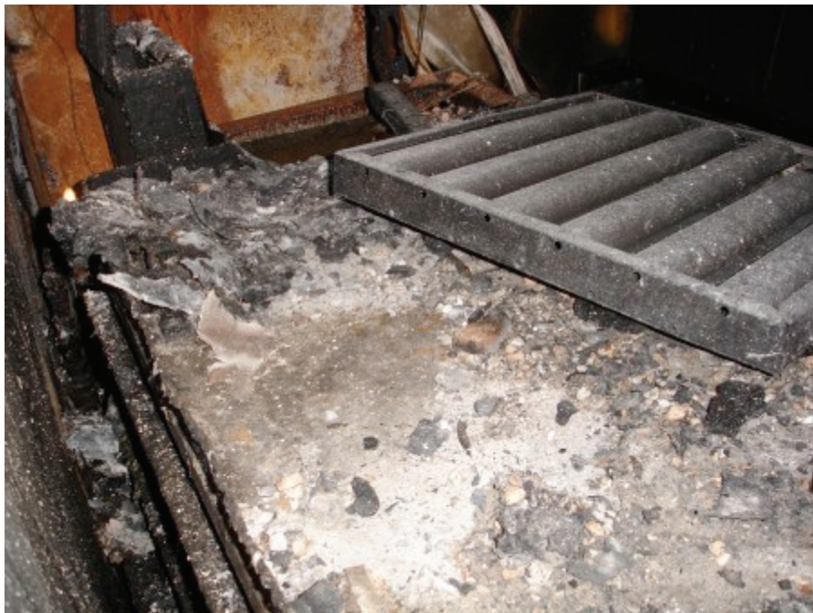
The grill as it was behind the wall! Safe & Sound

Reaching the wall, I decided to be brave and stick my arm through the window and feel for the grill surface to check if it was smooth! Although, covered in ash and debris the surface was smooth and the butter wheel, something used to easily apply butter to bread and one of my favorite pieces, was intact.