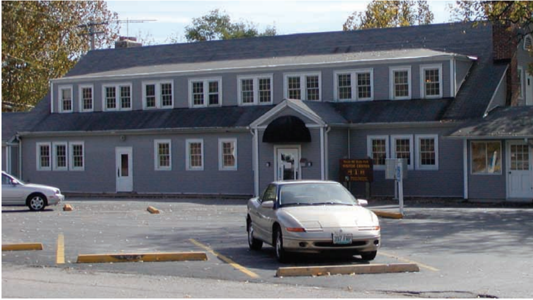
Visitor center at the Route 66 State Park (formerly Steiny's Inn)