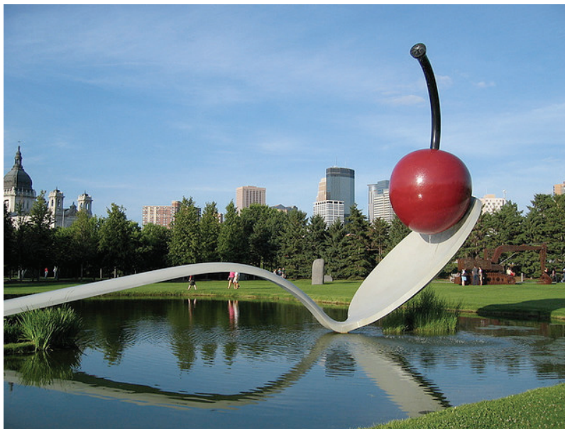
Claes Oldenburg and Coosje van Bruggen, Spoonbridge and Cherry (1985-88)

Claes Oldenburg adapted many of Minimalist’s fabrication strategies—as pioneered by the Muffler Men—to a Pop sensibility. Best known for colossal public sculptures of mundane objects such as the iconic Spoonbridge and Cherry (1988) in Minneapolis, Oldenburg’s work was initially ridiculed before being embraced as whimsical and insightful additions to public space.