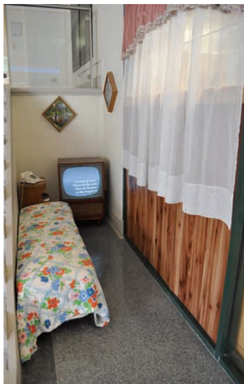
The motel room featured in the Route 66 exhibit