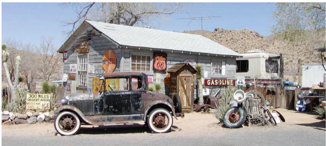
The General Store in Hackberry Arizona on old Route 66.

Jack Kerouac and his alter ego Sal had a similar impulse pulling them west in his Beat Generation novel On the Road , but his reference to Route 66 is brief, and considerably more realistic than Steinbeck's. It is what he perceives in Los Angeles after already having made the trek that cements Route 66 in the minds of his fellow beatniks and draws them to it. There he sees a great collection of "the beatest characters in the country," including "long-haired broken-down hipsters straight off Route 66 from New York." Where Steinbeck's Route 66 was like the passage to a mecca of prosperity, for Kerouac it was a potential passage to a culture mecca. Beatniks (and eventually their countercultural successors, hippies) would for years stream down from New York and elsewhere to California, and Route 66 became their Beat icon for that passage.