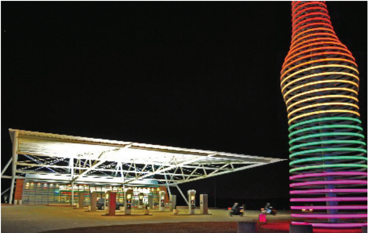
One of Route 66's newer attractions—POPS—in Arcadia, Oklahoma. The soda pop bottled illuminated by LEDs is 66 feet tall, and the roof of the restaurant is angled at 66 degrees from the ground.