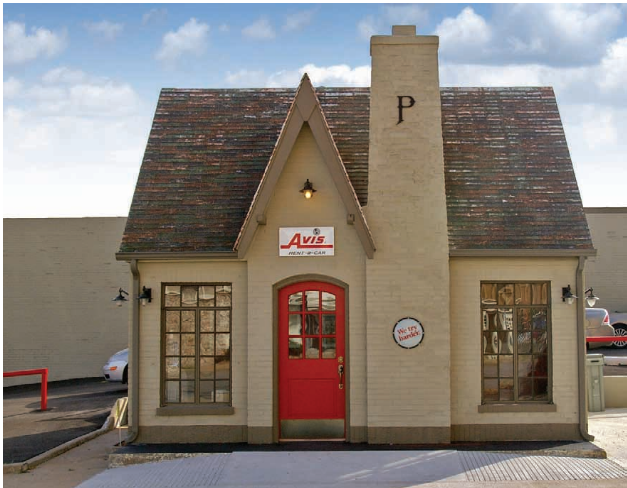
The newly restored Vickery Station as an Avis Rent-A-Car facility.