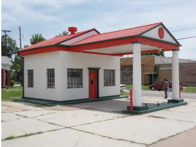
Miami Marathon Oil Company, Miami, Oklahoma