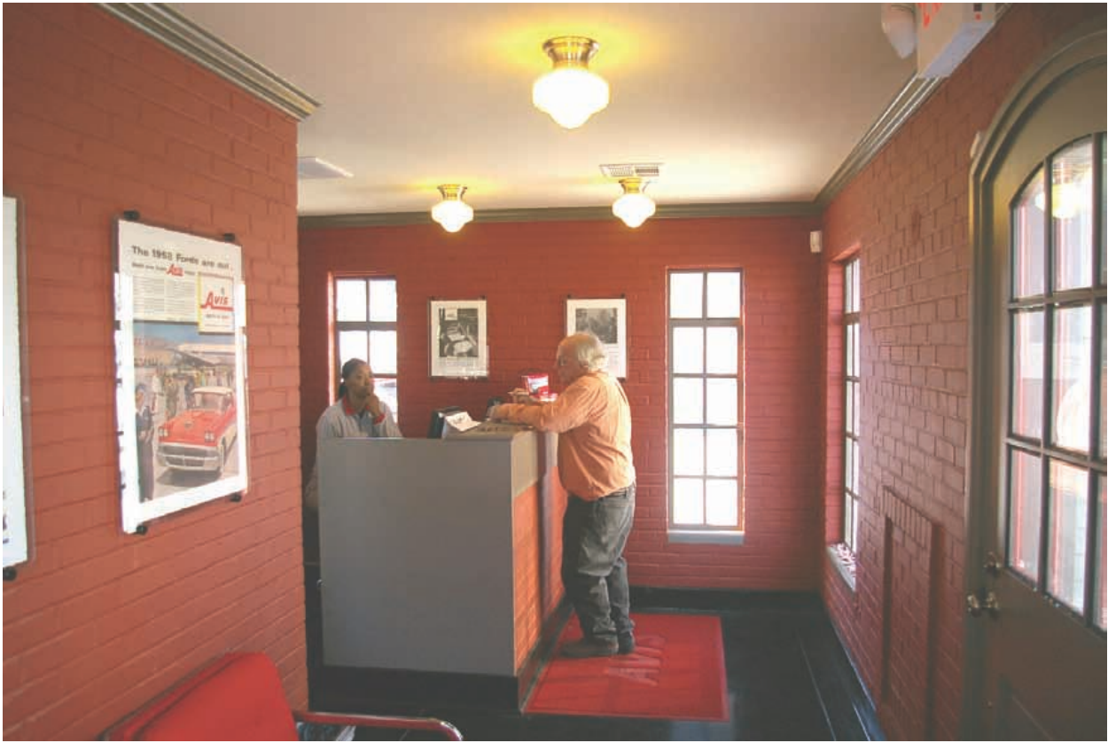
The operating Avis Car rental office of Vickery Station today