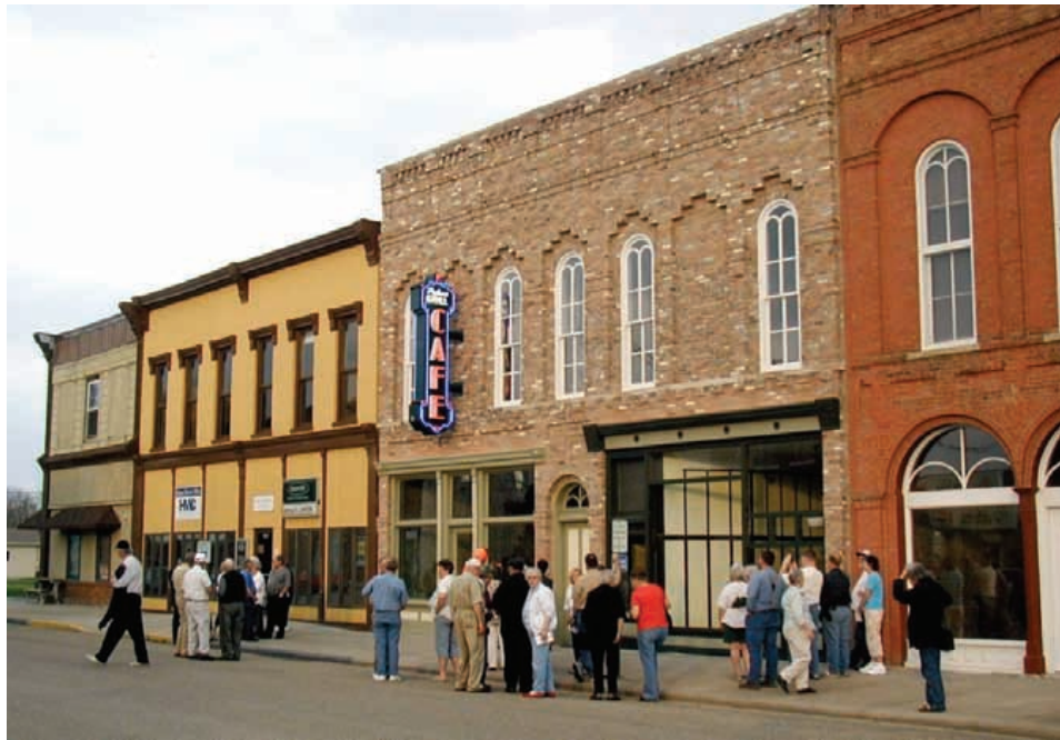
The Palms Grill Café completely restored