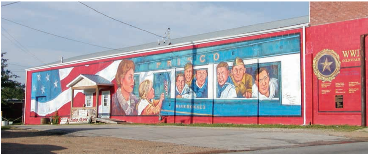
The Gold Star Boys (service men killed in action in World War II) mural of Cuba, Missouri. Cuba’s mural program has been an economic boon to the once-struggling town.

To provide a larger framework for these 25 case studies, Chapter 1 presents a history of Route 66 and contemporary efforts to preserve the Mother Road; Chapter 2 then overviews the 25 “tales.” It lists the sites, briefly describes their community settings and host personalities, and then summarizes the uplifting economic and other positive impacts of many of the case examples. In many smaller communities along Route 66, tourism related to the Mother Road is one of the most significant, if not the only, “economic game in town.” The restored Route 66-themed motel, restaurant, and gift shop may not have a high-dollar business volume (especially relative to the much larger regional and state economies), yet they anchor the downtown in many small communities and change the perceived image of a place from a dowager town abandoned by the interstate to a community with a Route 66-linked past and future. This monograph’s case studies thus combine one-of-a-kind stories of sites and people with the uplifting message of meeting adversity and positive transformation. The Route 66 Preservation Foundation describes the Mother Road as follows: “Route 66 was and is the best of us, and perhaps even the worst of us, but it will always truly be a part of our American Dream...” 13 Our “tales” thus convey some measure of the American Dream, yet this dream is surely broader and spans the globe.