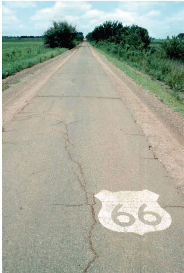
A nine-foot wide segment of Historic Route 66 south of Miami, Oklahoma.

During the 1960s and 1970s, Route 66 became less important for highway travel as people flocked to the more efficient ribbons of concrete of the interstate highway system which was begun in 1956. The final section of Route 66 was bypassed by Interstate 40 at Williams, Arizona in 1985. In all, the Mother Road was “replaced” from a transportation engineering perspective by Interstates 55, 44, 40, 15 and 10.