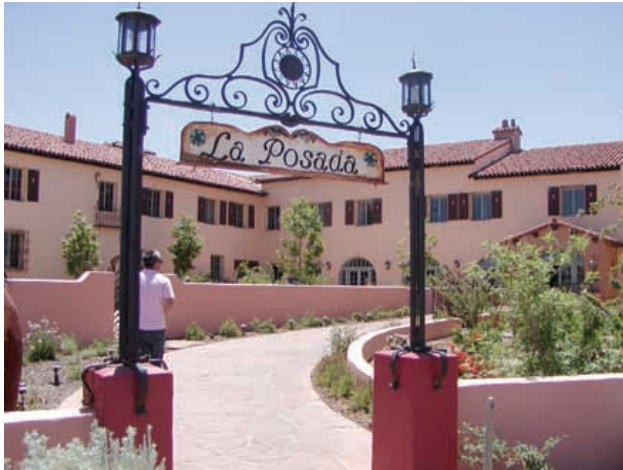
La Posada Hotel

Within the walls of La Posada Hotel, in the hand-crafted furniture and artwork, linger the hopes and dreams of yesteryear. Travelers find this historic hotel has an enduring allure for several reasons: the novelty of finding luxury in an unlikely place, the elaborate decorations, and La Posada's time-tested reputation for high-quality service. Through its painstakingly preserved interior and exterior, the spirit of the hotel's past comes to life—sometimes quite literally for the