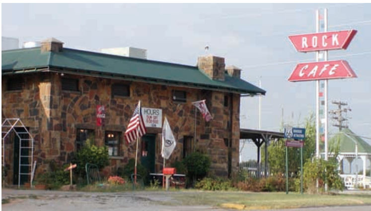
The Rock Café of Stroud, Oklahoma after restoration.

That took a lot of gumption on my part, as I didn’t know the first thing about cooking or running a restaurant, but my hard work and trial-by-error approach paid off... It wasn’t long before the locals and tourists were back. Although throughout the years I’ve made some changes to the original menu—we no longer smoke our barbecue, and we’ve added quiche and spaetzle to the menu—I like to think we’ve never strayed too far from the philosophy of good food, good service, and good prices.... 12