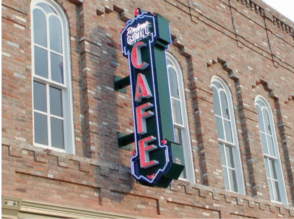
Outside of the Palms Grill Café