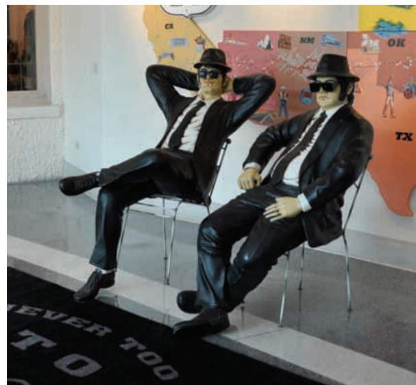
Replicas of the Blues Brothers

Entering the “Route 66 Experience,” visitors are welcomed by a large “Joliet Kicks on Route 66” carpet. As they proceed into the exhibit, they are greeted by a tall signpost whose signs point to all corners of the globe, connecting those places to Joliet and Route 66. Many international travelers use this signpost as a photo opportunity.