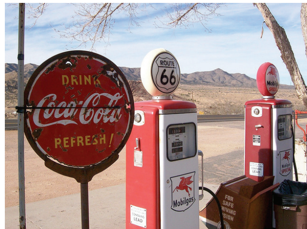
Route 66, Hackberry, Arizona

Although Route 66 has influenced several distinct currents in the high art of the Sixties, Pop Art has been the most significant. The rise of Pop Art in the Sixties is contemporaneous with the last heyday of the Mother Road. Both celebrate the popular, the familiar, and the everyday. Both revel in commercial materials and processes. Andy Warhol, America’s best-known Pop artist, said people liked Pop Art because its subject matter was familiar: “It looks like something they know and see every day.”