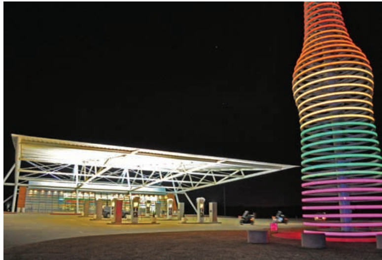
The POPS 66-foot soda pop bottle.