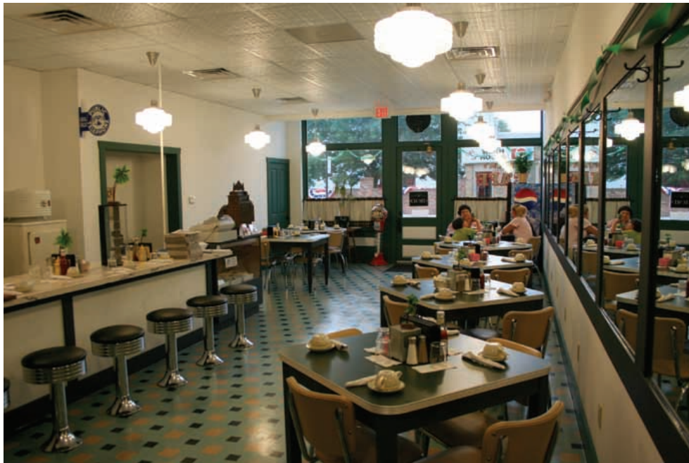
A view of the Palms Grill Café from the dining room to the door, after the restoration project was complete