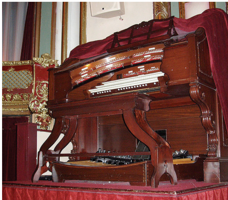
The famous Wurlitzer pipe organ