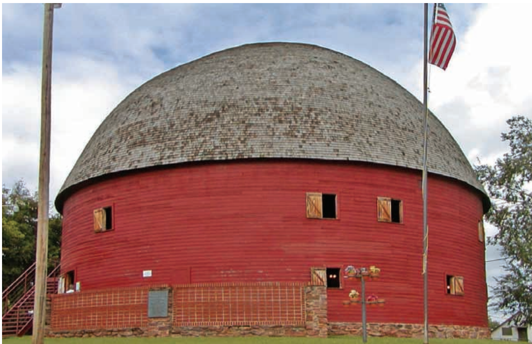
The Round Barn

It was, however, a seasoned carpenter’s intuitive fascination with an architectural curiosity that lured Robison to Oklahoma’s only truly round barn [most other supposed round barns are actually hexagonal or octagonal], which has been listed in the National Register of Historic Places since 1977. With a diameter of sixty feet and a hemispherical dome that peaks forty-three feet above the ground, the Round Barn dominates a cluster of gritty little buildings, some of which remain from Arcadia’s cotton-trading heyday. In the barn’s lack of conventional structural components, the continuous round wall have no top and sole plates, for example, and what little bracing it has angles in the same direction. Robison detects as much raw resourcefulness as craftsmanship. “It’s rough,” Robison admits, “but I’ve never seen any work like it.”