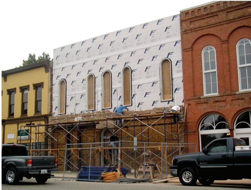
The Palms Grill Café during the restoration process

housed the library, moved into another portion of the Downey building that same year. Together, both the museum and café are successful operations today.