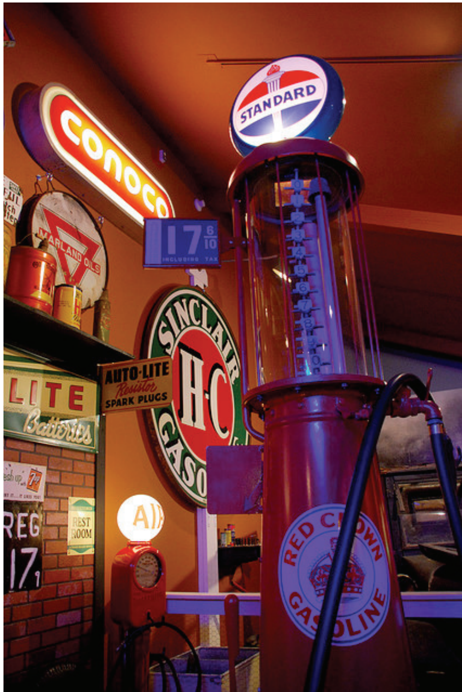
Antique gas pump