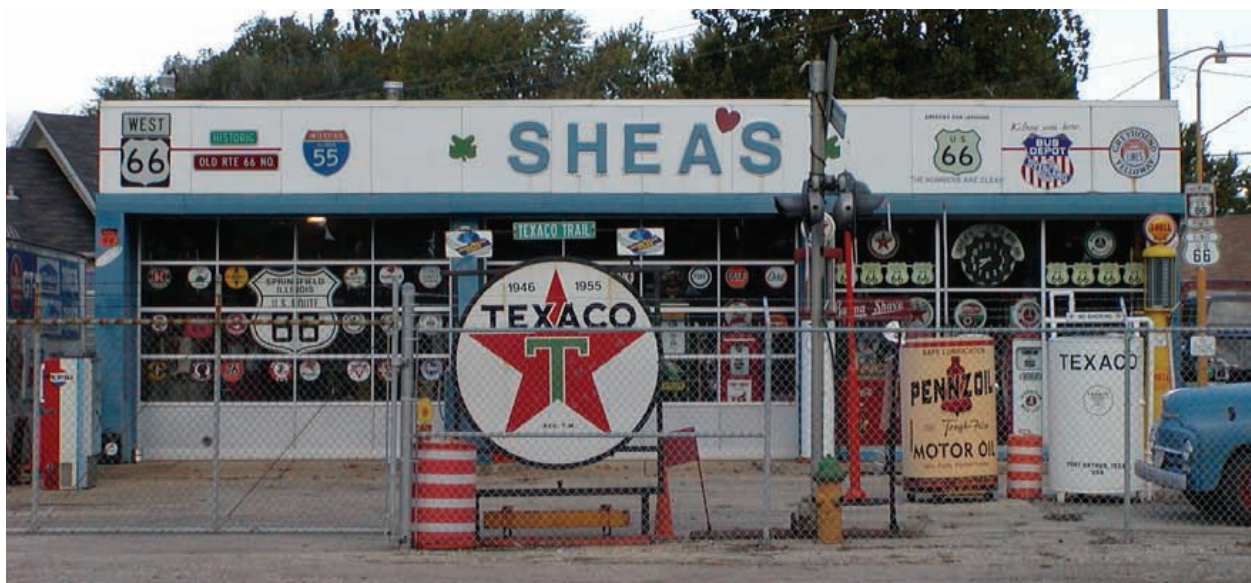
An outside view of Shea's Gas Station Museum

Shea's Gas Station Museum is open year round, Tuesday through Friday from 7 a.m. till 4 p.m. and Saturdays until noon. With the collection of items and Shea's personal tales of days long-gone, it promises to be a nostalgic journey for all who stop by. Shea typically plays host to the many visitors from around the world and has even been interviewed by national and international travel writers, radio hosts and film producers.