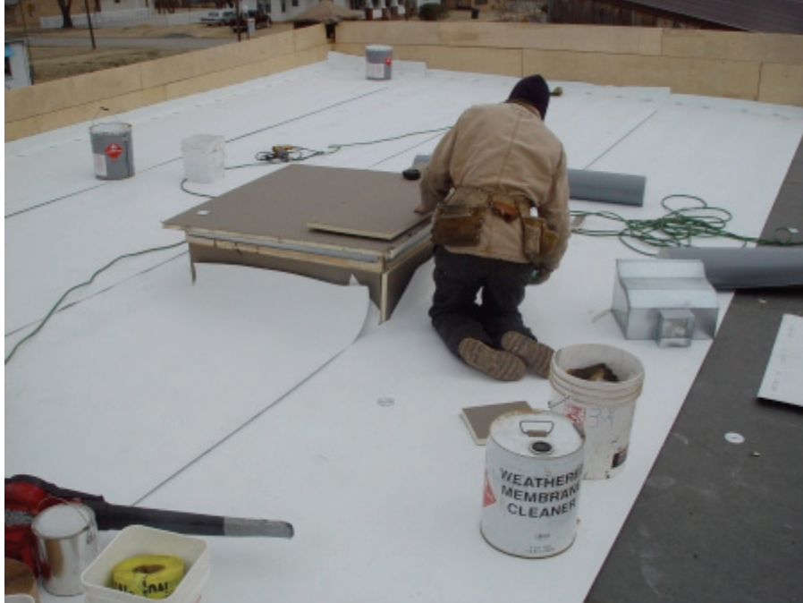
Installation of single ply roof system: