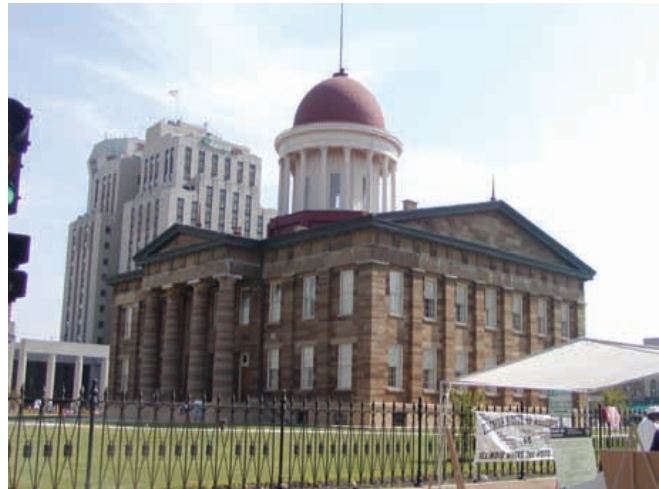
Springfield Old Capitol Building

The city of Springfield (2008 pop. 117,352), is located in central Illinois and is about 80 miles northeast of Saint Louis, Missouri. Besides being the Illinois state capital, Springfield is most famous for being the town where Abraham Lincoln spent the early years of his legal and political career. Many sites throughout Springfield chronicle the places Lincoln frequented throughout his young adulthood. Since 1993, the non-profit, volunteer-driven Downtown Springfield, Inc. has taken the responsibility for ensuring these structures remain preserved, as well as other buildings in downtown Springfield. An important example is in the heart of the downtown area, where the Old State Capitol building from the late 1800s takes a prominent position in the city skyline.