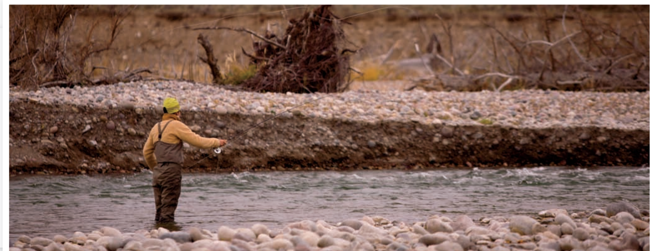
Quincy Liby preps the bait and casts for some late fall Snake River Cutts. Snake River, Jackson Hole, WY.

The fashionable details are what make this relaxed capri such an original fit for walking the dogs, pedaling the cruiser or raking leaves in the yard. In addition to the soft feel of organic cotton, the ultra-light capri features an oversized front button, contrast stitchwork and slanted front pockets. Wider loops fit thick belts and patch-on pockets sit flat on back, while an 18-inch inseam shortens by drawstring when wading a stream or lying in the sun. style: 9116 weight: 6oz size: 4-14 (even) colors: chocolate, bud green, nightshade Check this out: Indian Summer calls for the soft, light fabric and relaxed cut of this casual capri.