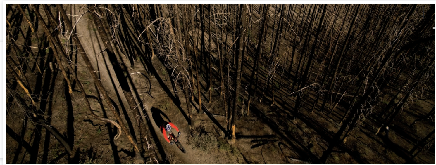
Jason Tattersall riding the burned out remnants of Fisher Creek Trail. Sun Valley, ID.

A relaxing Polartec® Classic feel colors this fleece layer with a less complicated feel on crisp fall days. A half-zip vents heat when hiking for the pass or holding it down in the bar, while a chest pocket stows cards or cash to pay the tab. Power Stretch® cuffs stay put when pushed up to cool down. style: 5646 weight: 12oz size: s-xxl colors: mecca orange, tarmac, black, metro Check this out: Crams easily in a daypack, boat bag or overnight duffel.