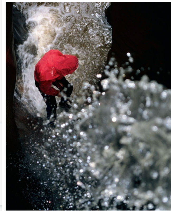
Calvin Hebert getting wet in Heaps Canyon. Zion National Park, Utah. Kennan Harvey

A Power Stretch® style for trips or treks, this relaxed fleece rash guard adds a surfy vibe to any foreign or domestic undertaking. Warm, stretchy Polartec® fabric layers smoothly, traps heat efficiently and sheds light moisture on runs or rides. A shorter inch-high neck eliminates the chokehold of higher collars, while reversed material side panels slide it on easily over a base. style: 6627 weight: 8oz size: s-xl colors: mecca orange/dark shadow, olive/dark shadow, black Check this out: Kind of like what you'd wear dropping in at Mavericks, but fleece.