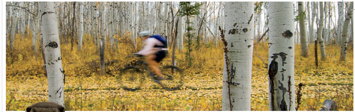
The Aspens are bare, and the wind is chill. One last ride before the bike goes off duty. Jackson Hole, WY.