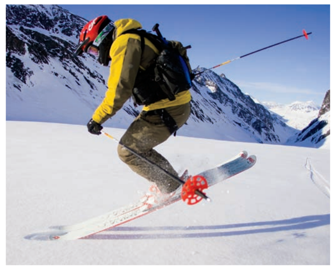
Jon "JK" Klaczewski executes the frontside 50-50. Chugach Mountains, AK.

KOVEN JACKET $330.00 With Cloudburst Stretch EV3™, a storm-sealing hood and an advanced DWR, the Koven supplies toughness, reliability and protection in one alpinist-rated shell. The waterproof/breathable fabric flexes during rock and/or ice climbs due to directional stretch, while also enduring seasons of mountain wear due to a 50-denier surface. Pit zips cool it down when gaining vertical quickly. style: 4603 weight: 19oz size: s-xxl colors: lark/flax, black, cadet/jet, patrol red/tarmac Check this out: A mountain classic that repels mountain squalls in all seasons.