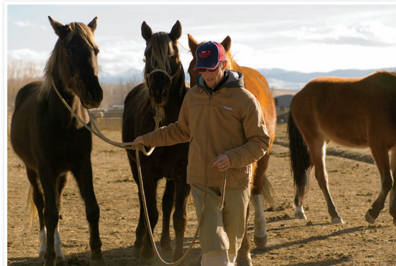
A ranch hand leads some Rocky Mountain Gaited Horses at the Magic Mountain Ranch. Three Forks, Montana.

Tough cotton canvas makes this mid-weight work pant a hard-wearing choice for everything from hauling wood and composting debris to walking dogs by the river. Durable by make, it utilizes strong but not stiff material, yet also takes a sustainable step forward with organic certification. A relaxed, straight-leg cut fits better than standard store-bought farm fare. style: 9171 weight: 20oz size: 30-40 (even) colors: tarmac, slate green Check this out: Sporting organic, free-range, wheat-free cotton might even get you that cute hippie girl.