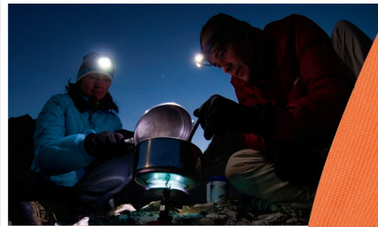
Twilight dining after a dawn to dusk day in the Tetons. Grand Teton National Park, WY.

100-weight Polartec®—with no extra clutter—makes this fleece comfortable with road trips where couch surfs, crash pads and car camps are par for the course. The classic micro velour feels super soft, adds moderate warmth and is branded with Cloudveil embroidery. Be careful with this one, since your girl might steal it when it smells a bit like you. style: 9317 weight: 9oz size: s-xxl colors: olive, jet, black Check this out: Road-ready fleece with a sweet kangaroo pocket.