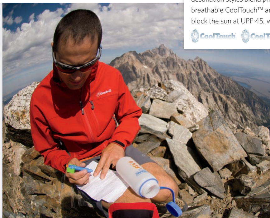
Logging the day on the summit of Buck Mountain. Grand Teton National Park, WY. Jeff Diener

Cool. Our Cool pieces are tailored for river and road due to their casual character, airy feel and easy-care fabric. Rather than adopt a stagnant standard, our destination styles blend progressive featuring with performance nylon. Made from breathable CoolTouch™ and CoolTouch Plus™ fabric, these cool-weather essentials block the sun at UPF 45, wick sweat and sit softly on skin.