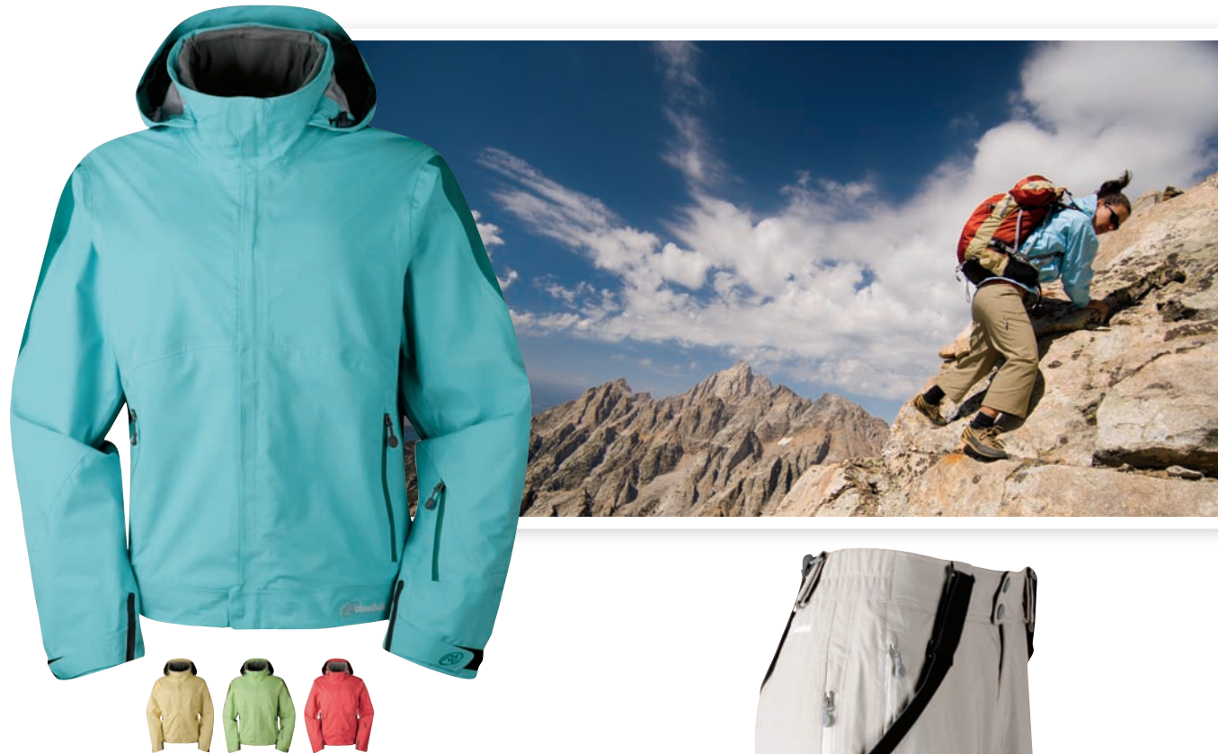
High clouds, low pressure, scrambling on the Grand Traverse. Grand Teton National Park, WY.