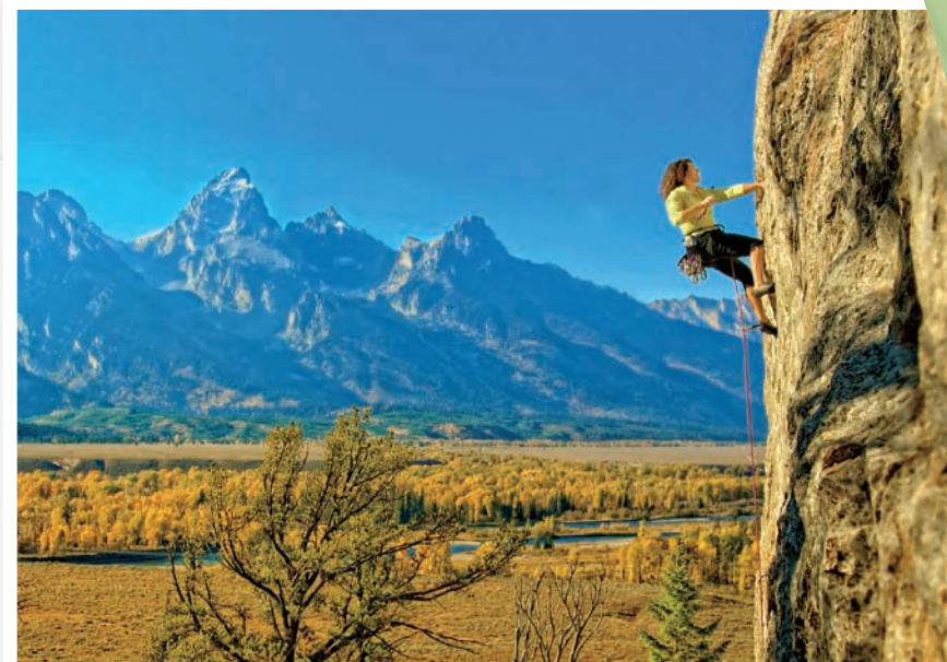
Rebecca Huntington climbs Inconceivable (5.11a) on Blacktail Butte overlooking the Snake River Valley, Moose, WY.