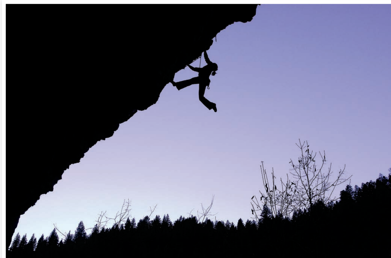
Keili Rayburn uses the day's last light for a red point attempt on Fluff Boy 5.13b, Rifle Mountain Park, Colorado.

Relaxed weekend style allows this textured fleece to layer up, dress down or head straight to dinner after a weekend hike. Polartec® Thermal Pro® traps heat yet also looks stylish by virtue of its sweater-knit surface. A locking front zip vents to the desired height when the air warms or the woodstove starts to crank, while a solo chest pocket holds a few items tight. style: 5742 weight: 11oz size: xs-l colors: chocolate, nightshade, pearl, bluegrass Check this out: An ideal extra layer to keep on the ready in the car, truck or overnight bag.