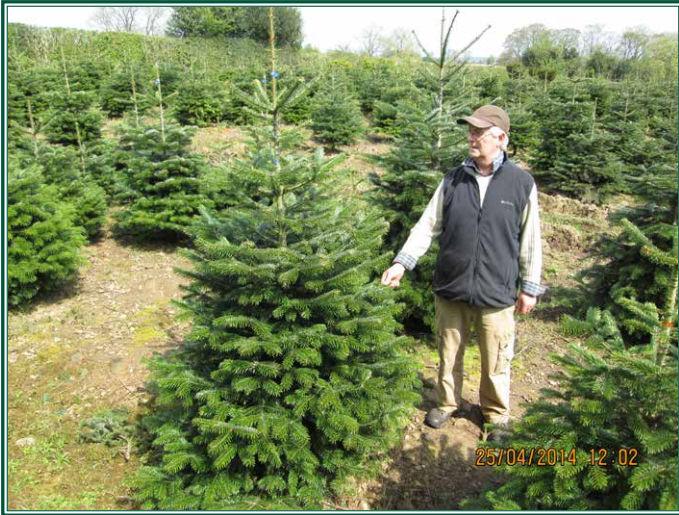
Ripon 3 miles