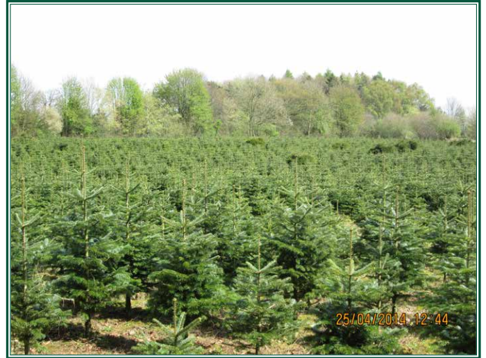
Leeds 24 miles