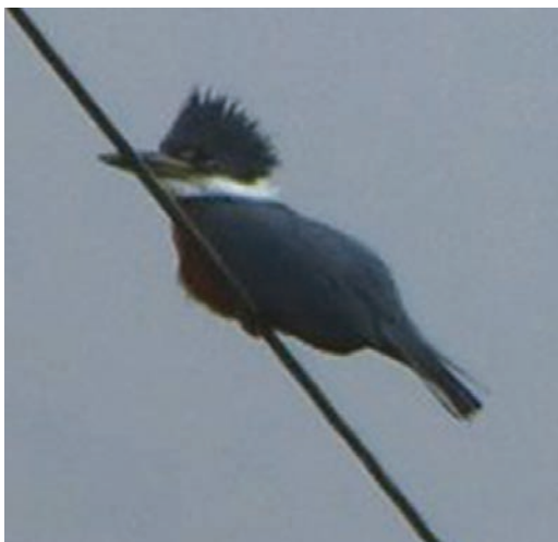
Figure 2. Male Ringed Kingfisher Megaceryle torquata , Quebrada La Mucuchache, 29 September 2012 (Ingrit Correa)

Incubating female at Quebrada La Astillera, 7 April 1993, on a cup-shaped nest of green moss, lichen, plant fibres, spider silk and other fine material saddled on a root 1.2 m above the river in a waterfall amphitheatre c.20 m high. The