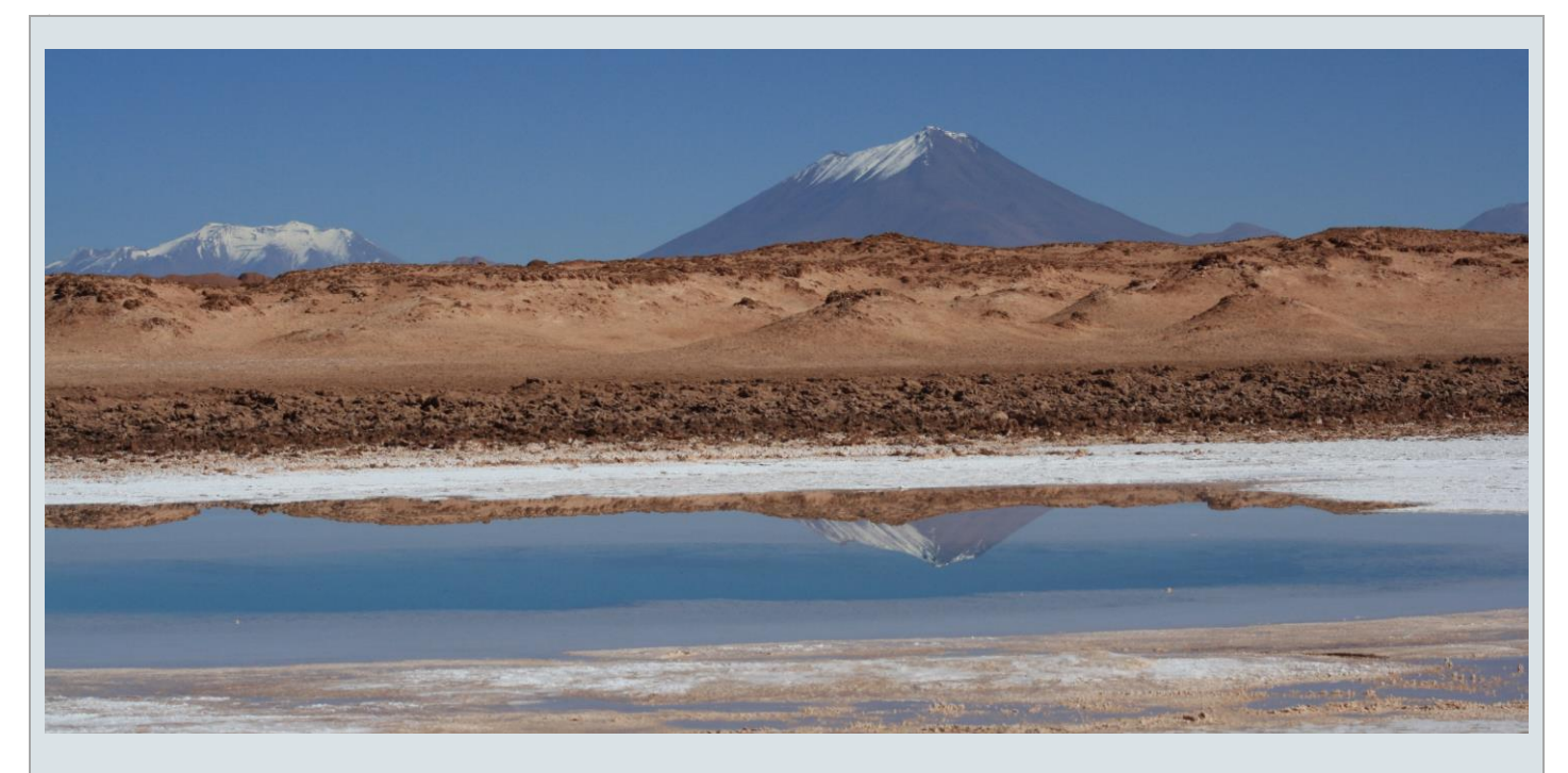
PUNA - Rooftop of the Andean skies

The Puna high plateau is located in the northwestern corner of Argentina between 3,500 and 4,000 meters above sea level and forms the rooftop of the central Andes as a southern extension of the Bolivian Altiplano.