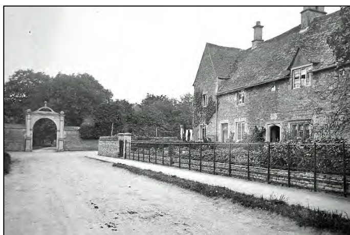
The gateway entrance to the grounds of North Luffenham Hall and Sundial Cottage in Digby Drive in 1910.

Walk down to the end of Chapel Lane, to its junction with Digby Drive, to see the 17th century round-arched gateway entrance to North Luffenham Hall [34].