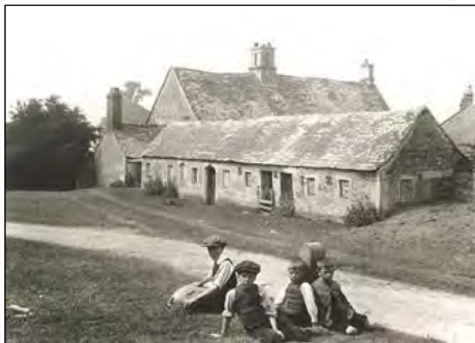
George Henton's 1913 photograph of the 'dog kennel' hovels in Church Street. (Record Office for Leicestershire, Leicester and Rutland)

On the south-west corner of the junction between Lyndon Road and Glebe Road is a late 17th century cottage [9] said to have once been a convent. It was converted into 3 cottages at the beginning of the C19, but two of the cottages were demolished after the Second World War.