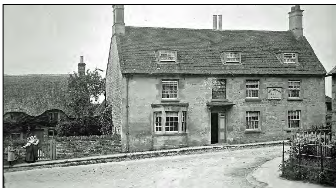
The Fox and Hounds in 1910.

Walk back to the junction with Lyndon Road turn right and then continue walk to the end of Lyndon Road and into Pinfold Lane. The Grade II listed Fox and Hounds public house [18] was a 17th century coaching inn. Note the coursed rubble stone walls with quoins and stone dressings and the Collyweston slate roof with moulded stone end stacks.