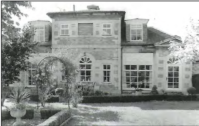
The former dovecote and stables in Church Street, seen from the east. (McCann, J and P, Dovecotes of Rutland, Figure 22)

Plymouth Brethren Meeting House [8] was located behind this property. It was last used in 1931 when the minister was a Mr Palmer.