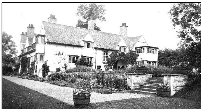
The Pastures and garden from the south west in 1920.

Voysey also designed the garden but the flagged paths, pergolas, sundial, and most of the yew hedges of the original design have gone.