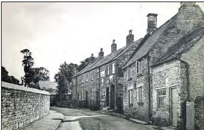
The post office and shop, a former bakery, in Lyndon Road circa 1925.

On the south-west corner of the junction between Lyndon Road and Glebe Road is a late 17th century cottage [9] said to have once been a convent. It was converted into 3 cottages at the beginning of the C19, but two of the cottages were demolished after the Second World War.