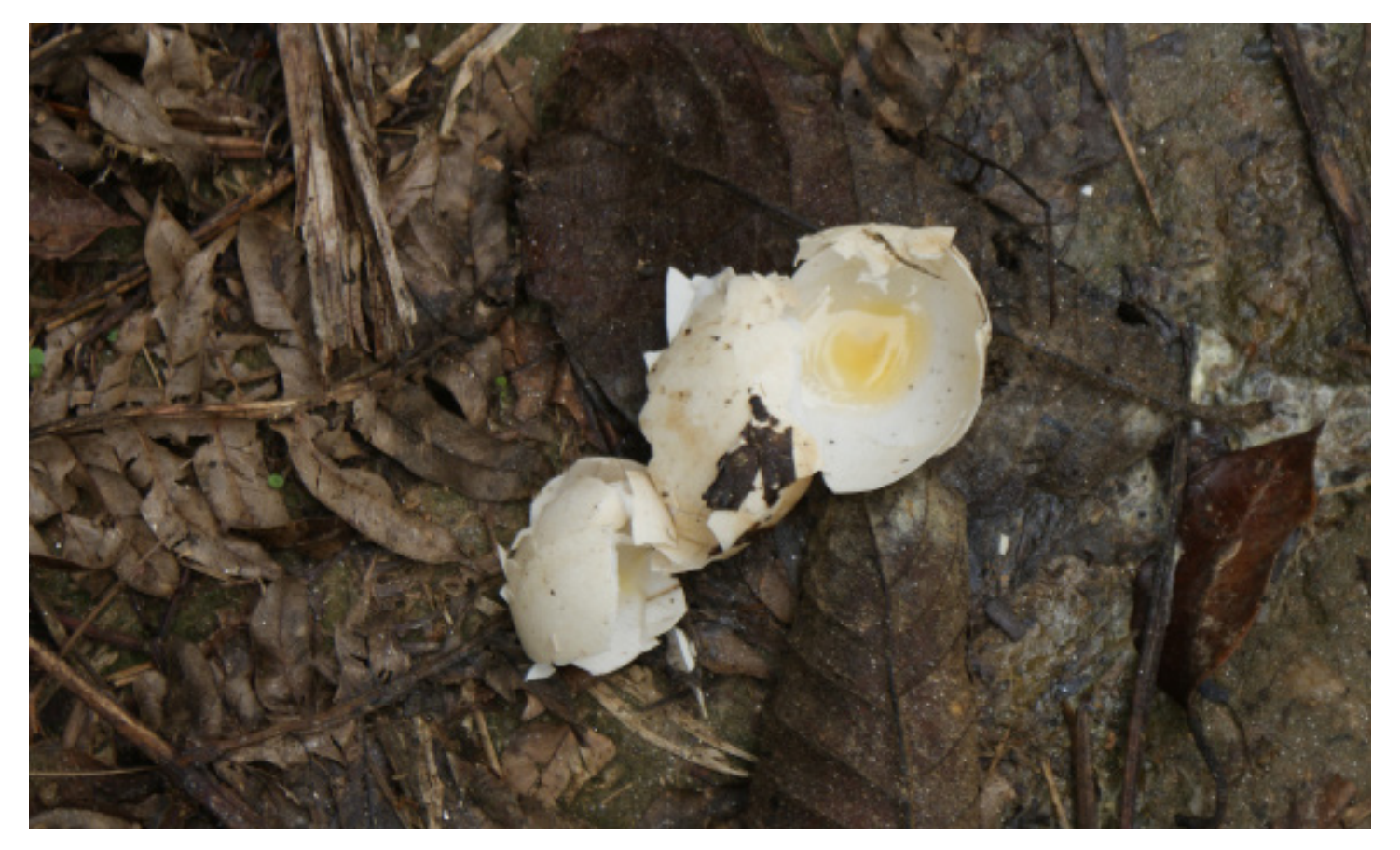
Figure 2. Remains of an egg eaten by a Black Hawk-eagle (Spizaetus tyrannus) in the Reserva Forestal Palmichal, Cordillera de la Costa, Venezuela.

and stains. Based on its size it seemed to belong to Penelope purpurascens or P. argyrotis (Londoño 2014) which were recorded in the area on subsequent days.