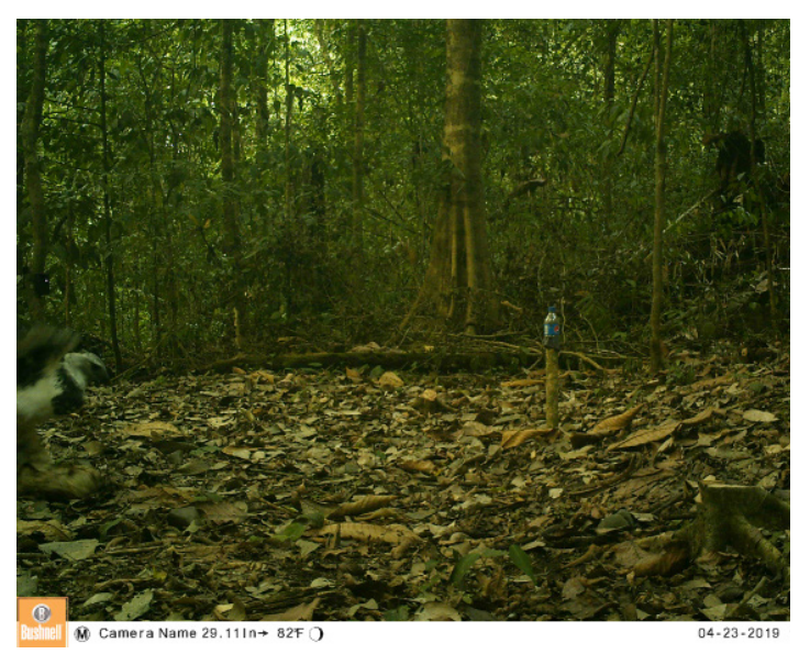
Figure 3 (right). Harpy Eagle, 23 April, 2019. Indigenous territory Pilawas Community, MSBu – Nicaraguan Mosquitia.