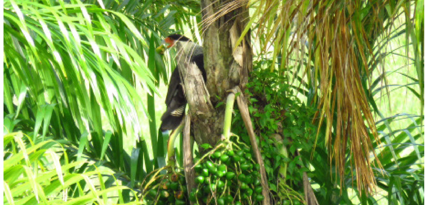
Figure 2. Adult Crested Caracara with a recently picked Peach Palm fruit in the town of La Unión de Venecia, Costa Rica.

back to the fruit cluster to grab a fourth fruit. After eating half the fruit, the caracara dropped it to the ground. The first bird grabbed a fifth fruit and flew with it to the second bird. Both birds consumed the fruit together.