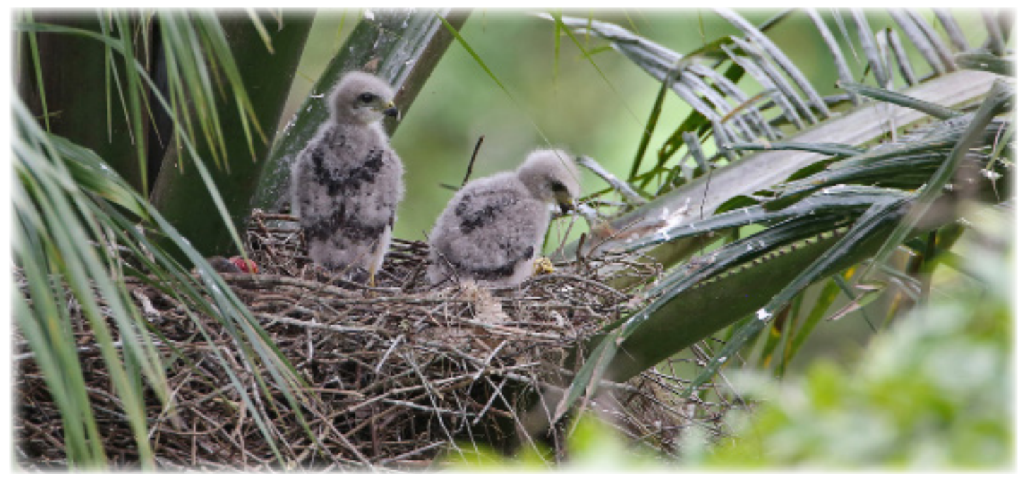
Figure 1. Ridgway's Hawk nestlings in their nest, Dominican Republic.

<sup>1</sup>Fondo Peregrino-República Dominicana, Punta Cana E-mail:<u>gabydiazv22@gmail.com</u>