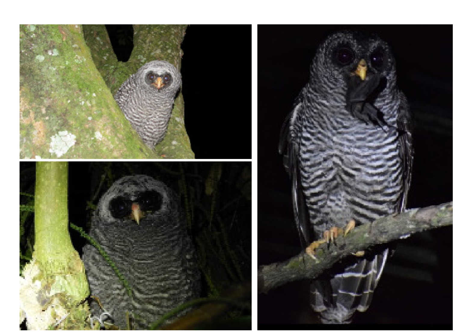
Figure 2 (above, left). Juvenile Ciccaba huhula on 2 June, 2016. Photo © Jorge Muñoz-García. Figure 3 (below, left): Nestling Ciccaba hubula on 31 August 2019. Photo © Jorge Muñoz-García Figure 4 (right): Adult C. huhula on 31 August 2019 carrying a bat (Molossidae) to its young. Photo © Cristian Camilo Castaño Vargas

(Coordinates: N 1 ° 38'04 "; W 75 ° 36 ' 17.2 ". had apparently fallen from a tree to the ground. Elevation: 357 m.a.s.l.). The adult was heard vocalizing insistently during the night. Subsequently, on 2 June, 2019 at 2100 h, in Villa Monica, only 3.9 km away in a straight line, we found a nestling Black-and-white Owl (Figure 2) on the ground and placed it in a tree.