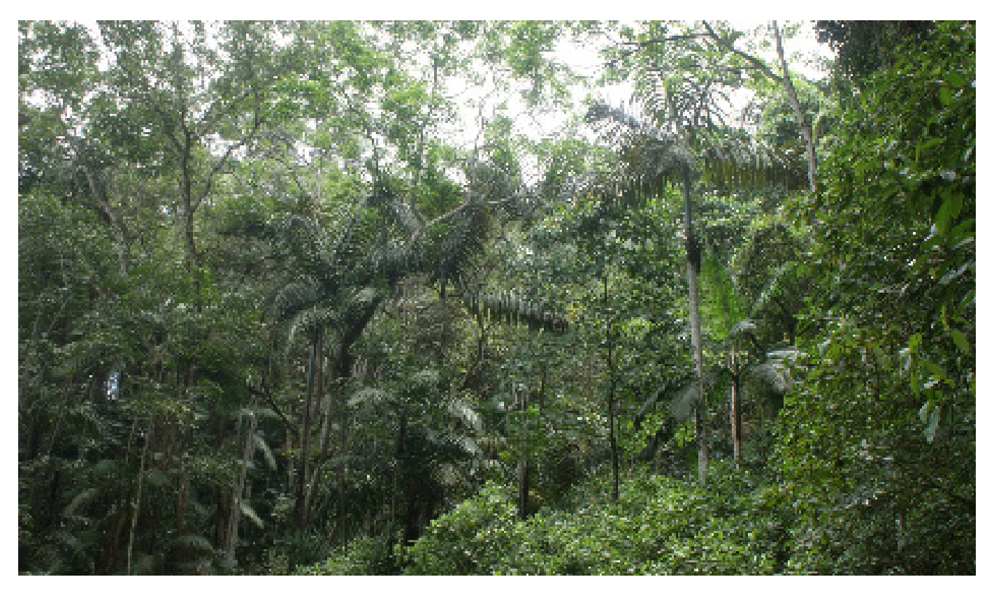
Figure 1. Premontane humid forest of the Reserva Forestal Palmichal, Cordillera de la Costa, Venezuela.

an Important Bird Area (IBA) (Birdlife International 2017). Our observation took place along the dirt road that connects field stations within the reserve. The area is premontane humid forest characterized by a continuous canopy of 20 to 25 m dominated by palm species such as Euterpe precatoria (Palmiche), Socratea karstenii and Dictyocaryum fuscum, and emergent trees of Gyranthera caribensis reaching up 40 m (Buitrón-Jurado and Fernández unpublished data) (Figure 1).