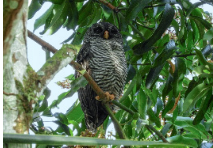
Figure 5. Left: Fledgling Ciccaba huhula. Right: Adult C. huhula on 7 September, 2019

On 31 August, 2019 at 2030 h, we observed the C. huhula young being cared for by both parents. They brought the owlet prey, identified as a bats of the Molossidae family (Figure 3). Initially, one of the adults offered prey to the owlet, which repeatedly pecked it. The adult moved away a couple of times, while still holding on to the prey. It then returned to the perch where the owlet was perched. The young owl finally grabbed the prey with its beak and placed it between its legs to peck at and eat.