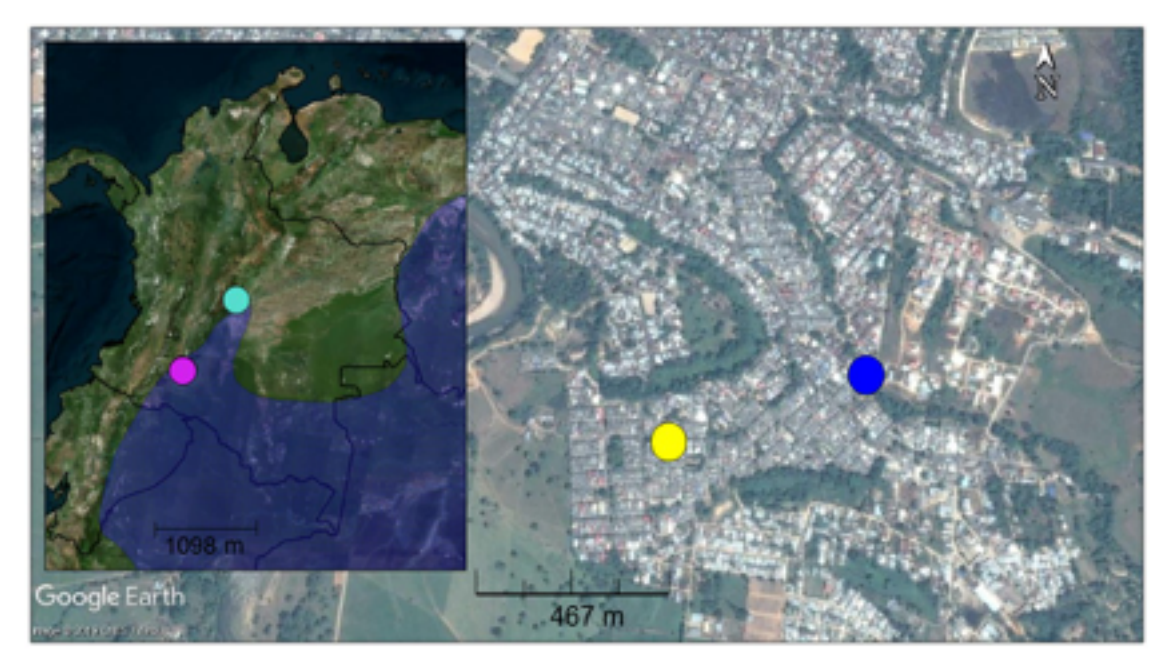
Figure 1. Distribution of Ciccaba huhula and reproduction records in Colombia. Dark blue: Meta. Lilac: Caquetá. Yellow: Yapurá. Blue: Caño el Despeje, Villa Mónica. Taken from BirdLife International (2019).

capital of Caquetá is categorized as a very humid tropical forest life zone. Our study area was located in two peri-urban areas of Florence (Figure 1), as shown below: