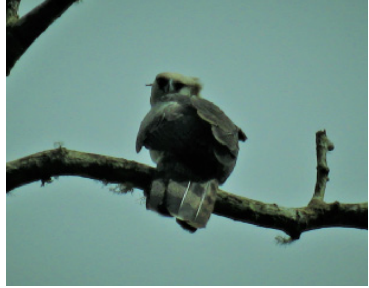
Figure 4 (left) and Figure 5 (right). Harpy Eagle, 2 November, 2009. Banacruz.

ing negative impact on the natural forests of their territories, and is most evident in communities on the banks of the Río Coco channel that constitutes the border between Honduras and Nicaragua.