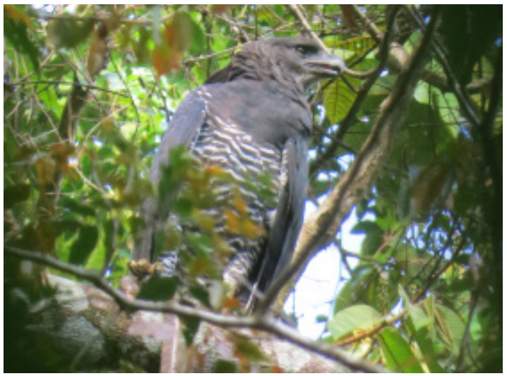
Figure 6 (above left). Crested Eagle, 29 November 2018. Indigenous territory, Ahsawas Community, MSBu – Moskitia Nicaragüense.

Figure 7 (above right) and Figure 8 (below left). Crested Eagles in dark morph and light morph, respectively. Photographed on 26 February, 2017 in the indigenous territory, Puluwas Community, MSBu - Nicaraguan Moskitia.