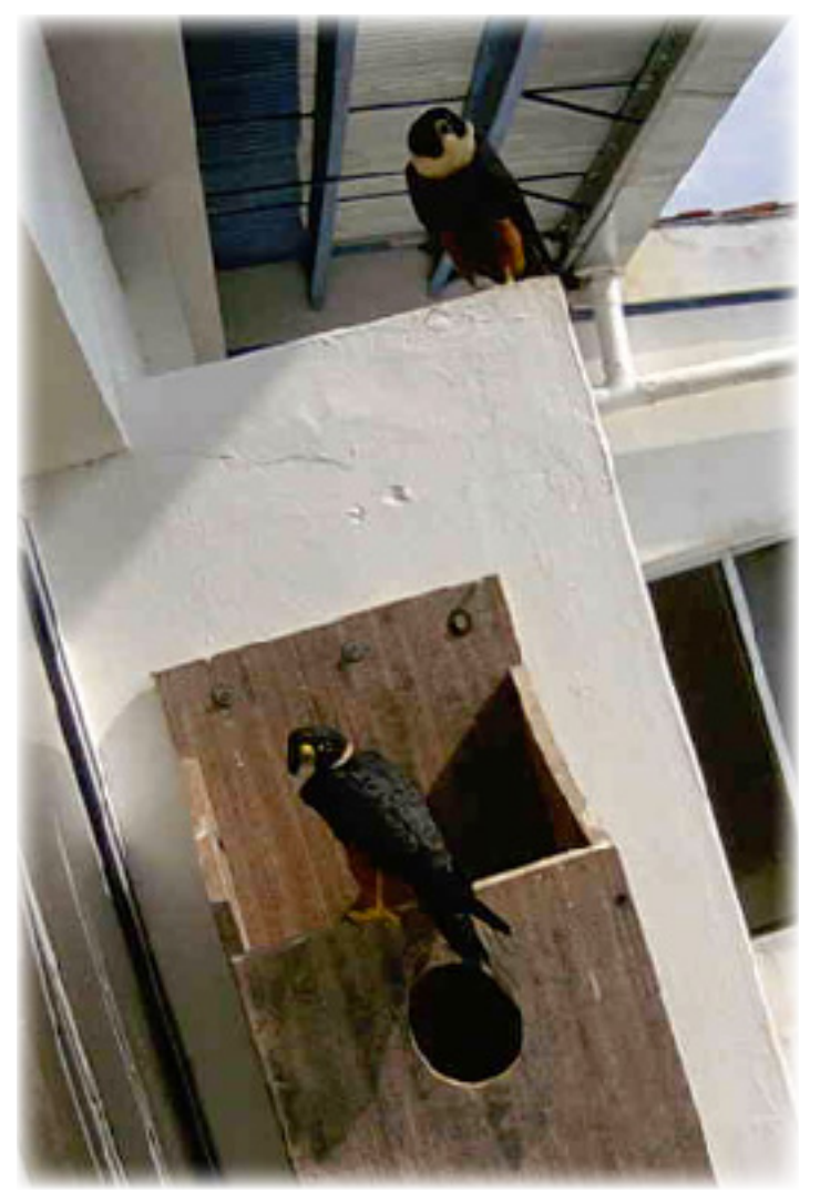
Figura 1. Bat Falcon pair, female (ledge), male(box) using a nest box in Panama City, Panama. (15/04/19)

As part of The Peregrine Fund's American Kestrel Partnership citizen science program, a team of high school students built and installed two kestrel nest boxes on our campus at the International School of Panama, Panama City, Panama. The area around the school includes some for-