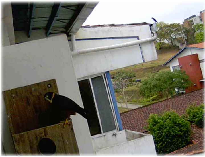
Figura 2 (above, left): 14/04/19 18:58:08 30°C Monitoring the nest box at night