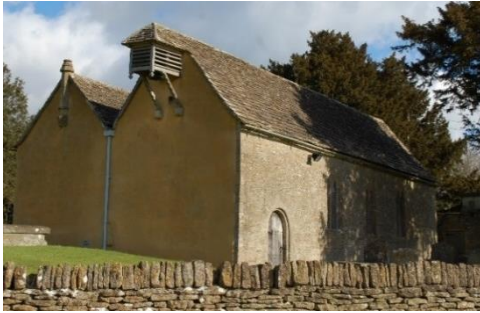
Figure 6. Left, Church of St Michael and All Angels Figure 7. Right, Additional windows

The Church of St Michael and All Angels (grade I listed, see figure 6), to the north of the village on rising ground, is early English in style and dates from the early 13th century. It was restored in the 14 th century and again altered in the 19 th century with the insertion of 2 additional windows (see figure 7). Its early origins are evident in the simple round arch to the south door and the overhanging timber bellcote at the west end (see figure 8).