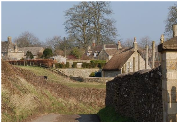
Figures 16 to 19. Buildings surrounding the village green and following the circular road layout