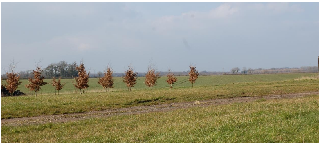
Figure 20. Top, Views looking south from the Church Figure 21. Bottom, Views looking east from The Cottage, Well Lane