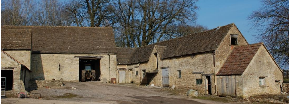
Figure 8. Agricultural buildings in Little Badminton