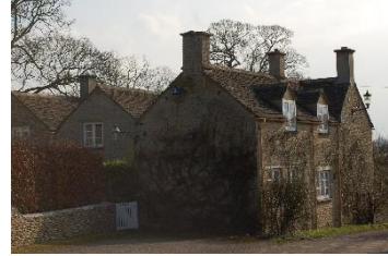
Figures 9 to 14. Various building styles in Little Badminton