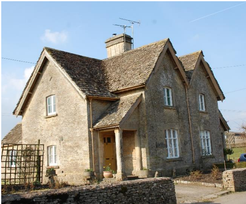
Figure 15. Pair of stone cottages