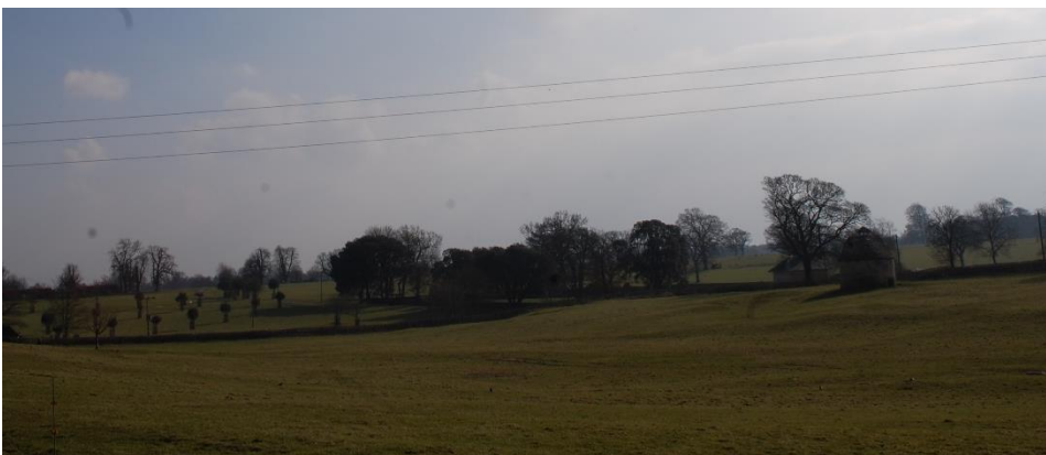
Figure 1. Top left, Views looking west from Buren's Lodge, Well Lane Figure 2. Top right, Views looking North West from the rear of Little Badminton Farm Figure 3. Bottom, Views looking south from the church, Church Lane.