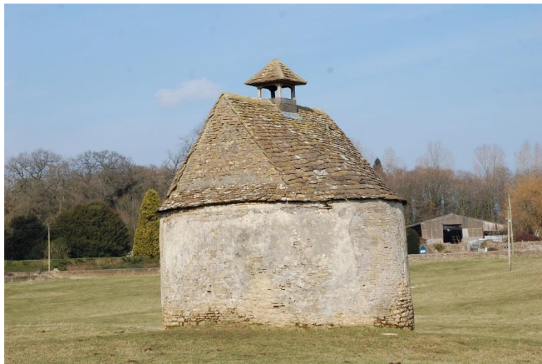
Figure 4. Medieval dovecote

Little Badminton has a rich archaeological heritage which includes the remains of a sunken medieval village and the probable site of a manor house complex with associated farm buildings and garden earthworks. Further evidence of the medieval village is provided by the survival of the medieval dovecote (Grade II* listed, see figure 4), probably the best early dovecote in the country.