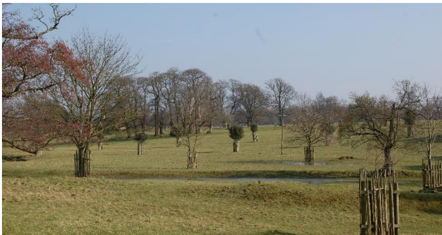
Figure 5. Views across from Well Lane westwards over Badminton Deer Park.

Badminton House (Grade I listed), dating from the 1600s, is the ancestral home of the Duke of Beaufort. Little Badminton appears to have been replanned as a result of one of the periodic extensions to Badminton Park. In medieval times the park (See figure 5) would have been used for hunting deer and hare as well as the raising of horses. Deer are still raised in the park although the Deer House (Grade II* listed), situated to the south east of Little Badminton, is now converted into a dwelling.