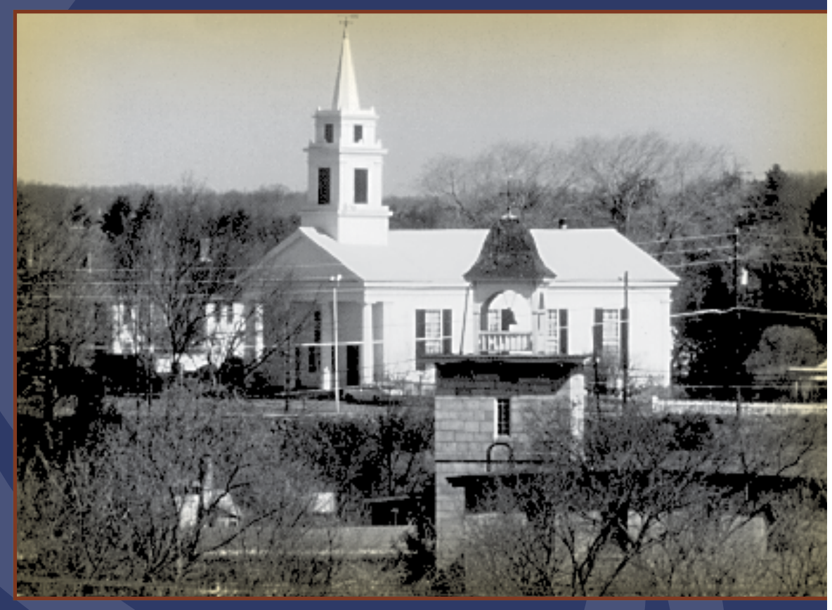
Slatersville Congregational Church and Mill. Photo courtesy of the Blackstone Valley Tourism Council. Postcards courtesy of Ray Auclair. Photo of John Slater courtesy of the Rhode Island Historical Society.