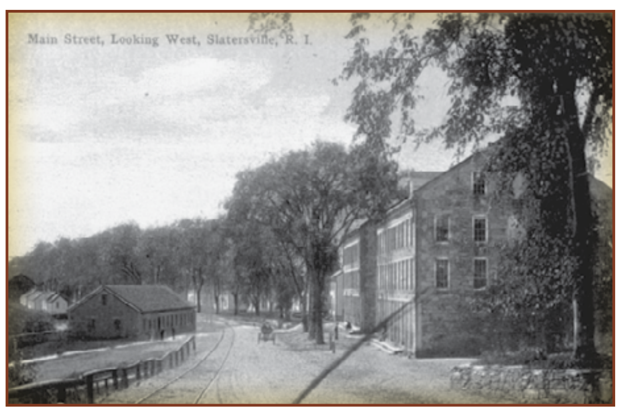
Main Street Slatersville during the 1890s. To the right are the Commercial Blocks, to the left is part of the Western Mills, including the library. Notice also the tracks in the street. They were for the horse drawn street cars that connected Slatersville with the other villages nearby.