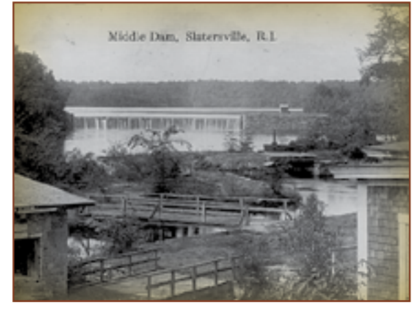
Slatersville Middle Dam, c. 1900. In the foreground is part of the Western Mill complex, along with the system of canals that powered it.

end of the parking lot towards the river. From here you can see two waterfalls. The larger dam, known as the Middle Dam, was built in 1849. It is 300 feet long, and causes a twentyfoot drop. Behind the dam is the 170 acre Lower Slatersville Reservoir. The smaller dam was built later to increase the water power. The sluice gate here controlled the amount of water flowing into the raceway that powered the Slatersville Mill.