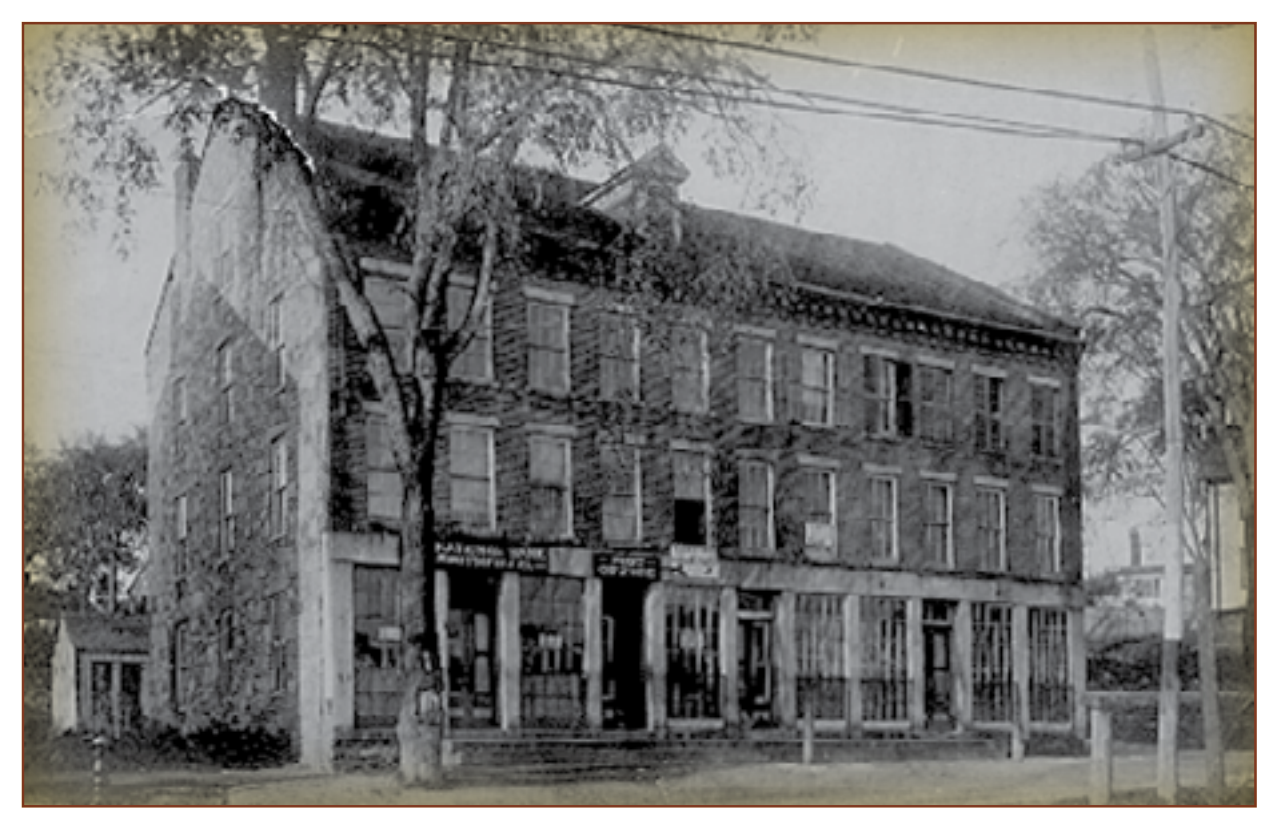
The First Commercial Block (1850) as it appeared at the turn of the century. At that time it housed a bank, the post office, a cobbler, and a general store.