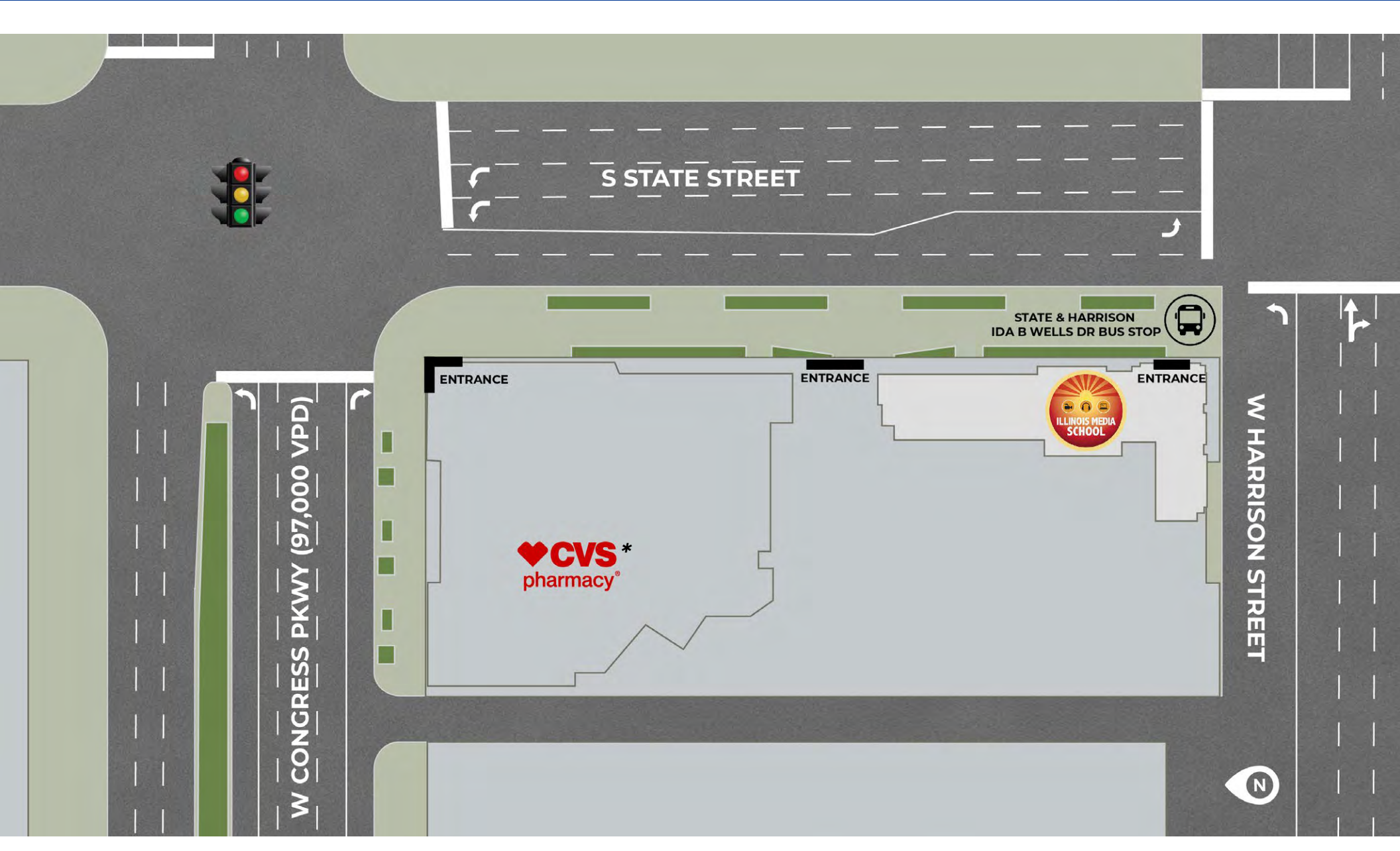
* Adjacent retail condominium available