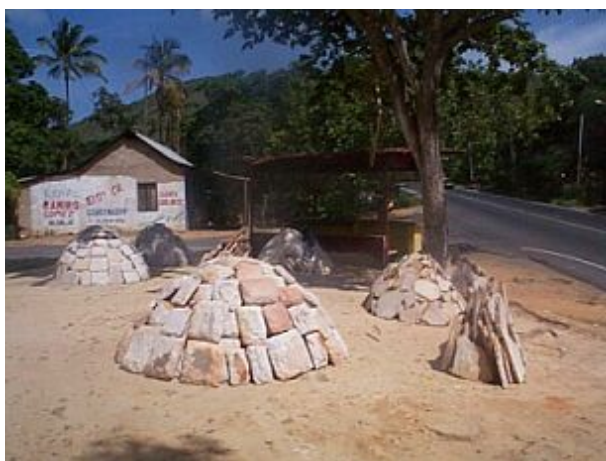
The selling of slabs used for decoration is considered a serious threat because of potential landscape alteration and increased erosion.

Along the roadway to Cumaná, inhabitants sell pieces of rock in slab or tile shape that are illegally extracted from the park. Rock slabs are in high demand for house construction and decoration throughout Venezuela; their price varies between 3,500 and 10,000 Bs. (US $2 to 6) per square meter. Tiles are obtained by chiseling sandstone and limestone formations that emerge all around the park, deforming the landscape and increasing erosion and the risk of landslides. Extraction and commercial sale of slabs is a relatively recent activity. The inhabitants of towns that extract slabs used to dedicate themselves to the production and sale of handicrafts, an activity that has decreased a great deal in the area.