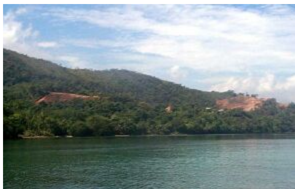
View of preliminary work for highway construction.

The construction of the second stretch of the Antonio José de Sucre Highway will begin soon. It will cross the national park parallel to the current roadway, separated in some places by 15 km. The stretch will be 7.37 km long and 100 m wide, and will connect the town of Santa Fé at the western limit of the park with that of Yaguaracual, located in a special use zone (Técnica Ambiental 2002).