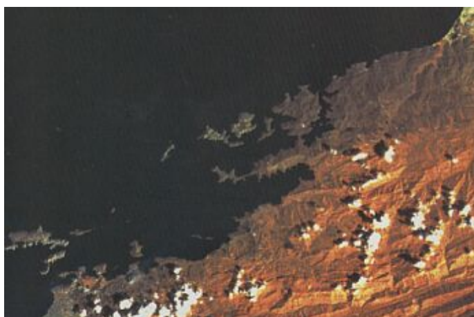
Mochima National Park satellite image (PDVSA 1992).

Mochima National Park is located to the north of the Turimiquire Massif in the Eastern Mountain Range and is characterized by very steep terrain and closed valleys (PDVSA 1992, Técnica Ambiental 2002). The park is made up of mainly Mesozoic and Cenozoic sedimentary rocks, in the form of sandstone, limestone, and lute (Sánchez and González 2002). Emergent limestone is found toward the coast, a characteristic of coasts created by immersion (Técnica Ambiental 2002). The milky blue color of Mochima Bay waters is probably due to dilution of minerals from these outcrops (pers. obs.).