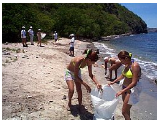
Clean-up activities during "World Beach Day".

Together with INPARQUES, Petrolera Ameriven promotes a project aimed towards solving educational and employment problems in the region. From 2003 on, Ameriven will finance the creation of youth brigades and the creation of a plant nursery in the schools inside the park. It will also finance the creation of a carpentry shop to make the park's signs and generate jobs for park inhabitants.