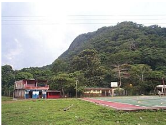
Irregular settlement expansion has caused damage to the park's natural and scenic resources.

Mochima is located between the two centers of industrial and tourist development of the country's eastern region. This promotes uncontrolled population growth that is easier still because of the lack of regulation. The State of Sucre is one of the most economically depressed in the country (Técnica Ambiental 2002); this motivates settlers from outside of the park to move their households toward areas with more tourism and commercial activity. Mochima's management plan was finished 18 years after the park was created, when rampant growth had already destroyed many natural areas and had caused serious impacts on the landscape and natural resources.