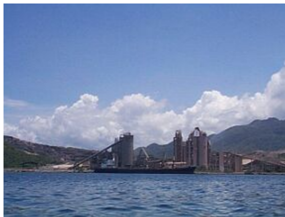
From Pozuelo Bay you can see the Pertigalete cement factory's installations.

Close to the marine zone west of the park, there are many companies located in the Guanta-Pertigalete industrial complex. A cement factory and a port are probably two of the largest, though there are also tuna fishing industries. Even though the latter work outside the park's marine limits, they enter illegally on occasion. Wastewater from these industries and cities is generally dumped untreated into the park's marine zone.