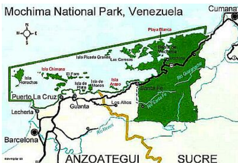
Mochima National Park Map

The Continental Zone includes the northern mountainous area of the Western Mountain Range and contains a large part of the Neverí River watershed. The southern limit of this watershed and of the Turimiquire Dam are in the southeastern area of the park. Wet montane forests and cloud forests in the higher regions dominate this zone. Forests are secondary or have suffered intervention from agricultural practices due to their proximity to towns. The roadway that goes to Cumaná separates the coastal marine and mountainous zones.