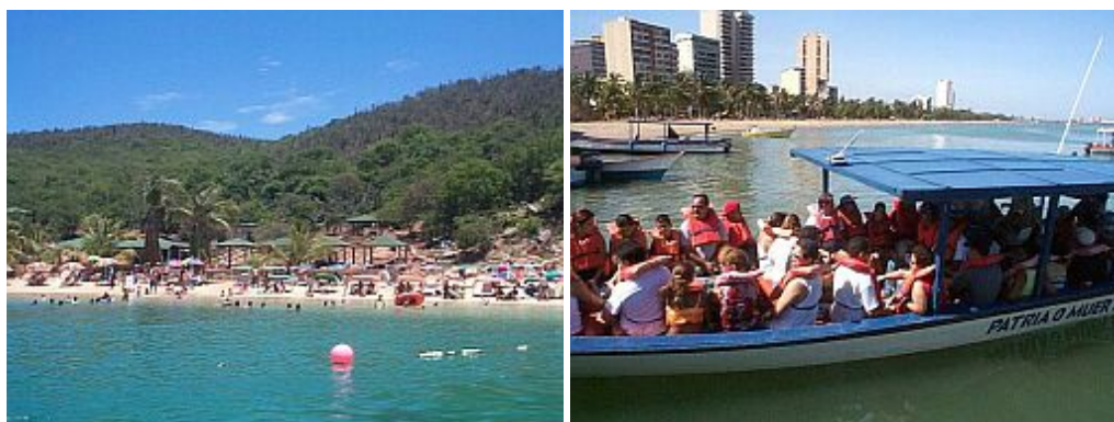
The number of tourists that visit park beaches is very high, however they leave no economic benefit to solve the problems caused.

Mochima has great attractions for tourism. There are calm, clear water beaches that are ideal for swimming along the park's entire coast. There are also a number of islands and reefs off the coast that are excellent places to fish and scuba dive. Every weekend thousands of people visit the beaches. Most of these people come from nearby cities: Cumaná, Puerto La Cruz, and Barcelona. On school breaks, however, tourists from Caracas, other parts of the country and even foreigners visit these beaches. All beaches are in recreational zones accessible from Mochima Town (the beaches of Maritas, Blanca, Gabarra, Manare, Cautaro, Cautarito, Taguaramo and La Canoa), Santa Fé Town (Cochaima Beach, Arapo Island, Caracas Islands, La Piscina), Puerto La Cruz (El Saco, Puinare, El Faro and Arapo), and Guanta Port (Isla de Plata, Monos Island, Arapo, among others). The price for the boat trip varies but it is on average 20,000 Bs (US $ 15). All towns in the area have restaurants and hotels, and it is also possible to campout on the beaches. Even though the beaches are very calm during the week, they turn into noisy tourist sites on the weekends. There are no official records, but probably over 500,000 people visit the park every year which generate over seven million dollars of income per year for the region.