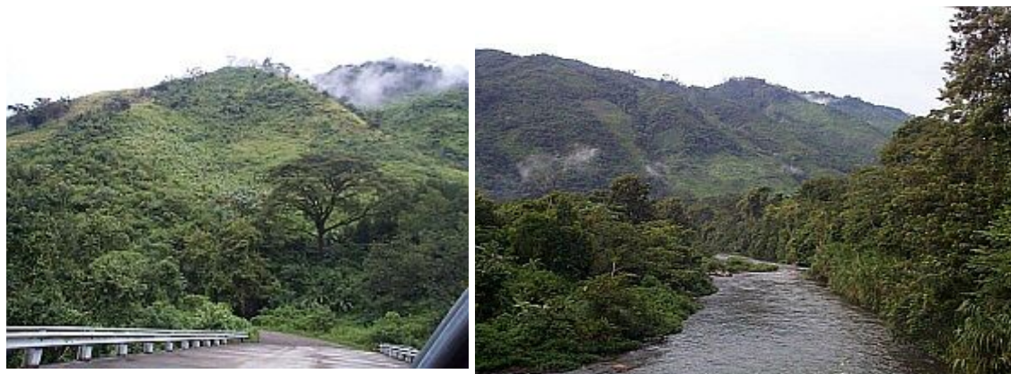
Uncontrolled farming activities generate problems such as deforestation and forest fires.

The study reported 42 species frequently hunted in the Turimiquire Dam surroundings, 17 of which are used for food (mammals and large birds), two species (ocelot and puma) are hunted for illegal sport and the remaining 23 are bird species (psittacids and passeriforms) whose use was reported as "customary" (pets), which could also cover commercial use through sale (González-Fernández 2002). Studies to determine wildlife use in the rest of the park are necessary. The mountainous zone is good for agriculture because of its favorable climate and the quality of its soils. From the roadway that leads to the dam, there are many shifting plantations that break up the mountain forests. The zone's main crops are yucca, okume, and yam; these are sold every Saturday in a free market near the dam. INPARQUES has no control over farmers, even though they generate problems such as deforestation and forest fires.