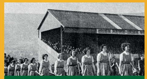
The old stand at Corrigan Park forms the backdrop as Antrim and Galway parade before the 1946 All Ireland Final which Antrim won by 4-2 to 2-3 to complete the second of their 3-in-a-row