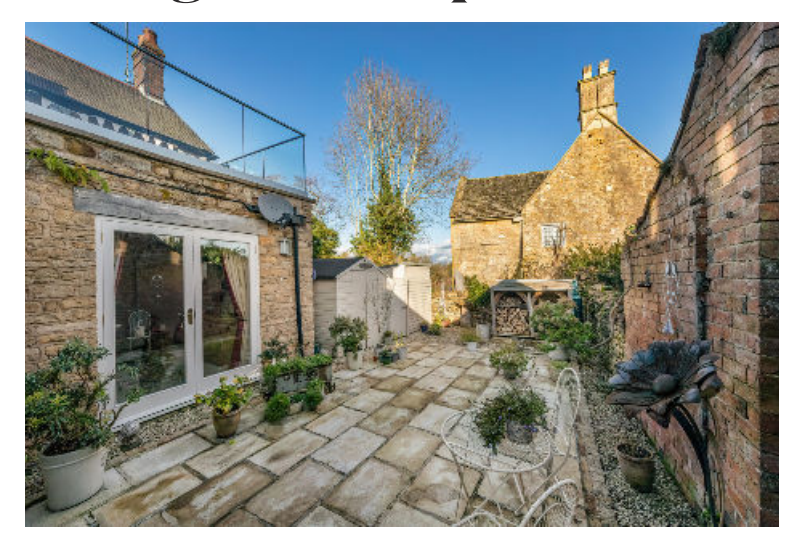
Shipston-on-Stour 4 miles, Moreton-in-Marsh 7 miles, Chipping Norton 8 miles, Banbury 12 miles, Stratford-upon-Avon 15 miles, Oxford 28 miles. Trains from Banbury (54 minutes to Marylebone) Trains from Moreton (90 mins to Paddington)