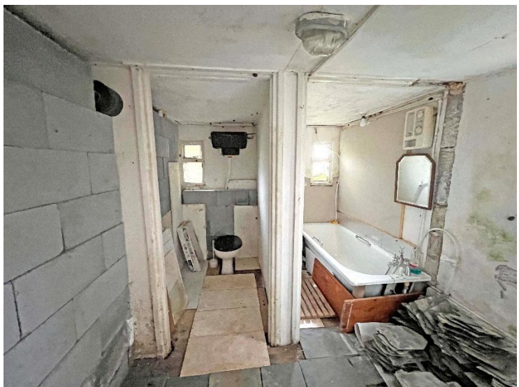
BATHROOM – 9'3" x 7'9" Three small obscured windows, white bath with chrome mixer tap and handheld shower. White wc.