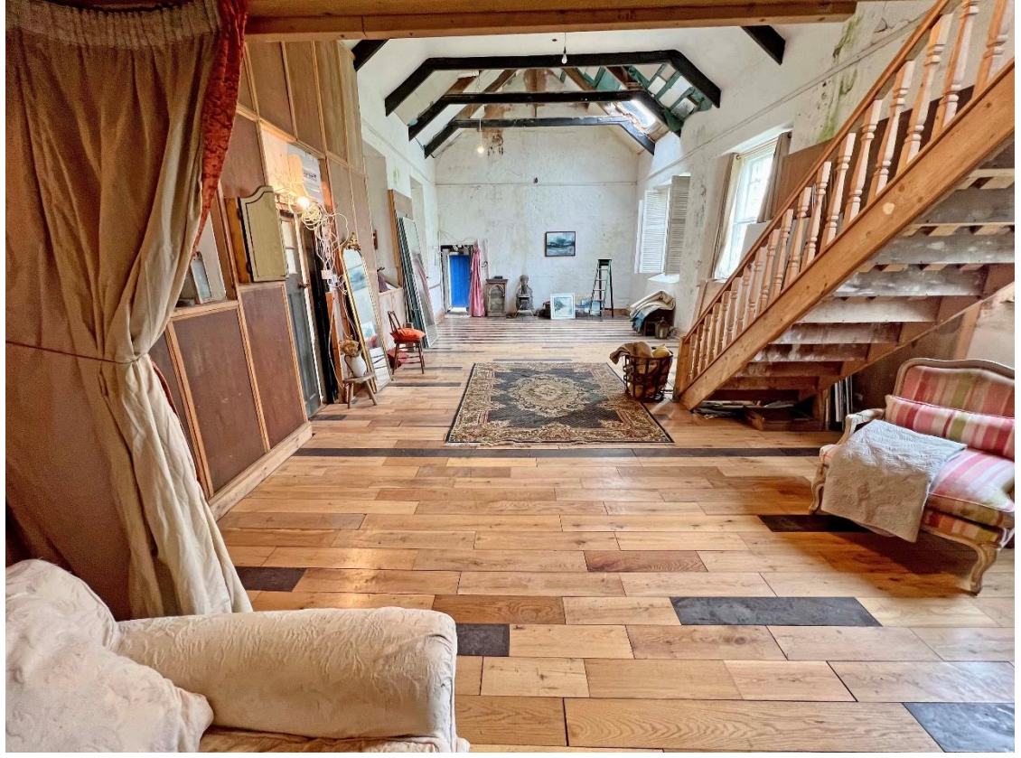
MEZZANINE – 16'7" x 10'5". Overlooking the majority of the main room with most of this space being contained within a glass walled area lit by conservation rooflights. Door from main room to:-