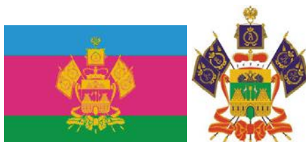
Figure 3. Flag and coat of arms of Krasnodar Krai

Krasnodar Krai was founded on September 13 th , 1937, when the then Azov-Chernomor Krai was divided into Krasnodar and Rostov oblast (its capital being Rostov on Don), and today it belongs to the South Federal Okrug and to North-Caucasian Economic Region. It belongs to the Moscow time zone.