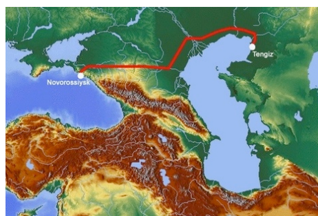
Figure 7. Oil pipeline “Tengiz-Novorossiysk”

Turkish 1997 agreement and its commercial exploitation started in 2003. The initial volume of the gas pipeline was 16 billion m 3 , and it is planned to increase up to 32 billion m 3 . The “Blue Stream” is a project that has beaten many records while having a strong impact on the gas industry development. In 2013, it transported 13.7 billion m 3 of gas to Turkey. Russia and Turkey have reached an agreement in principle to increase its capacity up to 19 billion. The Turkish authorities have expressed readiness to consider the possibility of the “South Stream” passing through Turkey, which would change radically the position of some countries, especially Bulgaria, in regards to the growing problem related to the construction of this gas pipeline. These facts are certainly of great interest and importance for Serbia, whose participation in this project is rather uncertain.