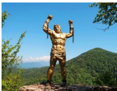
Figure 9. Prometheus statue in the Orlinye Rocks Reserve

as archeological sites (dolmens, giant stone graves in the North Caucasus estimated to date back 5,000 years ago, which were discovered by the Russian academician P. S. Palas in 1793). Some contemporary buildings are also worth mentioning, such as the Malaya Zemlya Memorial Complex in Novorossiysk. Tourists should not miss seeing some natural tourist attractions: Agur Waterfalls, Vorontsovskaya Cave, Prometheus statue in Orlinye Rocks, place where Prometheus was chained according to the legend, and the Museum of Caucasian Flora and Fauna. The Prometheus statue (Figure 9) was erected in 1998 by the Omsk sculptor Kapralov. It is located in the Orlinye Rocks (White Rocks) Reserve, close to the Agur Waterfalls in the Khostinsky region.