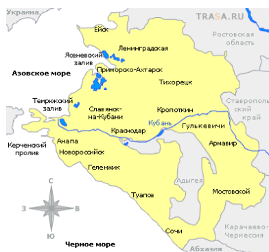
Figure 5: Krasnodar Krai and the Kuban river

More than a half of the total area is mainly flat, dominated by Kuban-Azov Plain, Prikuban Plain and the Kuban river delta. Kuban-Azov Plain is a low alluvial plain with extensive occasionally flooded valleys lying in between the Kuban, the Sea of Azov and the northern borders of the Krai. It descends towards the northwest, with its altitude gradually lowering from 156 m in the Kropotkin region to 0 m on the coast of the Sea of Azov. The Prikuban Plain is terraced and split by deep valleys of the Kuban left tributaries and includes some very pronounced terraces as high as 200 m and also deep uvalas. The Kuban river delta has numerous branches, with low ridges, dune slacks, river confluences and plavni dominating its relief.