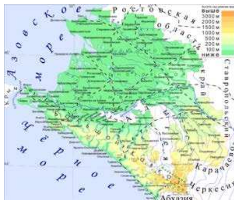
Figure 4. Krasnodar Krai

geographic latitude (46° 11' N to 41° 51' N), this area is a bit north, spreading from the geographic latitude of the Serbian city Nis (43° 19' N) to the north borders of Serbia. The Krai borders the Rostov Oblast to the north and northeast, Stavropol to the east, the Karachay-Cherkess Republic to the southeast and Abkhazia and Georgia to the south. The Republic of Adygea is situated within the territory of the Krasnodar Krai. Kerchensky Strait separates the Krai from the Crimean Peninsula and the Republic of Crimea. To the northwest the Krai is bordered by the Sea of Azov and to the southwest by the Black Sea. The territorial integrity of the Krasnodar Krai was violated in 1991, when the Republic of Adygea, until then an autonomous oblast within the Krai with the total area of 7,792 km 2 , separated and declared independence from the Krasnodar Krai. Krasnodar Krai covers a total of 75,485 km 2 , spanning at the longest point 370 km in direction north-south and 375 km west-east. The size of its territory is comparable to that of European countries such as Czech Republic (78,866 km 2 ), Austria (83,871 km 2 ), Republic of Ireland (70,273 km 2 ), and somewhat smaller than Serbia (88,502 km 2 ) 3 . Out of the Krai's total border length (1,540 km), 740 km are maritime boundaries.