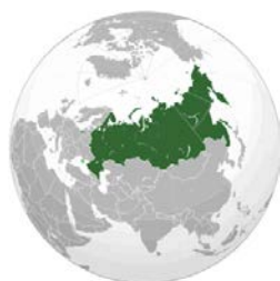
Figure 1. Russian Federation, orthographic projection

Russia is a complex entity, composed of not only republics but also other types of federal units, which all have a common denomination: federal subjects. The subjects of the contemporary Russian Federation were formed in the times of RSFSR. When the current Constitution was adopted in 1993, it defined 89 subjects. Subsequently, a series of transformations and name changes occurred, so after some regions unified on March 1 st , 2008, there was left a total of 83 subjects. Following the incorporation of Crimea referendum held on March 18 th 2014, the number of federal subjects increased to 85 (Figure 2).