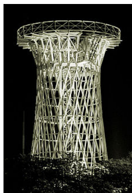
Figure 6: Shukovskaya Tower in Krasnodar

is two times lower than the average and amounts to 16% (in comparison to 33% in Russian Federation and 23% in the South Federal Okrug). The structure of Serbian GDP 8 is significantly different: the process industry accounts for 18.1%, agriculture, forestry and fishery for 9% each, while transportation and storage only account for 4.6% of the total each.