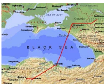
Figure 8: “Blue Stream” gas pipeline

number of architectural monuments, hectares of vineyards, among other factors. The Taman Peninsula resorts, such as Veselovka, Taman, Kuchuguri, Golubitskaya and Temryuk are uniquely situated between two seas, the Black Sea and the Sea of Azov. Serbia does not have comparable potential for tourism development, but it does have other attractive features, such as historical monuments. Therefore, the current position of tourism within its economy (only 1.4% of its Gross Value Added) is quite poor. Considering the cultural proximity of the two peoples, these destinations should be present in the Serbian tourist offer in Russian and specifically Krasnodar market.