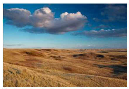
Missouri Coteau, Saskatchewan

Southern Saskatchewan's Missouri Coteau is a land so rugged that fugitives, horse thieves, and rum runners went there to evade the law during the late 1800s and early 1900s. Nowadays, the area is free of outlaws but teeming with birds and other wildlife.