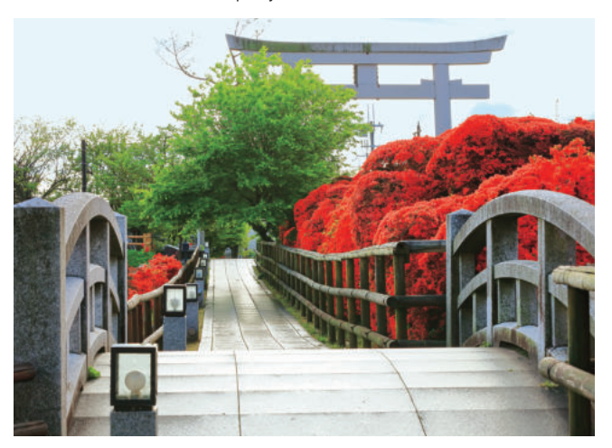
Asahi Beer Oyamazaki Villa Museum of Art MAP 12

This shrine is dedicated to the god of learning, Sugawara no Michizane. In addition to shrine events, the Kirishima azaleas, plum trees, and other seasonal flowers create a pretty scene for all who visit.