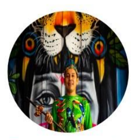
Tourism - Caquetá