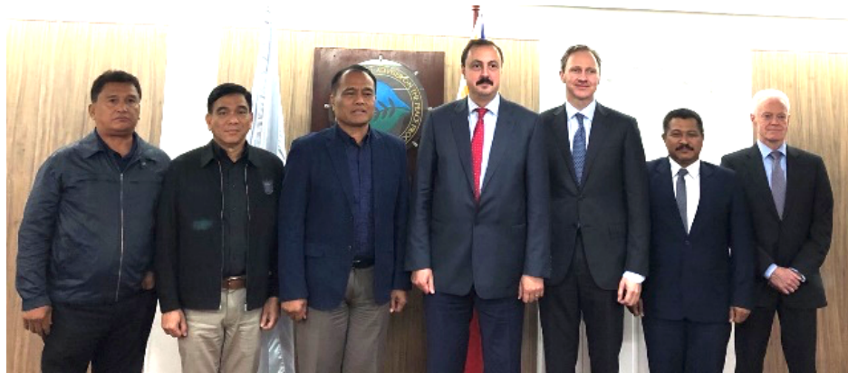
GPH Implementing Panel Meeting with the IDB. 05 December 2019, Ortigas.