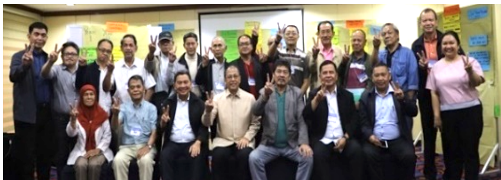
GPH-MNLF Peace Coordinating Committee (for the Jikiri Group) Visioning and Strategic Planning Workshop. 03-04 December 2019.

The aforementioned activity resulted to a plan / roadmap for the MNLF combatants, their families and communities in the next three (3) years. The GPH and MNLF-Jikiri Peace Coordinating Committee agreed on the following next steps: