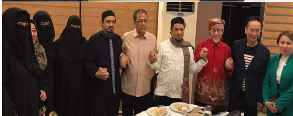
2 nd GPH-MNLF Peace Coordinating Committee meeting with President Rodrigo Roa Duterte. 13 December 2019. Matina Enclaves, Davao City.