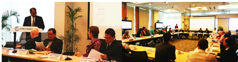
RTD on BNTF. 11 October 2019, Taguig City. The World Bank facilitated the discussions with the diplomatic community, with the participation of the GPH and MILF Implementing Panels.

The RTD on the BNTF with Development Partners enabled the OPAPP to ascertain the interest of the international partners to support the BNTF. This is one of the requirements of the Department of Finance (DOF) to facilitate the request for Special Presidential Authority (SPA) for the OPAPP for the signing of the memorandum of understanding (MOU) with the World Bank for the establishment and operationalization of the BNTF. The other two requirements are the availability of a monitoring mechanism and a draft MOU.