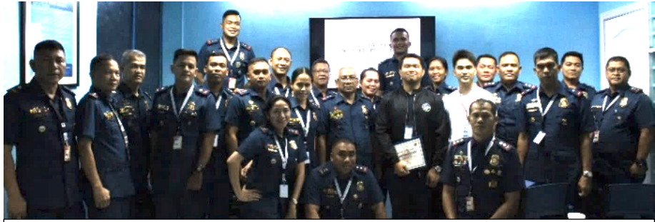
Briefing on the Peace Process with PNP officers and staff. 02 October 2019, Camp Crame, Quezon City.