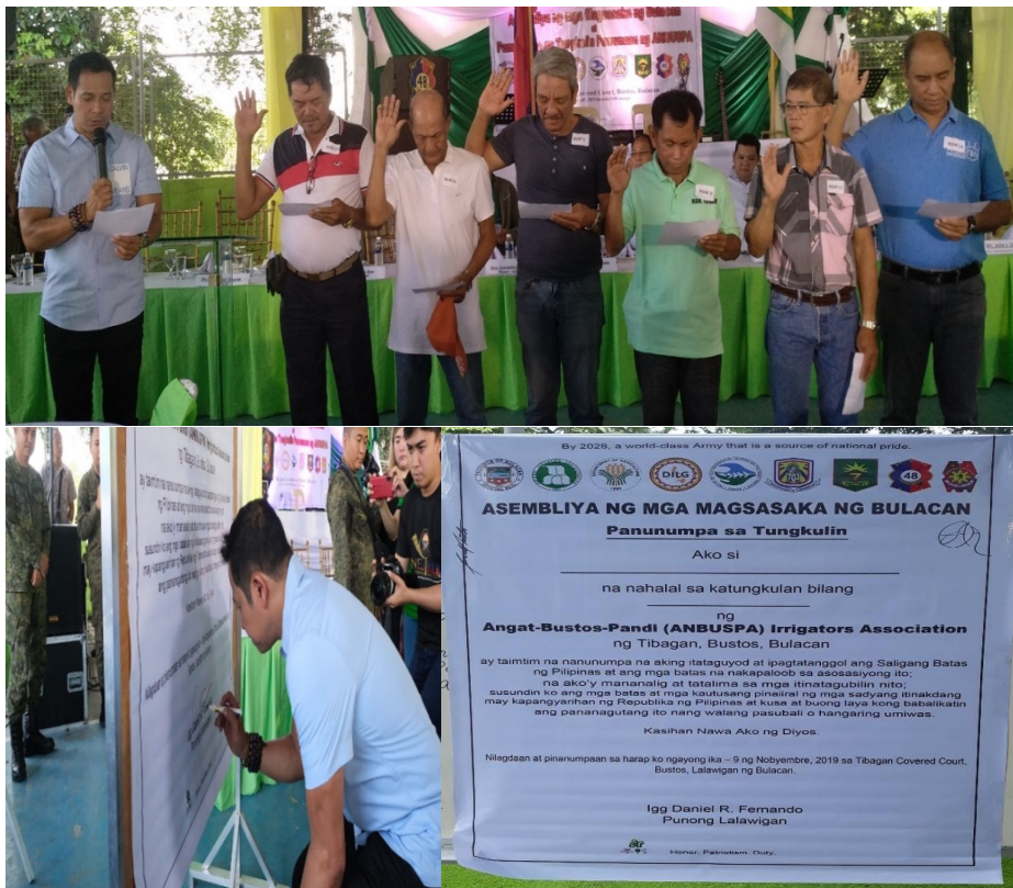
CORDS3 Follow-through Peace Consultative Meeting, 9 November 2019 in Bustos, Bulacan.

e. Peacebuilding activities undertaken in partnership with the 7ID supporting CORDS3 in the implementation of EO 70/LPE work. OPAPP, in partnership with the 7ID, provided technical assistance and facilitated the logistical requirements for the following activities: