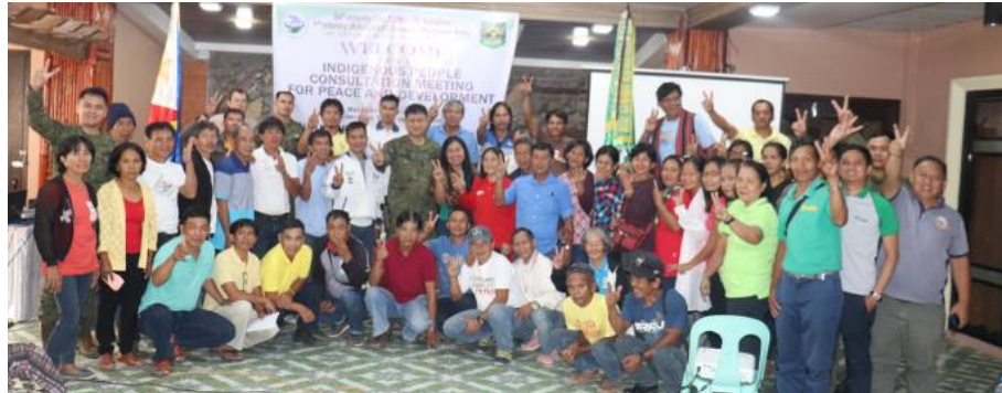
Indigenous Peoples Consultation Meeting for Peace and Development. San Jose City, Nueva Ecija. 28-29 November 2019.