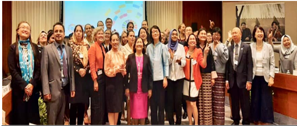
Asia Pacific Ministerial Conference on the Beijing+25 Review. Bangkok, Thailand, 27-29 November 2019.