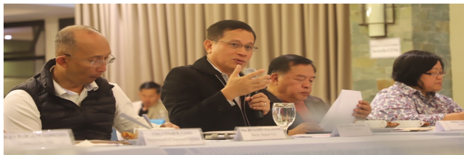
OPAPP convenes the JEMC Meeting, attended by Baguio City Mayor Benjamin Magalong.