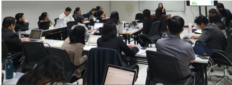
Briefing on the Peace Process for Foreign Service Officers (FSOs) 21 November 2019, DFA, Pasay City.