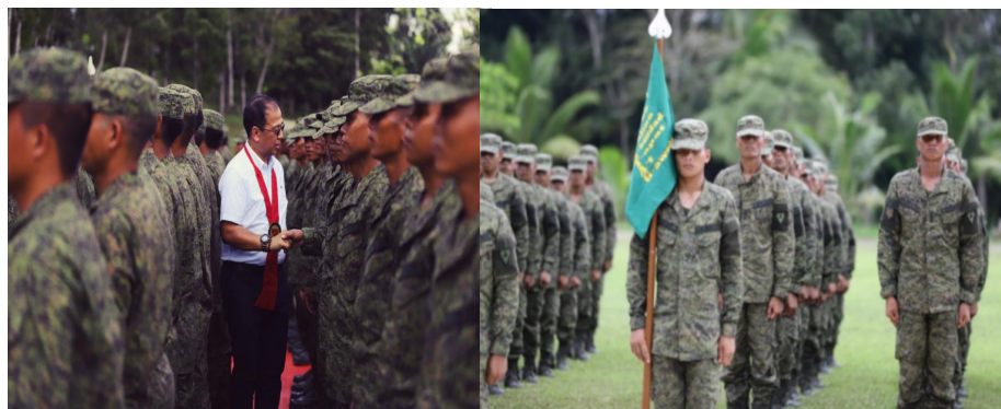
Members of Kapatiran (CPP-NPA rejectionist group) complete their 45-day Community Defense Unit (CDU) training.

On 5 November 2019, the CDU candidates graduated from their 45-day training. The graduates were integrated into the AFP Reserve Force and were eventually deployed to the settlement sites in Tanjay in Negros Oriental, Maasin in Iloilo, Ibajay in Aklan and in Kabankalan, San Carlos, Cadiz, Cauayan, all in Negros Occidental. Aside from the financial assistance received by the candidates from DSWD through their Assistance to Individuals in Crisis Situations (AICS) program, each CDU candidate was provided with food assistance and cash incentive upon their deployment.