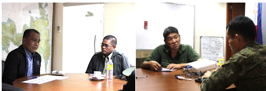
1 st Coordination Meeting on the disposal of firearms and ammunition. 25 October 2019, Ortigas.