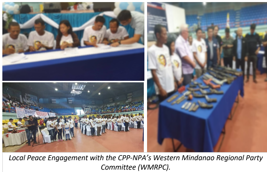
Local Peace Engagement with the CPP-NPA's Western Mindanao Regional Party Committee (WMRPC).

In Mindanao, the conduct of LPEs has resulted in the mass surrender of members of the CPP-NPA Southern, Northeastern, and Western Mindanao Regional Party Committees operating in Regions IX, X, XI and CARAGA. Moreover, LPEs have enabled the parties to utilize non-traditional measures in convincing members of the rebel group to give up armed struggle and return to mainstream society as peaceful and productive civilians.