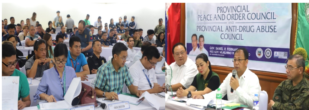
Bulacan Peace and Order Council / Provincial Task Force (ELCAC) Meeting.