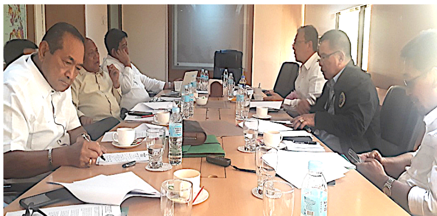
GPH Peace Coordinating Committee meeting. 18 December 2019.

The GPH committee agreed that the terms of reference of the joint coordinating committee including meeting guidelines/protocols should be formulated and approved. The Chair of the GPH Coordinating Committee instructed the Secretariat to prepare the necessary documents for approval of the committee. The Chair also instructed the Legal Office to draft the response to the position paper of Chair Misuari submitted during the 13 December meeting. The GPH coordinating committee further agreed to meet regularly and appraise each other on the developments in the MNLF peace process.