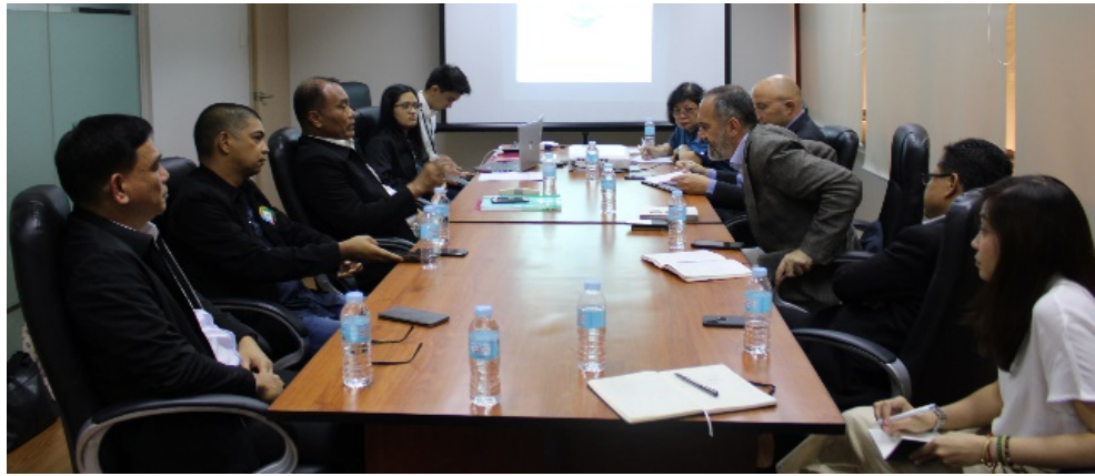
GPH Implementing Panel Meeting with the TPMT. 25 November 2019, Ortigas.