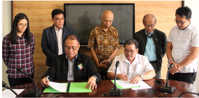
23 rd Meeting of the GPH and MILF Implementing Panels. 10 December 2019, Cotabato City. The GPH and MILF Implementing Panels sign the joint letter for the JNC.

issues raised. The Parties also agreed to form a technical working group to review the mandate of the International Monitoring Team (IMT).