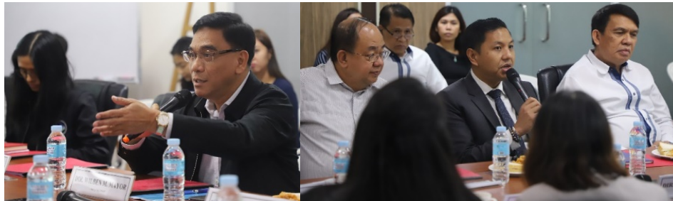
IGRB Secretariat Meeting. 26 November 2019, Ortigas Center, Pasig City.