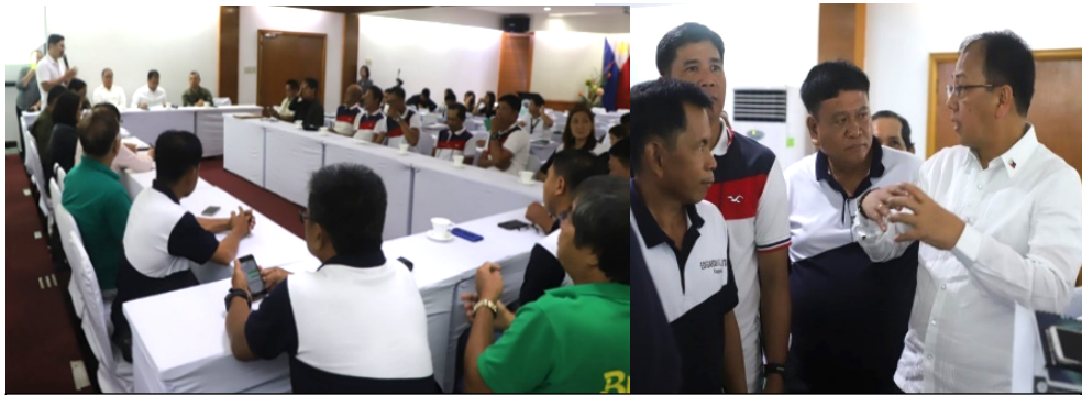
Consultative meeting with members of ANBUSPA Irrigators Association.