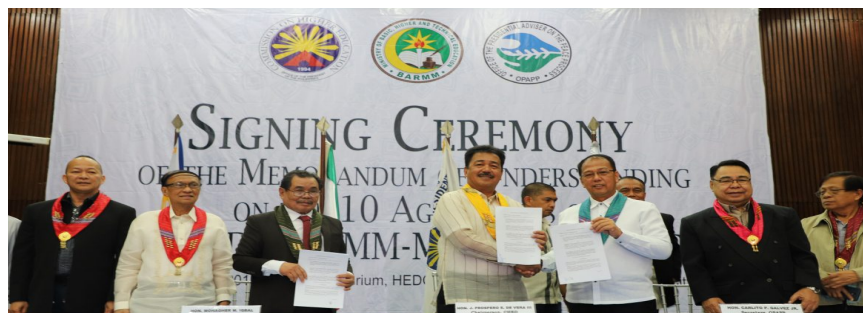
MOA Signing between CHED, MBTHE-BARMM and OPAPP. 30 October 2019, Diliman, Quezon City.

30 October 2019 | Diliman, Quezon City. This is for the 10 agreements in the implementation of the Higher Education in the Context of the Bangsamoro Organic Law (HECBOL) Project. One of the ten agreements/ objectives of the HECBOL is to determine areas to extend technical assistance to the MBHTE-BARMM in relation to BARMM Higher Education Institutions.