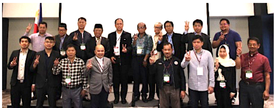
Learning Session on the Bangsamoro Internal Revenue Code. Members of the BTA with Presidential Adviser, Sec. Carlito G. Galvez, Jr. 28-29 October 2019, Davao City

Presidential Peace Adviser Carlito G. Galvez, Jr. highlighted the importance of a sound fiscal policy in enhancing the Bangsamoro region's economic potential.