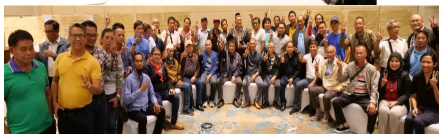
Orientation-workshop with MILF Commanders on priority areas for interventions by the Joint Normalization Committee. 09 December 2019,