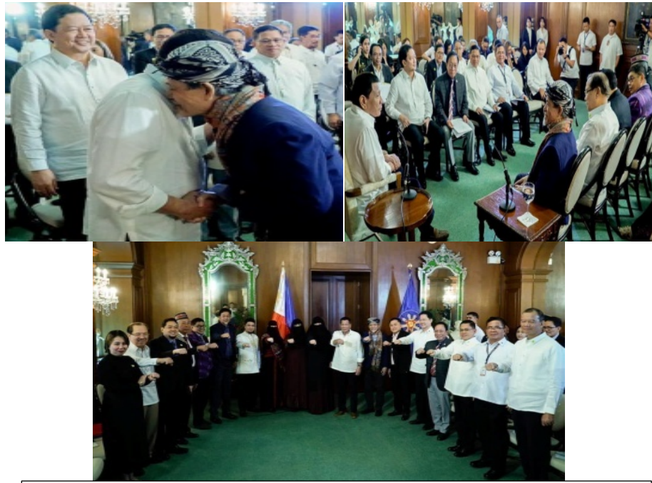
Meeting of the GPH-MNLF Peace Coordinating Committee with President Rodrigo Roa Duterte. 11 November, 2019. Malacañan.