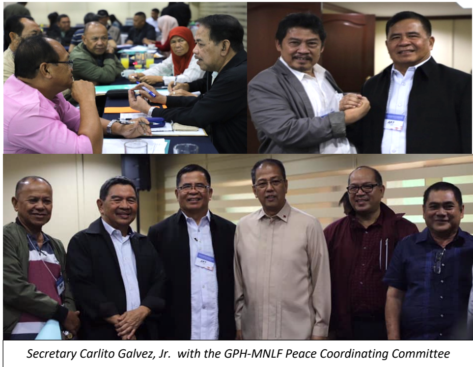
Secretary Carlito Galvez, Jr. with the GPH-MNLF Peace Coordinating Committee