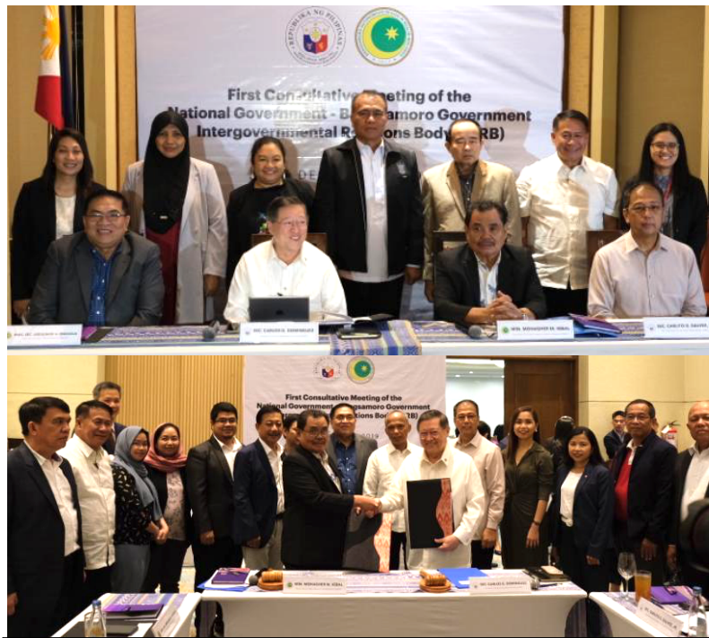
First Consultative Meeting of the IGRB. 16 December 2019, Davao City.

f. Information, Education, and Communication (IEC) Campaign on the GPH-MILF Peace Process. Part of the regular activities of the GIP-MILF Secretariat includes the conduct of fora on the GPH-MILF peace process and the production of IEC materials in order to engage various stakeholders.