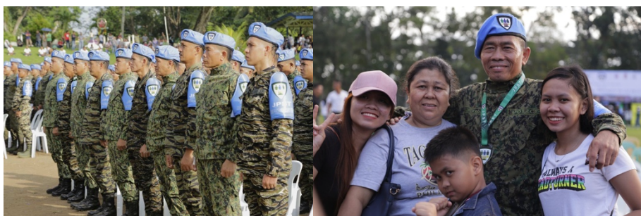
Former MILF-BIAF combatants now participate as Joint Peace and Security Team (JPST) members. 23 November 2019, Parang, Maguindanao

A total of 317 individuals (77 AFP personnel, 90 PNP personnel, and 150 MILF-BIAF members) completed the second batch of the JPST training facilitated by the BARMM PNP Regional Office. The training provided skills and orientation on the duties and functions as members of the JPSTs and sought to create strong partnership between the contingents from the AFP, PNP, and MILF-BIAF that will be jointly deployed in mutually agreed areas.