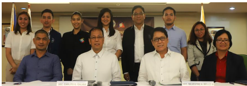
MOA Signing between DOLE and OPAPP. 21 October 2019, Intramuros,

21 October 2019 for the implementation of integrated livelihood and emergency employment programs for decommissioned combatants, their families, and communities in the six (6) previously acknowledged MILF camps; and