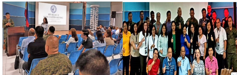
RTF3 Inter-Cluster Meeting

10 December 2019 | BFAR Conference Room, San Fernando, Pampanga. The activity was intended to revisit the Cluster Implans approved by the RTF3 on 9 October 2019, as basis for the formulation of the Regional Strategic Action Plan that will guide CORDS3/RTF3 in implementing specific PPAs in identified focused/priority areas of ELAC