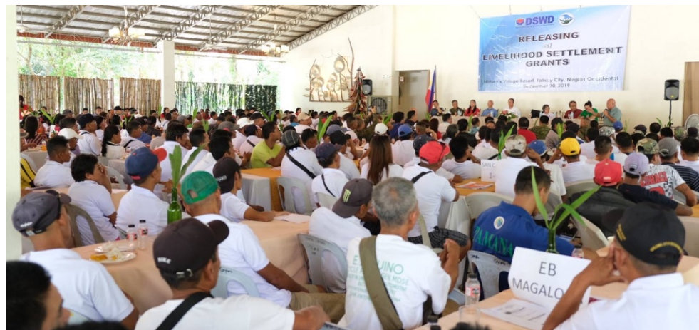
Talisay City, Negros Occidental. 20 December 2019. Kapatiran members (former RPM-P/RPA/ABB-TPG) receive livelihood assistance as part of socio-economic reintegration.