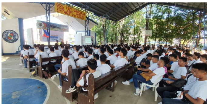
Youth ACTS for Peace (Awareness on Communism, Terrorism, and Security). Bataan, 07 December 2019.