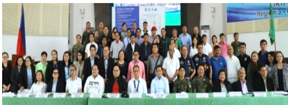
Special Meeting of the RTF-ELCAC3. 09 October 2019, Malolos, Bulacan.

The meeting was highlighted by the presentation to the RTF-ELCAC3 of at least twelve (12) members of the New People’s Army (NPA) in Central Luzon who had earlier surrendered to authorities after being heavily exploited by the communist group. The returnees were given by OPAPP immediate cash assistance and other forms of aid during the special meeting.