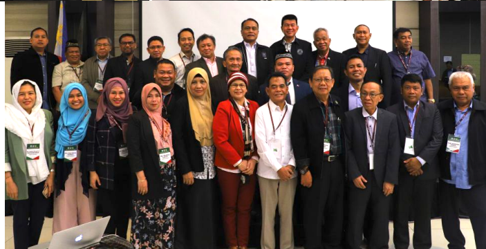
Learning Session on the Bangsamoro Internal Revenue Code. BARMM officials and members of the BTA with OPAPP officials and UP Law lecturers. 4-6 November 2019 | Quezon City