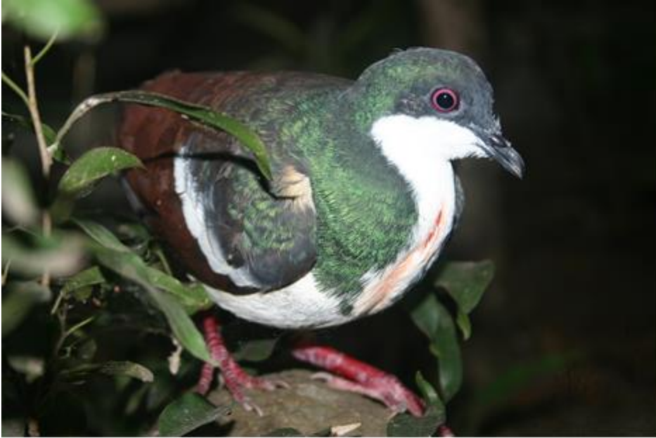
Color of the streak on its breast on normal months.