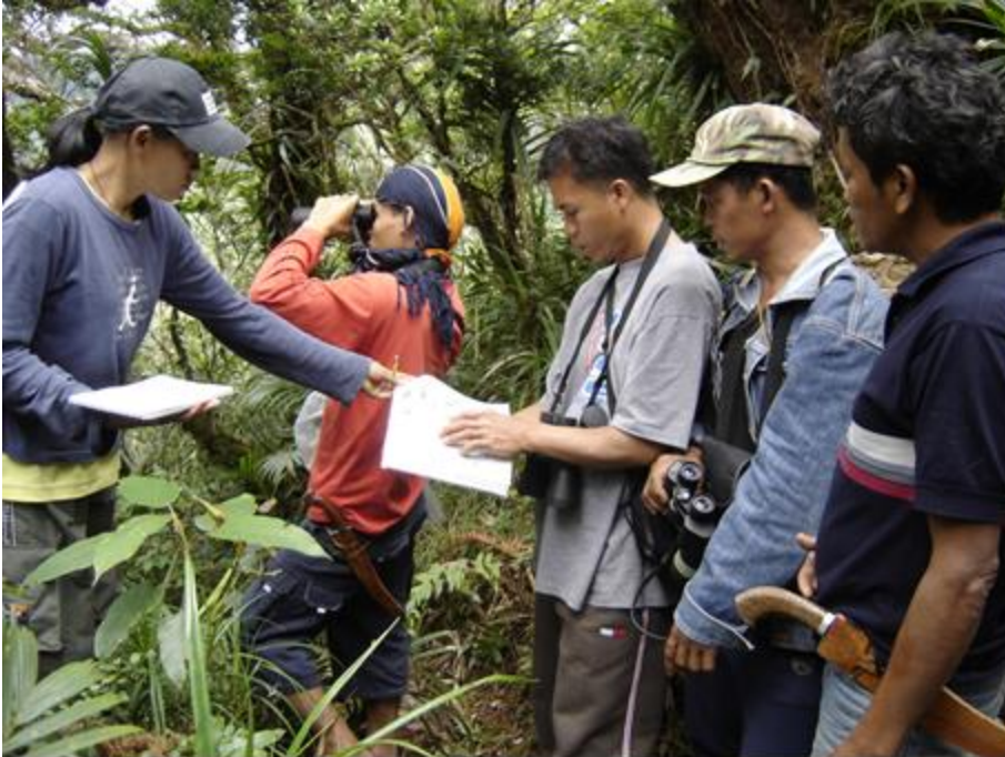
Plate E. One of the community-based biodiversity monitoring in the Mt. Talinis area.