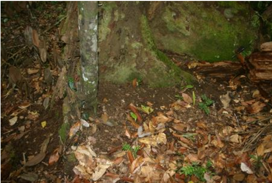
Plate F. Tracks of feet clearing observed during one of the community-based biodiversity monitoring in Calinawan, Enrique Villanueva, Sibulan, Negros Oriental, Philippines.