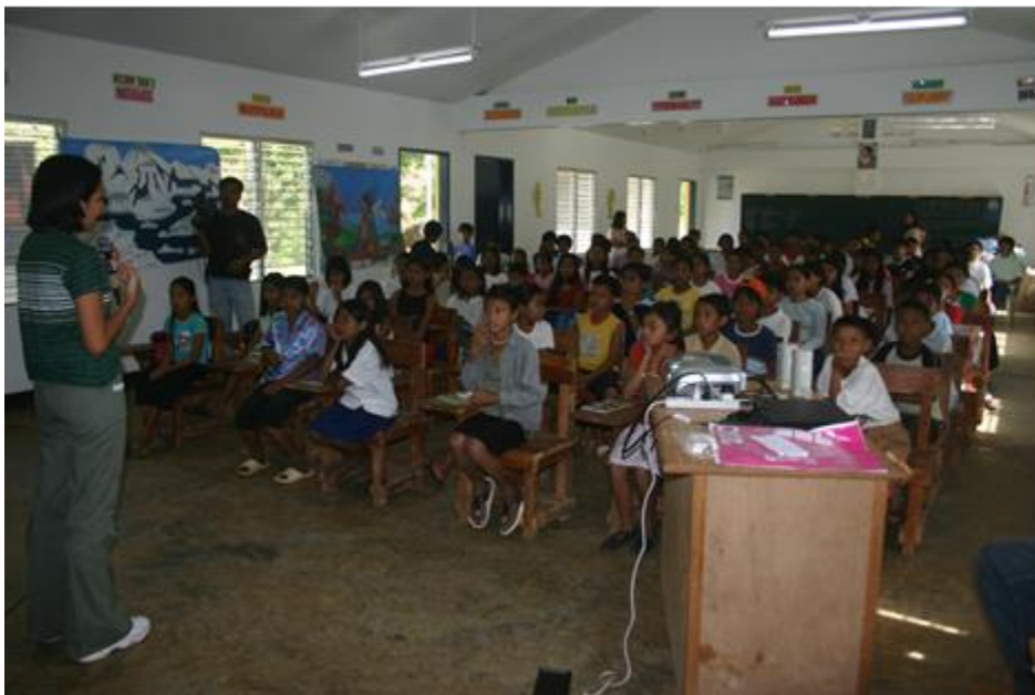
Plate H. One of the staff conducting an environmental education program in Calinawan Elementary School.