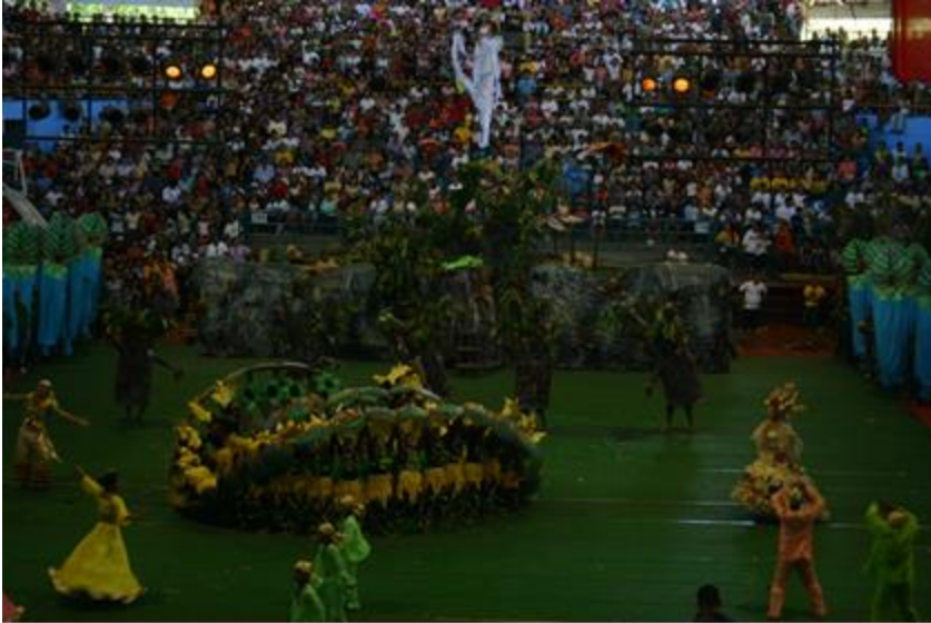
Plate I. The overall champion of the Buglasan Festival of Festivals October 2005. The Hambabalud Festival of the Municipality of Jimalalud.