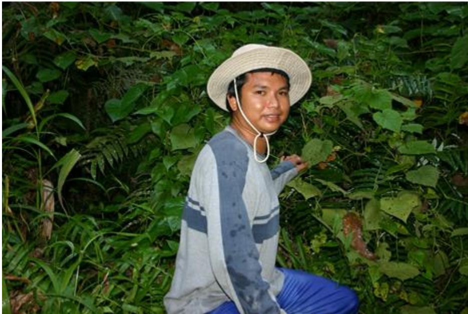
Plate D. Photograph of the author during the discovery of the nest along the Malangwa River, Timbao, Bacong, Negros Oriental.