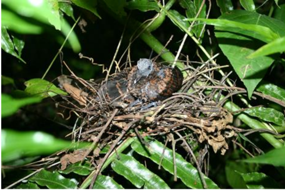
Plate C. Two chicks sitting on a nest (loosely arranged twigs) on the fronds of a giant fern ( Dicksonia sp.) along the Malangwa River, Timbao, Bacong, Negros Oriental (Mt. Talinis Range). Photo taken 17 March 2005 by A.B. Cariño.