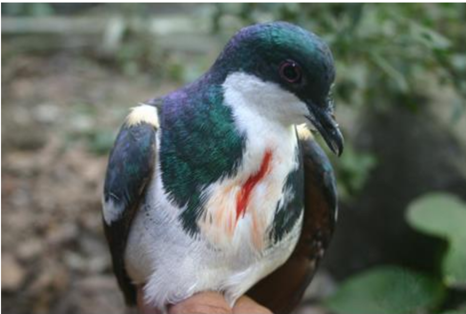
Color of the streak on its breast on breeding season.