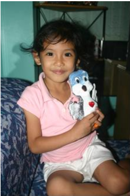
Plate J. “Hearty” one of our environmental education materials (a stuffed toy) adored by many kids.