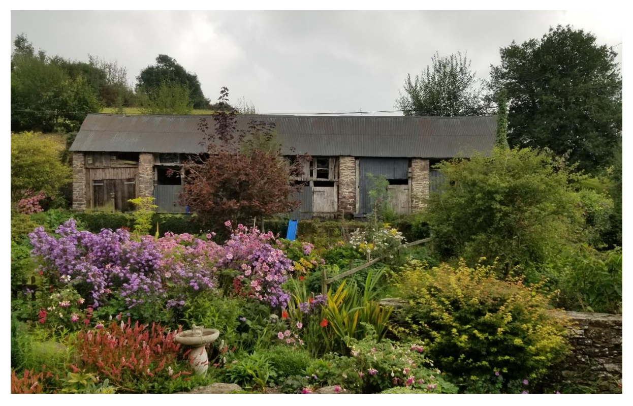
The Linhay. This traditional farm building was in extremely poor condition a few years ago. The land at the rear of the building was pushing it forward and the whole thing was in danger of collapse. Liz's thoughtful and enterprising son made simple but effective repairs by removing the soil from the rear, and then supporting the building by building a breezeblock wall inside to support the roof. A very cost effective and simple repair.

Life on the farm was very hard and everyone had to do their bit. As a school child, Liz had to walk a long distance to catch the bus to Taunton. There was no respite in the evening, as on her return it was one of her many jobs to keep the generator running in the evening.