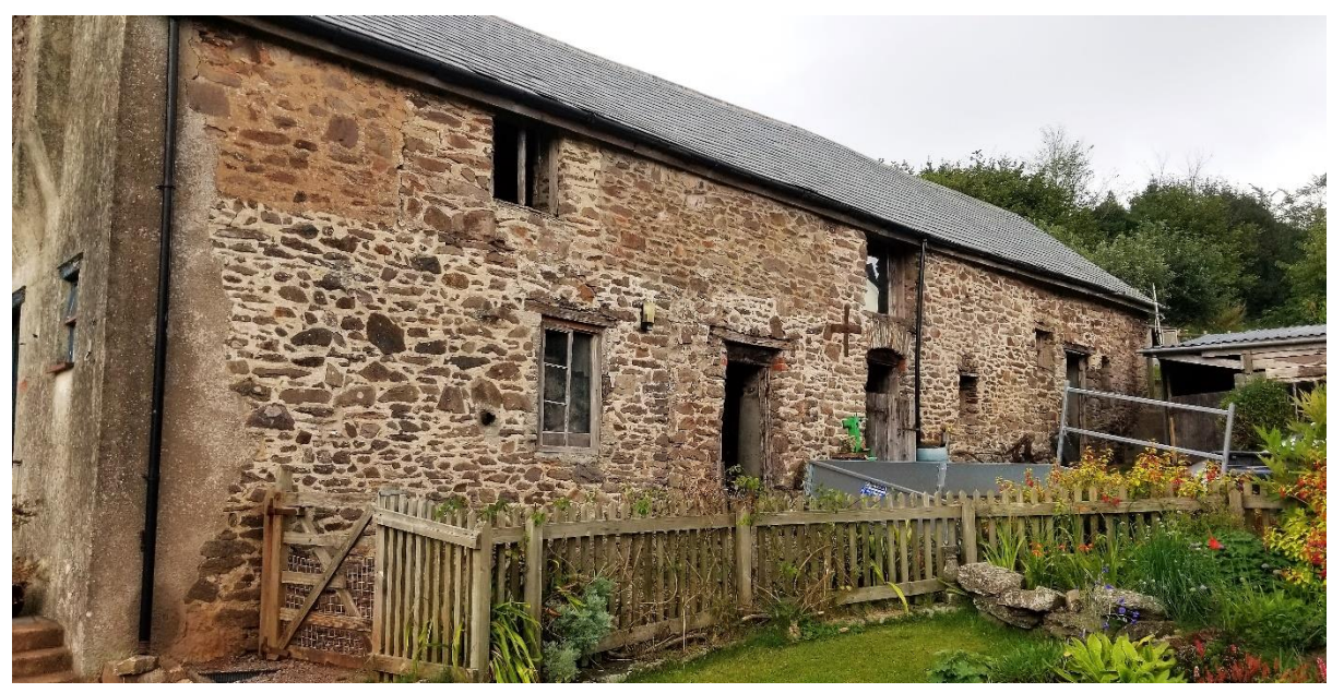
The range of buildings above were probably used as farm cottages, though an earlier map shows the buildings used as a cider house.