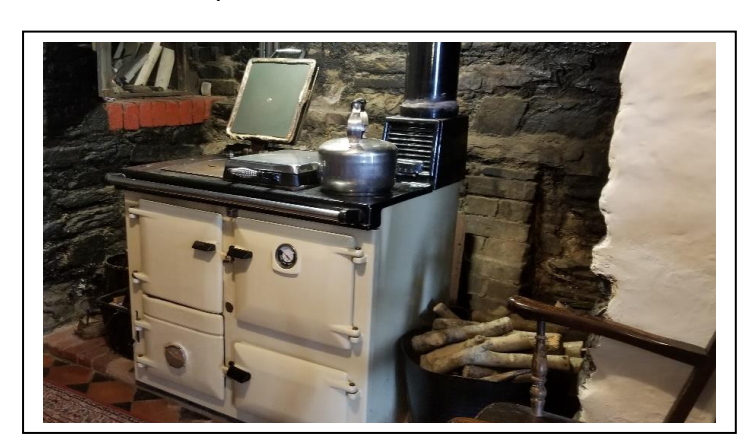
The Rayburn is inserted into the old fireplace. At the top left is the bread oven

Because of the difficulties of inheritance, the main farmhouse has been split into two parts. We were invited in to look inside – always a real treat for old buildings enthusiasts. Liz and family have done a lot of repair work on the house. Initially the house vitally needed to be rewired and replumbed.