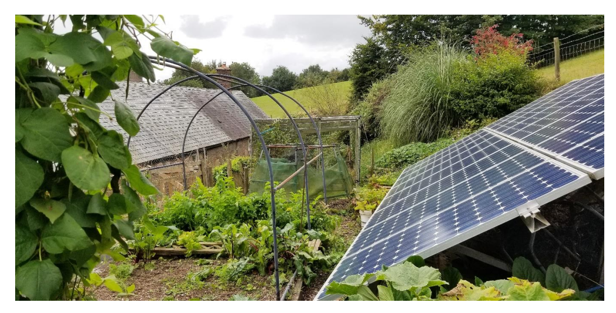
Liz has very sensibly chosen to create a vegetable garden where there is most sun. Alongside are the solar panels, which double up as storage underneath.