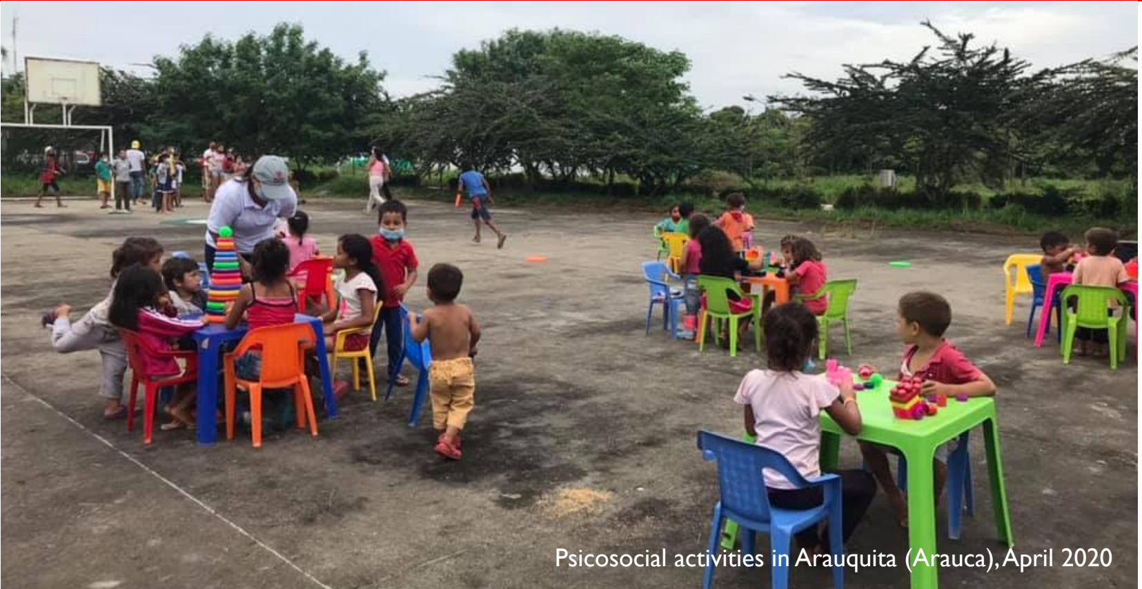
Psicosocial activities in Arauquita (Arauca), April 2020