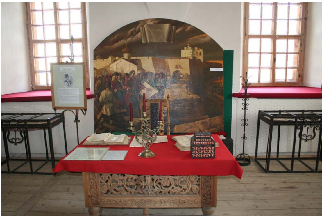
Picture No 9 Before Pskov was incorporated by the Russian centralist state, foreign affairs were decided here, in the Pskov Kremlin.

The introduction of strict federal regulations for the conduct of subnational foreign activities has enabled the regional administration to become a pioneer of implementing the federal guidelines on the grass-root level.