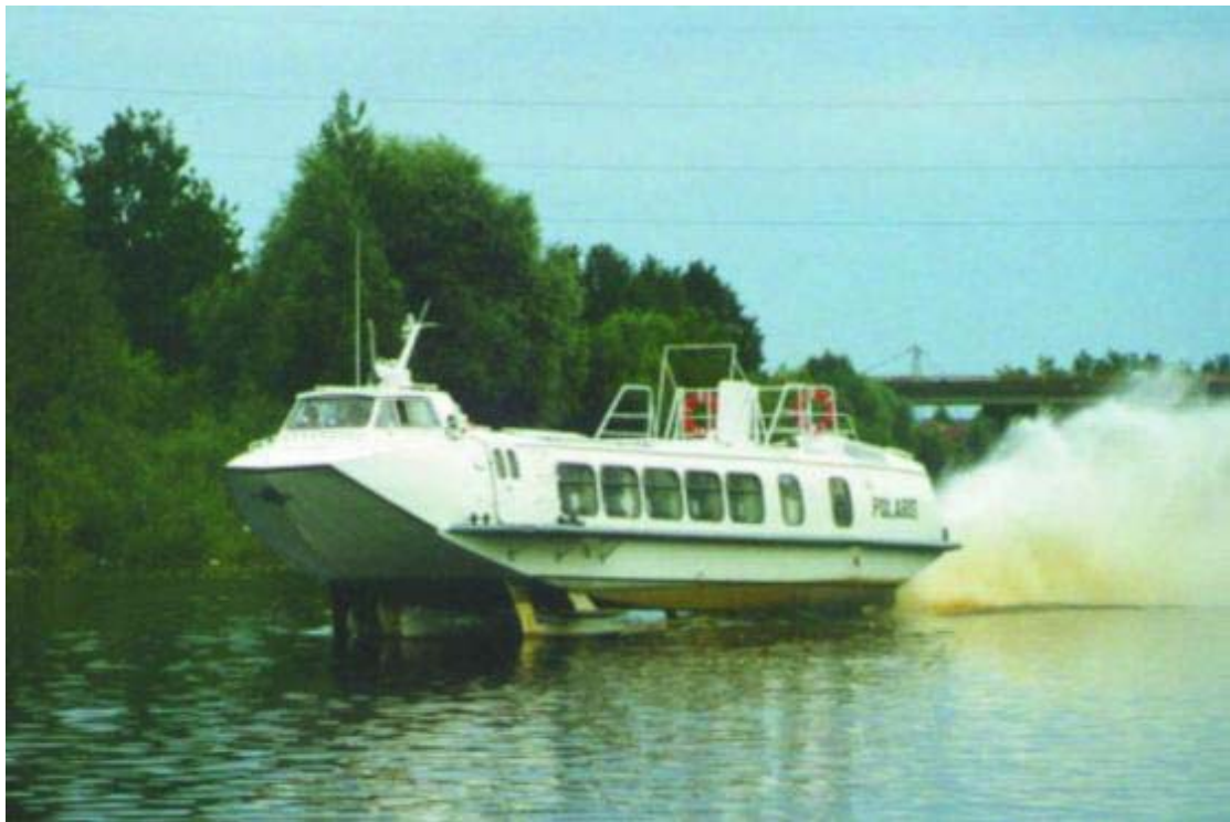
Picture No 8 A fast ferry on the river Emayogy

Additionally, internal waterways were used to maintain connections between Pskov and several remote islands in Lake Pskov. Altogether, tens of thousands of passengers and hundreds of thousands of tons of materials were transported annually using this route.