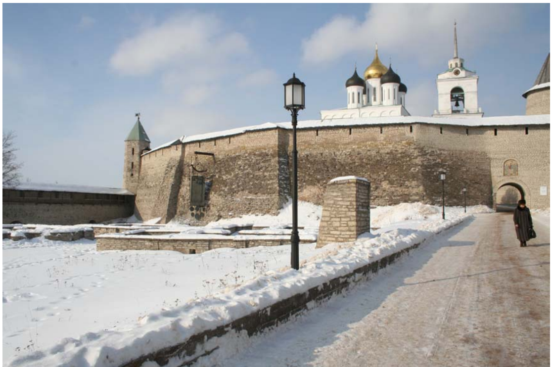
Picture No 2 The Kremlin of Pskov, the centre of the feudalist republic.

During the 12-13 centuries, Pskov was part of the Novgorod feudal republic. Although it was granted a certain degree of independence, it attempted to secede on several occasions, mainly for economic reasons. Pskov had more economic links with Baltic towns such as Tartu, Narva and Riga, than with Novgorod. And the military threat from the Baltic territories had lost its significance after the Ice Battle with the Teutonic order in the year 1242. 188