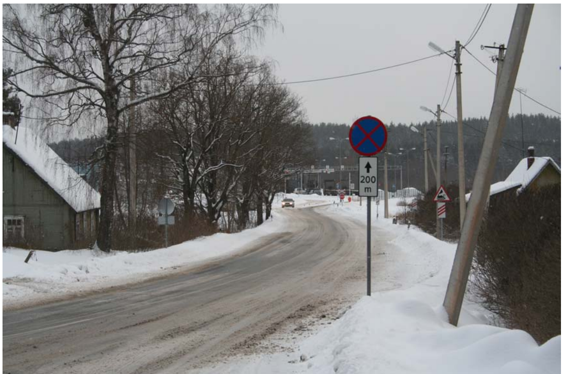
Picture No 6 The Koydula border station, built with assistance from the EU, waits for an upswing in cross-border trade

Psychological reasons are followed by technical/administrative obstacles to practicing cross-border cooperation. The administrations of subnational local units lack the resources to engage in cross-border activities. Beside the lack of funds, the absence of competent personnel hinders cooperation. The study concludes that on the Estonian side, the perception prevails that cooperation with the Russian side means doubling your own efforts, since the partners across the border are rather passive and do not seem to contribute on an equal basis.