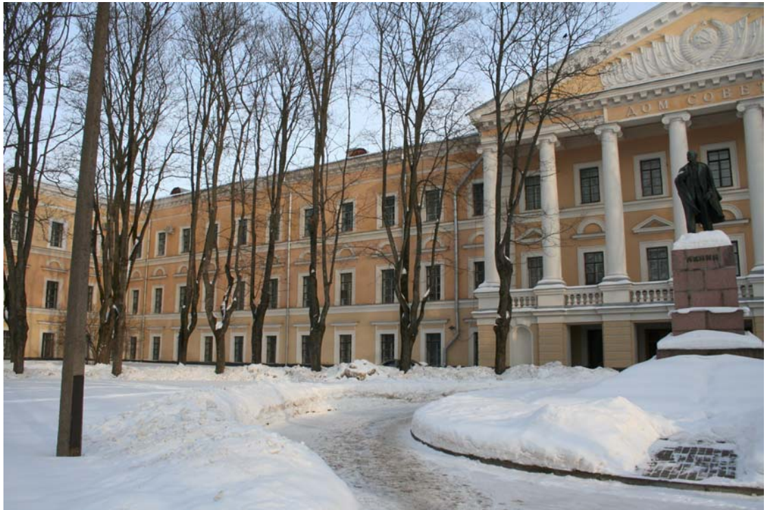
Picture No 4. The main building of the Pskov regional administration.

The administration of Pskov region is located on the Street Nekrassova, Pskov. In the same building, in the right wing reside several federal institutions, including the local representation of the Ministry of Foreign Affairs.