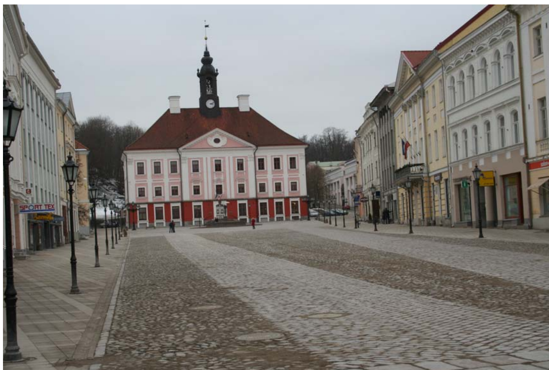
Picture No 5 The Town Square of Tartu.

The second-biggest Estonian town, Tartu, was influenced by German rule. With its Rathaus (Town Hall) Tartu contrasts with Pskov and its Kremlin.