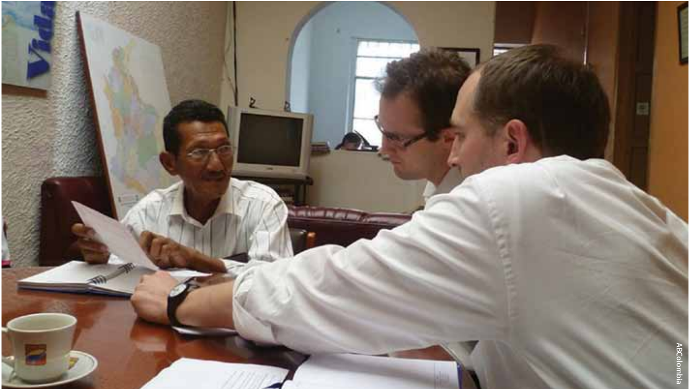
Community Leader with British and German Embassy Representatives