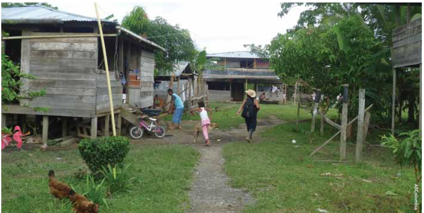
Curvaradó community threatened by agro-industry

The UN-OHCHR points out that whilst urban HRDs have seen changes in attitude, particularly in the case of the Security Forces, this is not the situation in rural areas where ‘many rural HRDs still confront hostility and a “counter-insurgency construct”’. 40 This counter-insurgency construct means that rural defenders continue to be viewed by many state actors as ‘enemies of the state’ resulting in greater vulnerability, including to judicial persecution. According to the UN-OHCHR, ‘criminal investigations of community leaders for their alleged connection with armed groups, despite insufficient grounds for prosecution, [are] recurrent.’ 40