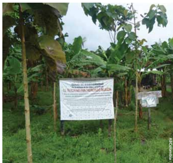
Collectively owned land of Pedaguíta Mancilla Community. The sign reads: Biodiversity Zones for the defence of territory

Over the period of the conflict communities started to realise that there were economic interests behind the land grabs. It is, therefore, not surprising that communities living on collectively owned land in Colombia: Indigenous Peoples ( Indigenous Resguardo ), Afro-descendants ( collectively owned territory under Law 70 ) and Peasant farmers ( Peasant Farmer Reserves ) when devising self-protection measures had at the heart of these their territory and its biodiversity. The models looked at here are some that ABColombia members' partners have developed.