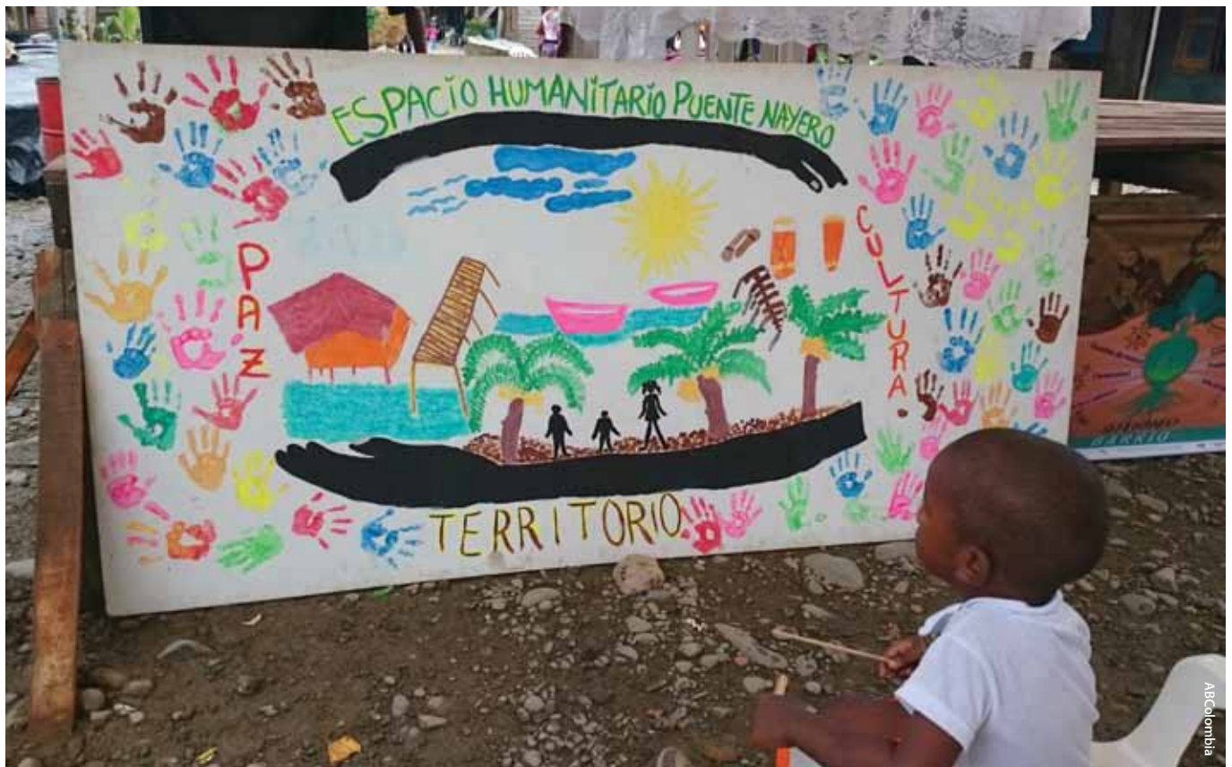
Children of the Puente Nayero Humanitarian Space put a hand print on this picture as a commitment not to be violent; they gave up their toy guns in exchange for musical instruments

The Puente Nayero Humanitarian Space, located in the neighbourhood of La Playita in the town of Buenaventura, is a series of waterfront streets where houses are on stilts in the sea with raised walk ways. The Afrodescendent community live off artisanal fishing and logging. The State authorities want to remove these communities from the area to make way for a modern development with hotels and cafés that is being constructed along the whole of the waterfront. This would impact on the community's traditional