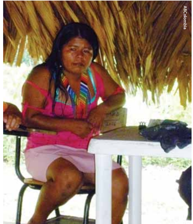
Wounaan Indigenous Governor

They also use measures that are widely practised to ensure safe mobility, such as, making changes to their normal routines, activating communication networks, working with International and National solidarity organisations whose focus is the protection of women, and in the case of Indigenous Peoples accompaniment from the Guardia Indígena .