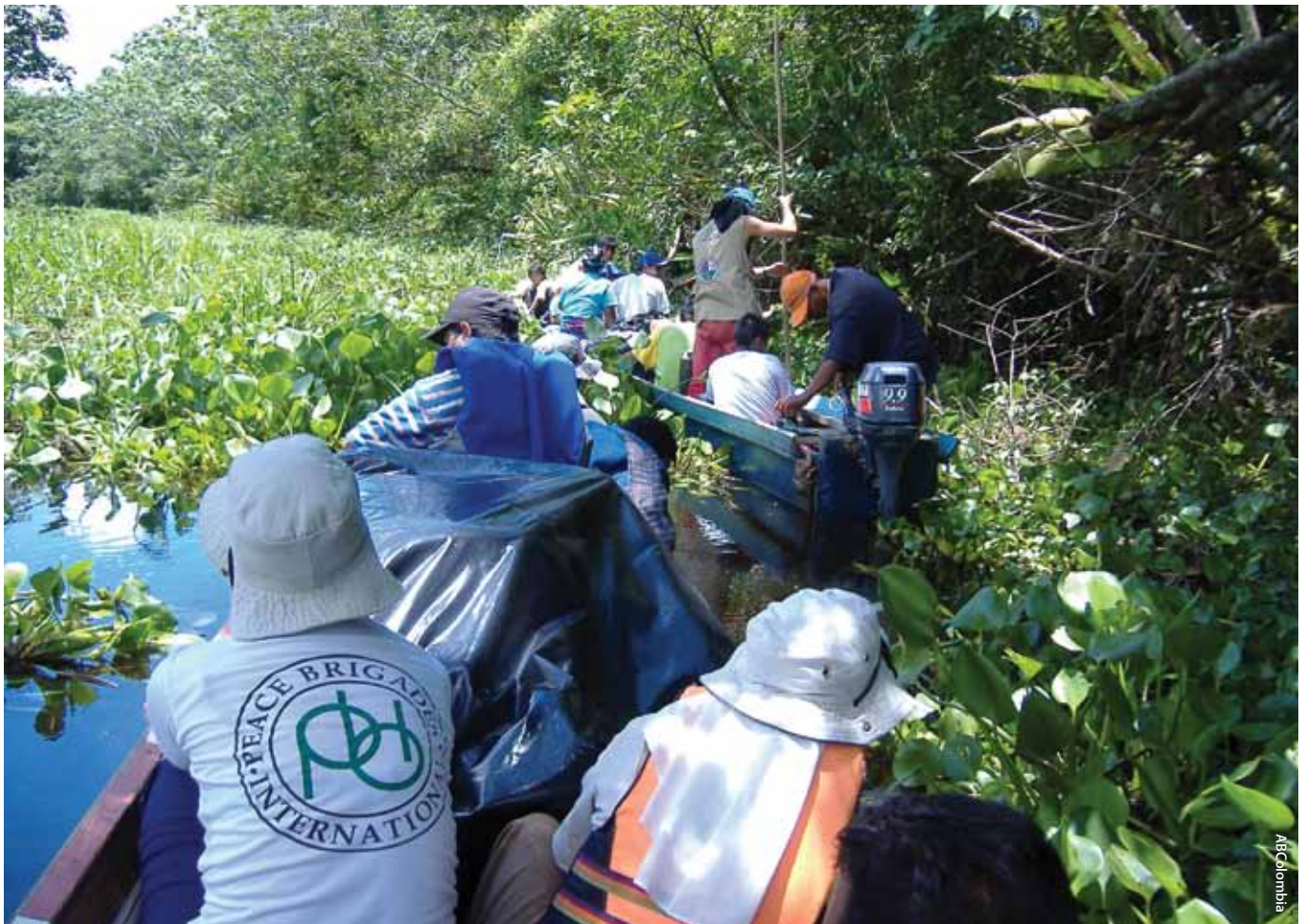
National and International Accompaniment of HRDs in Chocó

their rights, to denounce corruption and all other forms of violence. '...As a result [of strengthening the organisational capacity of the ethnic-territorial organisations] communities were able to denounce threats that came from ... companies and their activities and claim their rights.' 69 In the case of mining companies the Diocese sought experts from national Colombian CSOs, academic institutions, and from international organisations to give the communities the information they needed to collectively establish their position and take concrete actions in order to be able to remain in their territory.