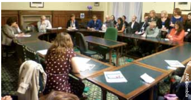
Leaders from Curvaradó in UK Parliament

Protection measures are mistakenly seen by the State as the first line of defence rather than a response to the failure of prevention. The ever increasing attacks and threats against HRDs are in no small part due to the State's failure to address the issue of impunity . Of 219 assassinations which occurred between 2009 and 2013, 95 per cent of investigations did not proceed past the preliminary phase, and only one case resulted in the sentencing of those responsible. 45 This lack of prosecution of those responsible for crimes against HRDs is in direct contrast to the rapid action taken by the State against HRDs, for example, accusing them of rebellion, that is having links to guerrilla groups. 46