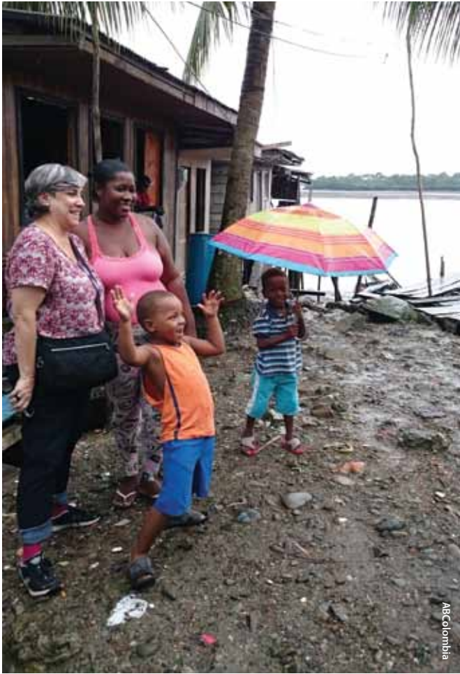
Puente Nayero Humanitarian Space

way of life and leave them without a viable livelihood. Instead they are asking to be incorporated into the planned development of the area.