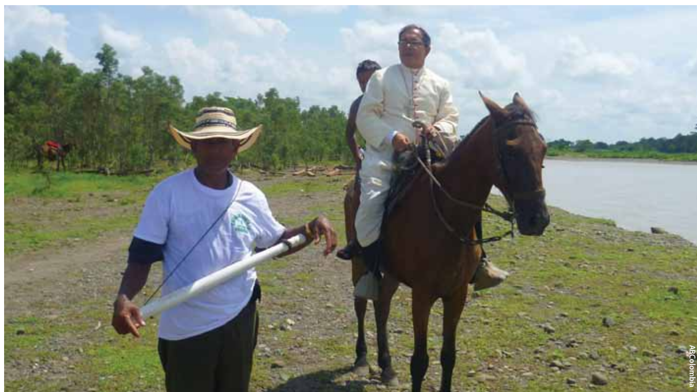
Bishop of Montelibano accompanied by the Zenú Guardia Indígena

The Zenú community have also been engaged in efforts to obtain legal recognition of their ancestral territories 64 , as well as, raising the issue of the alleged impacts of the nearby South 32 Cerro Matoso ferronickel mine and processing plant on the health of the Zenú People and the alleged contamination of the environment. 65