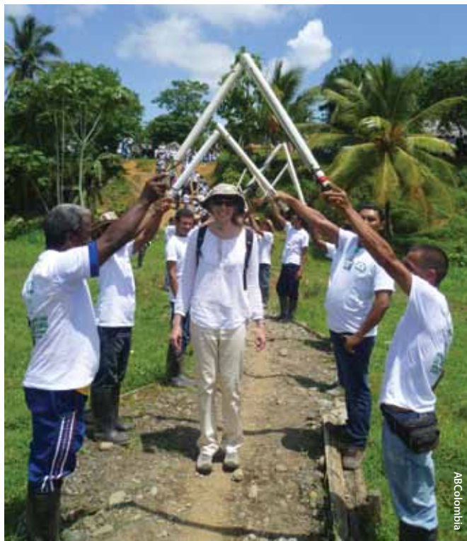
Guardia Indígena welcome UK embassy to the Alto San Jorge Resguardo of the Zenú Indigenous Peoples

‘The protection strategy of the government is only a military one. We need protection to be integrated incorporating psychosocial and spiritual as well as physical. For example, if we receive a threat, then [others] enact a ritual to protect us, which gives us strength. Then the next day we are more relaxed to design a protection strategy...’ 61