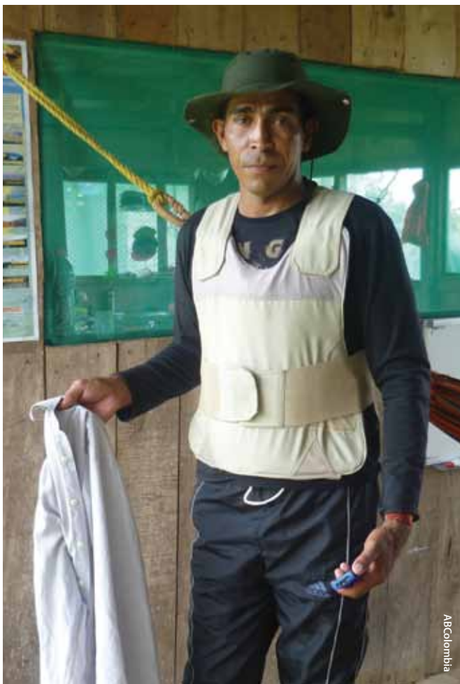
Human Rights Defender in bullet-proof vest given to him by the State National Protection Unit

However, the effectiveness of these Security Agreements will depend on their full implementation. Colombia has a reputation for outstanding policies and its failure to implement such policies. These policies will need to be fully resourced and applied if guarantees for non-repetition and progress towards a sustainable peace are to be achieved in Colombia.