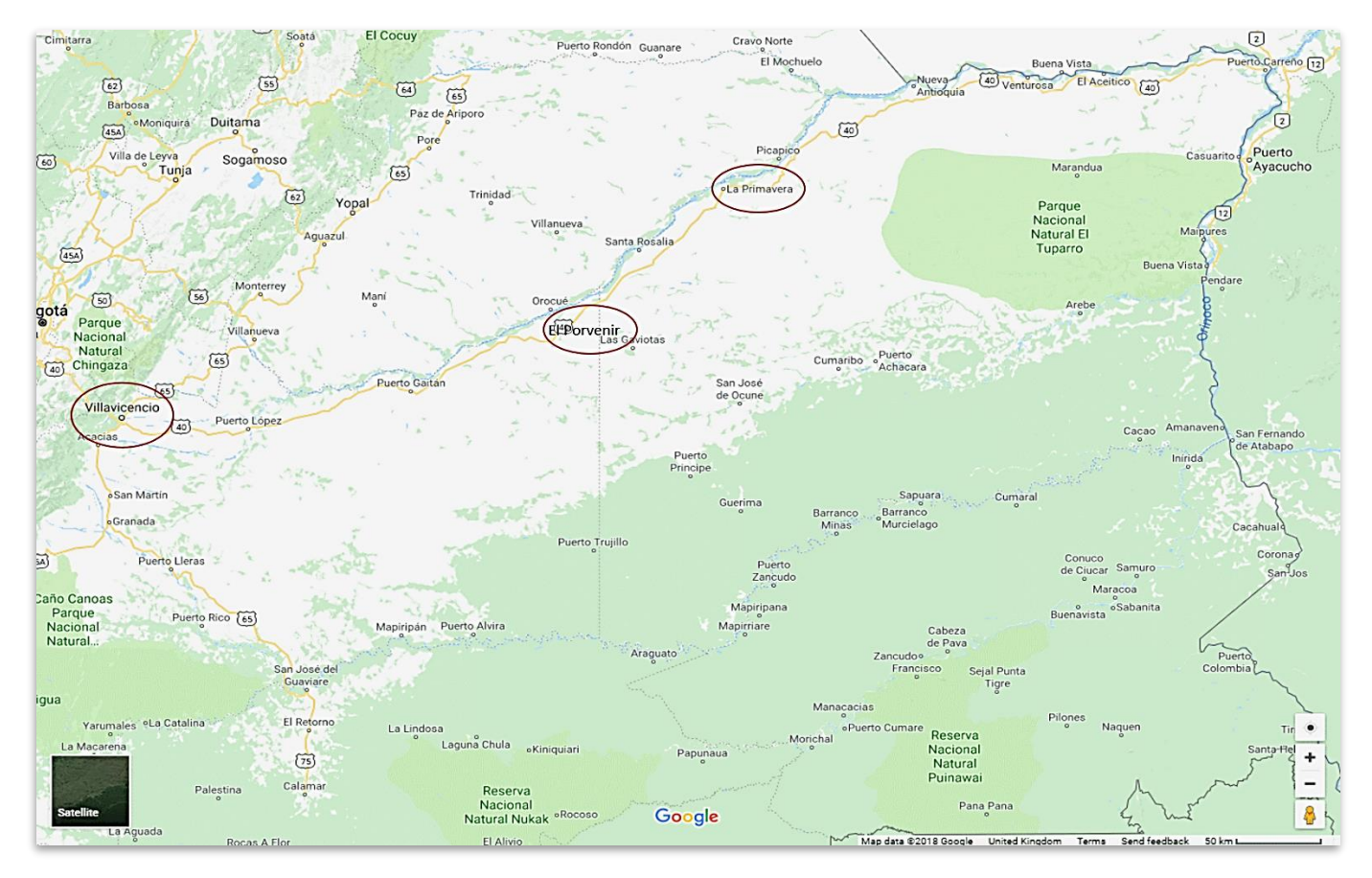
Figure 1: Map of route Vichada, Meta and Casanare

Details of the places and communities that we will visit in Vichada, Meta and Casanare. The region is referred to as Llanos Orientales .