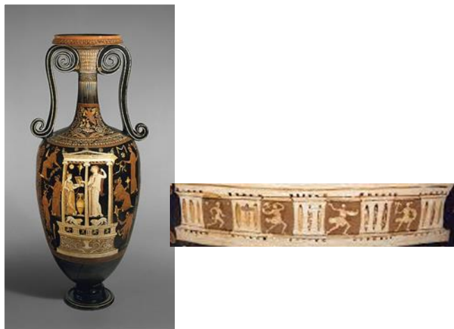
Figure 8. New York, MET inv. 1995.45.1 and 1995.45.2 (detail). Apulian red-figure loutrophoroi by the Metope Painter

scene with a woman and a servant inside. 50 These exemplars are not different from other similar scenes apart from the fact that single Amazons are depicted on the metopes around the podium (Figure 8). Could these representations find a correlation with actual funerary naiskoi in the region?