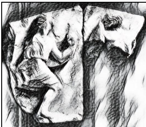
Figure 14. Taranto, MARTA inv. no. 9-10, Pedimental Relief Fragments. Amazonomachy