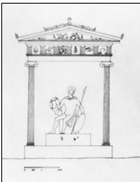
Figure 3. Taranto, naiskos found on Via Umbria