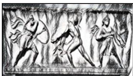
Figure 6. Athens, NM 3614. Amazonomachy

By contrast, the Amazonomachy depicted on slab NM 3614, is more dynamic (Figure 6). The remaining figures show an Amazon fighting a Greek, and another Amazon engaged in battle with another Greek, now missing. The dense drapery and flying mantles add more dynamism to the scene, which depicts the Amazons in the oriental fashion with trousers and sleeves. In addition, the surviving arm in a long sleeve on one of the fragments from the Kerameikos mentioned above suggests that representing Amazons as distinctly oriental –something widely observed in vase painting, but no so often in public buildings– was perhaps a more extended trend in funerary sculpture. Unfortunately, no remains are indicating the main hero, thus making impossible to identify the specific Amazonomachy intended for this funerary building. 40