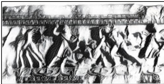
Figure 11. Taranto, Frieze Fragment C88. Amazonomachy with Heracles

The final examples are the Amazonomachies set in the pediments of the naiskoi . This placement of the subject is perhaps the most original: the crowning of a funerary building with an Amazonomachy is, in fact, a practice without parallels elsewhere. The left remaining part of the relief pediment C92 shows a dead Amazon and a reclining male figure leaning on a rock (Figure 12). Next to him, there is an Amazon on her knees, and a standing Amazon engaged in combat. The right part of the pediment is lost, hence making the identification of the male figure in the far left challenging. In Etruscan funerary art, depictions of rocks mark the threshold between this and the other world, as they are often observed on vases, carved sarcophagi, and tomb painting. 59 In the pediment, the male figure is unarmed (only the head of the defeated Amazon next to him is still visible), and he is depicted in a relaxed pose. This particular representation of the Amazon and the male figure in a rocky setting indicates that they are no longer part of the battle. Could this be a portrait of the deceased individual to whom the monument was dedicated? If so, this would be a very explicit allusion to the individual inside the tomb upon which the naiskos was built.