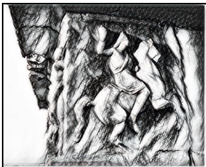
Figure 7. Piraeus Museum, Kallithea Monument. Amazon on Horseback

Source: sketch by the author from the original.