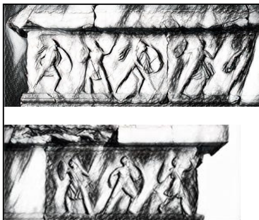
Figure 4. Piraeus Museum, Kallithea Monument. Amazonomachy

suggests derivation from the East, perhaps Lycia and Caria, where such friezes were common in funerary art. 27 In addition, the funerary statues against their naiskos background must have evoked the Daochos Monument at Delphi, a roughly contemporary sculptural monument. In short, the total effect of the monument is more eastern than Attic. 28