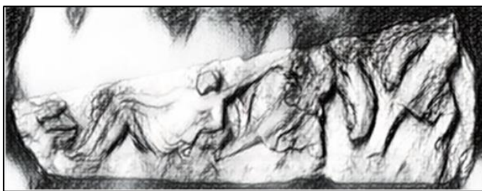
Figure 12. Taranto, pedimental relief C92 (fragment). Amazonomachy

The final examples are the Amazonomachies set in the pediments of the naiskoi . This placement of the subject is perhaps the most original: the crowning of a funerary building with an Amazonomachy is, in fact, a practice without parallels elsewhere. The left remaining part of the relief pediment C92 shows a dead Amazon and a reclining male figure leaning on a rock (Figure 12). Next to him, there is an Amazon on her knees, and a standing Amazon engaged in combat. The right part of the pediment is lost, hence making the identification of the male figure in the far left challenging. In Etruscan funerary art, depictions of rocks mark the threshold between this and the other world, as they are often observed on vases, carved sarcophagi, and tomb painting. 59 In the pediment, the male figure is unarmed (only the head of the defeated Amazon next to him is still visible), and he is depicted in a relaxed pose. This particular representation of the Amazon and the male figure in a rocky setting indicates that they are no longer part of the battle. Could this be a portrait of the deceased individual to whom the monument was dedicated? If so, this would be a very explicit allusion to the individual inside the tomb upon which the naiskos was built.