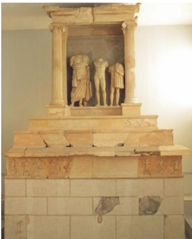
Figure 1. Piraeus Museum, Kallithea Monument

The Kallithea Monumentis is about 8.30 m high and still retained traces of colour when found. Its architectural features with its relief sculptures must have been undoubtedly impressive in antiquity when viewed from a distance and nearby (Figure 1). Its current reconstruction at the Piraeus Museum shows that it consisted of a high limestone podium topped by an Amazonomachy frieze, of which three blocks have been recovered. The now plain band in the middle may have carried a painted frieze. In addition to the marble colours, there are vestiges of paint on the figures and the mouldings.