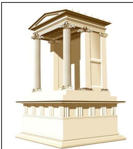
Figure 2. Taranto, naiskos found on Via Umbria