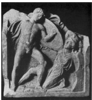
Figure 10. Taranto, metope fragment C50. Amazonomachy

Surviving narratives of the myth (3-4 figures) occur on a frieze depicting an Amazonomachy with Heracles (C88) dated to about 325 BC (Figure 11). 58 The former is a fortunate example since the Sarcophagus of the Amazons – made in South Italy for an Etruscan client– as well as the rest of the Etruscan sarcophagi portraying Amazonomachies never show a main hero. The example from Taranto, by contrast, shows an interest in a specific episode of the myth which is different from the Amazonomachies with Theseus more frequently depicted in Athens. That said, there is not enough evidence to conclude that all the Amazonomachies in the funerary naiskoi from Taranto had Heracles' as the protagonist. In this particular case, however, it is inevitable to think of possible allusions to the Amazonomachy displayed in the Mausoleum.