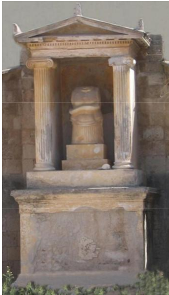
Figure 5. Rhodes, Archaeological Museum. Funerary Naiskos

Third, the Kallithea Monument predates similar monuments in other Greek cities outside Attica, setting a precedent for the Tarantine production. After Demetrios of Phaleron's decree, it is not clear what happened to Athenian workshops, but it is likely that artists immigrated to other Greek centres, including Rhodes and Taranto. While closer models to those made in Athens are found in naiskoi from Rhodes, which follow the Attic architectonic trend with Ionic capitals (Figure 5), Taranto offers the most compelling evidence for late Classical and Hellenistic funerary monuments. 36