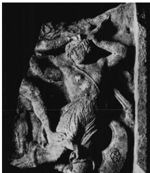
Figure 9. Budapest, relief fragment from Taranto C56. Amazonomachy

while a Greek seizes her by the hair. 57 Similarly, some reliefs show comparable poses and gestures as observed in C56, C50 (Figures 9-10) and in a fragmentary head that probably belonged to an Amazon with a Greek's hand on top (C321).