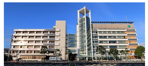
Saijo City Hall Central Office

*Make sure to bring your residence card.