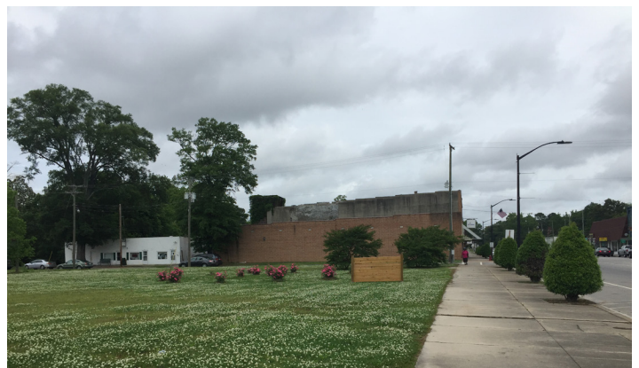
Vacant lots on Main Street