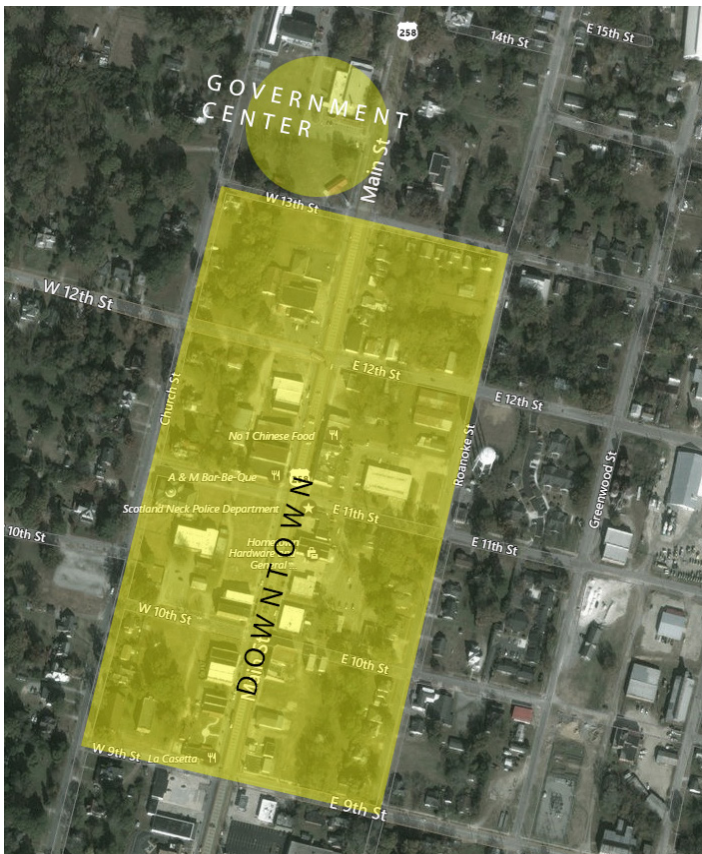
Proposed area for downtown district designation