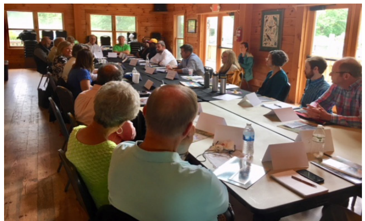
Community meeting at Sylvan Heights Bird Park