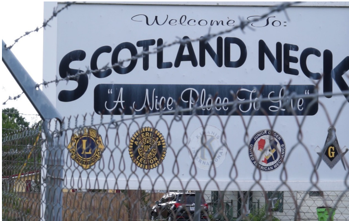
Current welcome sign for Scotland Neck