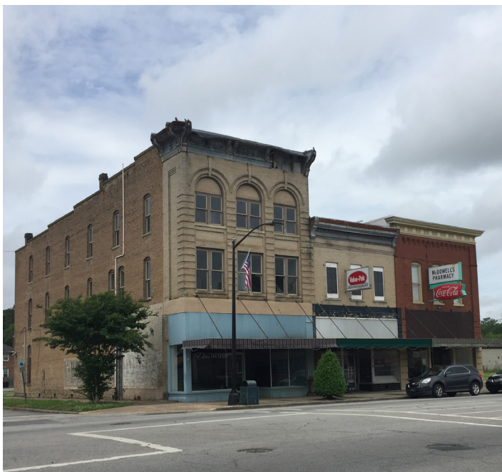
Main Street in Scotland Neck; Biggs Building (left) and McDowell's Pharmacy (right)

Despite these challenges, the downtown has potential to recover some of its former vibrancy and vitality.