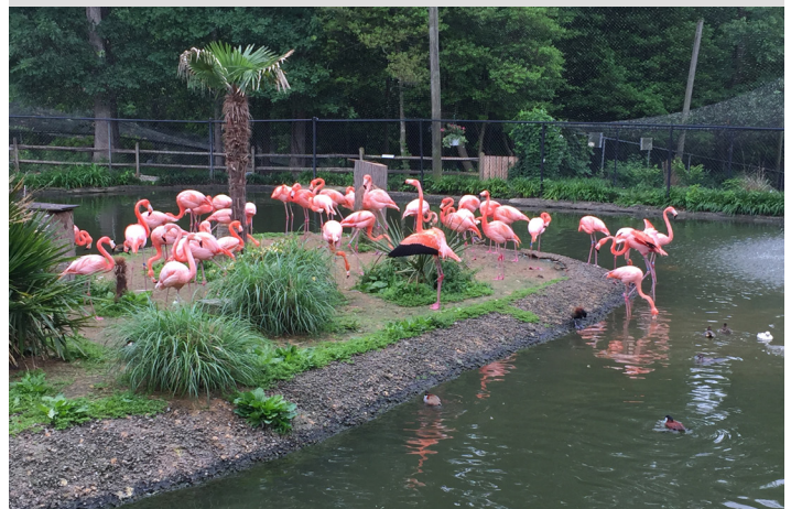
Flamingos at Sylvan Heights Bird Park