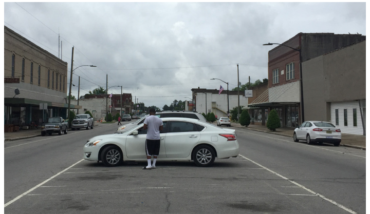
Downtown streetscape in Scotland Neck