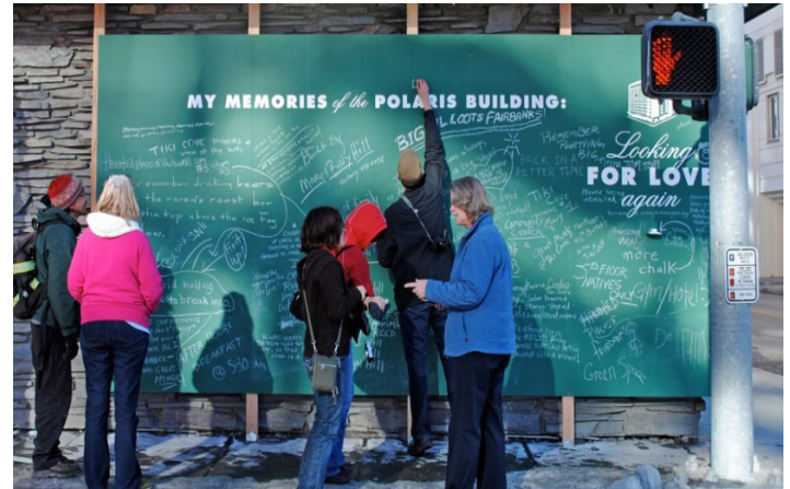
Participatory visioning process in Fairbanks, AK