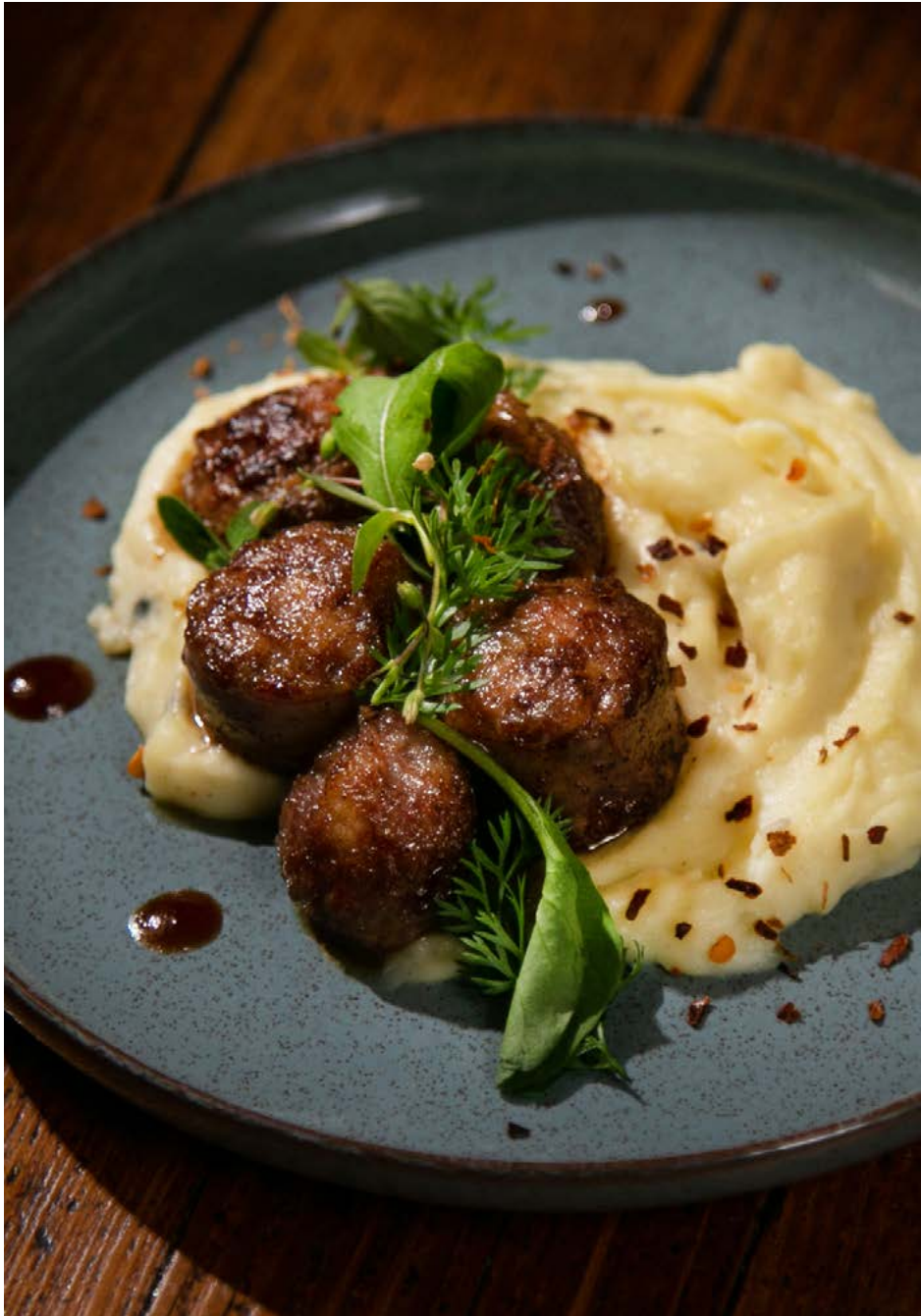
Grilled Duck Sausage with Whipped Mashed Potatoes