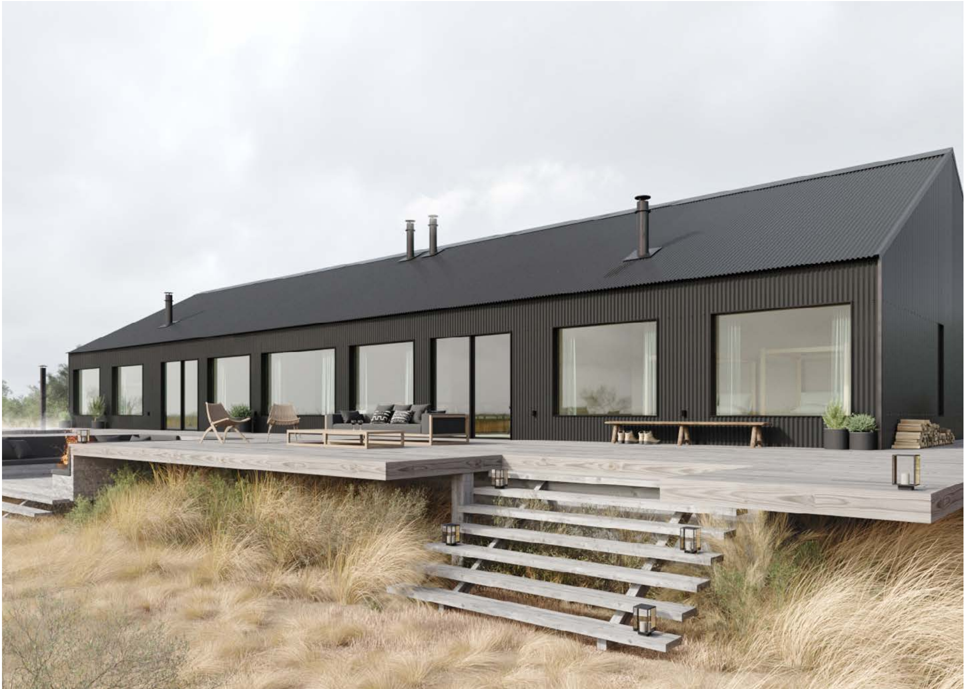
The Camp is located in the midst of nature and just minutes away from the hunting grounds