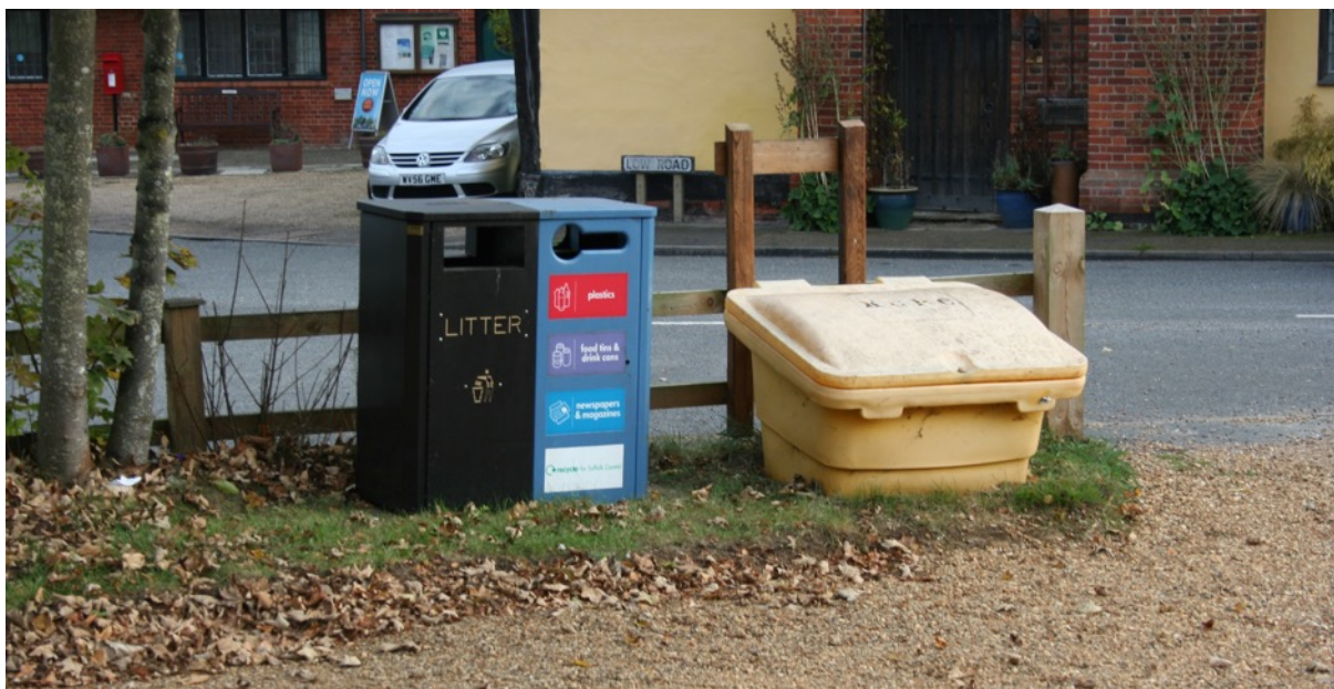
Street furniture close to listed buildings on Low Road, illustrating the need for careful positioning of such items

In common with several villages in the Suffolk Coastal district, pavements are largely lacking from Kelsale, as are concrete kerbs and street lighting, which helps retain a rural and largely unaltered streetscape. However, isolated examples of street lighting can be found around the junction of Bridge Street and Low Road and the visual incongruity of these must be considered against the public benefit provided by them. While it is acknowledged that certain items of street furniture are necessary for public safety or information, the number and siting of these needs careful consideration so that safety, function and aesthetics are viewed concurrently.