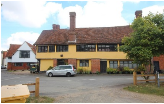
The Old Guildhall from the west

The Old Guildhall (grade II) Former guildhall deriving its name from the Guild of Saint John the Baptist which was established in Kelsale before 1439. Prominently located at the corner of Bridge Street and Low Road. The Old Guildhall is probably a later fifteenth century structure with a sixteenth century wing to the east; considerable later alterations, especially in later nineteenth century. The date 1725 on the right-hand side refers to the brick casing at this end of the building. It was restored and converted to the village school between 1868-1870 to the designs of Richard Norman Shaw. The contractors were Thomas Denny and William Kerridge of Kelsale. Shaw also added a tall wooden bellcote which has sadly since been removed. His external stair has also been replaced. It is linked to the village club by an eighteenth century structure the sash windows of which have been replaced and the openings altered.