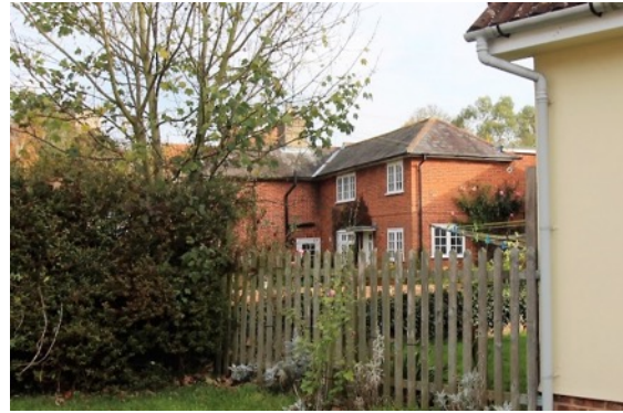
No. 2 and No.3 and wall to Church Lane

The dwarf red brick boundary wall to Church Lane is probably of nineteenth century date. The section to the north of the house, and the return to the drive have however been rebuilt.