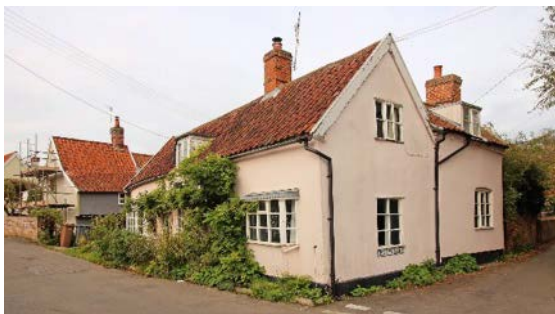
Harvest House, Bridge Street

Harvest House, No.7 Bridge Street and garden wall to Denny's Lane. A one and a half storey cottage which stands on the western corner of Denny's Lane. Possibly of early to mid-eighteenth century date, and reputedly retaining some timber framing. Harvest House is shown as a pair of cottages on the 1904 1:2,500 Ordnance Survey map and on that of 1927. It was in use as a house and Post Office by 1975 but is now a single dwelling. Red pan tile roof, rendered and painted external walls, and a red brick ridge stack. The windows are a mixture of later nineteenth century plate-glass sashes and twentieth century casements. In the centre of the Bridge Street elevation is a dormer window lighting the attics. The entrance door is set within the western return gable, and has shallow twentieth century gabled wooden porch.