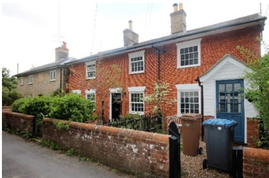
Nos. 3-5 (cons) Denny's Lane

Adams Cottage No. 1 & No.2 Denny's Lane and boundary wall to front. A semi-detached, early to mid-nineteenth century pair of cottages with a gault brick faced façade to Denny's Lane. Shallow pitched Welsh slate roof. Denny's Lane façade has replaced casement windows within original openings and wedge-shaped gault brick lintels to the openings. Both houses have replaced, partially glazed front doors. Adams Cottage with single storey late twentieth century conservatory addition. Red brick garden wall to Denny's Lane possibly of later nineteenth century date. These cottages were reputedly constructed by Samuel Clouting who presented them to the parish. Used as a girls' school in the nineteenth century. They were sold by the church in 1984. A c1900 postcard of No.1 labelled 'Nurses Cottage' is reproduced in Neave, D A Second Look at Saxmundham and area (Saxmundham, n.d.) p26. This shows the house with centrally opening casement windows, each panel divided into three lights.