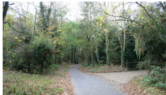
View looking along Tiggins Lane

To the south west corner of the Conservation Area is the playing field, and within this space views of the settlement to the east and Kelsale Court to the north east are found. Further north, along the B1121, views into the designed landscape and approach drive to Kelsale Court can be observed, including glimpses of the bridge within the park.