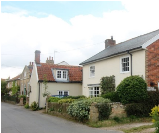
The Old Post Office and The Lions from the west

Good low brick boundary wall with curved corner to east, probably dating from the late nineteenth century. Twentieth century railings to western section of frontage not included.