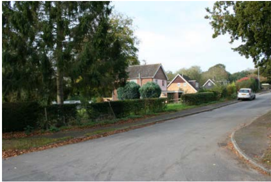
Concrete kerbs and pavements on Church Close

Church Close, located within the heart of the Conservation Area, is a development of fourteen residential units constructed during the third quarter of the twentieth century. The character of this area differs noticeably to the rest of the Conservation Area, and this is in some part due to the existence of raised pavements and concrete kerbs.