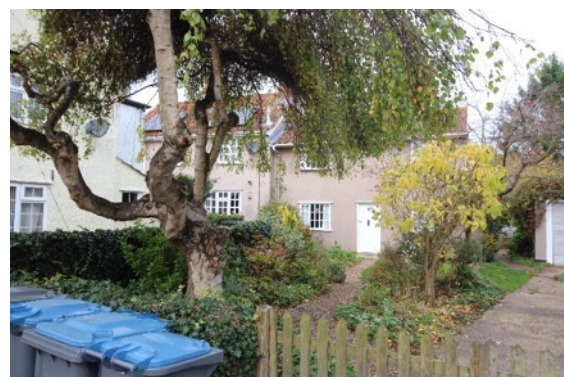
Nos.4 & 5 Bridge Street

Nos.1-3 (cons) Bridge Street Three small cottages of uncertain origins. The terrace is illustrated as two, rather than three dwellings on Ordnance Survey maps dating from the early twentieth century, and was possibly remodelled shortly after World War One. It has however, a steeply pitched roof reminiscent of a type normally associated with early eighteenth, or earlier buildings, and within the attics there are reputedly remnants of a timber framed structure. The boarded doors and tall narrow ground floor windows are probably of c1920 date. The other window frames were until recently delicate c1920 metal casements, but these have sadly been replaced. Red clay pan tile roof covering, with regrettable Velux rooflight inserted. External walls are rendered. Red pan tile roof with one surviving ridge stack at the western end. Largely blind eastern return elevation which is a single bay wide. Outbuilding to rear not included.