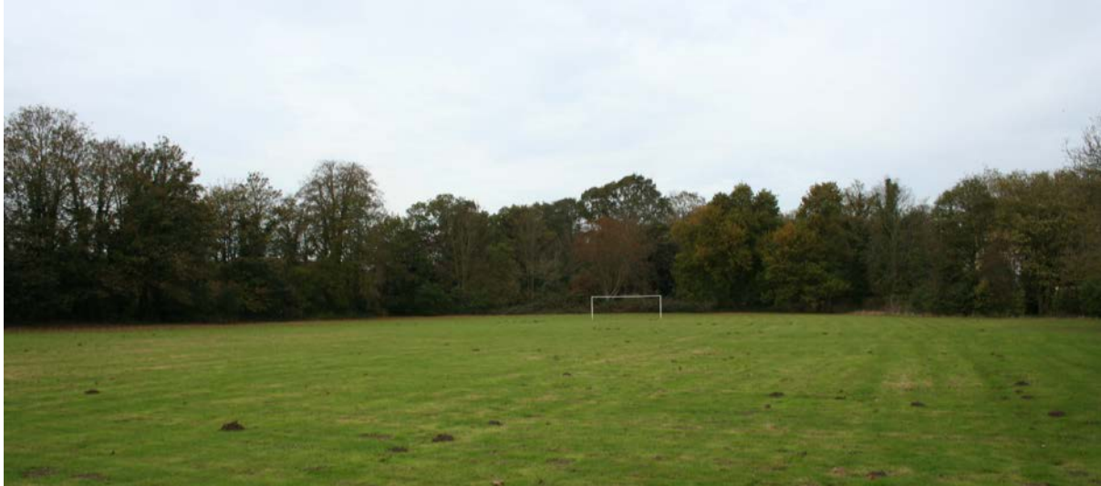
Trees to the north boundary of the playing field / to the south of Kelsale Court, and protected by Tree Preservation Order TPO/44

been seriously eroded, this designed landscape and the adjoining playing fields still form significant green spaces within the Conservation Area. In 1962 the park (prior to the development of Church Close and the playing fields) was designated with a Tree Preservation Order (TPO/44) covering the entire site boundary and the description schedule notes the park as including “...several beech, oak, lime and Scots pine and other species standing in the area of approximately 14.16 acres...”.