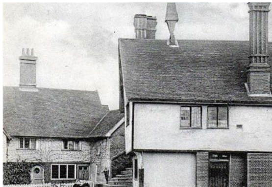
Detail of a c1900 postcard of the Guildhall and Club, at first sight unchanged, but Shaw's bellcote and steps have now gone, and the windows of the Georgian cottage behind have been radically altered