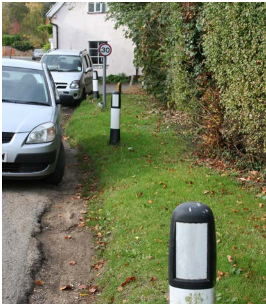
Plastic bollards and speed restriction signage

The plastic reflective bollards, located to the north side of Bridge Street, in conjunction with a 30 mph sign, greatly detract from the visual quality of the simple grass verge.