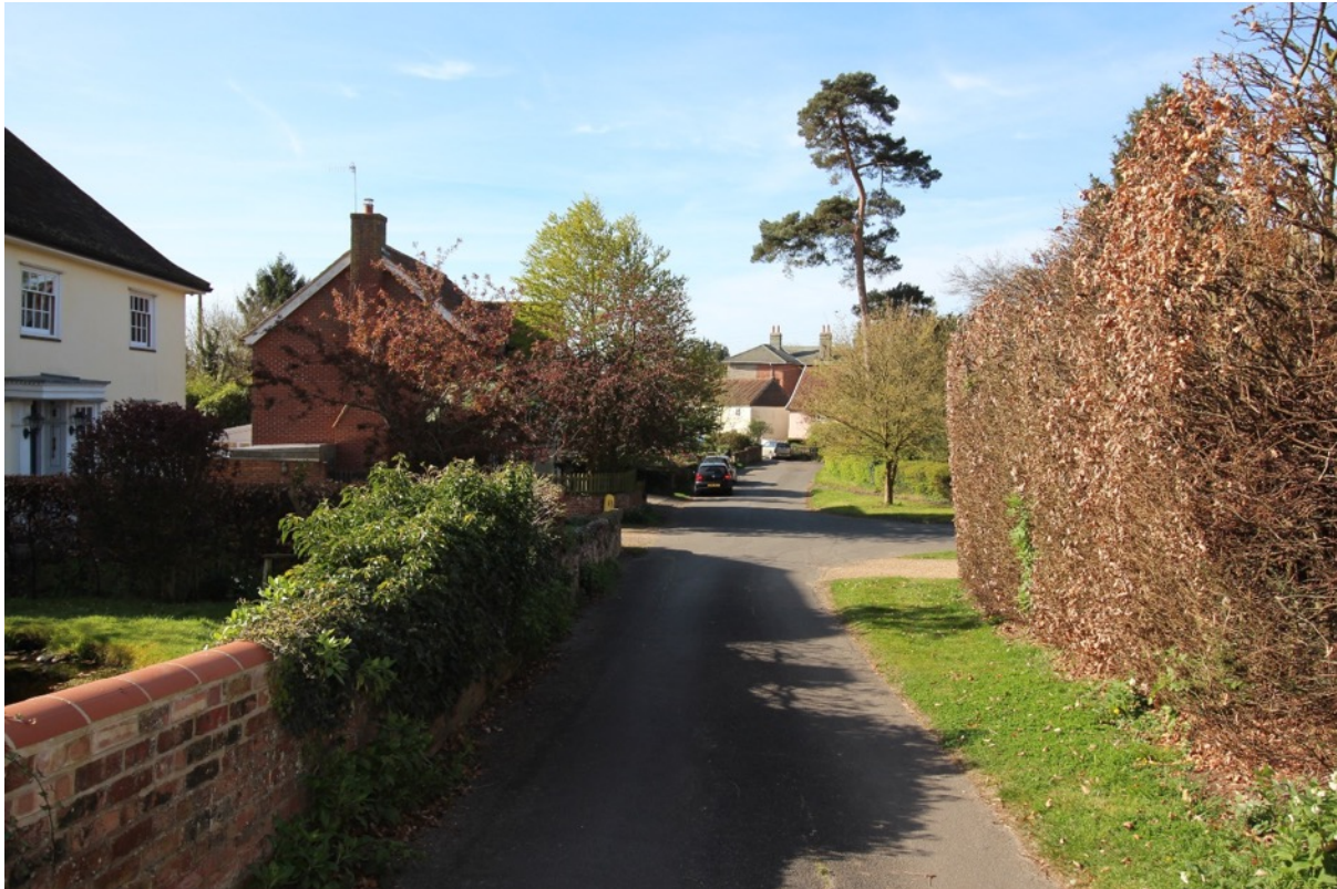
Church Lane looking south with Hill House to the left

A small number of cottages with restrained gothic detailing, which once formed part of the Carlton Hall estate, also survive in the area (although there are none within the Conservation Area). The Carlton Park Industrial Estate and Ronald's Lane Depot now occupy part of the former park of Carlton Hall bordering the B1121. Suburban housing was constructed along Carlton Road after World War Two.