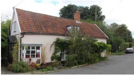
Harvest House, Bridge Street

Harvest House, No.7 Bridge Street and garden wall to Denny's Lane. A one and a half storey cottage which stands on the western corner of Denny's Lane. Possibly of early to mid-eighteenth century date, and reputedly retaining some timber framing. Harvest House is shown as a pair of cottages on the 1904 1:2,500 Ordnance Survey map and on that of 1927. It was in use as a house and Post Office by 1975 but is now a single dwelling. Red pan tile roof, rendered and painted external walls, and a red brick ridge stack. The windows are a mixture of later nineteenth century plate-glass sashes and twentieth century casements. In the centre of the Bridge Street elevation is a dormer window lighting the attics. The entrance door is set within the western return gable, and has shallow twentieth century gabled wooden porch.