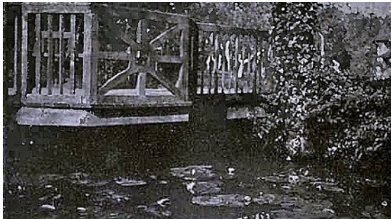
Bridge designed by A Winter Rose c1906, The Old Manor House

The entrance hall has an early twentieth century staircase with slatted balusters and some original panelling. The interior of the house was slightly altered in the 1960s when some 1906 fixtures and fittings were removed. A 1906 gabled porch was moved c2007 when minor alterations were carried out to the design of the architect Bruce Stuart.