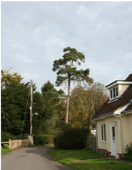
Scots pine to the junction of Church Lane and Church Close and probably protected by TPO/44

It is possible that the impressive Scots pine to the south of the junction between Church Close and Church Lane is the tree covered by the TPO. However, this TPO would benefit from being updated to take account of the development of Church Close, the subdivision of the landscape to the south to form the playing fields, as well as the inevitable loss of trees in the 55 years since the tree preservation order was placed.