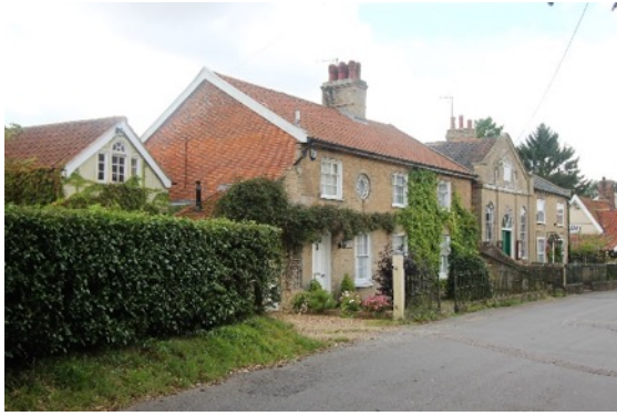
Brook Cottage, Bridge Street

Brook Cottage, Bridge Street Detached house, formerly a semi-detached pair of cottages. The western cottage being smaller than its neighbour to the east. Probably of mid nineteenth century date with c1900 alterations. Altered, and converted into one dwelling c2001, additions of c2011. Built of red brick with a gault brick façade to Bridge Street. Late twentieth century red pan tile roof covering and a single gault brick ridge stack. Twelve light hornless sash windows beneath wedge shaped lintels. Six-panelled door with glazed upper panels to eastern end and scarring of former blocked doorway to western end. The circular window at first floor level appears on Edwardian photographs of the building. Single storey lean-to with red pan tile roof to western end with decorative parapet to Brook Street elevation. Replacement railings to boundary with Bridge Street. Late twentieth century garage block to east.