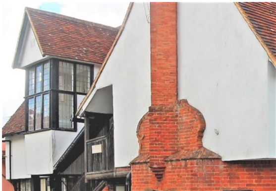
Painted Render, Plain Tile and Decorative Brick

Given the existence of clay pits in Kelsale the use of red brick is surprisingly lacking, although Nos. 3 to 8 Denny's Lane are notable exceptions (and were very possibly constructed from locally dug and fired bricks). Gault rather than red brick was used for high status façades as at Bell House on Church Lane and Kelsale Court.