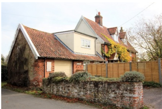
The Old Forge, Bridge Street (west façade)

Brook Cottage, Bridge Street Detached house, formerly a semi-detached pair of cottages. The western cottage being smaller than its neighbour to the east. Probably of mid nineteenth century date with c1900 alterations. Altered, and converted into one dwelling c2001, additions of c2011. Built of red brick with a gault brick façade to Bridge Street. Late twentieth century red pan tile roof covering and a single gault brick ridge stack. Twelve light hornless sash windows beneath wedge shaped lintels. Six-panelled door with glazed upper panels to eastern end and scarring of former blocked doorway to western end. The circular window at first floor level appears on Edwardian photographs of the building. Single storey lean-to with red pan tile roof to western end with decorative parapet to Brook Street elevation. Replacement railings to boundary with Bridge Street. Late twentieth century garage block to east.