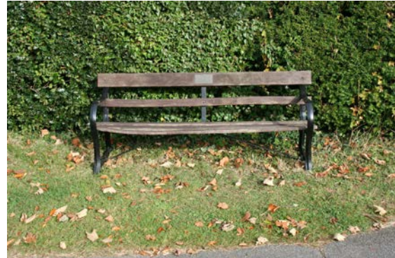
Memorial bench to the west of the lych gate to St. Peter's Church

Telegraph poles and overhead cables are features commonly found in both urban and rural settings. Unless the number of poles and cables is high then such features rarely detract from the special character of a Conservation Area.