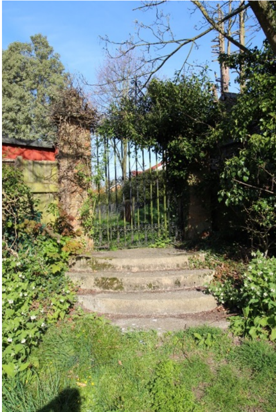
Early twentieth century wrought iron gate, formerly leading to a tree lined walk linking Kelsale Court to the Churchyard

watercourse on the principal drive from the Main Road. Probably of mid to late nineteenth century date; a bridge is shown in this position on the 1840 tithe map but this structure possibly postdates it. The present bridge is certainly shown on the 1884, 1:2,500, Ordnance Survey map. Some twentieth century rebuilding to the parapet. Within the curtilage of the grade II listed Kelsale Court.