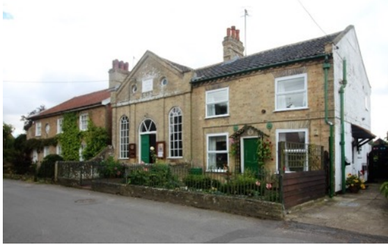
Chapel Cottage and The Methodist Chapel, Bridge Street

Chapel Cottage, Bridge Street A two storey cottage faced in gault brick with a dentilled eaves cornice which is attached to the chapel's western wall. It was originally built as the manse to the adjoining chapel and probably dates from c1851. The window joinery was replaced in the late twentieth century but original openings with wedged-shaped lintels are preserved. Central, nineteenth century four panelled door beneath a wedge-shaped lintel. Late twentieth century trellised wooden porch. Pan tile roof and gault brick stack to the eastern gable. The western gabled return elevation is now painted.