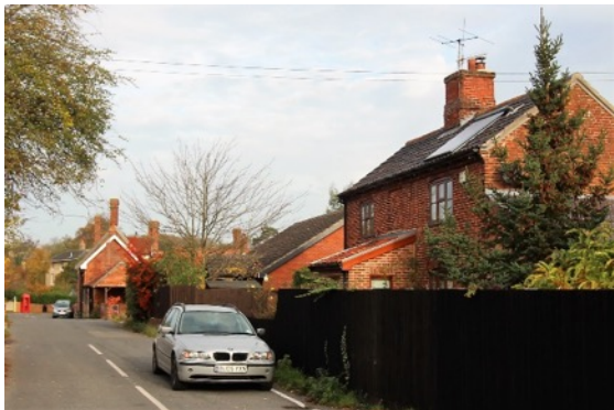
Walnut Tree House, Low Road

however the original window openings with shallow arched brick lintels have been retained albeit without their sills. Single storey late twentieth century red brick lean-to to southern gable end with glazed southern elevation. Lower nineteenth century section to rear beneath a catslide roof. Shown on the 1884 and 1904, 1:2,500 Ordnance survey maps with a porch which was removed in the later twentieth century. This cottage is a key structure at the southern entrance to the Conservation Area.