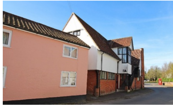
A considerably altered cottage adjoining the G11 listed Club

In order to protect the character and appearance of the Conservation Area, wherever possible the District Council will seek to prevent such inappropriate developments from taking place. To this end the Council has published design guidance and other advisory material and, as opportunities arise, will assist with implementing specific projects aimed at positively enhancing the area.