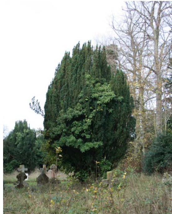
A mature yew tree within the churchyard

Within the Conservation Area there are several clusters of largely self-sown trees, often bordering an open space or private garden. Such clusters of trees may contain important examples. The north and west boundary of the car park is an example of this, and demonstrates clearly the beneficial effect such groups of trees can have in softening an otherwise open and prominent area of hard landscaping.