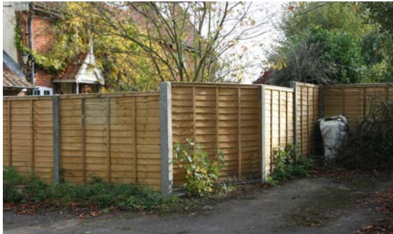
The negative visual impact of fence panels and concrete posts

occasionally seen, as evidenced through small scale extensions, such as porches. Other intrusion includes replacement door or window joinery, the enlargement of window openings, rooflights and solar panels or the use of close-boarded fence panels in favour of and open boundary or hedge planting.