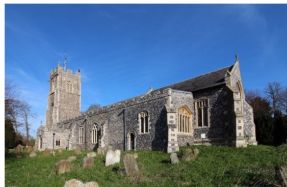
Saint Mary and Saint Peter's Church

Iron Gate and piers on western side of Church Lane – See Kelsale Court, Main Road