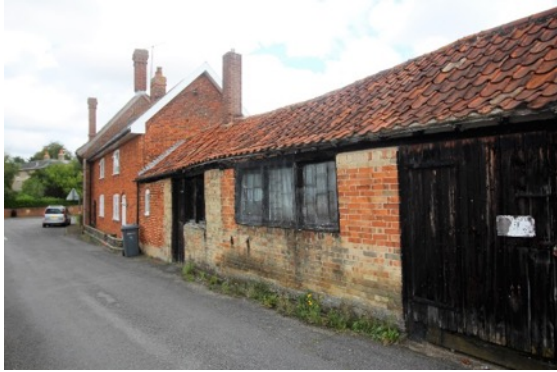
Former Smithy, Low Road

Former Smithy, Low Road A former blacksmith's workshop, which is marked as a smithy on the 1884, 1:2,500, Ordnance Survey map. It consists of a long single storey range which is attached to the southern end of the outshot of Trust Cottage. Probably of early nineteenth century date but much rebuilt. The façade to Low Road was possibly originally partially open-fronted. Red brick, with gault and blue brick infill and a red pan tile roof. Boarded doors and two casement windows. Part of a notable group which also includes the Guildhall and Trust Cottage.