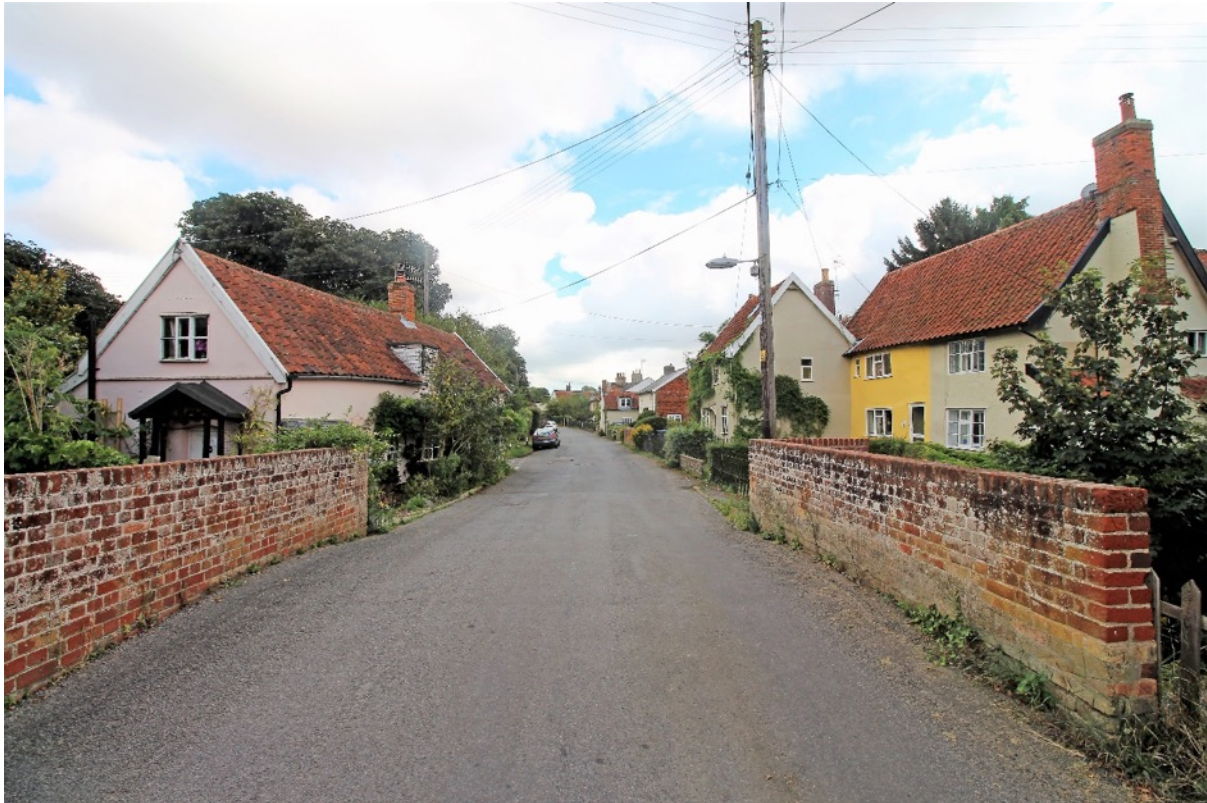
Looking east along Bridge Street with Harvest House (left), and Brookside, Church View and Homeleigh (right) in the foreground. The majority of the houses to the east of this cluster are of mid nineteenth century or later date

The medieval church and its two large mansions, Kelsale Manor and The Old Manor House, occupy the high ground just to the north of the village's historic core. The church tower being the dominant village landmark. Cottages cluster around Bridge Street, Church Lane, and Denny's Lane on the low-lying ground below. Before the nineteenth century, development was largely limited to the western side of the Fromus with only a small cluster of older houses on its eastern bank close to the foot of Denny's Lane. Bridge Street, the village's principal thoroughfare, runs east-west through the centre of the village and has at its western end a medieval timber framed Guildhall.