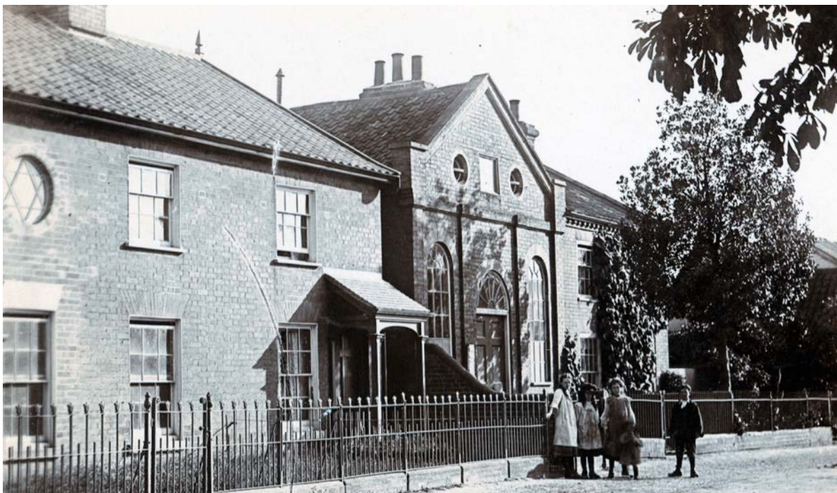
Methodist Chapel, Bridge Street c1905

The village is mentioned in the Domesday Book, and the right to hold a market was first granted in 1086 almost two centuries before Saxmundham was to gain the same privilege. A settlement of some substance must therefore have existed here in the early medieval period. The grade one listed parish church of St Mary and St Peter contains the earliest identified built fabric within the village, dating from the twelfth century. Elements of this may however, be reused, for the church was substantially rebuilt in the late fourteenth or early fifteenth century. There are several foci of settlement around the historic greens within the parish (East, Hams, North, Carlton), including moated sites. There are the two churches of Kelsale and Carlton, and chapel recorded on the 1840s tithe map, at East Green, associated with a scatter of rubble and mortar.