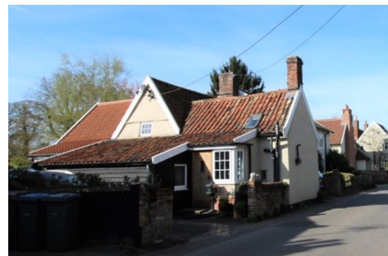
The Lions, Bridge Street

bargeboards. Its principal façade presently has small pane later twentieth century sash and casement windows and canted bay. The western return elevation also has twentieth century casement windows. Single storey lean-to addition to the south. The Old Post Office predates the 1884 1:2,500 Ordnance Survey map. The 1904 Ordnance Survey map shows extensive outbuildings to the rear which have since been removed. Gault brick nineteenth century boundary wall to west and dwarf gault brick wall to Bridge Street frontage.