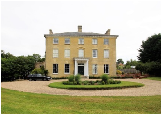
Kelsale Court from the south