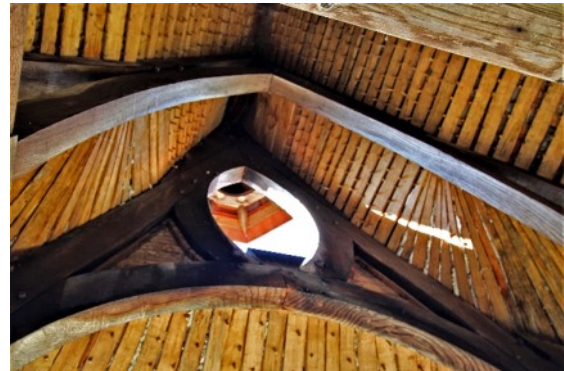
Detail of Edward Prior's lych gate

exists a high number of vernacular structures in Kelsale, there is also a surprisingly high quantity of finely designed structures, some by nationally significant architects.