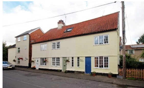
Nos.1-3 (cons) Bridge Street

box was made between 1936 and 1968. The kiosk is prominent in views along Bridge Street and views north along Low Road.