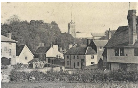
Six Bells and the adjoining demolished Inn c1900

Six Bells, Church Lane. A two-storey painted brick structure, which is prominently located on the corner of Church Lane and Bridge Street. It has a four-bay façade to Church Lane and a single blind bay to Bridge Street. This large plot was also formerly the site of the Six Bells Inn (closed mid nineteenth century demolished post 1945); the filled in cellars of which reputedly survive immediately to the north of the present structure. The existing building also appears to be of mid nineteenth century date. In the Edwardian period it was a house and shop, but it is now (2017) a single dwelling. Red pan tile with eaves projecting over a corbelled eaves cornice. Red brick ridge stack at northern end. Replaced casement windows to first floor. Late twentieth century casement beneath shallow arched lintel to northern ground floor bay.