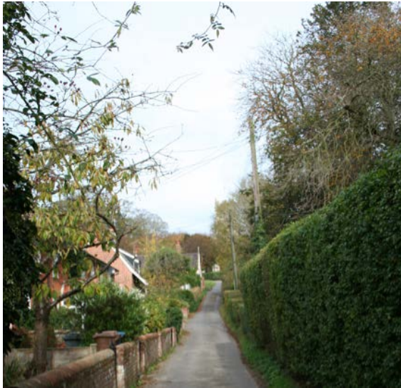
View looking north along Denny's Lane towards the church