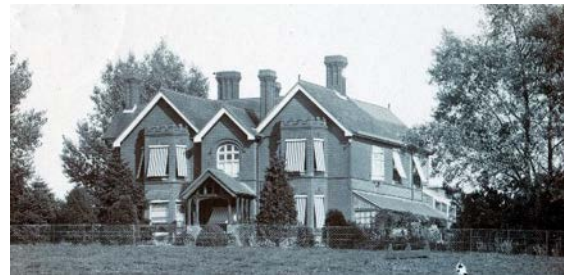
Kelsale Place a notable example of a late nineteenth century villa which stands to the North West of the village (and outside the Conservation Area)

The twentieth century has brought with it some suburban growth fuelled by the close proximity of Saxmundham. The number of shops and workshops within the village declined dramatically after World War Two and the Eight Bells public house on Church Lane (now Bell House) closed in 1987. The number of farms within the parish has also fallen dramatically, and today many of the village's residents are commuters.