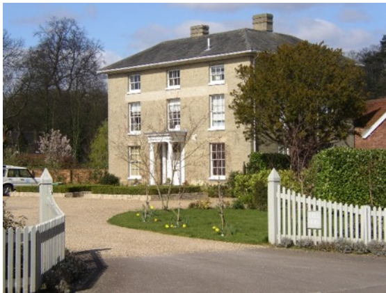
Bell House, Church Lane

Bell House, Church Lane (grade II) A distinguished classical building of early to mid-nineteenth century date with a sixteenth-seventeenth century wing to the rear facing Church Lane. It forms part of a memorable group with Rectory Cottages and is prominently located. Formerly a public house, and shown as the Eight Bells Inn on the 1884 1: 2,500 Ordnance Survey map. It is also recorded as a public house in White's 1855 Directory. The pub closed in 1987 and is now a dwelling. The columned porch is a late twentieth century replacement for the heavy late nineteenth century hood on ornamental cast iron brackets which is recorded in the listing description. This late nineteenth century porch had itself replaced an earlier portico.