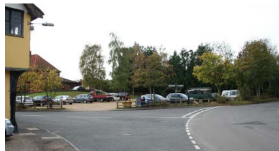
An informal group of trees to the north and west sides of the car park, helping greatly to soften the impact of the hard landscaping

To the south east of the houses located to the south side of Bridge Street is an open green space, important not only to the properties that back onto it, but also in wider views of the southern boundary of the Conservation Area.