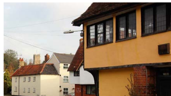
The church tower glimpsed from the corner of Low Road and Bridge Street

To the north, across the churchyard extension area, are wide views across arable land and