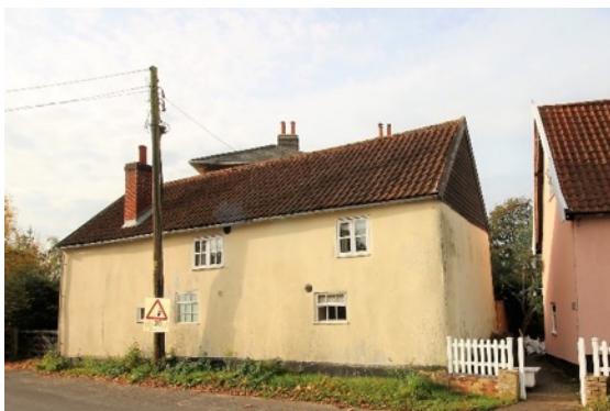
The sixteenth century rear range of Bell House

Bell House, Church Lane (grade II) A distinguished classical building of early to mid-nineteenth century date with a sixteenth-seventeenth century wing to the rear facing Church Lane. It forms part of a memorable group with Rectory Cottages and is prominently located. Formerly a public house, and shown as the Eight Bells Inn on the 1884 1: 2,500 Ordnance Survey map. It is also recorded as a public house in White's 1855 Directory. The pub closed in 1987 and is now a dwelling. The columned porch is a late twentieth century replacement for the heavy late nineteenth century hood on ornamental cast iron brackets which is recorded in the listing description. This late nineteenth century porch had itself replaced an earlier portico.