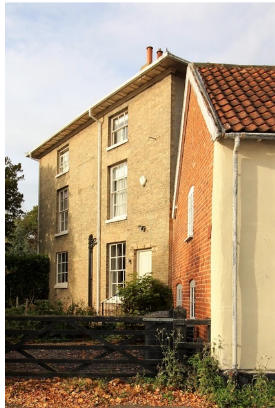
Bell House, Church Lane

The Conservation Area has been appraised, and this report prepared, in accordance with the published Historic England guidance Conservation Area Designation, Appraisal, and Management: Historic England Advice Note 1 (2016).