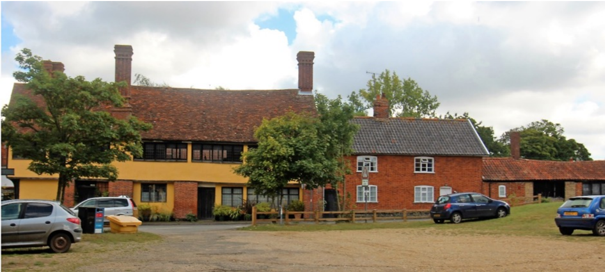
The Old Guildhall, Trust Cottage, and former Smithy on Low Road; a memorable group of historic buildings at the entrance to the Conservation Area

The point at which Low Road, Church Lane and Bridge Street converge can be seen as the centre of Kelsale and it is from this point that the settlement radiates to the north, south and east. Around this junction the area is open; a feeling enhanced by the existence of the Low Road car park to the south west of the junction, and the private garden to Bell House and playing fields to the west.