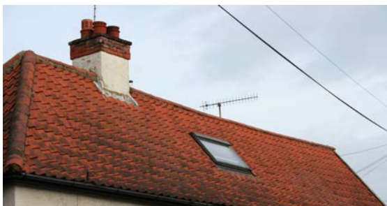
Rooflight and uPVC windows

Within Kelsale modern development has occasionally respected the mass and spatial qualities of neighbouring properties, although both the Church Close development and The Vines have impacted on the setting of listed buildings and have altered the feel of both Church Lane and Bridge street. In both cases the residential developments adopt the layout of a close with structures looking in on themselves; a layout that is at odds with the largely ribbon layout of properties found elsewhere.