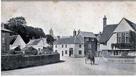
Now altered houses at the corner of Bridge Street and Church Lane from an Edwardian postcard. The former Six Bells Inn immediately behind Bell House has been demolished

In the early modern period agricultural production in the Kelsale area concentrated on barley growing with some oats, hemp, and peas. Horse breeding, pig keeping, and dairy farming were also relatively common. East Green, the last significant area of open land in the parish, was enclosed in 1854.