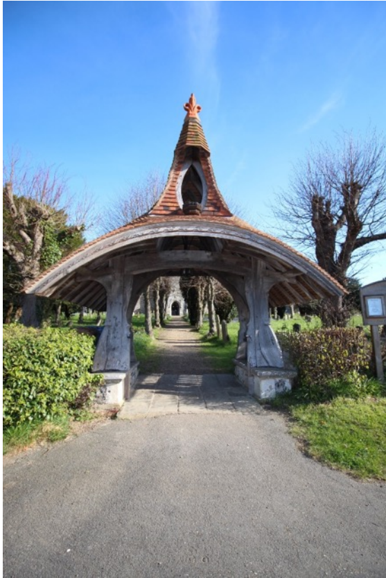
Lych Gate to Saint Mary and Saint Peter's Church