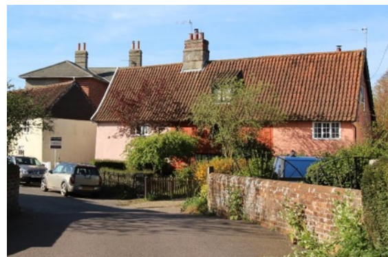
Old Rectory Cottages and bridge, Church Lane

A timber framed and pan tiled outbuilding to the rear renovated c.1980 and incorporated into the main building. At the Church Lane and Bridge Street corner is a prominently located red brick and cobble boundary wall of probably early nineteenth century date, which forms an important part of the setting of the grade II listed structure. The adjoining wooden gate piers and picket fence are of late twentieth century date. Further weatherboarded outbuilding with a replaced red pan tile roof to rear. Bettley, J, and Pevsner, N, The Buildings of England, Suffolk: East (London, 2015) p381.