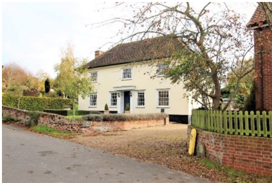
Hill House from the south west

Hill House, and boundary wall, Church Lane A substantial detached house which is shown on the 1840 tithe map. Altered eighteenth century façade to earlier timber framed building. It has a two-storey façade to Church Lane of three wide bays, and is rendered with a hipped red plain tile roof. Substantial red brick stacks to north façade and rear kitchen range. Sixteen light, hornless sashes to ground floor and twelve-light sashes above; all within moulded wooden frames. Centrally placed twentieth century doorcase. Return elevations of two wide bays with a further single storey outshot to the rear. Interior with exposed beams to ceilings and studded walls.