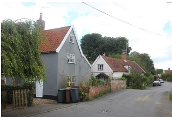
Bridge House, No.6 Bridge Street, the bridge, and Harvest House

The eastern elevation has a jettied first floor section at the southern end below a catslide roof, with a single casement window to each floor. Gabled dormer with bargeboards to north. The western elevation has a boarded front door and two casement windows within the older southern section. The lower, more recent section, has a later twentieth century flat roofed dormer. Bridge house forms part of a picturesque group with the adjoining houses to the east and west. Red brick boundary wall to Bridge Street forming a continuation of the Bridge's parapet and returning along the western boundary of the property.