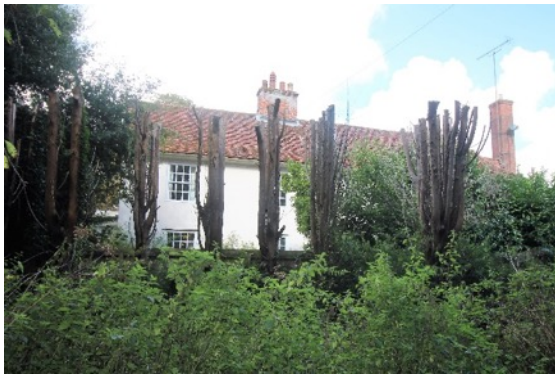
Kelsale Manor from Tiggin's Lane