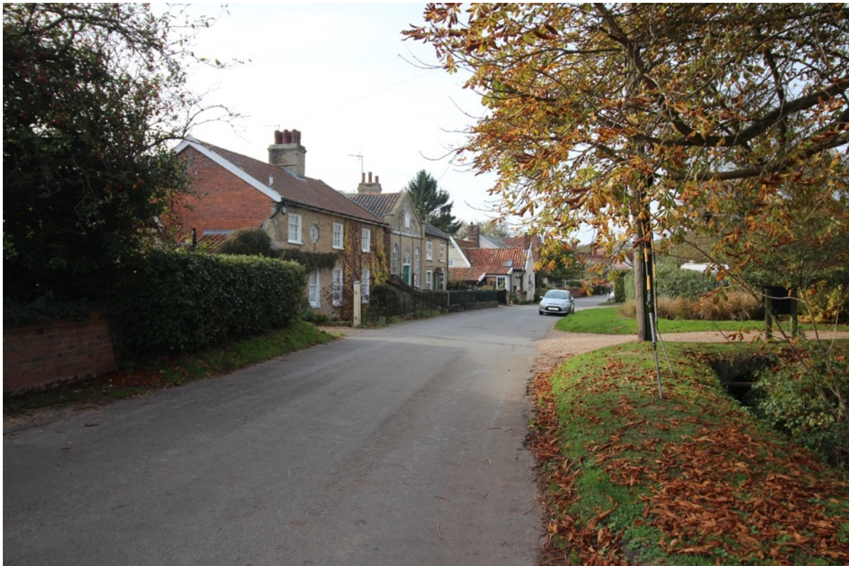
Bridge Street looking west towards the Methodist Chapel

Also significant is the view north along Denny's Lane terminating at the lych gate, and the reverse view from the vantage point of the lych gate looking south along Denny's Lane towards Bridge Street. South west along Church Lane are views that take in clusters of historic buildings and some significant individual or clustered groups of trees.