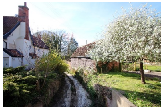
Outbuildings to The Cottage, Bridge Street

Facing north onto Bridge Street is a narrow gabled two storey porch, containing centrally opening boarded entrance doors, which are flanked by square section wooden columns on brick plinths. The columns support a large mullioned and transomed window with leaded lights at first floor level, whilst above, within the gable is the date 1891, which was formerly surrounded by restrained pargetted decoration. A flight of steps leads from the porch to a small overhanging first floor balcony, the roof swept over this stairway. The Bridge Street gable has an external stack set diamond-wise with brick consoles at first floor level. The Social Club is joined to the 'The Old Guildhall' (see Low Road) by an earlier brick wing, part of Corner Cottage which was formerly the School Master's house/ Caretakers house. Bettley, J, and Pevsner, N, The Buildings of England, Suffolk: East (London, 2015) p.380. Cook, MG Edward Prior, Arts and Crafts Architect (Marlborough, 2015) p68-69. Walker, L.B, ES Prior 1852-1932 (London, 1978).