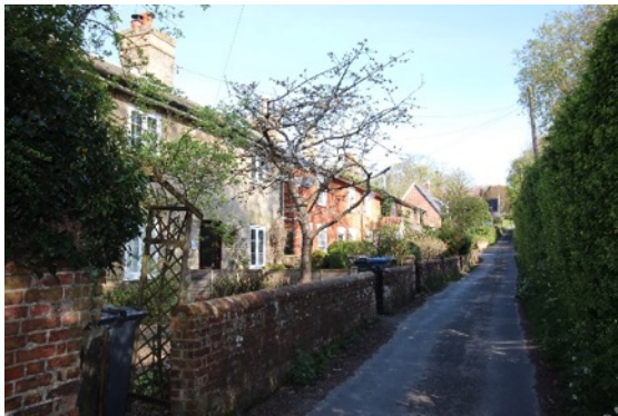
Nos. 1 & 2 Denny's Lane

Adams Cottage No. 1 & No.2 Denny's Lane and boundary wall to front. A semi-detached, early to mid-nineteenth century pair of cottages with a gault brick faced façade to Denny's Lane. Shallow pitched Welsh slate roof. Denny's Lane façade has replaced casement windows within original openings and wedge-shaped gault brick lintels to the openings. Both houses have replaced, partially glazed front doors. Adams Cottage with single storey late twentieth century conservatory addition. Red brick garden wall to Denny's Lane possibly of later nineteenth century date. These cottages were reputedly constructed by Samuel Clouting who presented them to the parish. Used as a girls' school in the nineteenth century. They were sold by the church in 1984. A c1900 postcard of No.1 labelled 'Nurses Cottage' is reproduced in Neave, D A Second Look at Saxmundham and area (Saxmundham, n.d.) p26. This shows the house with centrally opening casement windows, each panel divided into three lights.