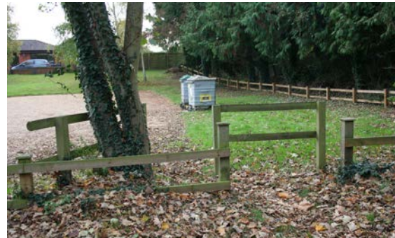
The importance of grass verges, vegetation and the loose chipping surface to the car park. The positioning of bins and street furniture needs further consideration

for helping this large open area integrate with the rest of the Conservation Area. More thoughtful positioning of bins and street furniture would help enhance this space.