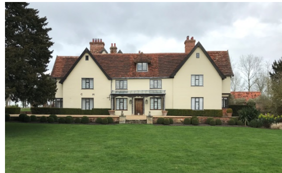
Old Manor House, Bridge Street (Grade II)