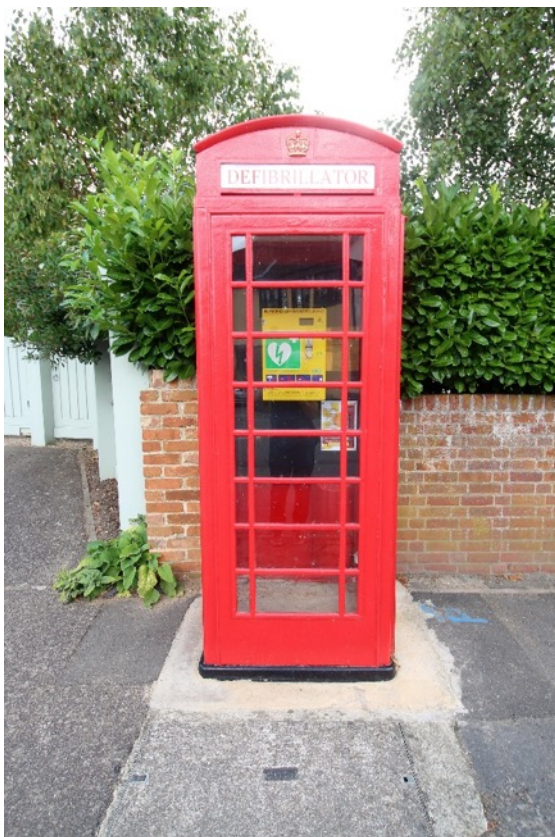
Defibrillator Unit, Bridge Street

Structures in Bridge Street are listed in east to west order.