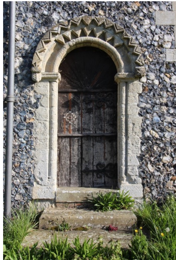
A reset twelfth century doorway at Saint Mary and Saint Peter's Church. The church was rendered until the late nineteenth century

The village's traditional shop fronts have disappeared as the shops themselves have been converted into dwellings.