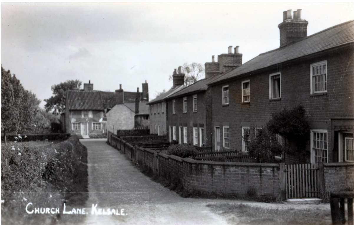
Early nineteenth century cottages on Denny's Lane photographed c.1910