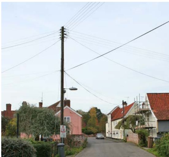
Telegraph pole, street light and associated cables, Bridge Street

Pavements within the Conservation Area tend to be of standard appearance – raised concrete kerbs with a tarmac surface. This uniformity helps such features appear less intrusive and it is therefore important that the use of differing materials in a small or confined area are restricted to help minimise their visual impact.