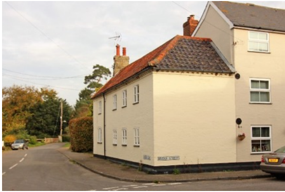
Six Bells, Church Lane

Six Bells, Church Lane. A two-storey painted brick structure, which is prominently located on the corner of Church Lane and Bridge Street. It has a four-bay façade to Church Lane and a single blind bay to Bridge Street. This large plot was also formerly the site of the Six Bells Inn (closed mid nineteenth century demolished post 1945); the filled in cellars of which reputedly survive immediately to the north of the present structure. The existing building also appears to be of mid nineteenth century date. In the Edwardian period it was a house and shop, but it is now (2017) a single dwelling. Red pan tile with eaves projecting over a corbelled eaves cornice. Red brick ridge stack at northern end. Replaced casement windows to first floor. Late twentieth century casement beneath shallow arched lintel to northern ground floor bay.