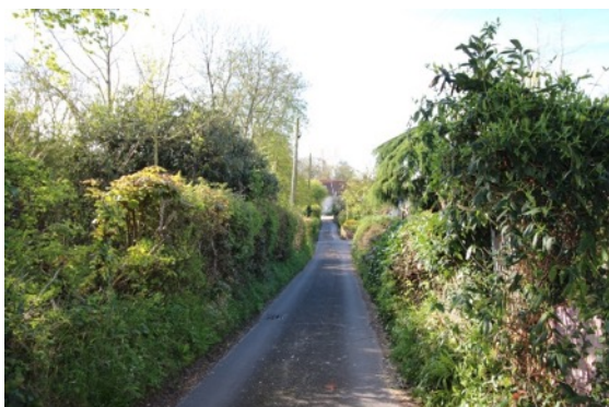
Denny's Lane looking south

A commercial vineyard established within the grounds of The Old Manor House in 1967, was reputedly the first in Suffolk for many hundreds of years.