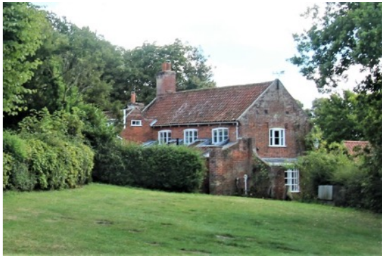
The Old School House, Denny's Lane

stands appears to have belonged to Hill House Church Lane at that time. The present Walnut Tree cottage probably dates from c1850. It is shown on the 1884 Ordnance Survey map. Altered nineteenth, and twentieth century outbuildings to immediate west not of significance. Walnut Tree Cottage forms an important part of the setting of the grade one listed parish church when viewed from Denny's Lane.