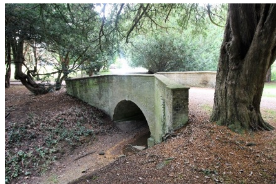
Bridge on drive, Kelsale Court

Historic maps show Kelsale Court to have once had extensive and well-planned grounds. The north-eastern section of the house's gardens has now been built over and the extensive walled gardens and greenhouses lost. Whilst the southern section is now playing fields. The wooded section to the west and north west of the house through which the drive passes is now the best-preserved section of the grounds. The planting here appears to be primarily of later nineteenth or early twentieth century date and includes evergreens, but its basic layout is that shown on the 1840 tithe map. The former tree lined walk to the churchyard has been preserved as a narrow footpath between late twentieth century houses.