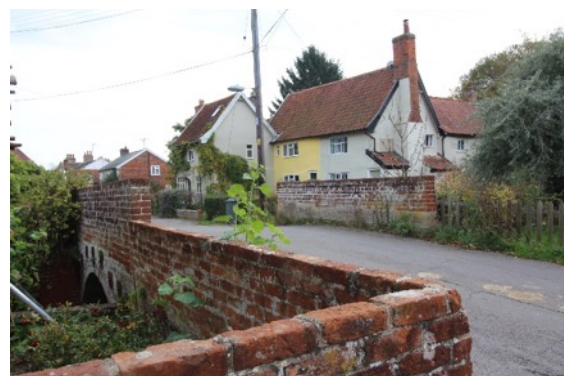
Road Bridge, and boundary wall to Bridge House, Bridge Street

Bridge House, No.6 Bridge Street and boundary wall to Bridge Street A detached dwelling which is possibly partially of later seventeenth or early eighteenth century date, and was extended to the north in the later twentieth century. It stands at a right-angle to Bridge Street, on the western side of the bridge. The original building is rendered, with a steeply pitched red pan tile roof and is of two storeys with attics.