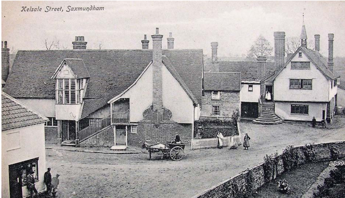
Kelsale Social Club, The Old Guildhall and Corner Cottage c1910. Richard Norman Shaw's bellcote on the Guildhall roof has since been removed and the porch of the Social Club has lost some of its pargetted decoration

The earliest identified secular building within the Conservation Area is the Old Guildhall which contains fabric of probably late fifteenth century date. The Old Guildhall derives its name from the Guild or Fraternity of St John the Baptist which appears to have flourished in the village from the early fifteenth century. More than half of the wills of Kelsale people proved between 1439 (the earliest surviving) and 1539 mention this Guild. The Guild is recorded as owning at least 40 acres of land in the surrounding area in 1490, a remarkably large holding given the average size of farms of the period.