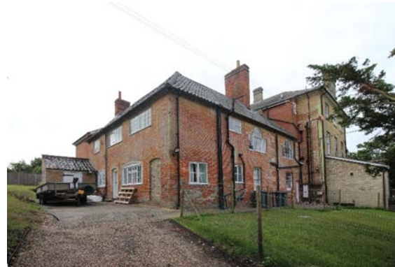
Kelsale Court from the north-west

Alston, L, Kelsale Court, Kelsale (Bures Saint Mary, 2015) Bettley, J, & Pevsner, N, The Buildings of England, Suffolk: East (London, 2015) p381.