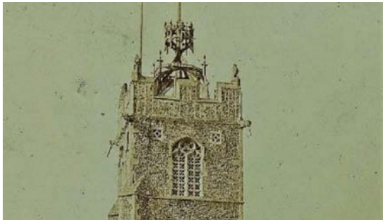
The Corona, Saint Mary and Saint Peter's Church. Now removed.