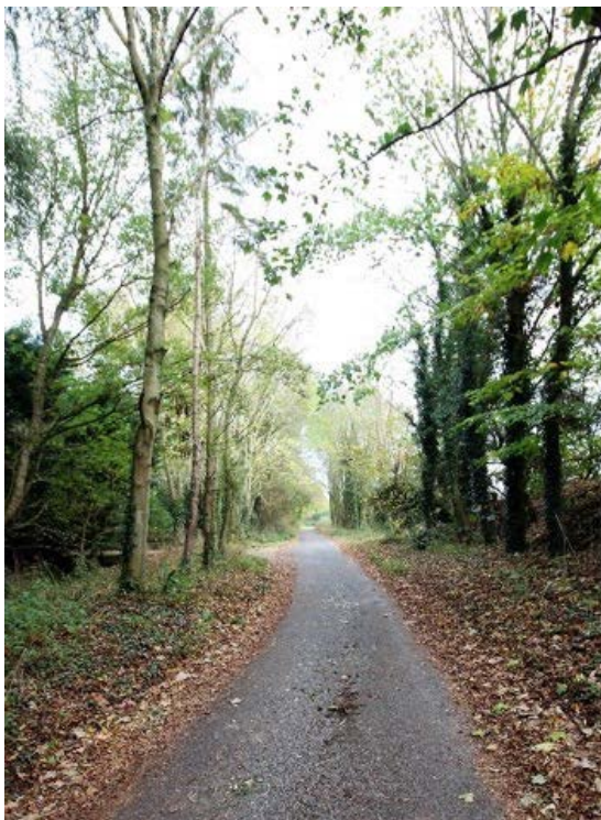
View looking south west along Tiggins Lane

Other railings, of mid twentieth century date, have a more utilitarian appearance but usefully guard the public from a ditch or watercourse. The retention and maintenance of these low-key features is important on safety grounds. While not intrinsically of historic merit, if replaced any future item should adopt the low-key appearance and simplicity of design as the extant items.