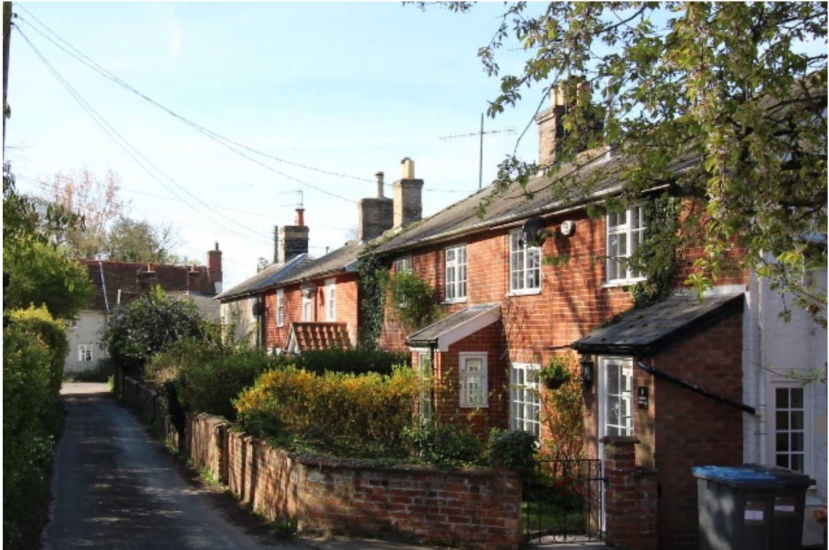
Denny's Lane looking south towards Bridge Street