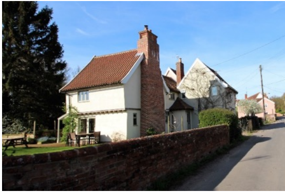
Church View Bridge Street, from the east

The lower rendered range to the south probably dates from the early nineteenth century. To the east is a large rendered c2012 addition designed in the manner of a vernacular sixteenth or seventeenth century jettied dwelling. Large projecting red brick stack to the centre of the north gable, and a red pan tile roof. The eastern elevation has a single casement window at first floor level and large glazed doors beneath.