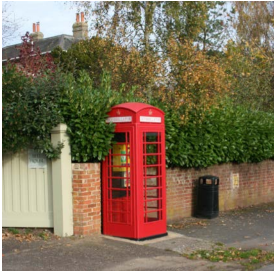
A K6 telephone kiosk to the north side of the junction of Church Lane and Low Road. Installed c2015 and used to house a defibrillator