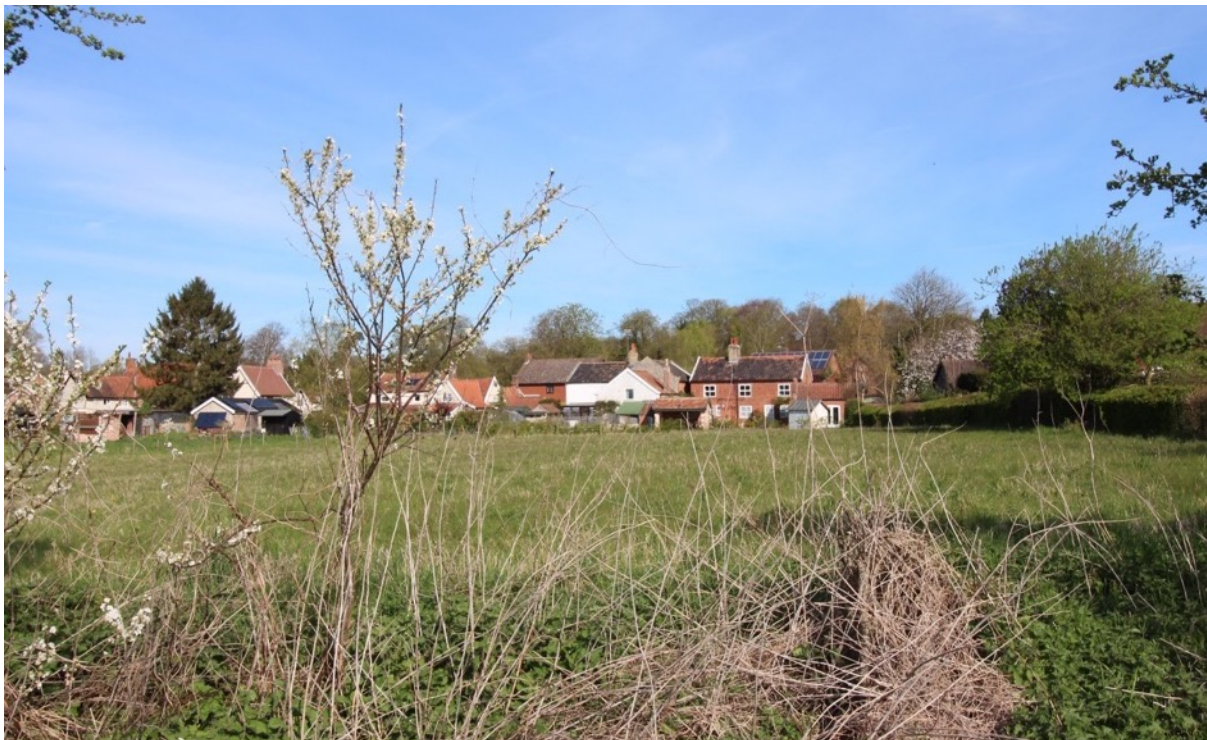
A field to the south of houses on Bridge Street looking north

The landscape surrounding Kelsale Court is located between the core of the village and the B1121 and once contained an extensive walled garden, lawns, woodland, and greenhouses. The eastern part of this designed landscape was developed in the 1960s to form Church Close, and c1973 the southern most section of the park was separated off to become the playing fields which replaced the original recreation ground of 1926. Although the historic parkland surrounding Kelsale Court has