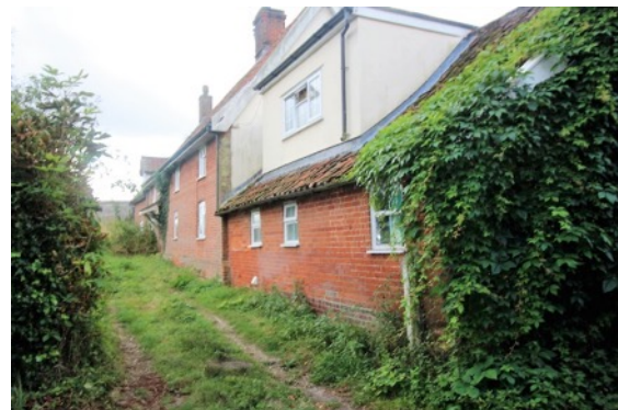
The Old Forge, Bridge Street (east façade)

has latterly been converted into living accommodation. The house's principal façade faces west, and the house stands at a right-angle to Bridge Street. Built of red brick with a steeply pitched red pan tile roof. Its external appearance is that of an early nineteenth century structure, but it may contain elements of a much earlier building. The Old Forge is marked as a smithy on the 1903 Ordnance Survey map and included in the auction of the Church Farm (Old Manor House) estate in 1905. Two storey principal façade of red brick with small pane casement windows. Two substantial gabled dormers within roof slope. Former Blacksmith's workshop of a single storey, its pan tile roof now with an excessively large flat roofed dormer to both the east and west elevations. A significant building in views into the Conservation Area from the east and south.