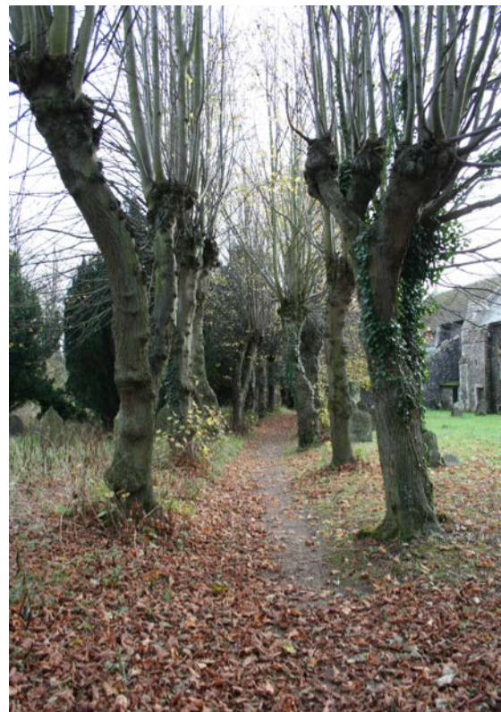
Tree lined path to the north of the church

To the north-west of the village, along Tiggins Lane, is a dense belt of trees which visually separates the grounds of Kelsale Court and Kelsale Manor. These tree belts give Tiggins Lane an enclosed woodland character and form a critical part of the setting of the listed buildings in the immediate area.