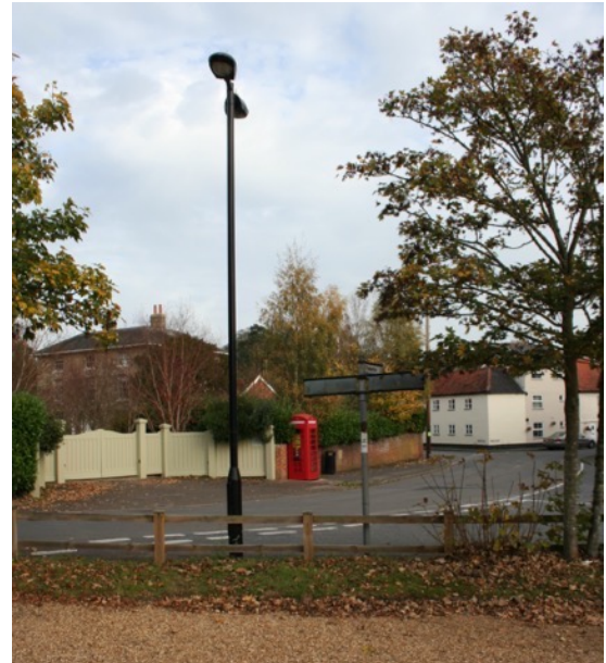
The Low Road car park, looking north towards Bridge Street and Church Lane

The hardening of an area through the introduction of pavements and kerbs is subtle but evident, and where possible grass verges without raised kerbs should be retained to avoid creating a suburban character.