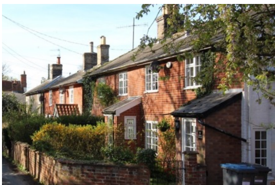
Altered early nineteenth century cottages on Denny's Lane

Other undesirable changes can include alterations and extensions which do not respect the scale, form, and detailing of existing buildings, the use of modern materials and details, insensitive highway works and signage, unsympathetic advertising and the construction of intrusive walls, balustrades, fences, driveways, garages, and other structures. The use of concrete tiles, artificial slates, uPVC and aluminium windows and doors, cement render and modern bricks should all be avoided. So too should the use of brown stain on timber joinery as it invariably appears as a discordant feature.