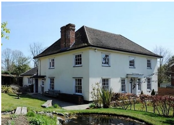
Hill House, and boundary wall, Church Lane

Hill House, and boundary wall, Church Lane A substantial detached house which is shown on the 1840 tithe map. Altered eighteenth century façade to earlier timber framed building. It has a two-storey façade to Church Lane of three wide bays, and is rendered with a hipped red plain tile roof. Substantial red brick stacks to north façade and rear kitchen range. Sixteen light, hornless sashes to ground floor and twelve-light sashes above; all within moulded wooden frames. Centrally placed twentieth century doorcase. Return elevations of two wide bays with a further single storey outshot to the rear. Interior with exposed beams to ceilings and studded walls.