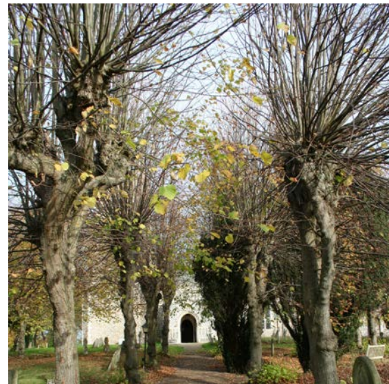
View looking north from the lych gate towards the church

To the north-west corner of the churchyard is a public footpath that descends down to the lower lying Tiggins Lane. The feeling of this path and view is informal, confined, and enclosed. It is an unusual view in the context of the Conservation Area as it is devoid of structures, hard landscaping or street furniture.