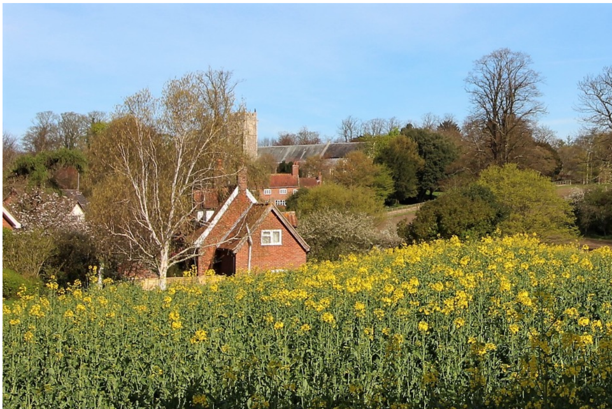
The village from the south east with the parish church and Old School House in the distance. In the foreground is The Old Forge