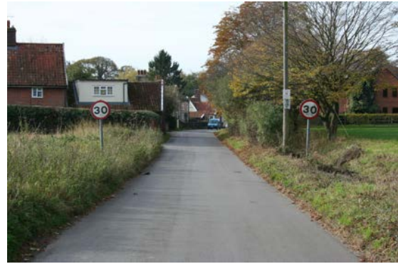
Speed restriction signs and the lack of formal pavements and kerbs to the eastern end of Bridge Street

Parking appears to not be deterred as a result of them being in situ, and therefore where safety and public amenity would not be compromised, removal of such items should be considered.