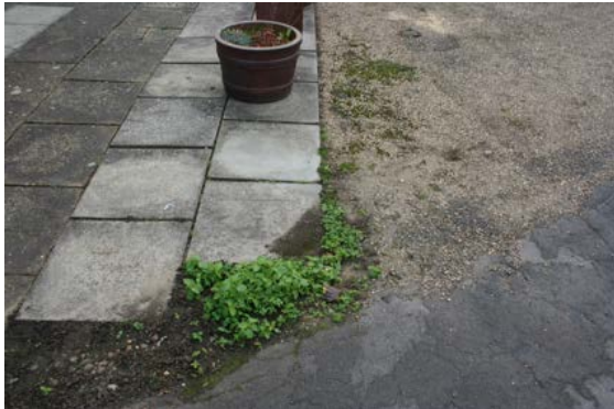
The varied use of surface materials within a small public space

replacement with something freestanding and located away from the designated heritage asset.