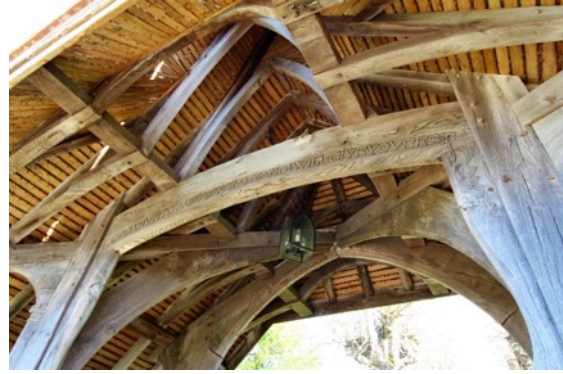
Roof structure of the Lych Gate to Saint Mary and Saint Peter's Church