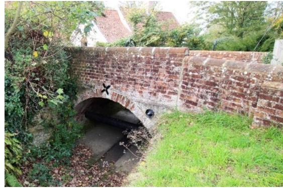
Bridge over brook and retaining wall, Church Lane

No.1 Church Lane (formerly known as Triple Villas). A rendered red brick dwelling which was formerly a pair of cottages. The building is shown on the 1840 tithe map. The slightly lower bay at the eastern end is shown as a separate dwelling on the 1904 1:2,500 Ordnance Survey map, but by 1927 the building is shown as a single dwelling. The house stands at a right-angle to the road, close to the western end of Old Rectory Cottages and contributes positively to their setting. Red pan tile roof with catslide to the north side over a single storey outshot. Simple late twentieth century bargeboards. Boarded doors, and casement windows of early twenty first century date. Western gable with bay window to first floor with a red pan tile roof. Canted bay to ground floor of eastern gable. The house's northern elevation is also visible from Church Close.