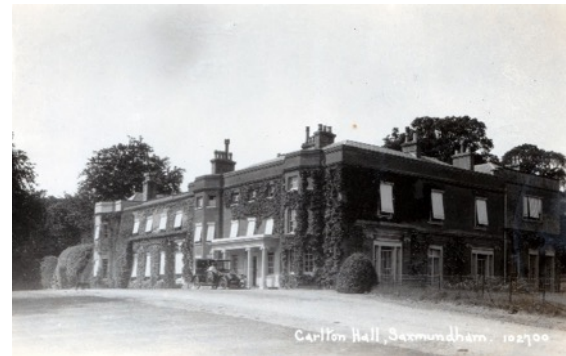
Carlton Hall, now demolished, from a c1918 postcard

Further north beyond the Conservation Area is Simpsons Fromus Valley Reserve; twenty seven acres of ancient woodland, ponds, and meadow which was purchased by The Suffolk Flora Trust in 2005, and which once formed part of a medieval deer park.