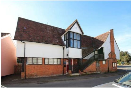
Kelsale Social Club and Corner Cottage