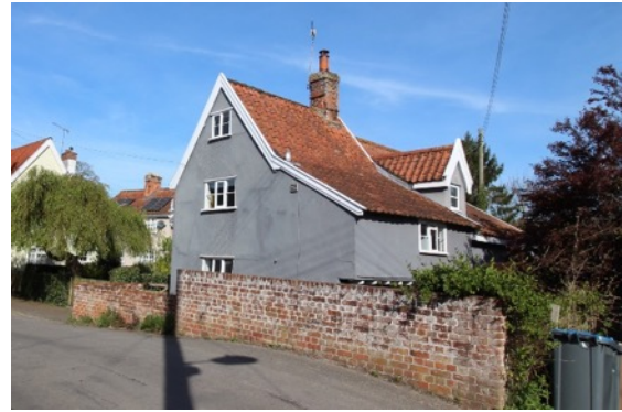
Bridge House, Bridge Street

Nos.4 & 5 Bridge Street A semi-detached pair of cottages set back from the road and partially behind Nos.1-3. Both houses are shown on the 1884 1:2,500 Ordnance Survey map, although the western cottage (No.4) appears to have been formed from two smaller dwellings in the mid-twentieth century. A building of this approximate form is also shown on the 1840 tithe map. No.4 is taller than its eastern neighbour, and has a rendered façade with late twentieth century small-pane casement windows. It has a late twentieth century red pan tile roof with solar panels, and at its eastern end is a red brick chimney stack. No.5 is a small rendered cottage with a red pan tile roof. It has a symmetrical two storey south front facing Bridge Street, with a central boarded door and small pane casement windows. Part of a picturesque group with Bridge House and Harvest House. The garage block to No.5 is not included.