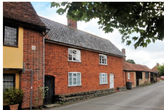
Trust Cottage, Low Road

The main feature of the building is the fine five bay crown post roof: cambered and arch-braced tie beams, four crown posts of square-section with moulded bases and heads. The remainder of the interior is much altered. Bettley, J, and Pevsner, N, The Buildings of England, Suffolk: East (London, 2015) p.381. Holland C.G, Kelsale Guildhall in Proceedings of the Suffolk Institute of Archaeology, Vol.30 (part 2), pp.129-148. Saint, A, Richard Norman Shaw (London, 2010) p429