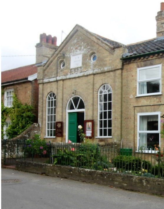
Methodist Chapel, Bridge Street

Chapel Cottage, Bridge Street A two storey cottage faced in gault brick with a dentilled eaves cornice which is attached to the chapel's western wall. It was originally built as the manse to the adjoining chapel and probably dates from c1851. The window joinery was replaced in the late twentieth century but original openings with wedged-shaped lintels are preserved. Central, nineteenth century four panelled door beneath a wedge-shaped lintel. Late twentieth century trellised wooden porch. Pan tile roof and gault brick stack to the eastern gable. The western gabled return elevation is now painted.