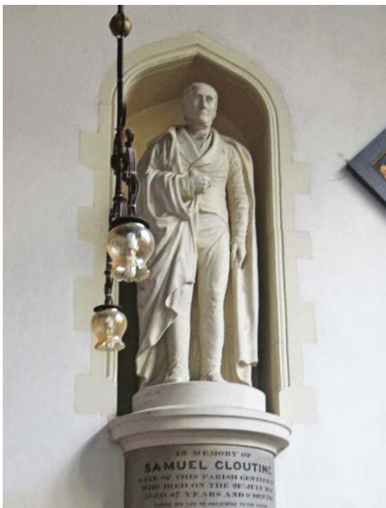
Memorial to Samuel Clouting, local benefactor and builder of Bell House. The statue is by Thomas Thurlow

In the early modern period agricultural production in the Kelsale area concentrated on barley growing with some oats, hemp, and peas. Horse breeding, pig keeping, and dairy farming were also relatively common. East Green, the last significant area of open land in the parish, was enclosed in 1854.