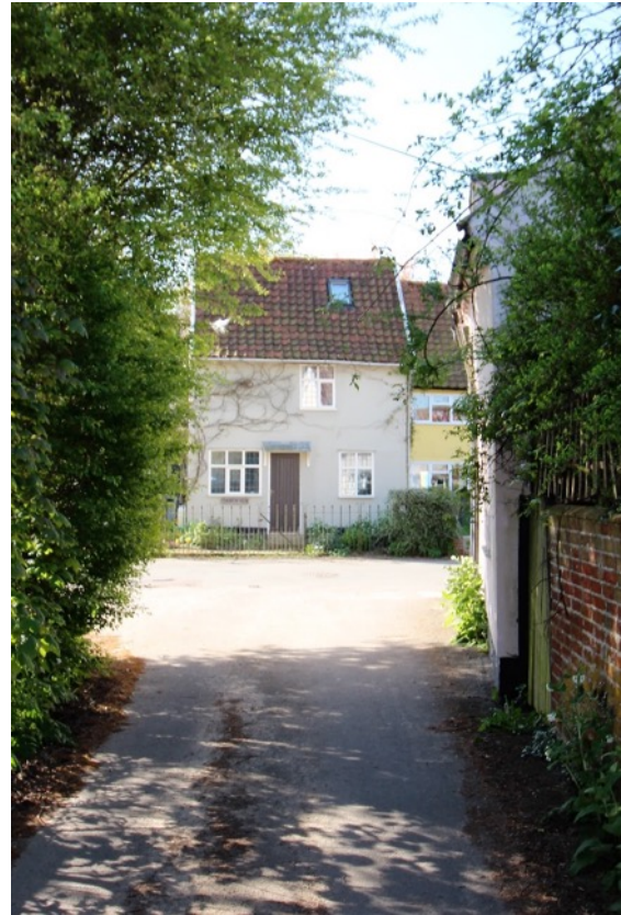
Church View Bridge Street, from Denny's Lane

Brookside and Homeleigh, Bridge Street A possibly early seventeenth century timber framed house which is now subdivided into two cottages. It had become two dwellings before the publication of the 1904 Ordnance Survey map. Rendered elevations with a steeply pitched roof with red pan tile covering. Brookside has a substantial two storey rear range and a large red brick external stack on its western gable. On its Bridge Street frontage, there is a single six-light casement window on each floor, that to the first floor having leaded lights. Its front door is set in a lean-to addition to the west abutting the end stack. It has a six-panelled door set in a simple moulded frame. Exposed timber framing within. The doors and windows to the Brook Street façade of Homeleigh have been unsympathetically replaced. A studded partition survives at attic level within Homeleigh and very large chimneybreast and exposed beams at ground floor level.