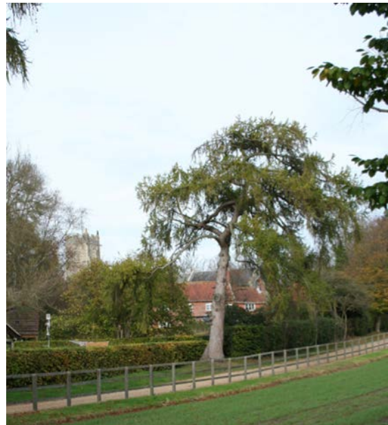
Specimen tree, possibly walnut, to the west of the drive to The Old Manor House, and probably covered by TPO/90

Within the confines of the Kelsale Conservation Area are the remnants of at least two significant designed landscapes. The first is that of Kelsale Court; a substantial and architecturally distinguished grade II listed former rectory dating mostly from the early nineteenth century and built by the Reverend Lancelot Robert Brown, grandson of the esteemed landscape architect Lancelot 'Capability' Brown. The second is that of The Old Manor House; a grade II listed late sixteenth or early seventeenth century house, located close to the church, and skilfully remodelled c1906 and with contemporary formal gardens by Captain Algernon Winter Rose MC (1885-1918)