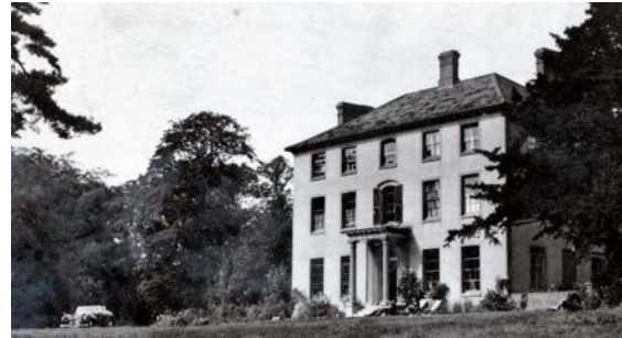
Kelsale Court c1950