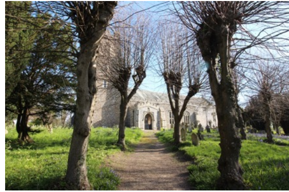
The parish church from the south showing some of the trees found within the churchyard

To the south west corner of the landscape associated with The Old Manor House is a development of four twentieth century houses known as The Vines. Although the area is not significant in terms of being an open or green space, located within the development are five trees protected by a Tree Preservation Order (TPO/90). The Order, designated in 1969, lists three walnut trees, a lime, and a horse chestnut. Also included on the Order is a separate group of trees, to the south west of the site and bordering Dennys Lane, which includes four horse chestnuts, three limes and one laburnum. It is not clear which of the latter group remain.