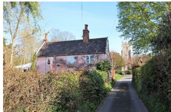
Walnut Tree Cottage, Denny's Lane

Nos. 3-5 (cons) Denny's Lane and boundary wall to front A terrace of three early to mid-nineteenth century red brick cottages, probably built in two stages; a straight joint being evident between No.3 and the mirrored pair of cottages which form Nos.4 & 5. Shallow pitched Welsh slate roof with gault brick ridge stacks and overhanging eaves. Original window and door openings with wedge-shaped brick lintels retained. No.5 now however, has a late twentieth century gabled porch of painted weatherboarding on a high red brick plinth. Replaced small pane sash windows. Rear elevations considerably altered. No.4 with a two storey gabled and rendered rear addition, No.5 with a late twentieth century single storey red brick lean-to addition but retaining its original first floor window opening. Good nineteenth century red brick garden wall shared with Nos.1 & 2.