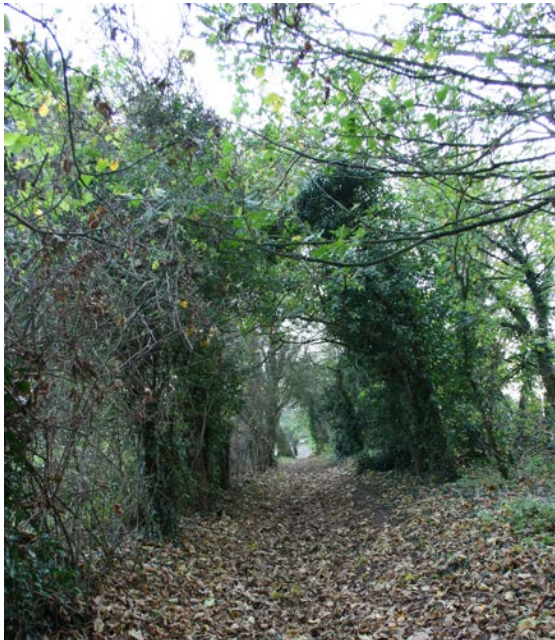
The footpath from the churchyard looking west towards Tiggins Lane

The most expansive views within the core of the village are found around the staggered crossroad junction of Church Lane, Low Road, and Bridge Street. Here, owing to the car park to the south, private gardens, and the adjacent playing field to the north the area feels open. A group of notable and predominantly listed buildings around the junction means there is considerable variety and quality to be seen.