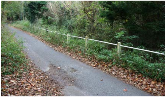
Concrete posts and iron guard rail on Tiggins Lane, providing a safety barrier between the road and stream

Other railings, of mid twentieth century date, have a more utilitarian appearance but usefully guard the public from a ditch or watercourse. The retention and maintenance of these low-key features is important on safety grounds. While not intrinsically of historic merit, if replaced any future item should adopt the low-key appearance and simplicity of design as the extant items.