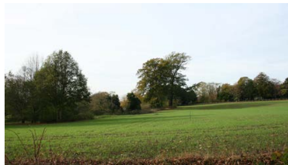
View from Bridge Street looking north towards The Old Manor House

Intimate and focussed views are found along Tiggins Lane, where the high number of trees with their interlinking canopies overhanging the road provides short and attractive vistas.