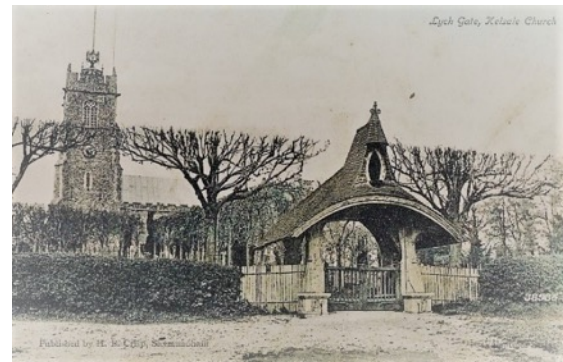
The Church and lych gate c1910

deciduous woodland, extensive hedgerow network, small landscaped parks of eighteenth or early nineteenth century date, winding often sunken lanes, and undulating landscape. The clay soil on which Kelsale stands was in the later eighteenth and nineteenth centuries used for brick making and a number of former clay pits survive around the edges of the village.