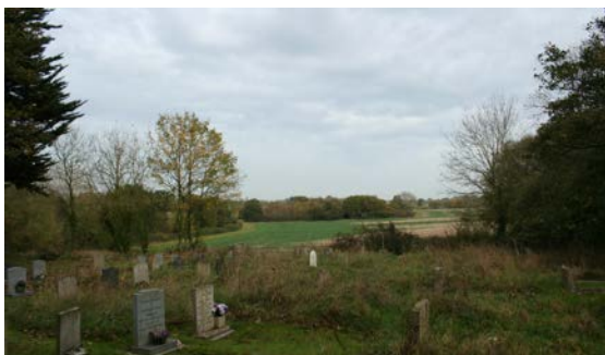
View looking north from the churchyard extension area to open countryside

The buildings clustered around three sides of the junction are generally taller in stature and of greater mass than is found elsewhere in