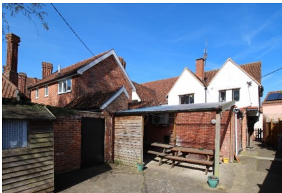
South elevation of the Social Club