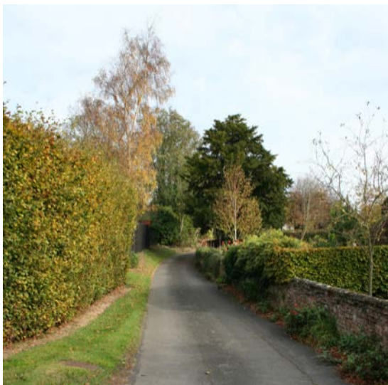
The attractive, rural and understated quality of Church Lane is enhanced by its grass verges and a lack of kerbs, road markings and street furniture

Church Close, located within the heart of the Conservation Area, is a development of fourteen residential units constructed during the third quarter of the twentieth century. The character of this area differs noticeably to the rest of the Conservation Area, and this is in some part due to the existence of raised pavements and concrete kerbs.