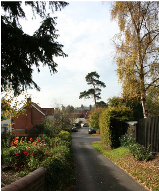
A long view within the heart of the Conservation Area. Looking south along Church Lane

At the southern end of Denny's Lane are short but worthwhile views looking south west over the bridge which are terminated by a varied group of picturesque dwellings.