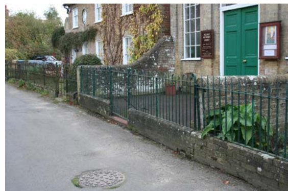
The important contribution made by iron railings and gates

Memorial benches add local interest and if thoughtfully placed provide an excellent place to rest and appreciate a view. The location of such items should influence the design and detailing of such benches, so that appropriateness to location, particularly when near nationally and locally designated heritage assets.