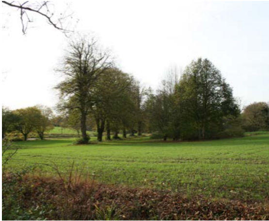
A line of trees and a separate cluster surrounding the former pit to the south of The Old Manor House

The quality of Winter Rose's work is now being recognised, his garden structures at Upton House Cambridge for example receiving statutory protection in 2014. The wider landscape surrounding the house may contain important specimen trees.