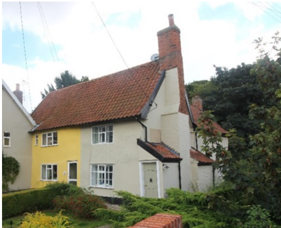
Brookside and Homeleigh, Bridge Street

A single storey range of outbuildings with a red pan tile roof, which are possibly of early nineteenth century date. Weatherboarded elevation to the Fromus, and cart entrances within the western elevation. Red brick gable end to north. A further lower red brick range is attached to the southern gable. The outbuildings are shown on the 1904 1:2,500 Ordnance Survey map.