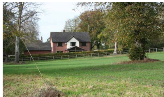
The impact of modern development, illustrating the need for appropriate scale, material use and detailing

In order to protect the character and appearance of the Conservation Area, wherever possible the District Council will seek to prevent such inappropriate developments from taking place. To this end the Council has published design guidance and other advisory material and, as opportunities arise, will assist with implementing specific projects aimed at positively enhancing the area.