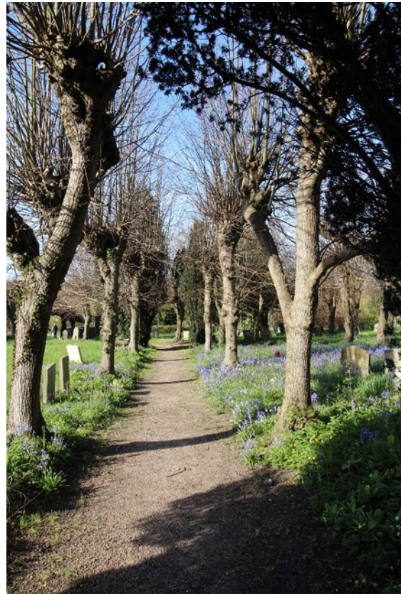
In the Churchyard

To the south west of the village, outside the Conservation Area, lay the estate and parkland of Carlton Hall, a distinguished classical mansion formerly belonging to the Fuller and Garrett families, which was largely demolished after a fire c1941. The core of its historically and aesthetically significant park, which is shown on Joseph Hodkinson's map of 1783, still however survives in a reasonably intact state. Carlton Hall Park is identified within East Suffolk (Suffolk Coastal) District's Policy SP6 as one needing special protection for its historic and aesthetic interest.