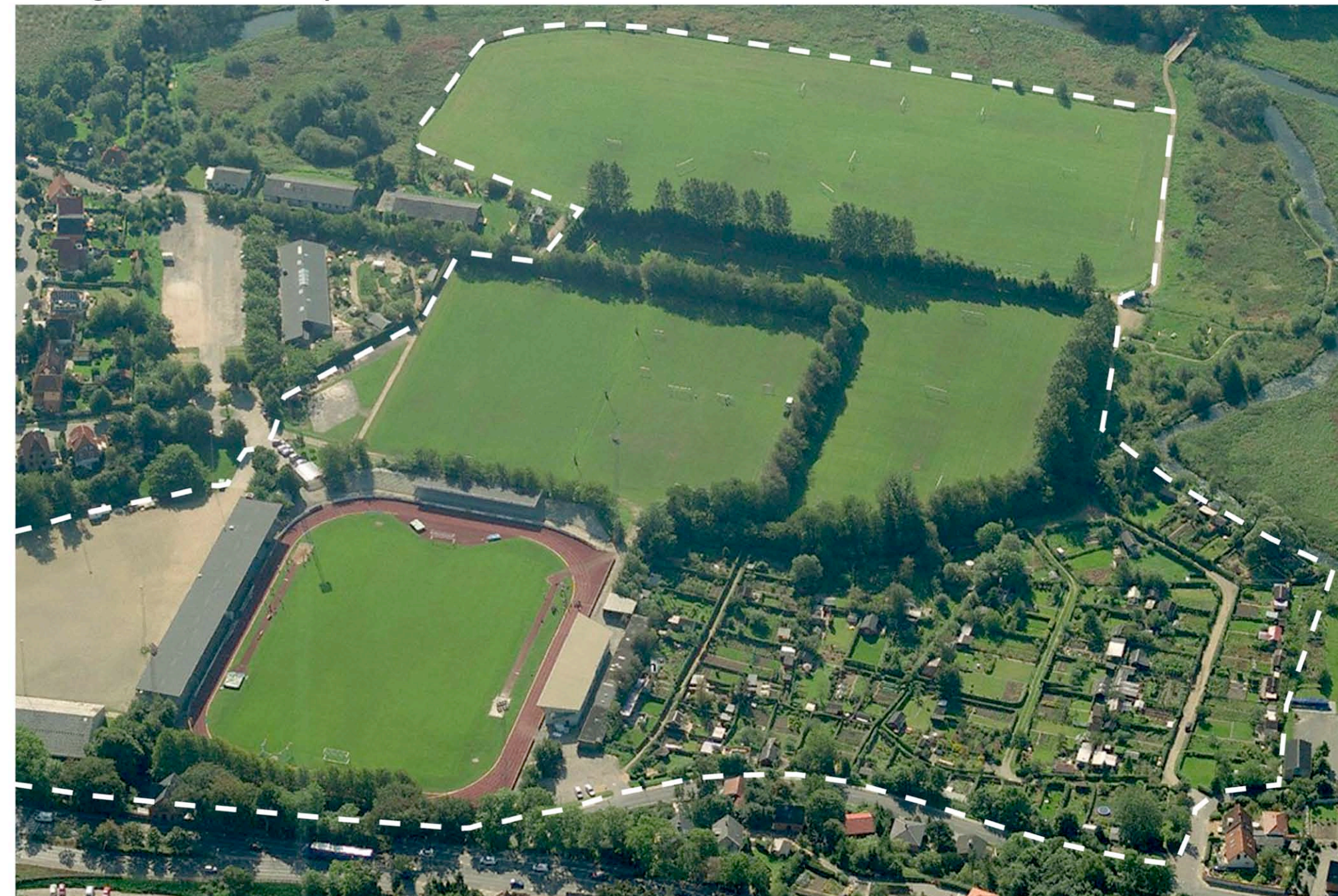
Kolding - Denmark - europan 10