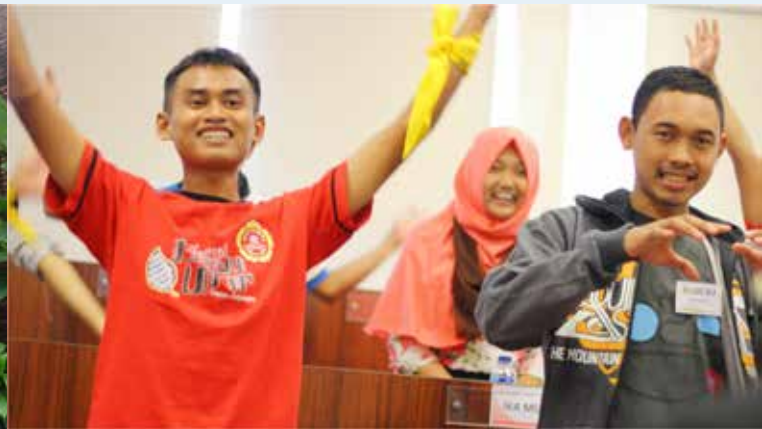
Local youth learning methods to be a future agent of change society and entrepreneur.