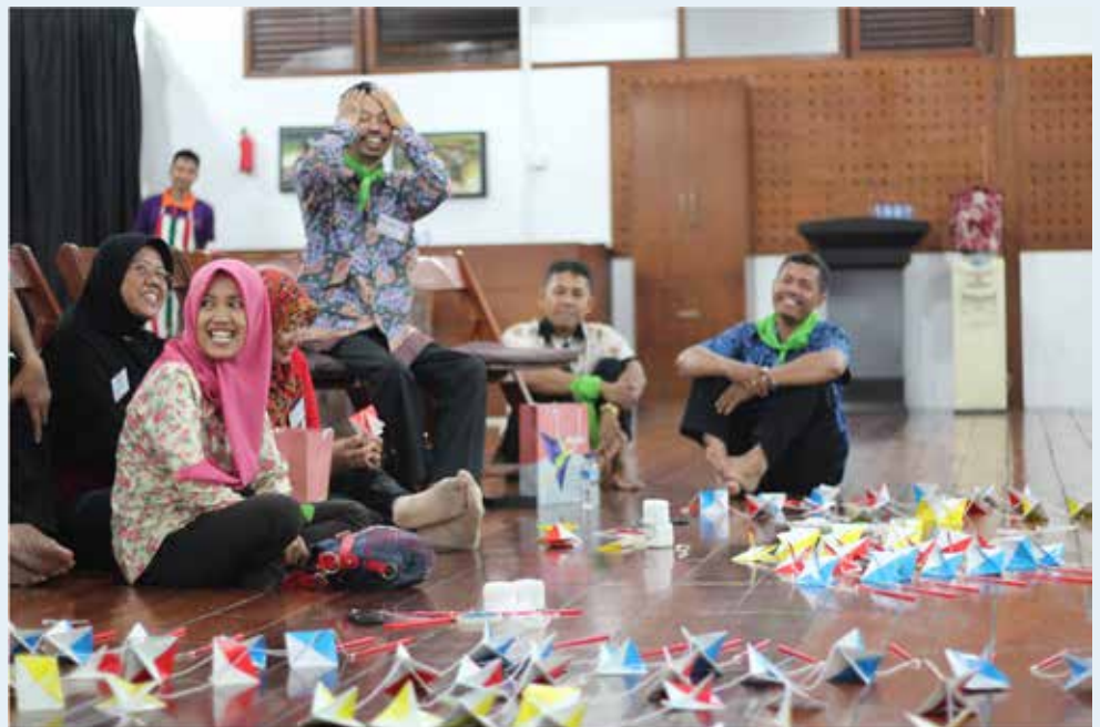
Teachers learning new educational methods.