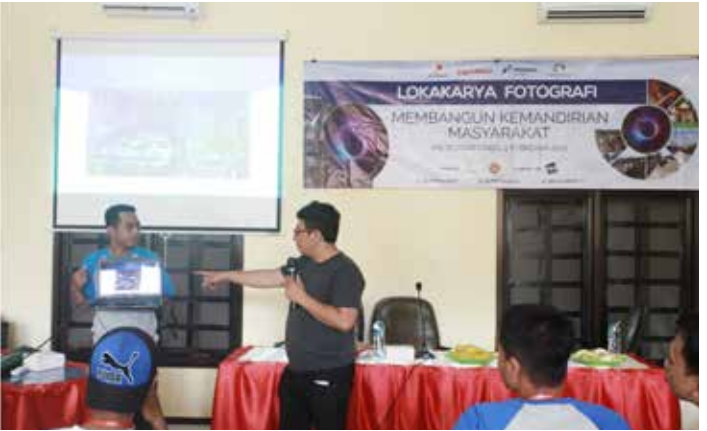
▲ February 4, 2017. EMCL together with Bojonegoro Community Information Network and Gayam Youth Organization conducted the 2017 Banyu Urip Workshop and Photography Competition. The series of events were started with a photography workshop held at Business Incubator Program building at Gayam sub district.