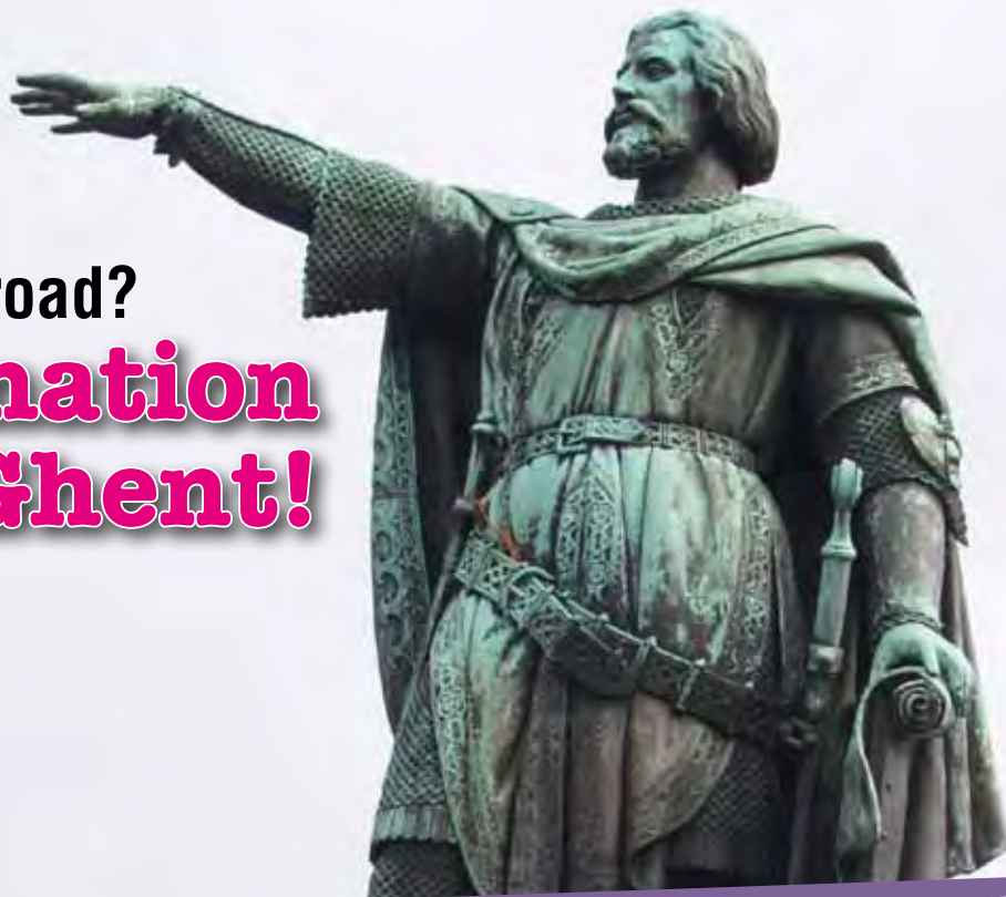
Jacob van Artevelde

A PRACTICAL GUIDE FOR INTERNATIONAL STUDENTS IN THE CITY OF GHENT