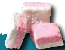
“Nonnebillen” (nun’s cheeks)

Nationals of any country other than those referred to above and holders of identity and travel documents other than those mentioned above are allowed to enter Belgium, provided they have a valid passport or equivalent travel document plus a visa valid for Belgium. Inhabitants of e.g. Turkey will need a visa to enter Belgium, even for a short period.