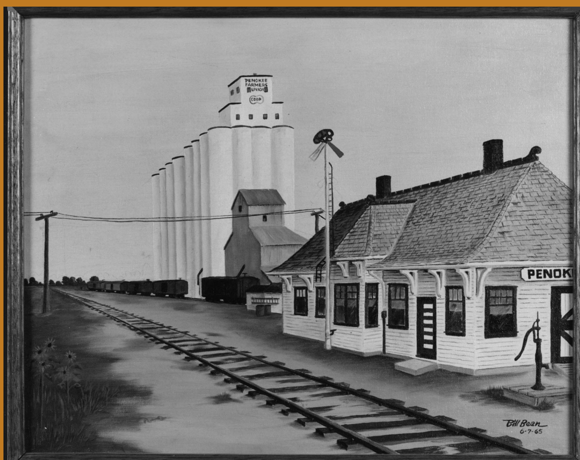
A 1965 painting by Bill Bean depicting the Penokee Railroad Depot.

The community is a melting pot of every nationality, every religion, and all are unique in their own special way. As a melting pot of people, Penokee has some wonderful cooks, that is the reason our potluck dinners are sooo good!!!!