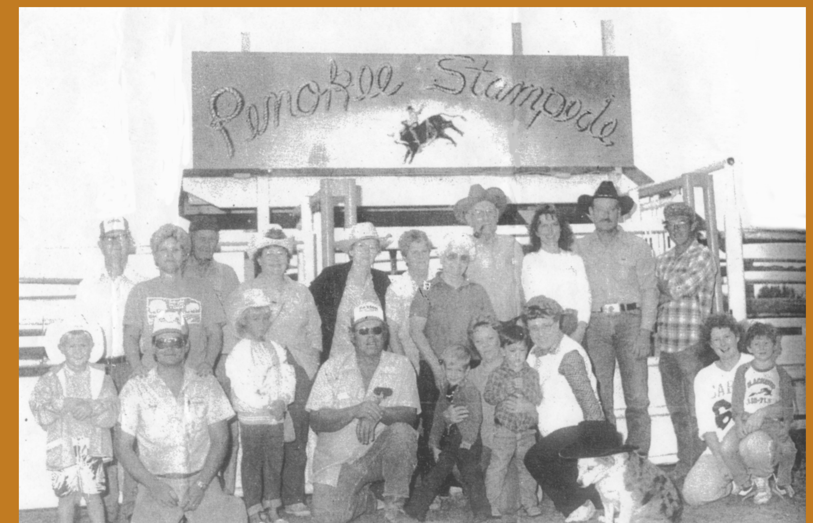
Many of the planners of Penokee's Centennial celebration that was held in September 1988.

The Penokee Methodist Church was the center of social events. It was home not only to Methodists, but all faiths of the community. It closed its doors in 1969. The schoolhouse has seen many children pass through and was a vital part of the community. The ball games, end-of-school-year potluck dinners, and comradeship came to a close in 1970. A red brick store building that was built in 1914 housed a grocery store with a soda fountain. It was closed to business in 1973. The Penokee Post Office in recent years has been not only a place to get mail, but a place to get caught up on the recent news, important notices, and to check up on your neighbor's well being.