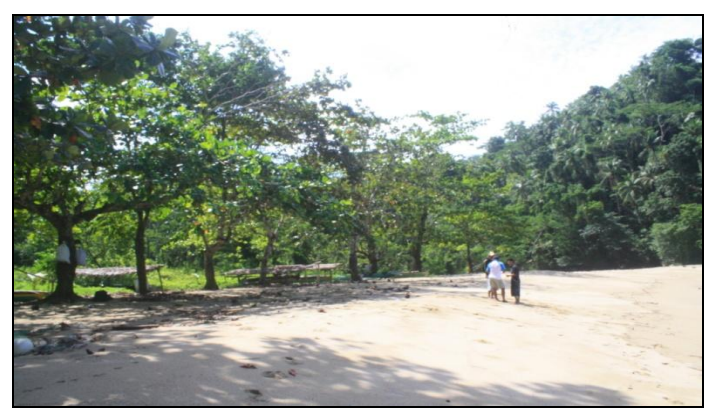
Figure 7. Ketapang Tree ( Terminalia catappa ) in Naku Beach Cape Area