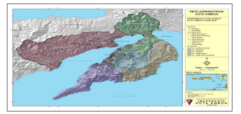
Figure 1. Administrative Map of Ambon City

Research method is survey method. Survey method is a critical observation to obtain good comments about certain issue in the certain area or location [16]. This method uses descriptive and evaluative approaches. Descriptive method is one research approach to explain the data that are obtained from measurement based on the criteria, while evaluative is one research approach to give an assessment on the studied object. Data sources are primary and secondary data. Primary data include waters depth, beach type, beach width, base material of waters, current speed, beach slope, waters clarity, beach land coverage, dangerous biota, and the distance of freshwater supply [14]. Secondary data involve literatures which are relevant to the research. The instruments used are GPS (Global Positioning System) to determine the geographic position and Abney Level to understand the angle of the slope. The gauge is used to count beach width. The buoyant and stopwatch are employed to calculate current speed, while digital camera is used to take a picture of the existing condition in the field. Correspondence tools are also used.