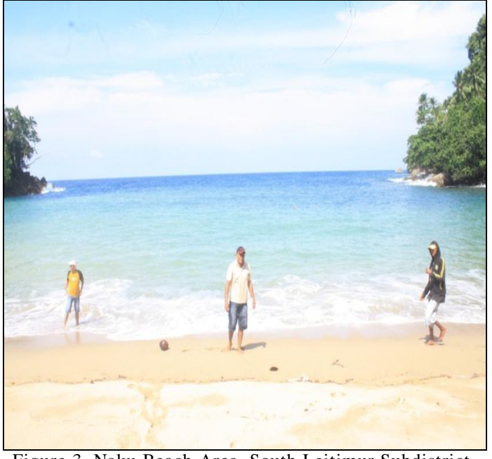
Figure 3. Naku Beach Area, South Leitimur Subdistrict, Ambon City