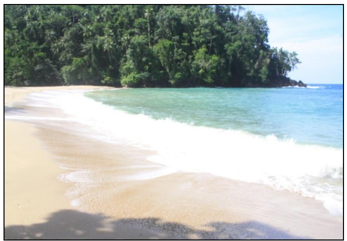
Figure 4. Sandy beach type at Naku Village Beach