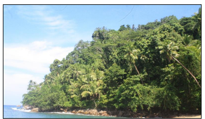
Figure 6. Coconut Tree ( Cocos nucifera ) in Naku Beach Cape Area