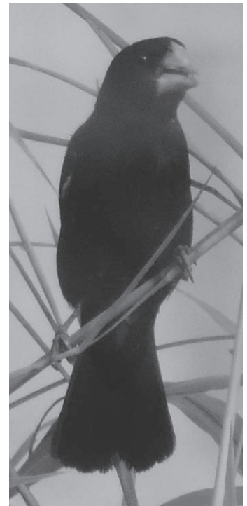
Figure 1. Male Large-billed Seed Finch Sporophila crassirostris , quebrada Santa Rosa, Caserío Los Naranjos, Municipio El Hatillo, south-east of Caracas, northern Venezuela, 1 August 2016 (Carlos Vereá)

Large-billed Seed Finch Sporophila crassirostris occurs in northern South America, from north-east Peru through Ecuador to northern Colombia, Venezuela, northern Brazil and the Guianas 14,15 . Never abundant, it is locally fairly common in Colombia 7 , scarce in Ecuador, Guyana and Surinam, but increasingly rare in the latter two countries 13 ; rare in Peru 17 , and very rare in French Guiana 13 . It mainly inhabits lowland grassland with scattered trees and bushes near water, marshes and wet areas with tall sedges and grasses, as well as farmland, and savannas with tangled vegetation 15 at 0–700 m, although a Colombian record (1,000 m) 7 suggests it could reach 1,100 m 15 .