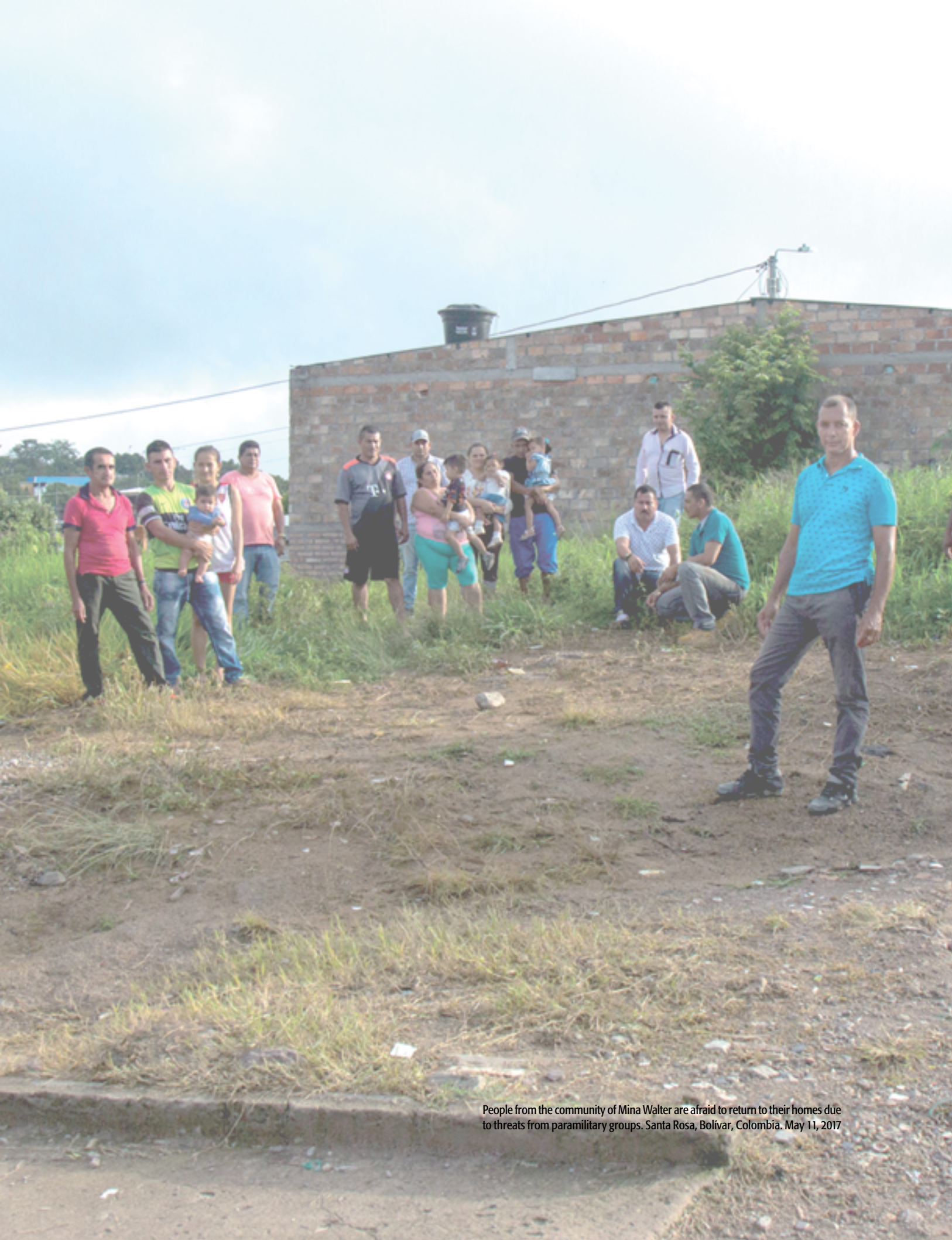
People from the community of Mina Walter are afraid to return to their homes due to threats from paramilitary groups. Santa Rosa, Bolivar, Colombia. May 11, 2017