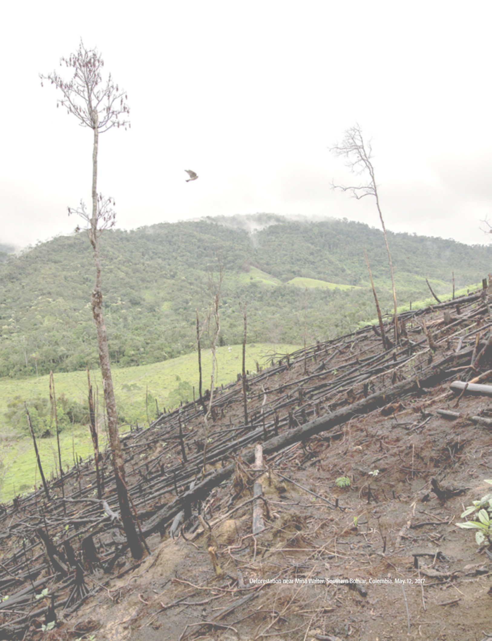
Deforestation near Mina Walter. Southern Bolívar, Colombia. May 12, 2017