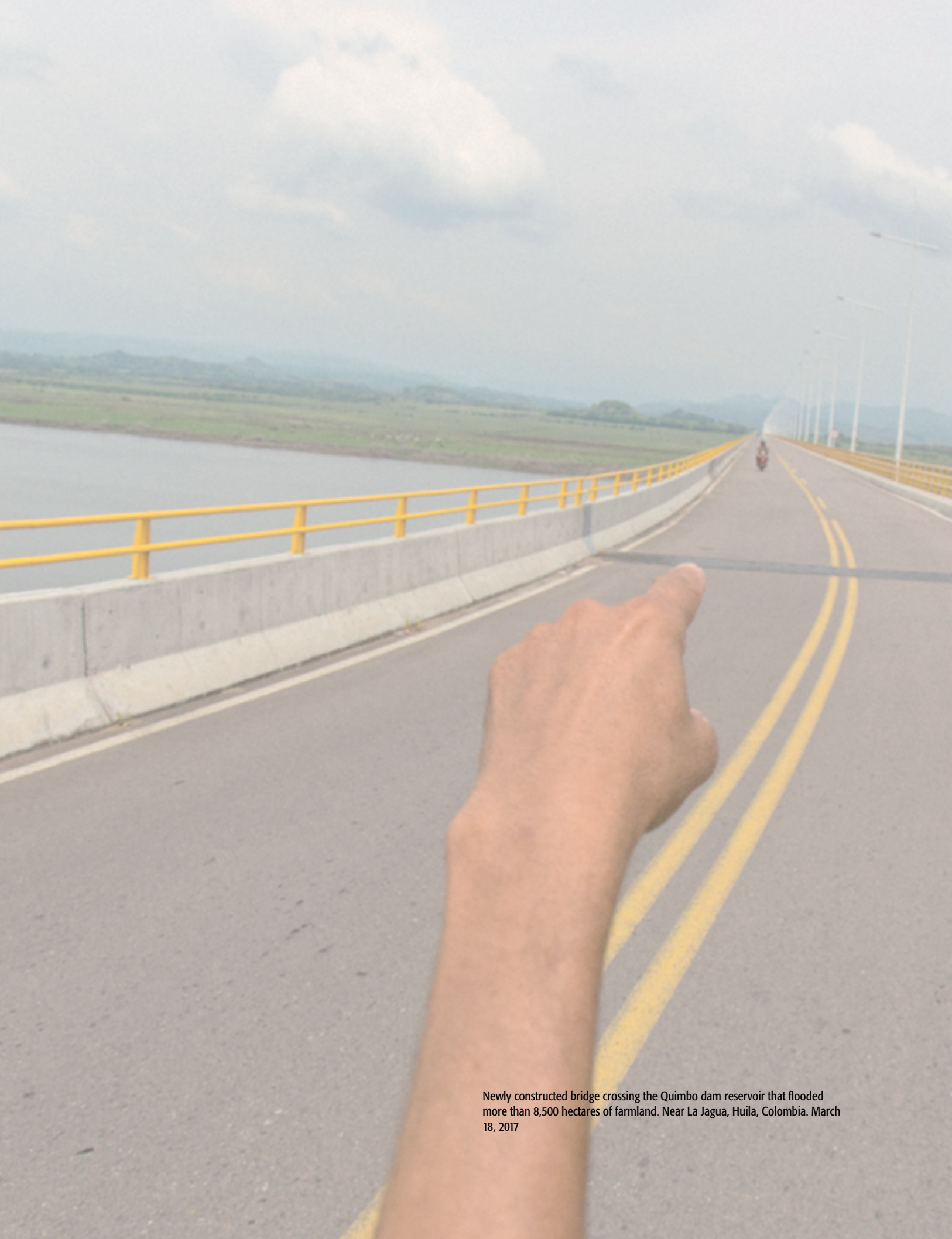
Newly constructed bridge crossing the Quimbo dam reservoir that flooded more than 8,500 hectares of farmland. Near La Jagua, Huila, Colombia. March 18, 2017