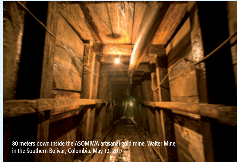
80 meters down inside the ASOMIWA artisanal gold mine. Walter Mine, in the Southern Bolívar, Colombia. May 12, 2017

The department of Santander is located in this region and has a population of two million inhabitants. One million are concentrated in its metropolitan area and capital city, Bucaramanga. The department borders on the east with the department of Norte de Santander that has 1.3 million inhabitants, the majority of whom live in rural areas. Here the Páramo de Santurbán (Santander and Norte de Santander) stands out for its endemic ecosystem, the source of water for more than 2,200,000 inhabitants, and for its areas of great environmental value in the region of Catatumbo (Norte de Santander), where proposals for large-scale projects to extract coal, gold, oil and to harness hydroelectric power have contributed to the intensification of socio-political conflicts in the region.