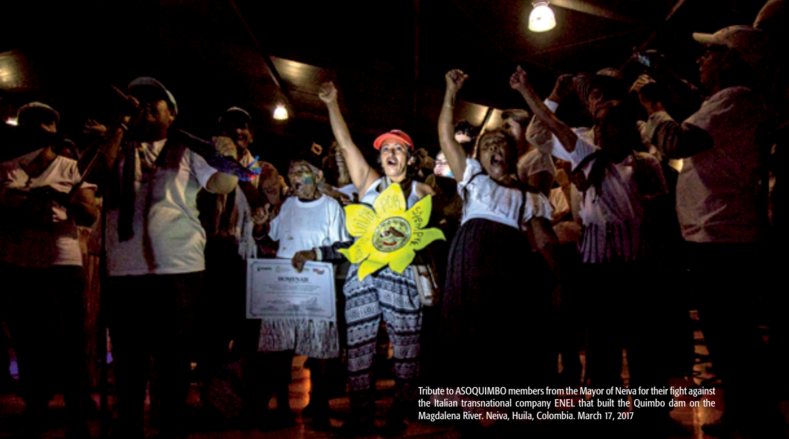
Tribute to ASOQUIMBO members from the Mayor of Neiva for their fight against the Italian transnational company ENEL that built the Quimbo dam on the Magdalena River. Neiva, Huila, Colombia. March 17, 2017