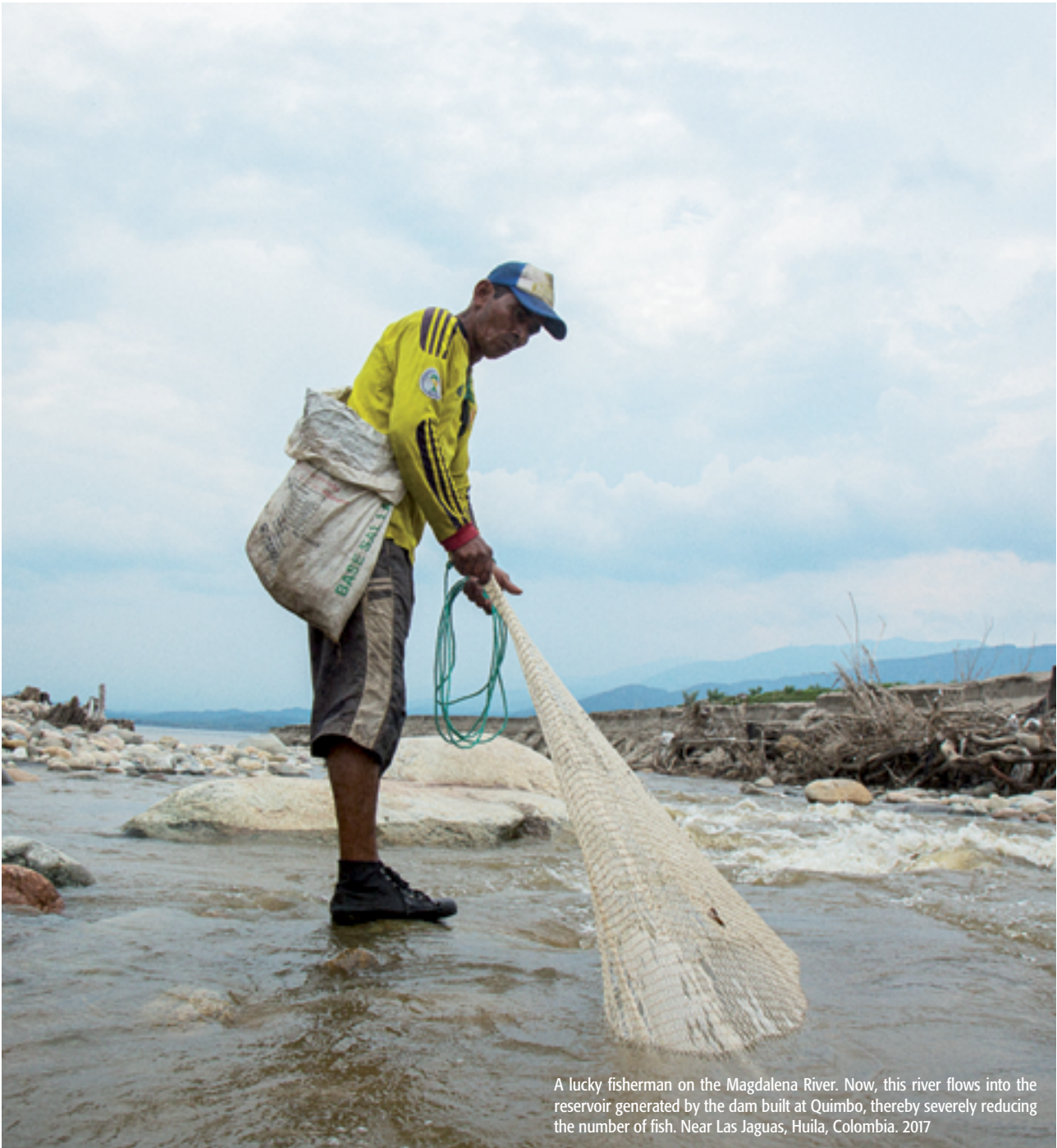
A lucky fisherman on the Magdalena River. Now, this river flows into the reservoir generated by the dam built at Quimbo, thereby severely reducing the number of fish. Near Las Jaguas, Huila, Colombia. 2017