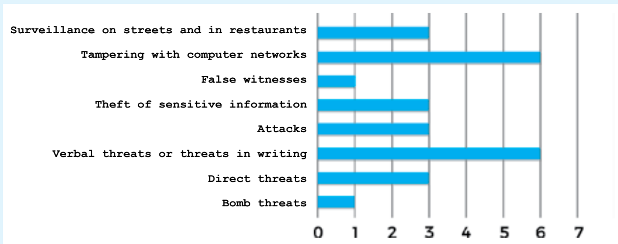
Aggressions against the CCALCP recorded from 2010-2014