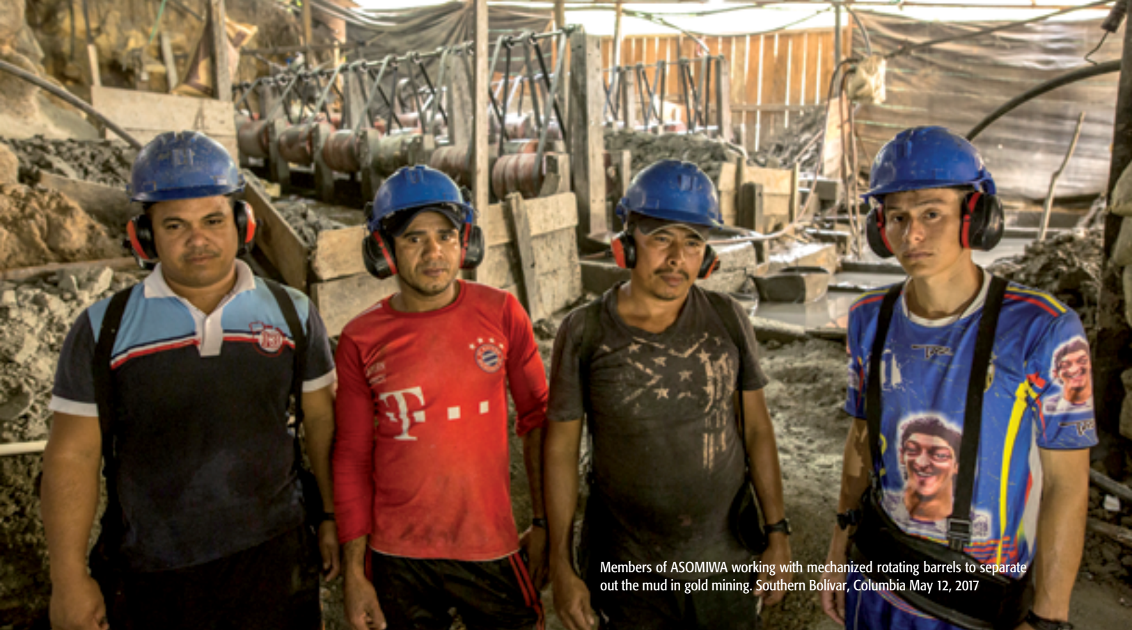
Members of ASOMIWA working with mechanized rotating barrels to separate out the mud in gold mining. Southern Bolívar, Colombia May 12, 2017