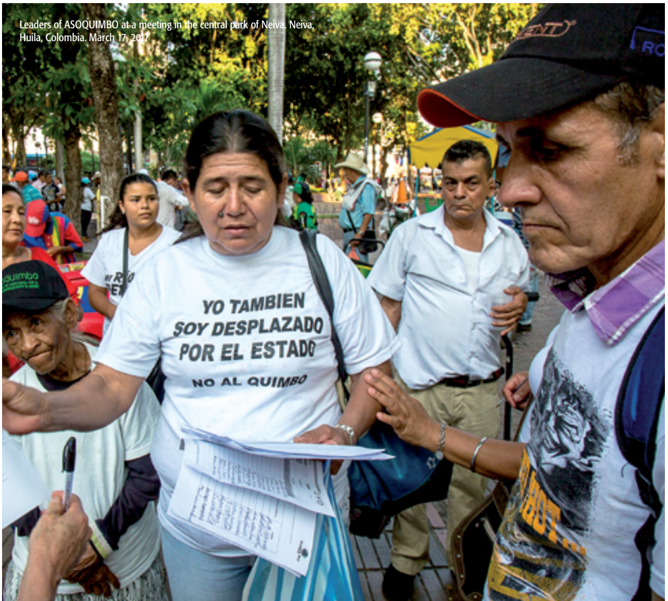
Leaders of ASOQUIMBO at a meeting in the central park of Neiva. Neiva, Huila, Colombia. March 17, 2017