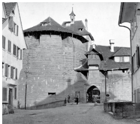
Rennweg Fortress in 1860, shortly before its demolition.

Systematically developed district dating from the 13th century. The medieval Rennweg gate was replaced in 1521–1525 by the mighty Rennweg bastion. This city gate formed the western corner of the city until the construction of the baroque moats. It was demolished in the 1860s during the building of Bahnhofstrasse.