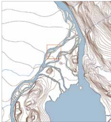
The River Sihl and its delta 3000 years ago. Red: Site of the barracks' stables. Map: Zurich Archaeological Dept.

The now canalised and tamed Sihl was a permanent threat to the urban area of Zurich for centuries. Sihlfeld and the Inner City were a huge river delta in prehistoric times (see picture). The taming of the Sihl river has had a dominant influence on the Zurich area from Celtic and Roman times up to the modern age. The barracks were erected in 1873–1875 on the borders of the city and the village of Aussersihl.