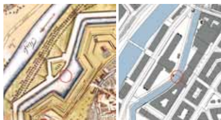
Left: Entrenchments on the Müller map of 1788/93. Red: Site of the bridge today. Right: The same area today. Illustrations: Zurich Archaeological Dept.

Part of the city's baroque stronghold built in the 17th century and demolished after 1830. The moat and its bastions were originally much more structured. View the map to the side.