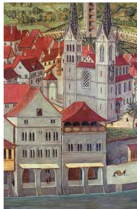
Grossmünster auf dem Altarbild von Leu, um 1500.