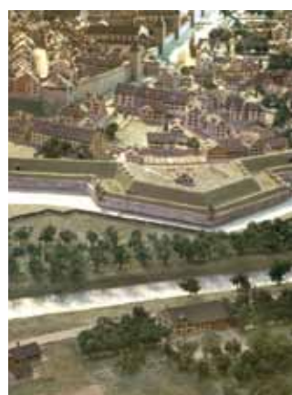
Part of the city model in Haus zum Rech.

Opening times: Weekdays 8 a.m.–5 p.m., Sat 10 a.m.–4 p.m.